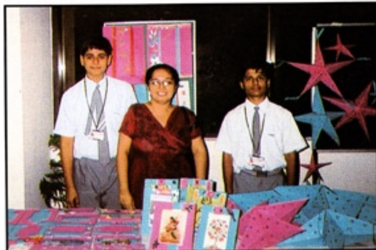
Making best use of recycled paper

Students and teachers attended a workshop on 'Value Added Products with Recycled Paper' on 18 and 19 July 2006 which was conducted by designers from TARA (Technology and action for Rural Advancement). The main objective was to make more value added products for basic needs from recycled paper so as to conserve our scarce resources i.e. trees. The products that were made included photo frames, paper bags, book marks, cards, stars etc. The workshop ended with the setting up of an exhibition of the products made by the participants which was then visited by the Hon'ble Chief Minister of Delhi, Ms. Sheila Dixit.