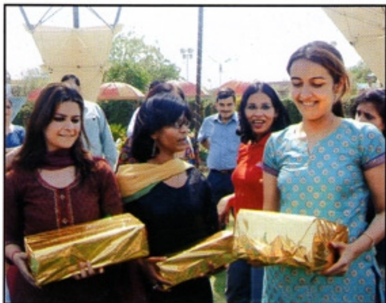
Annual Staff Picnic - Work and play go hand in hand