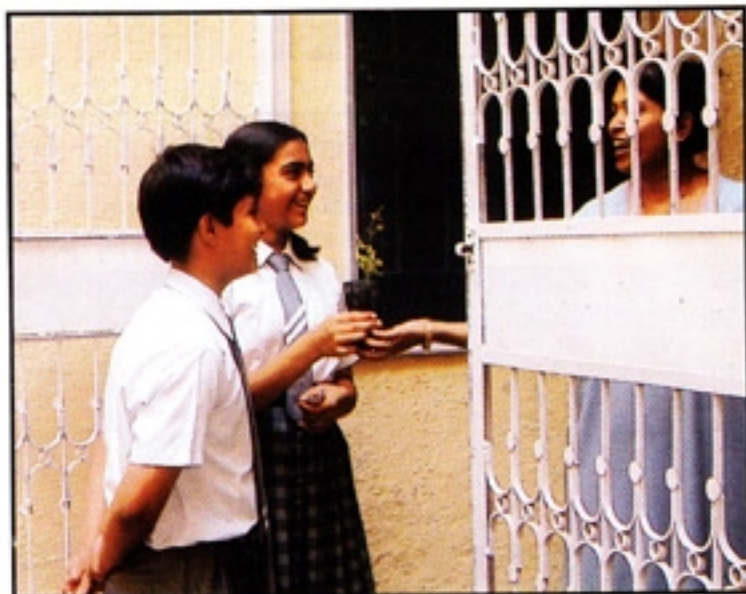
A sapling as a gift