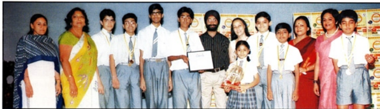
Proud winners of Procom Quiz 2005-2006