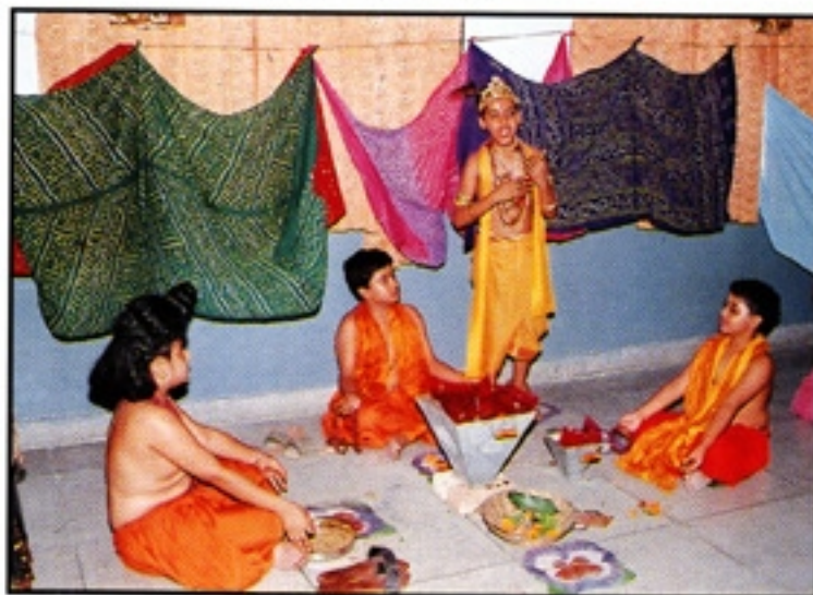
Havan prepared for peace