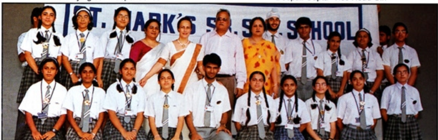
The Vice Heads