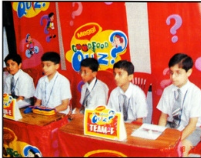
Our quizzers at their best