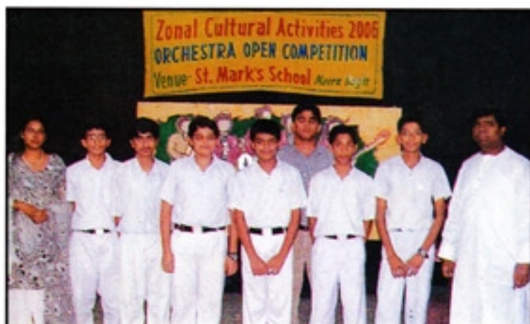
Jubilant Jr. boys