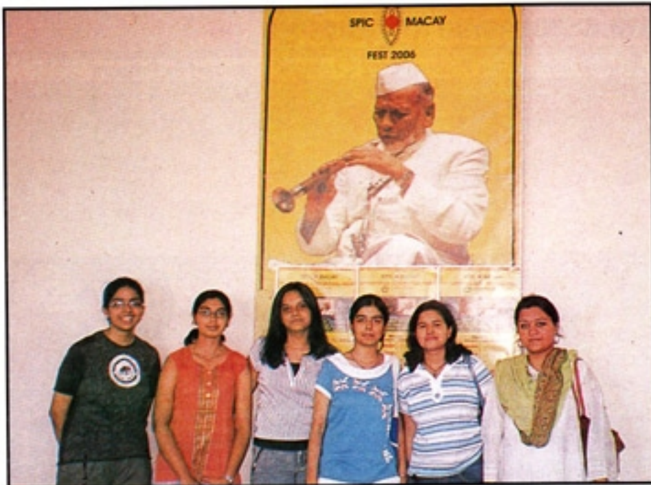
Bonding with Indian culture at SPIC MACAY Convention