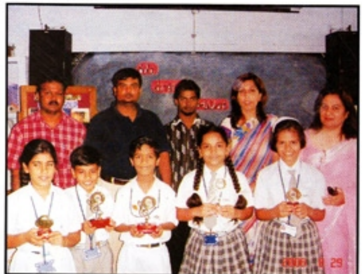
Nightingales of our school