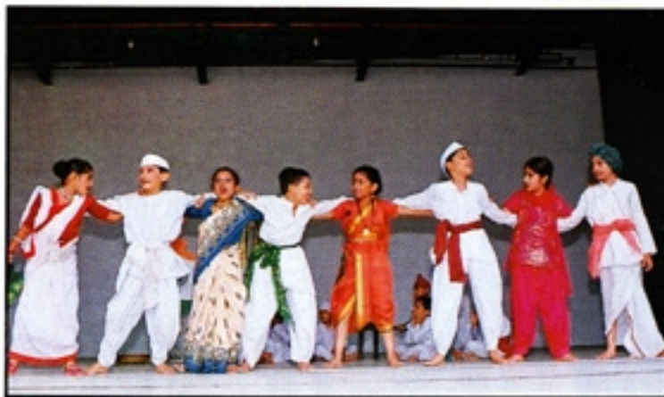
We are proud to be Indians