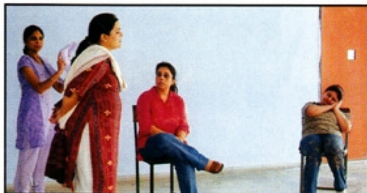
Teachers learn to bring theatre to the classroom