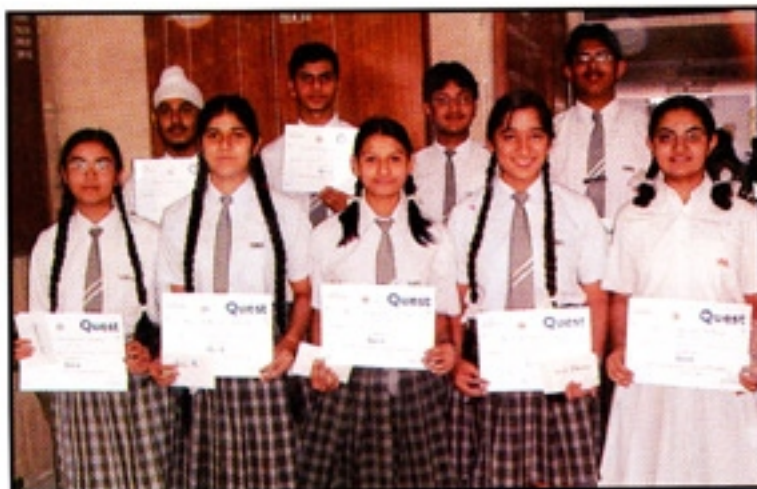
Our inspiring writers