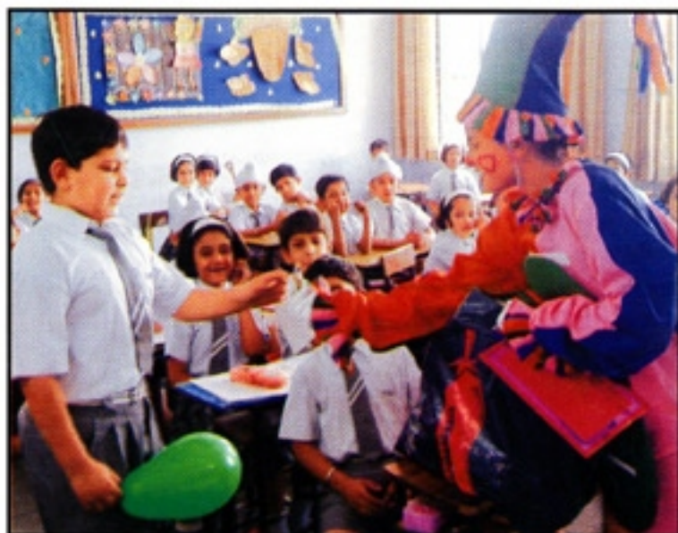
Fun with Maths