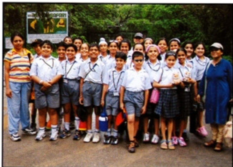
Education with fun

The students classes IV and V, along with their teachers went on an educational excursion to Chandigarh. They stayed in a beautiful hotel 'The Fort.' - a heritage property. The students enjoyed the sightseeing to the Rock Garden, the Sukhna Lake, and the Art Museum. The main attraction was the visit to the Chhatbir Zoo and the lion safari. For classes III a trip to Agra was organised and for class VI it was to the beautiful hill station of Rajasthan, Mt. Abu. These were wonderful learning experiences for the children.