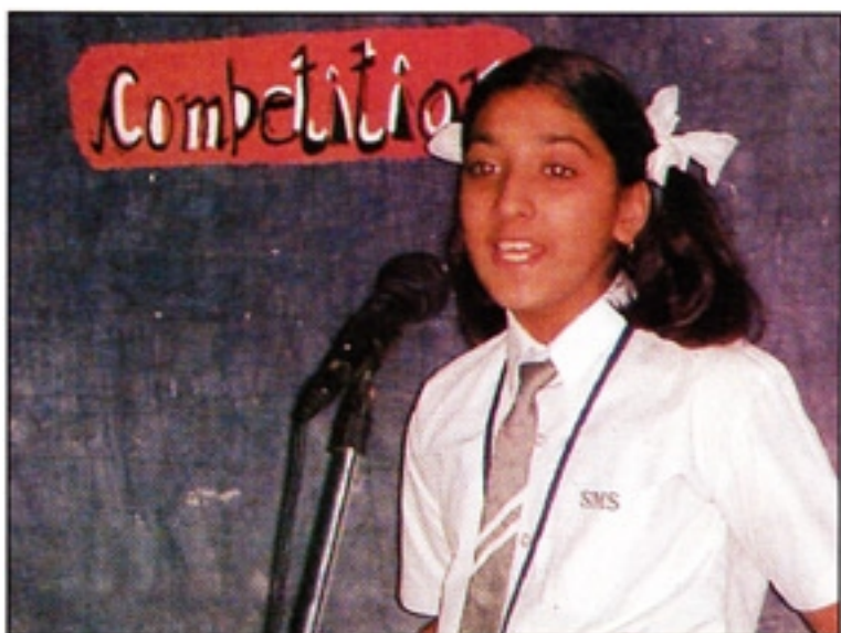
A song on her lips- A participant of the Solo Singing Competition