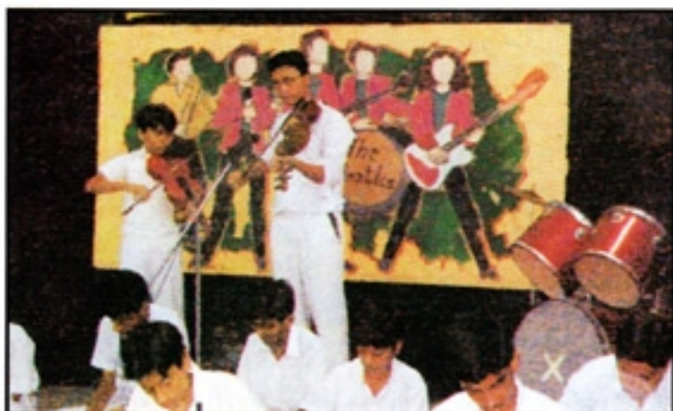
A participating team