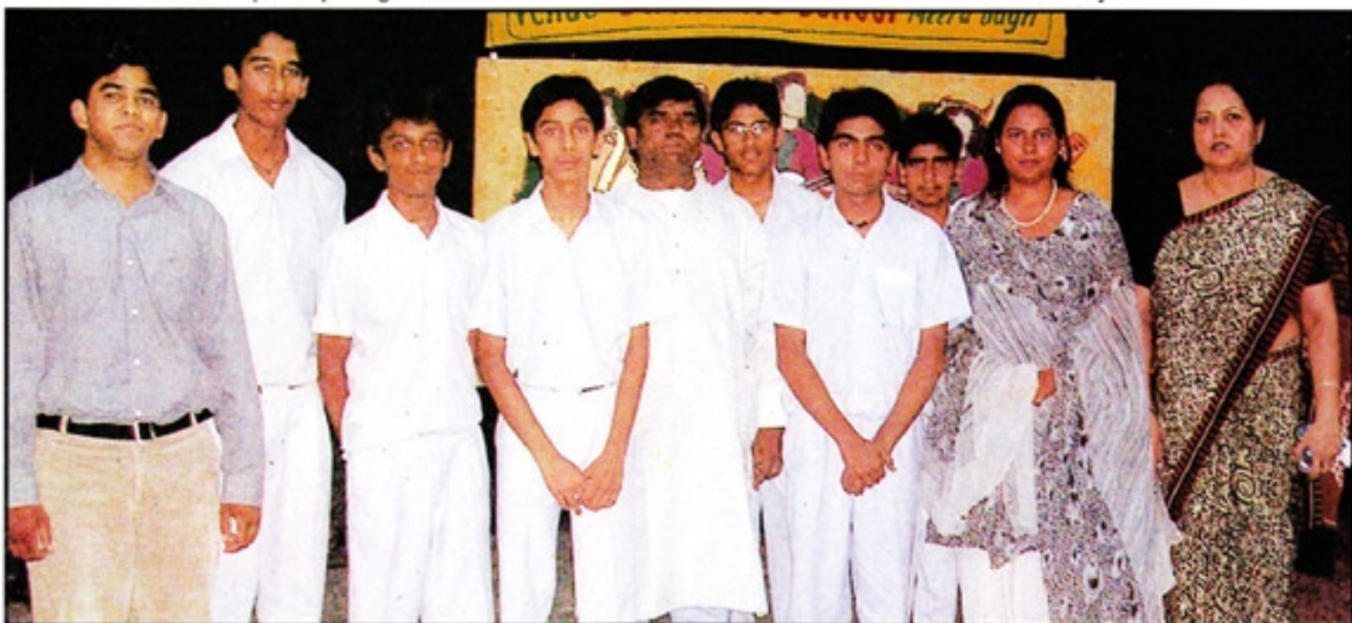
Proud winners (Senior Boys) of Zonal Orchestra Open Competition