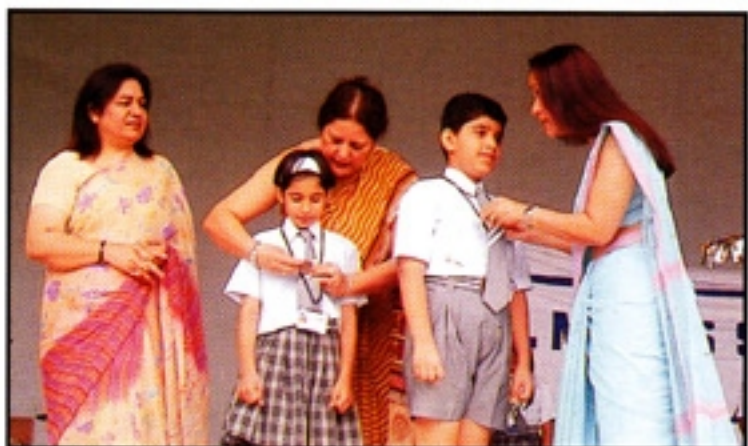
Junior House Captains