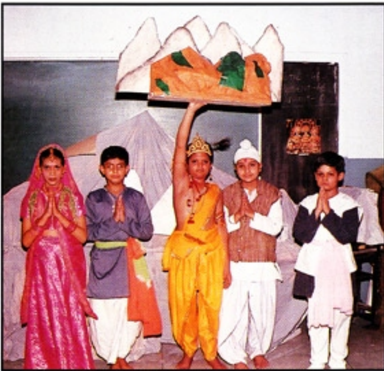
Lifting the Goverdhan