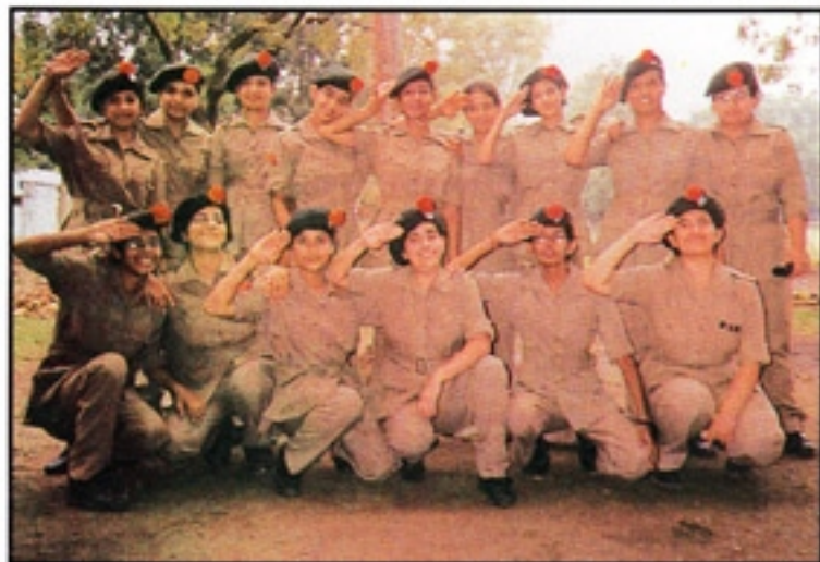
At the N.C.C. Camp in Dehradun

During the summer vacations, 2 Delhi Girls Bn. organized a CATC camp from May 20 to 30 May 2006 in Dehradun which was attended by 600 cadets from different schools and colleges. 15 cadets of our school participated, who showed their zeal and enthusiasm in the activities of the camp. Besides winning the first prize in the cultural activities (group dance) the students also took active part in many activities.