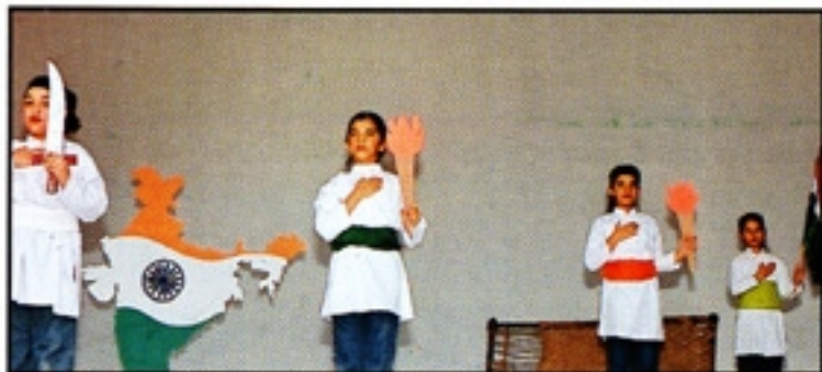
Glorifying our Independence