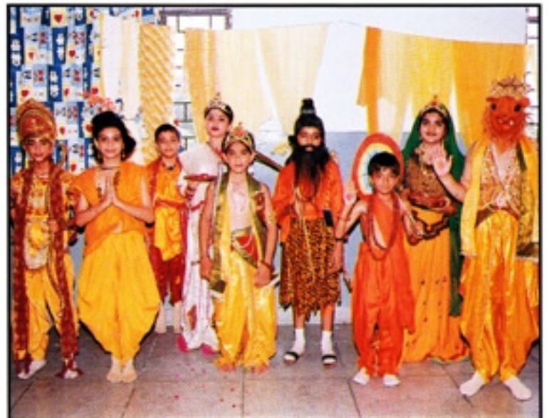
Avtars of Vishnu