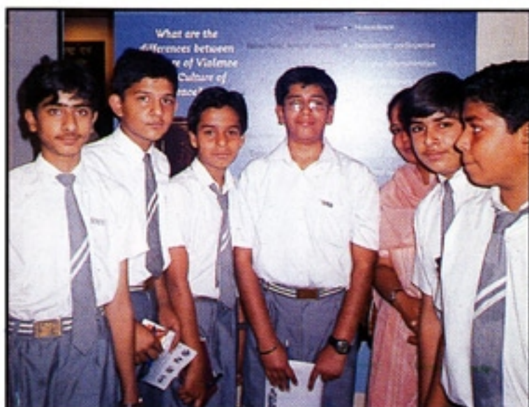
Learning about global peace