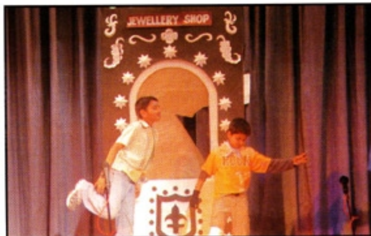
Short play enactment