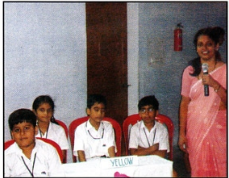
Learning to be quizzers