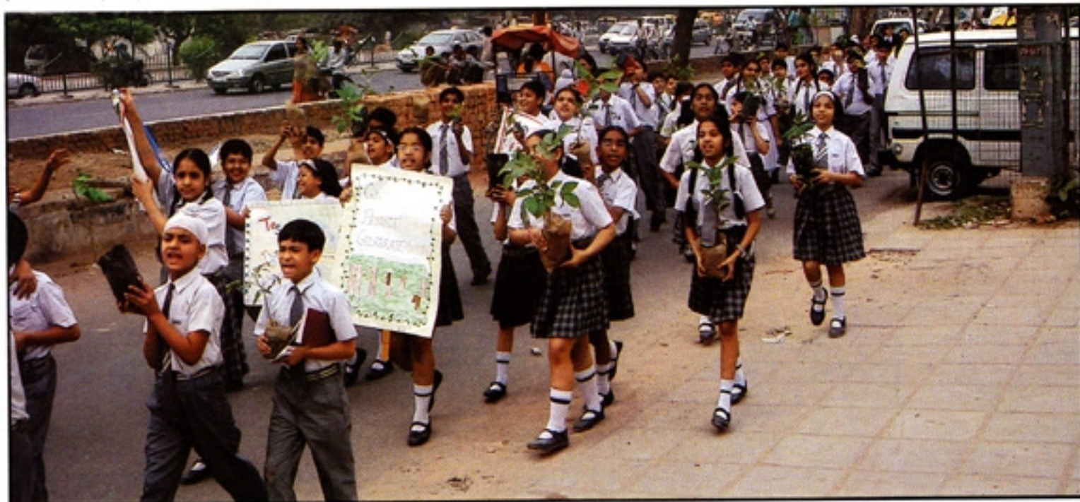
The rally on Earth Day

On the occasion of Earth Day, the students pledged to make the world a better place by planting trees and so a brigade comprising of more than 400 students went round the neighbouring residential colonies, on a door to door basis. The rally started from the school with the enthusiastic bandwagon singing parodies, holding placards high up in the air and then going around knocking at the doors of apartments, distributing pamphlets giving useful tips on how to conserve water and make compost. They also handed over a sapling to each resident, telling them how important it was to 'save the environment'. Truly a novel way of celebrating 'Earth Day'! Later, in the month of August our students planted saplings in a nearby park. The message is clear 'Save our Environment and make our city clean and green.'