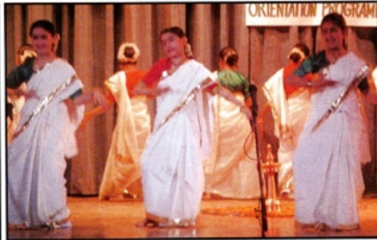
Cultural programme in progress

It was a wonderful experience for the parents of students of class I (2006-07) when they attended the Orientation Programme held for them on 18 March wherein they had glimpses of the activities held during the year 2005-06 presented to them in the form of dances and short plays by the students of class I. The parents were highly impressed and went back satisfied and assured of their children's bright future in St. Mark's. Another Orientation Programme was held for the parents of class VI (2006-07) on 20 March to make them aware of the rules and regulations and the changes in the examination pattern in the middle and senior school. They were also introduced to the teachers teaching class VI. The students of classes V and VI presented a wonderful cultural programme comprising of songs, dances and short plays. The Principal addressed the parents on various important issues.