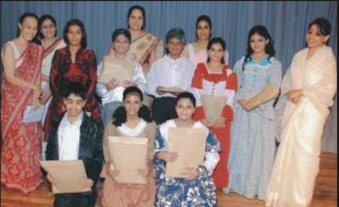
Winners of Inter Class English Play competition (Class VI)