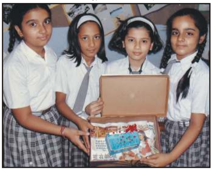
Students of class IV B make a Pencil stand out of waste