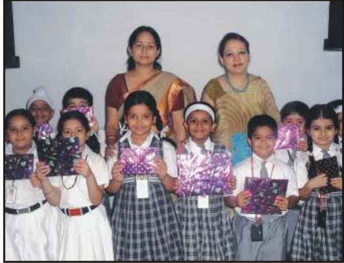
Winners of Inter Class English Recitation Competition (Class I and II)