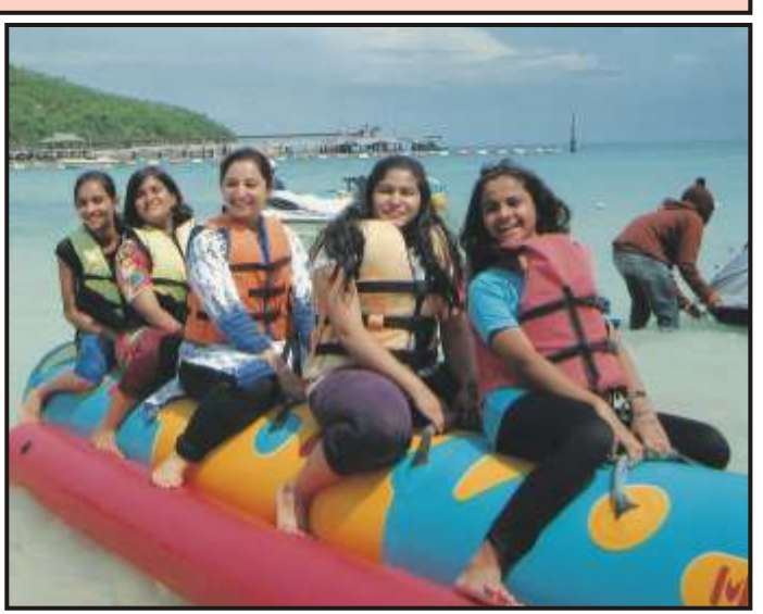
Our students enjoying at Coral Island, Pattaya.

Three teachers and thirty three students of our school went on an excursion trip to Thailand-The Land of White Elephants from May 17 to May 21, 2010. The 36 member group had a memorable experience in Pattava. The tour was a well balanced amalgam of work and recreation. The visiting spots chosen were Nong Nooch Village which displayed Thai culture and tradition, Elephant show, and Flora and Fauna of the region, The Million Year Stone Park with a breath taking Crocodile Farm, Floating Market, Dream World- A Theme park for children, the highlight of which was the Snow Town, Coral Island (with Parasailing, Banana boat ride, Speed boat ride and Sea bike rafting). They also visited the World's largest Gem Factory (with a ride in a mono rail, viewing formation, mining, refining, cutting, setting and display of gems). A photo book, authored by the students, capturing all salient features of the trip took shape simultaneously. The visit to The Land of Smiles will surely be recalled with a smile by all the members of the group.