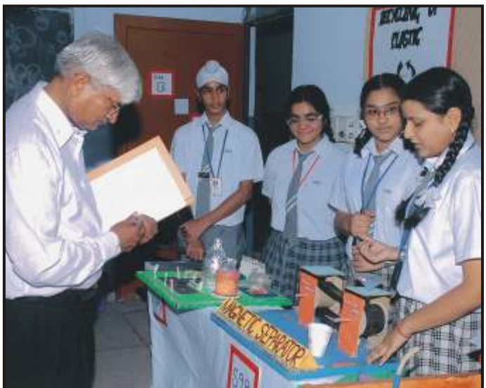
The function of 'Magnetic Separator' being explained