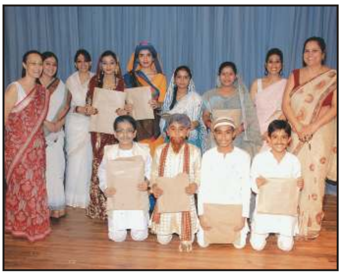
Winners of the Inter Class Hindi Play Competition (class VII)