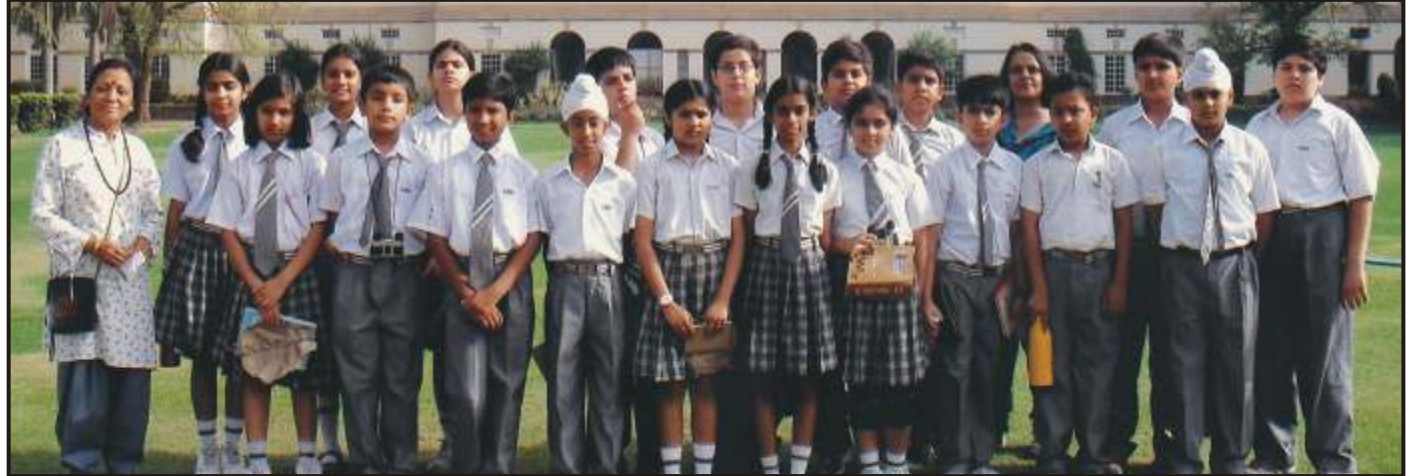
Students visit Teen Murti Bhavan

The members of Snow Leopard Eco Club went for a Nature Walk in the pristine surroundings of Teen Murti Bhavan. It was organized by Nehru Memorial Museum Library. Students were enthralled by the sheer variety of birds like Peacock, Barbet, Hornbill, Owl, Koel etc. in the lush green surroundings of the Bhawan. They were also made aware of the common names of trees like Amaltas, Silk Cotton tree, Gulmohar etc.