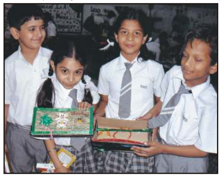
Best out of Waste