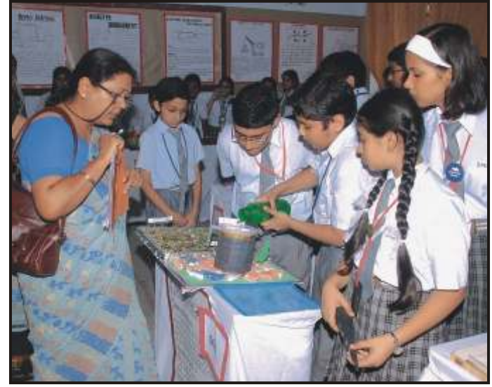
Drip irrigation draws the interest of our judge.