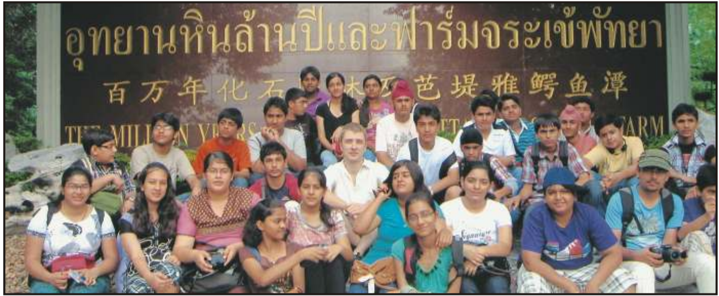
Our students visit Thailand