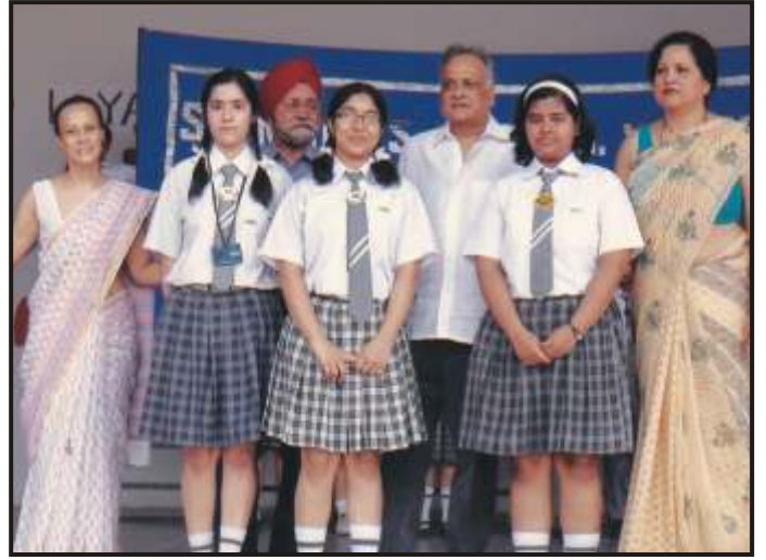
Our House Captains (Class XII)