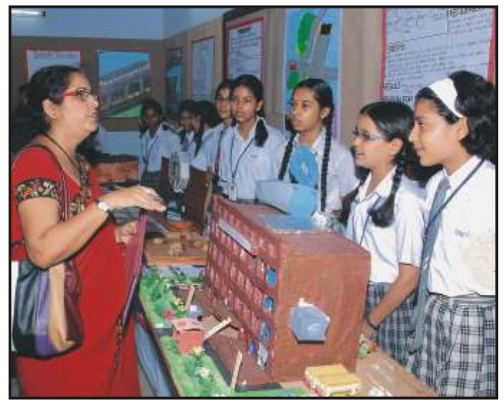
Future SMS in green and eco-friendly

Students explaining the concept of circumference with threads.