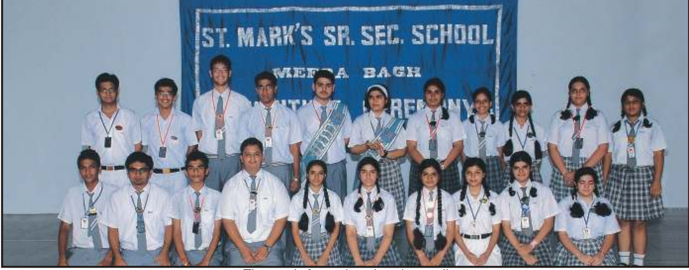
The newly formed students' council