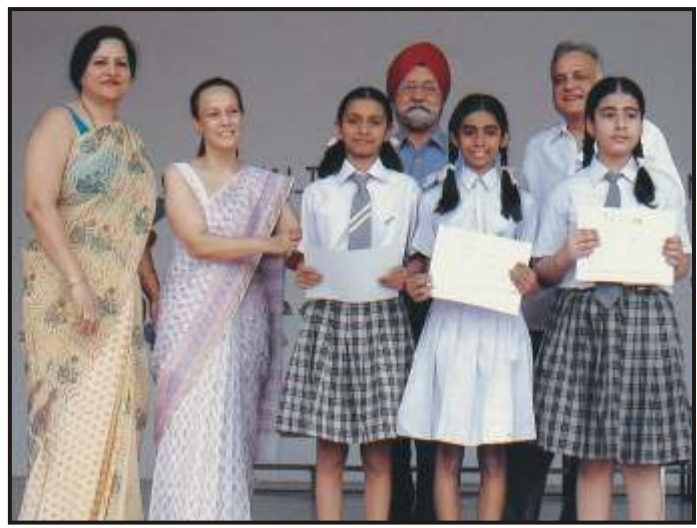
Winners of Aman ki Asha (a campaign organized by The Times of India)