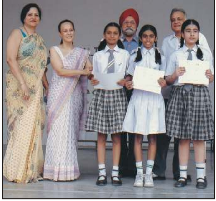
Winners of Aman ki Asha (a campaign organized by The Times of India)