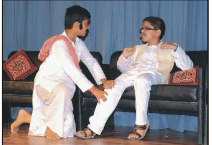
'Adhikar ka Rakshak' by Class VII