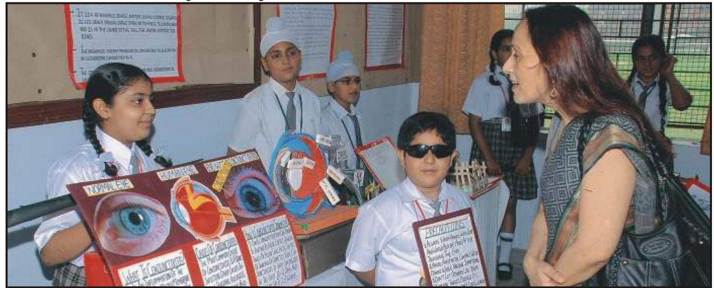
Students showcasing their projects on Conjunctivitis.