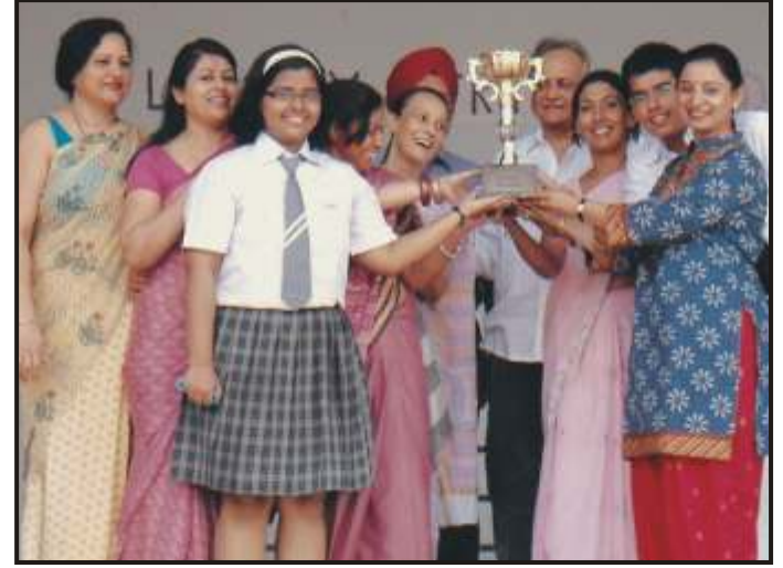
Gandhi House wins the Best House Trophy