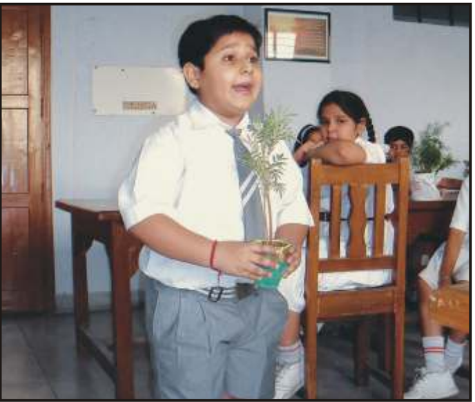
Speaking for a Green Cause