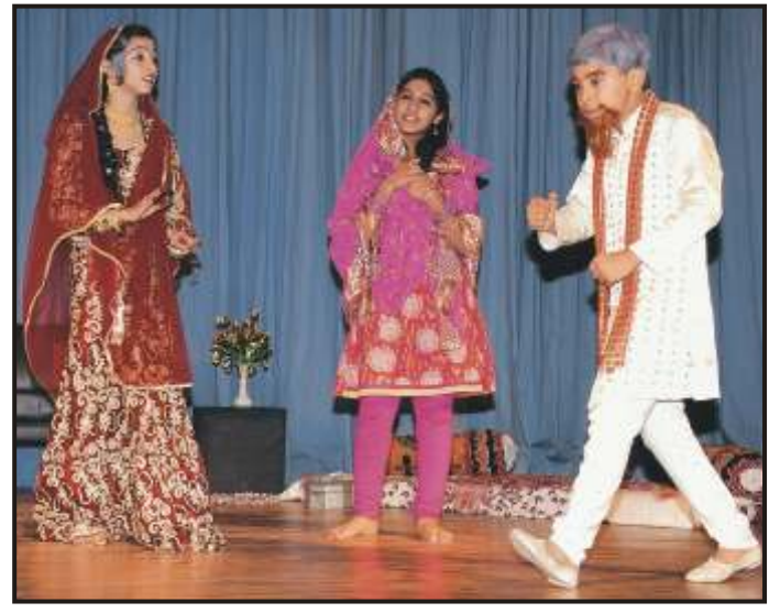
A Hindi Play in Progress-'Nawab Sahab ka Nikaah' (Class VII)