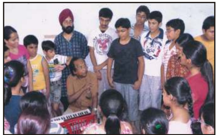
Theatre Workshop in progress