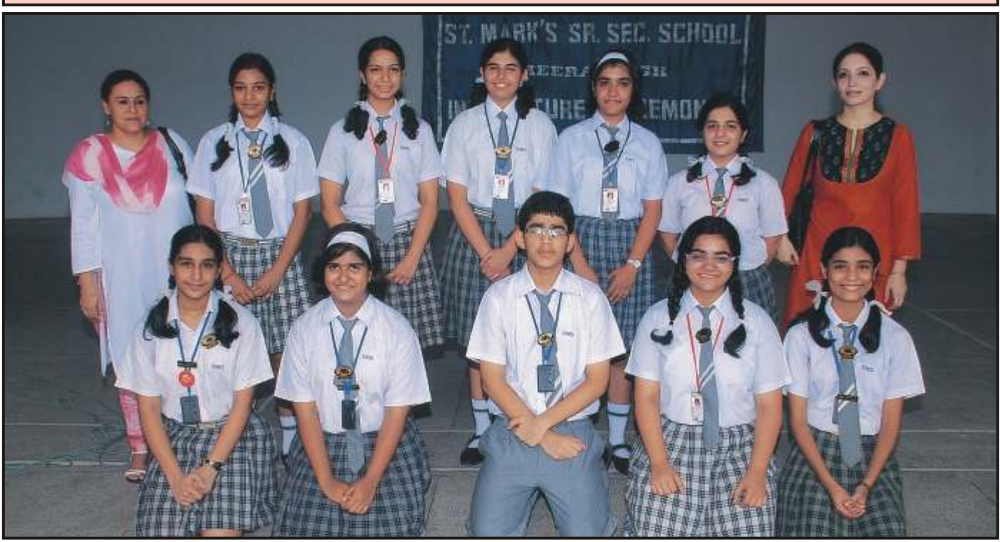
The Editorial Board