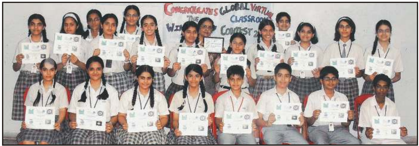
Winners of the Global Virtual Classroom Contest

Two teams of our school won GRAND FIRST PRIZES in Primary as well as Secondary level and a Special Certificate of Merit for Exceptional Helping Focus at Secondary level in GVC (Global Virtual Classroom Contest). This is a free online collaborative learning project that fosters creativity, cross cultural understanding and teaches IT and website design skills to students working together from around the world. It was a proud moment for the participating students when the prize money of $ 1000 and a Plaque for the school was announced by the Give Something Back International Foundation (GSBI), USA. It was a well deserved victory after a six month long process of Technical Creativity, Web Designing and Team Work by all 60 members of both teams, along with their team mates at Primary Level from Percy Julian Middle School, Illinois, USA, Washington West School, New York, John Muir School, San Diego, USA and Wako Kokusai High School, Japan.