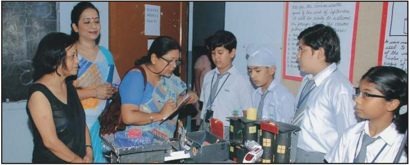
Young Scientists give innovative Ideas for a 'Clean and Green Delhi.'