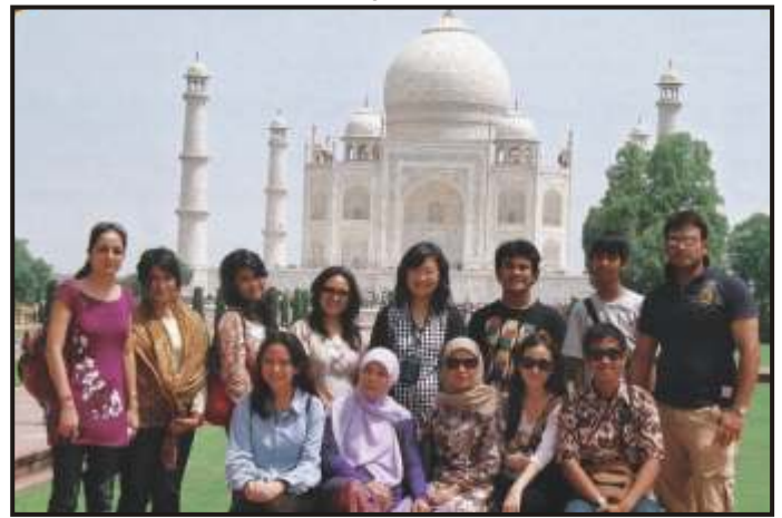
At the Taj Mahal