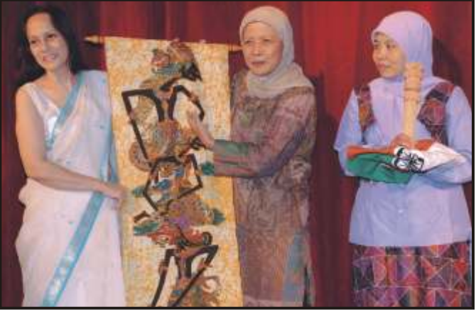
The Exchange of Souveneirs.