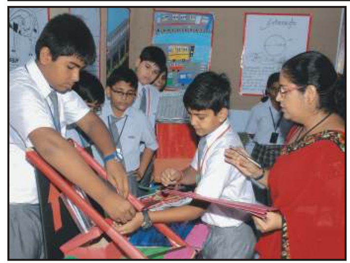
Students of class VII enthusiastically demonstrate 'Convection Currents.'