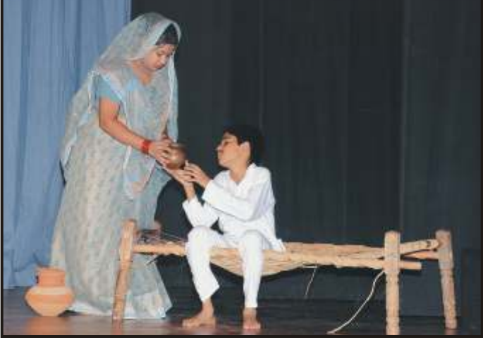
Hindi play 'Thakur ka Kuan' by Class VII