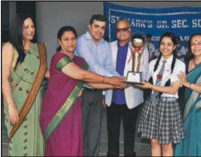
Patel House adjudged Best House in Discipline & Sports.