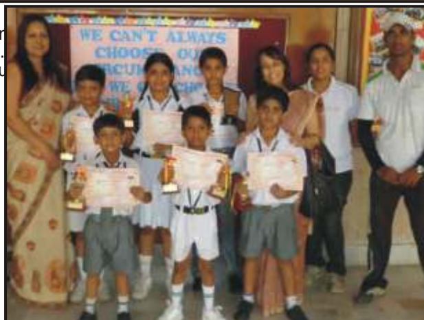
Upcoming Tennis stars.