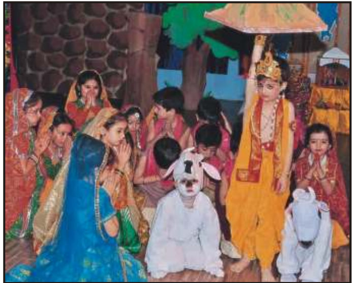
Lord Krishna – The Saviour.