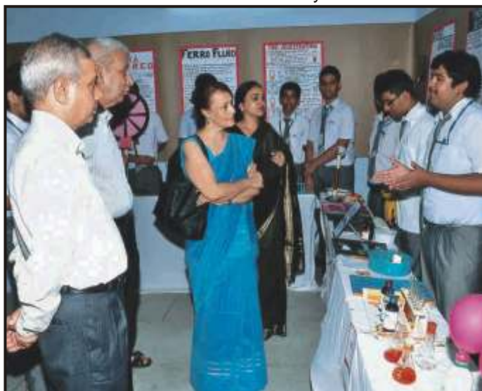
Class XI & XII students with their science models and projects.