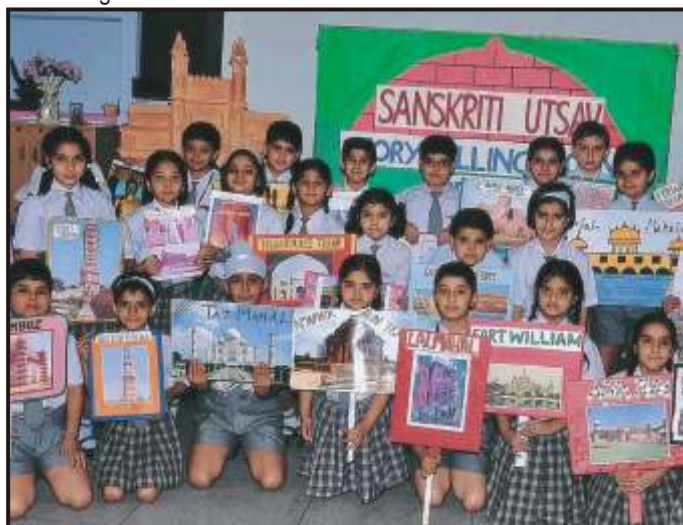
Winners of 'Legend Behind Historical Monuments' during Sanskriti Utsav (Class IV).