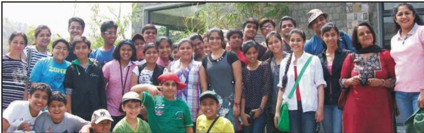
In tune with nature at Jim Corbett Park

30 students of the Earth Saviours Eco Club and Companimals Club went to Corbett National Park, Nainital on 14 th and 15 th April 2012. They stayed at the "Aromya Wild Resort." The group went around the park and got to see some small animals like porcupine and barking deer. They also went on a wonderful trek to a waterfall which was about 5 km away. It was a soothing and relaxing experience for people of an over populated and polluted city to experience the solitude, greenery and calm of the jungle amidst the majestic Sal and Sangwan trees.