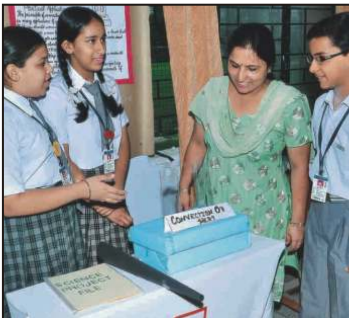
Class VII students showing a model on Convection Currents.

We celebrated 'Quest -2012' Science and Mathematics Week from 22 nd August to 25 th August 2012. Various activities like 'Know your Flora', 'Puzzling Fun', 'Sudoku', Science quiz, Maths Quiz and 'Sciencetoons' were organized for the students of classes 6 th to 12 th . More than 200 students participated in these activities. 'Science News- letter', 'One minute Activity' and 'Power Point presentation', were the main highlights. It culminated with an exhibition on 25 th August in which Maths and Science models were displayed by the students of classes 5 th to 12 th . The parents visited the exhibition and many participated in a quiz made exclusively for them. The prize winning parents are Mr. Rajiv Berry f/o Rajat Berry(7B), Ms. Niru Magotra m/o Shivank Magotra(9A) and Ms. Raman Arora m/o Sanat Kumar Arora(9B) who won the 1 st , 2 nd and 3 rd prize respectively. The judges for the event comprised of experts from Science and Mathematics field. On the panel were Ms. S. Shergill, Vice Principal, St. Mark's Girls Sr. Sec. School, Dr. Gurpreet Singh Tuteja, Maths Expert, Dr. Jain, Professor in Delhi University alongwith Senior Science Teachers, Ms. Rashmi, Ms. Malini Sridhar and Ms. Anuradha. The judges and parents applauded the efforts of the students and the event was a huge success.