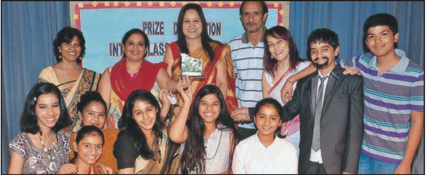
Winners of Best Hindi Play 'Aasha' - Class IX.

Theatre brings out the innate personality of a child and also helps to develop confidence of the actor within. On 25.7.12, Inter Class Hindi Play Competition was organized for class VII. The programme began with an offering to Lord Ganesha in the form of Ganesh Vandana. Four plays that were presented were " Baalak Chandragupta ", " Der Aaye Durust Aaye ", " Operation Cheese Chop " and " Mantra ".