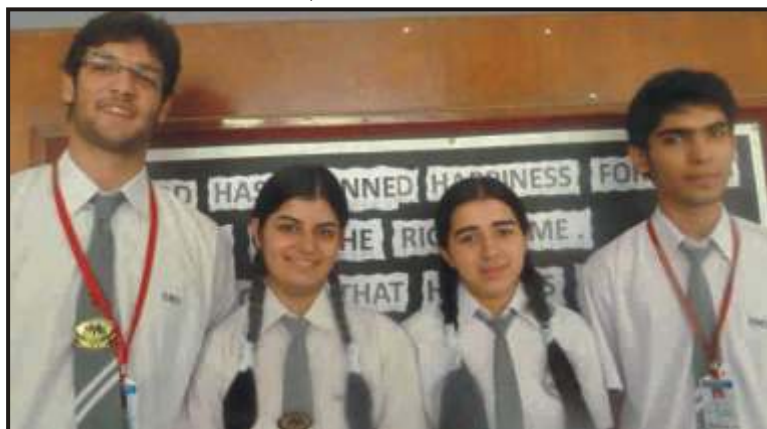
The proud smiles of C.B.S.E. Class XII Toppers.