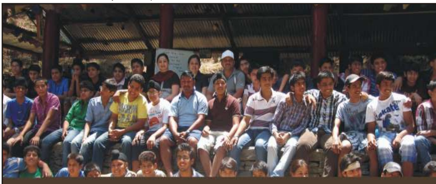
Camp Bodhisattva – Rajgarh

Our school organized an Adventure Camp for students of classes 9 & 10, at Rajgarh, Himachal Pradesh, from 27 May to 30 May 2012. Away from the hustle-bustle of our city life, 52 students, along with 5 teachers attended Camp Bodhisattva, in the company of the best of the six doctors: sunshine, water, rest, air, exercise and diet. The four day camp included activities like Rock Climbing, Rappelling, River Crossing and Commando Training. While such activities helped the students to check their physical fitness, the Adventure Trek made them realize the importance of walking as one of the fitness mantras. It was a tough trek up the hill but at the end of it, the sight of fresh fruits being churned into jam at the Bhuria Jam Factory made them forget their uphill walk. They also enjoyed the bonfire and the delicious and healthy food served every day. On the day of their departure from the camp, the students were also sensitized about their duties towards nature, as they cleaned their tents to ensure that there was no plastic littered anywhere. They came back with fond memories and left behind only their footprints.