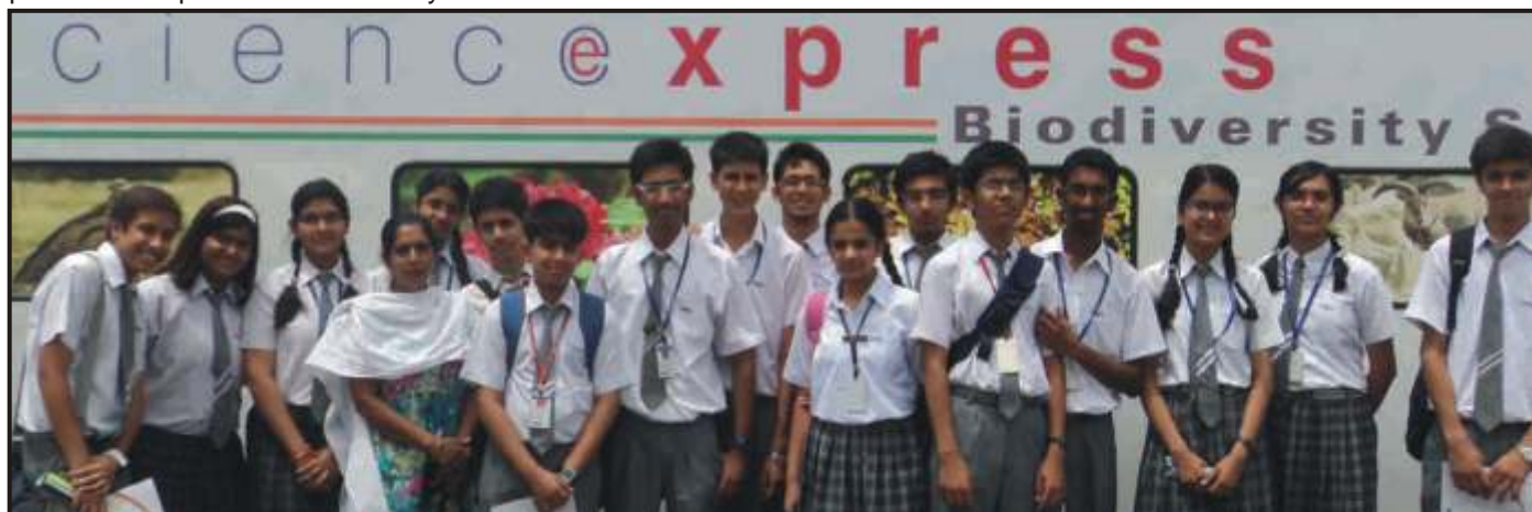
Students Witness Biodiversity On Wheels.

The exhibition aimed to showcase the wide array of biodiversity in the country and the conservation measures adopted. It also showed aspects of Climate Change, Water, Energy Conservation and Environment. Students enjoyed learning about cutting-edge research in Science explained through interesting audio-visual exhibits and interactive tools. They even performed experiments in the 'Joy of Science' hands on lab and were awarded certificates for the same.