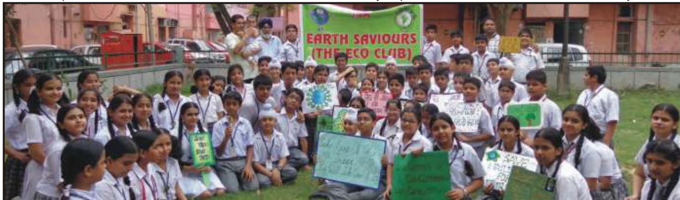
Our Earth Saviours on a Plantation Drive.

Students of Eco Club went for a tree plantation drive on 27.7.12. They planted saplings of semul, arjun, jamun and neem in a patch near Red Apartments, Tagore Garden. They urged people to save and conserve trees for a greener earth. The R.W.A. representatives interacted with the children and were very impressed with the sincere efforts made by them.