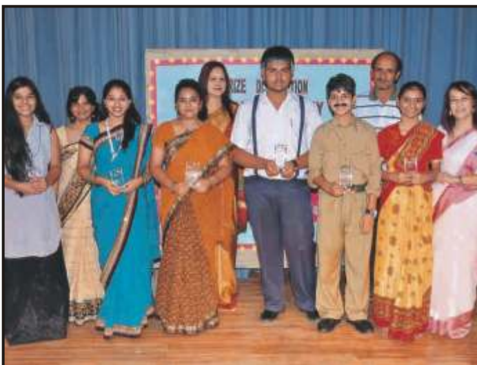
Accolades galore for the performers in Hindi Play Competition Classes VII & IX.