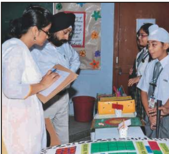
Class VI students showcase their mathematical talent.