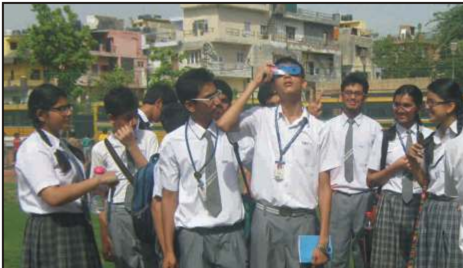
Taking a glimpse of the evening star.

Five students of our school attended an Astronomy Workshop at Gyan Mandir Public School, Naraina Vihar, on the 1 st of June 2012. The main focus of the workshop was to orient the students on astronomy, the special features of the planets, their positions in the night sky and prepare to witness the dramatic event of the transit of Venus across the face of the sun on June 06, 2012.