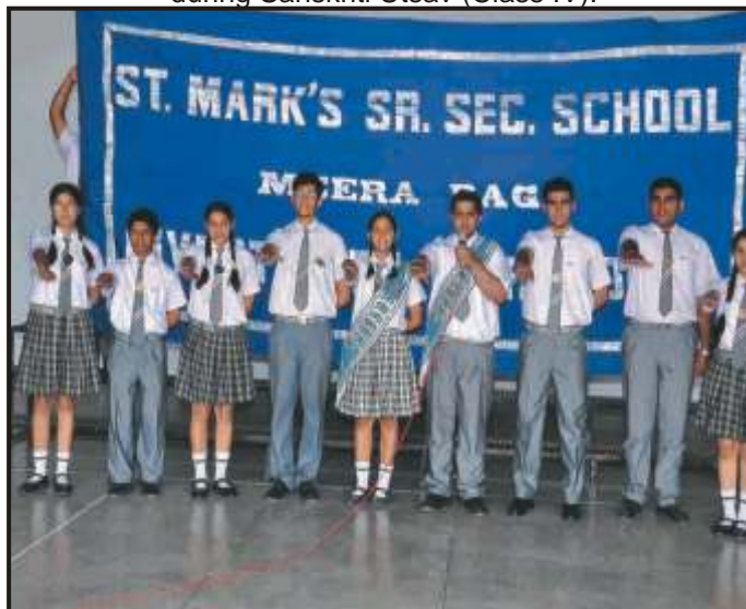
Our Torch Bearers – Senior Student Council.