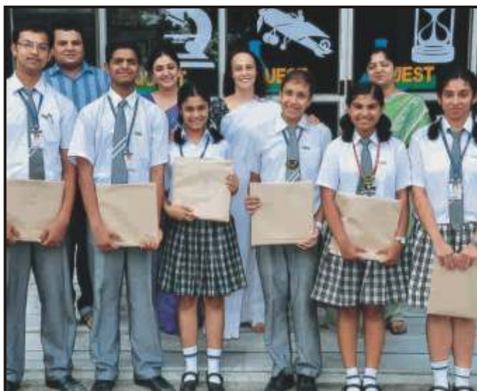
Winners of Powerpoint Presentation – Quest 2012