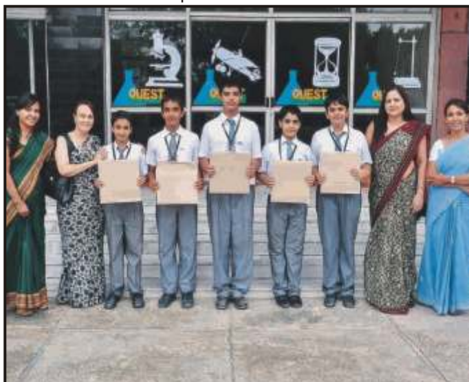
Puzzling is Fun for Class VIII.