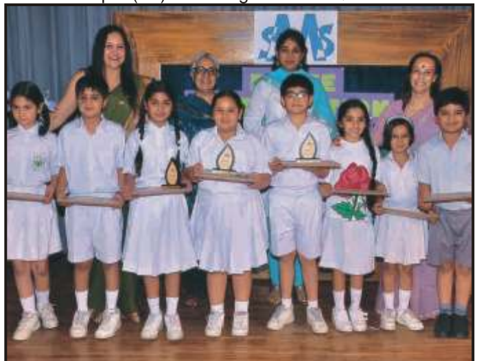
The proud winners of, Know Your Flora, Class IV during Prakriti Utsav.