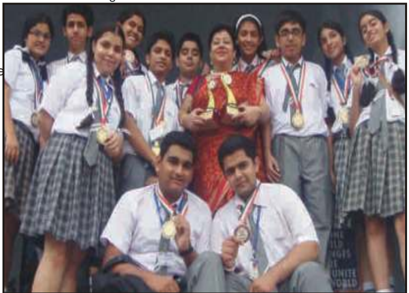
The Winners take it all at LITFEST.