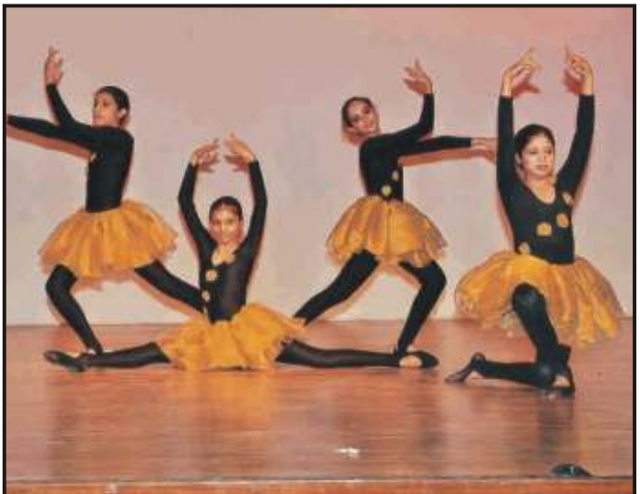
A dancing start to the English Play Competition