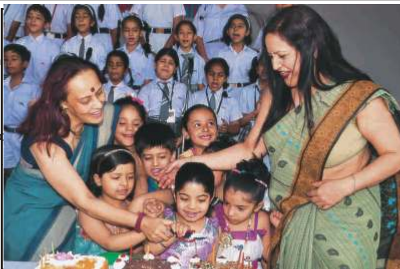
Happy Birthday SMS.