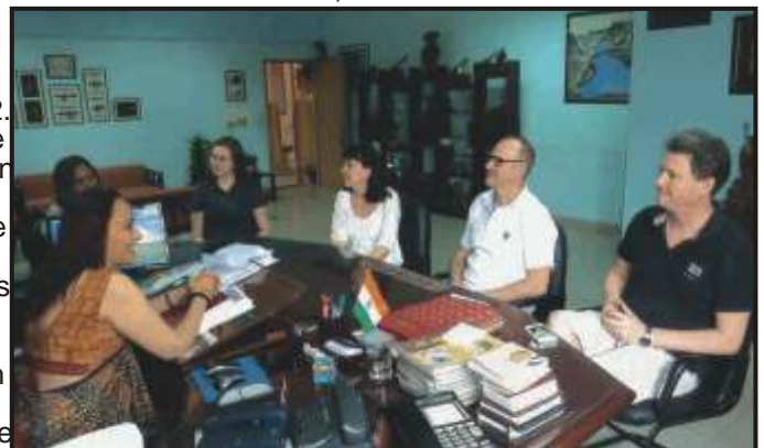
Our principal in a tete-a-tete with visitors from Sweden.

A four member teacher delegation from Ebba Pettersson Privatskola visited our school in April 2012. This visit was a second visit as five teachers from the school had visited us in 2007. The students have been contributing to the webzine-WEBBA. Both schools want virtual collaboration to be translated into real life experience. The schools are working closely to give their students a taste of each other's culture, traditions and lifestyle through student exchange programmes. The delegation got an insight into the day to day working of the school as well as the education system of our country. The delegation visited important landmarks of Delhi and also visited Agra to experience the beauty of the Taj Mahal.