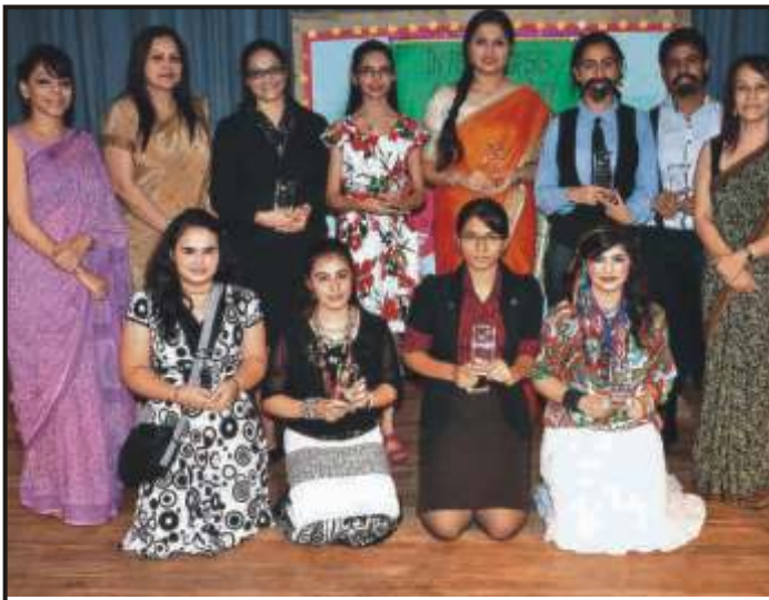
Winners of class XI English Play Competition.