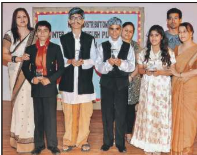
Excelling with Talent – English Play Prize Winners(Class VIII).