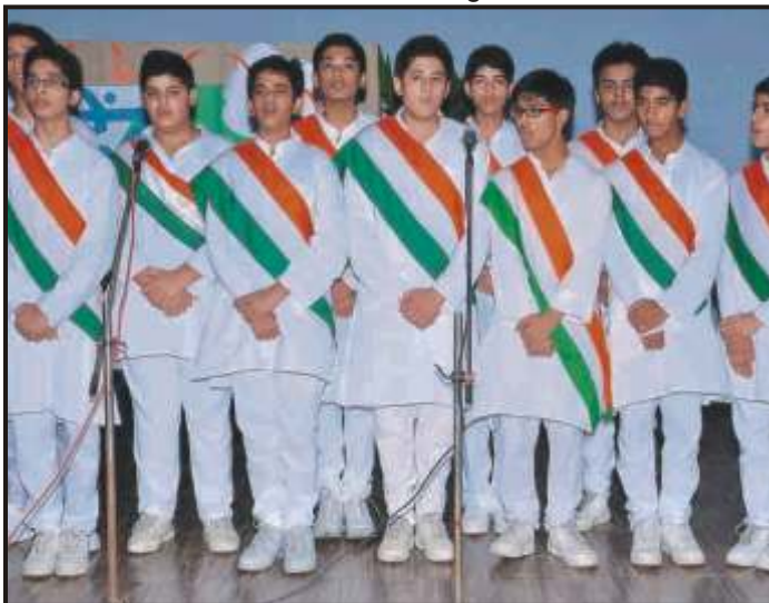
Paying homage to our motherland – Independence Day Celebrations.