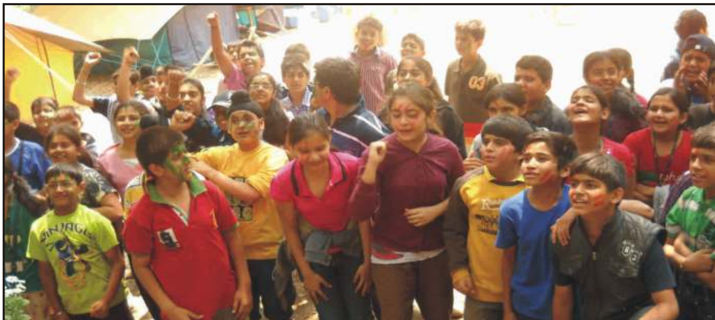
Fun Unlimited at Nainital.

On 2 June 2012, 56 students along with 5 teachers set out for a 4 day 3 night "Jungle Camp" - 3kms from Nainital; named as Camp Anubhav. The camping included adventures like rock-climbing, rappelling, caving, night trekking and valley-crossing. There was great enthusiasm among the children who put up a brave front for these activities. The activities helped them to boost their strength, stamina and self-confidence. Various other games and "Samba" inculcated the spirit of "team-work" in them.