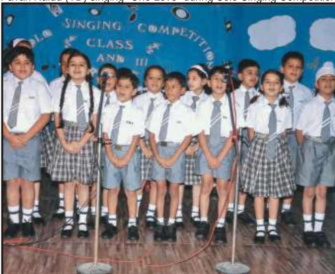
A musical end to the Solo Singing Competition