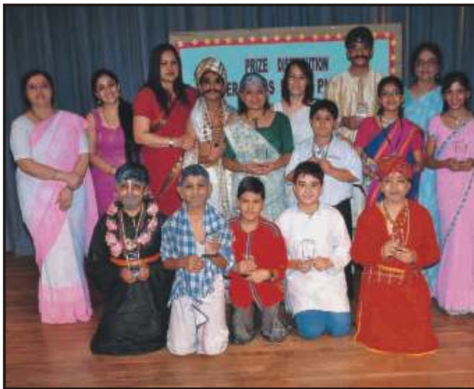
Winners of 'History Comes Alive' during Sanskriti Utsav.