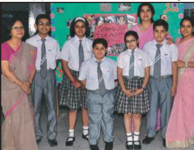
Students know it all – 'Strange But True Animal Facts'.