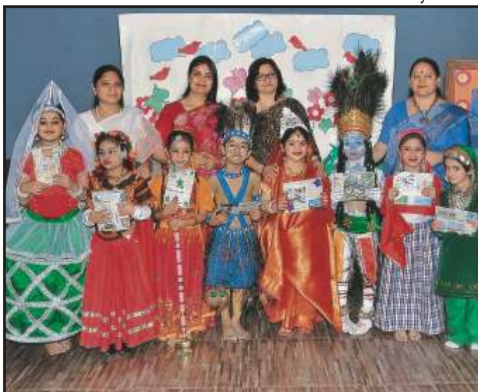
Class II students showcasing the vibrant costumes of India.