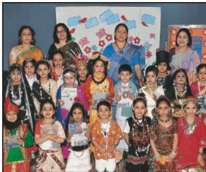
Our tiny tots showcasing Unity in Diversity through a Fancy Dress Competition

Students of classes I & II of our school added to the fervour of the Sanskriti Utsav by dressing up in costumes from different states of India. (Results on Pg22 )