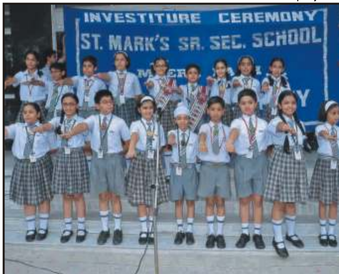
Junior Student Council all set to shoulder responsibilities.