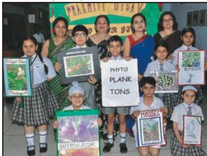
Young Botanical Experts showcasing their knowledge on flora during Prakriti Utsav.

We celebrated Prakriti Utsav 2012 on the 19th of April to commemorate Earth Day. Prakriti Utsav saw around 25 schools from all over Delhi participating in the daylong event. Students of class 4 participated in 'Know Your Flora' and stunned the judges as well as the audience with their awareness about varieties of trees, shrubs, plants and bushes. In the Poetry Illustration competition students of Classes 9 and 10 composed poems and illustrated them. The event culminated with a mega multimedia quiz on ecology. Dignitaries for the event Ms.Aarti Khosla, WWF, India and Ms. Maya Goverdhan, Navdanya, gave away the prizes to the winners of the various activities. In tune with the celebrations, the students of class 5 of our school participated in 'Best Out of waste' activity. They enthusiastically made productive use of waste material such as newspapers, ice-cream sticks etc .(Results on Pg.21 )