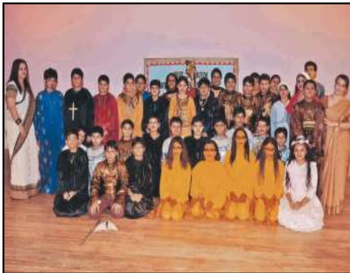
Best Play – 'Joan of Arc' - Class VI.