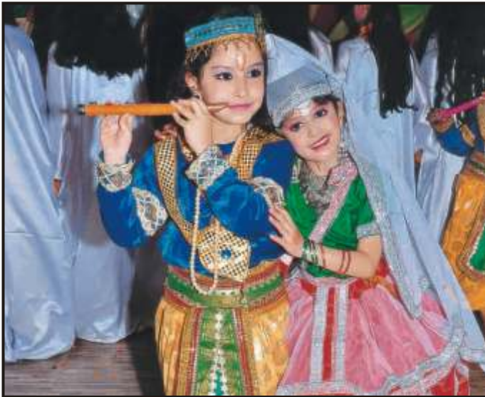
Radha and Krishna symbolizing pristine love.