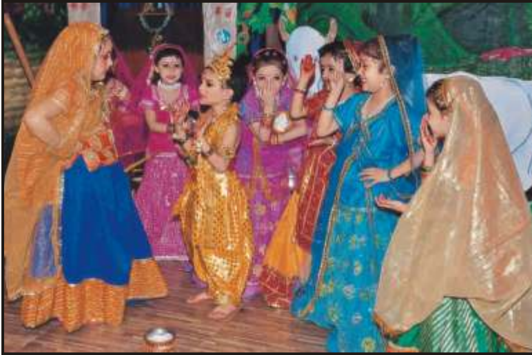
Makhan Chor with his Gopikas

The students of class I celebrated Krishnashtami with gaiety on 09.8.12. Students donned the roles of Lord Sri Krishna, Kansa and Gopikas amongst many other characters related to Gokulashtami. They won the hearts of the audience by enacting various roles of Sri Krishna from his childhood as Nathkhat Makhan Chor. The strong bond of friendship between 'Krishna and Sudama' was showcased and followers of Krishna like Surdas, Ras Khan, Chaitanya Mahaprabhu and Meera Bai depicted their devotion for Krishna.