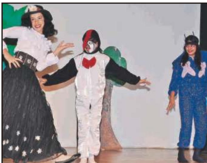
Mary Poppins' – Play in progress (Class VI).