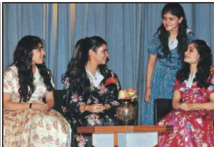
Expressions unlimited during English Play Competition (Class VI & VIII).