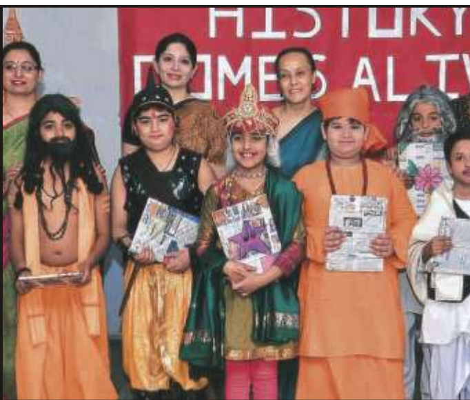
Winners of 'History Comes Alive' during Sanskriti Utsav.