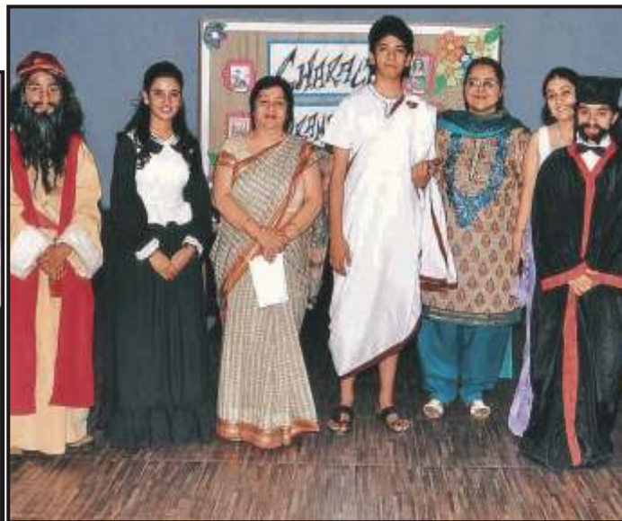
Winners of Character Dramatization – Class VIII, during Shakespeare Week