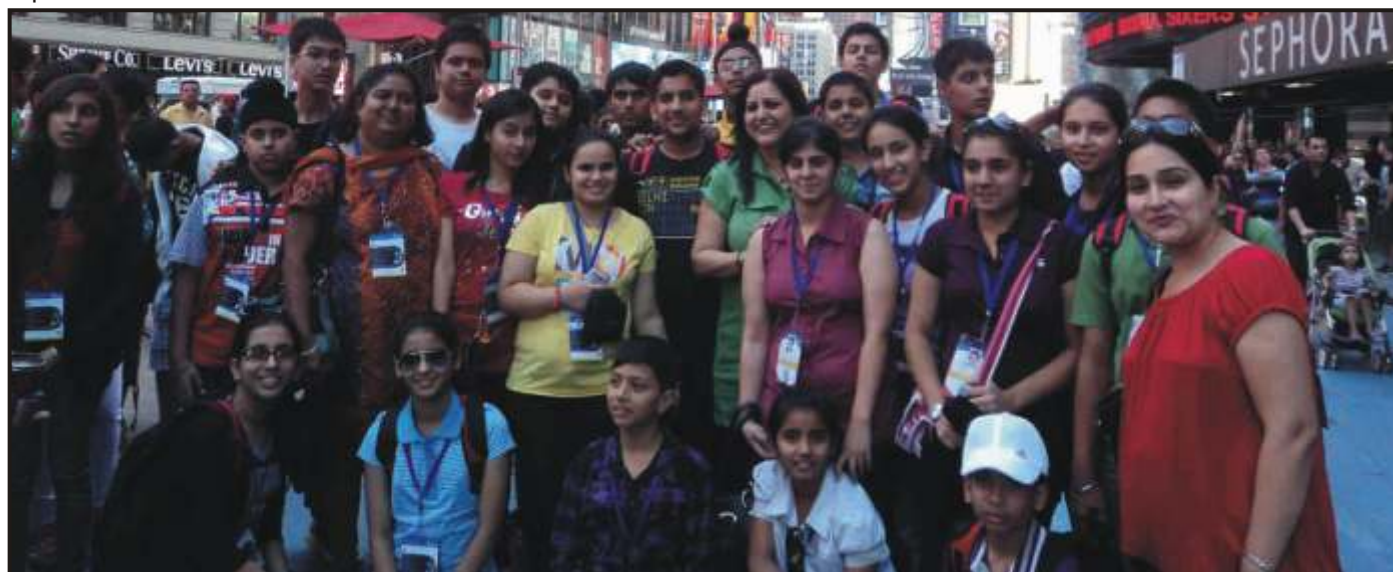
Our students at Times Square