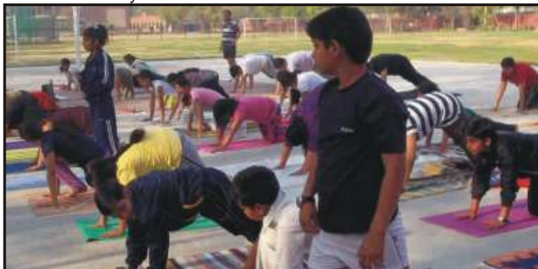
Students sweat it out in Yogathon

On 'World Health Day', on 07.4.2012, around 100 students from classes VI to X, including parents, participated in nationwide 'Yogathon', an initiative taken by the Art of Living to create awareness about Yoga and its benefits. The students and parents did pranayams and performed a few rounds of Surya Namaskaras – the 12 asanas of Sun Salutation. They participated with full enthusiasm and zeal and felt relaxed and rejuvenated after the session. All participants were awarded certificates for their efforts. 3 participants completed 108 rounds of Surya Namaskars and won Gold medals