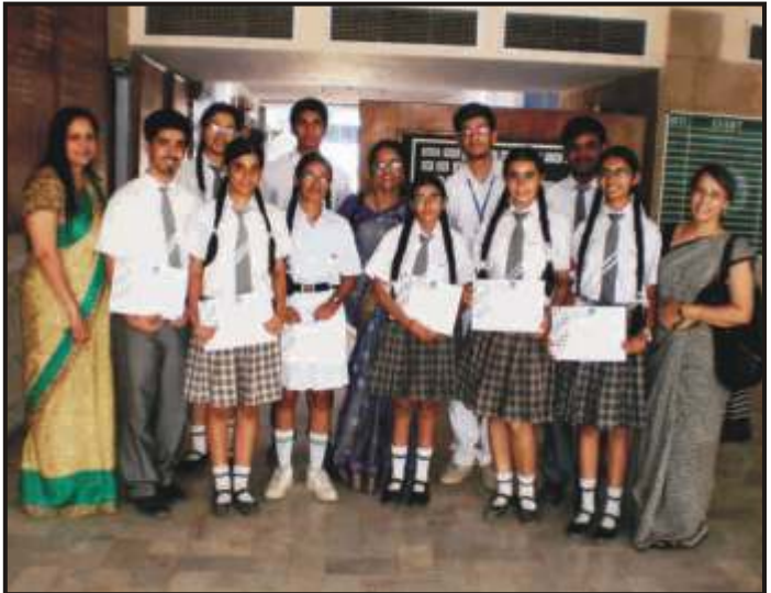
The Winners of the GVC Project – Secondary Level.