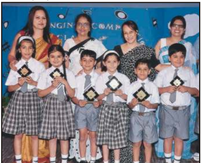
Winners of Solo Singing Competition Class II & III.