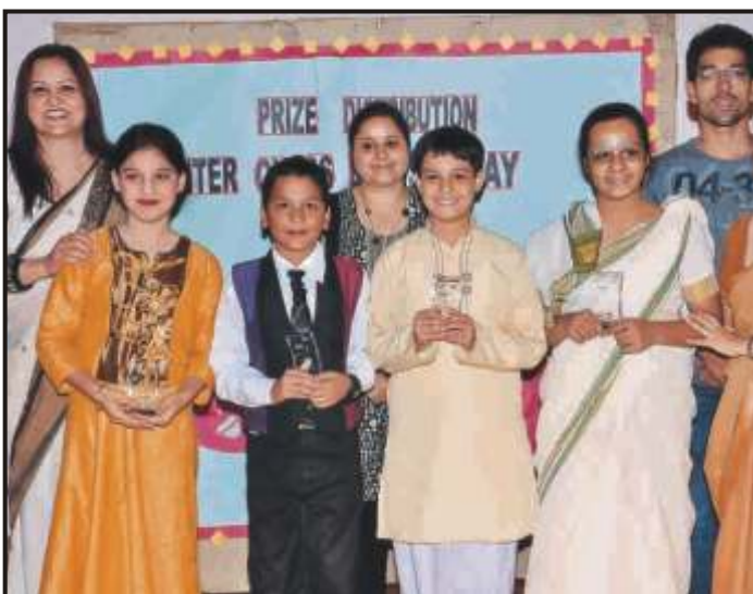
Prize winners of English Play Competition (Class VI ).