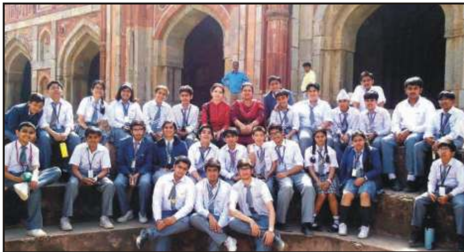
A visit to our Glorious past.