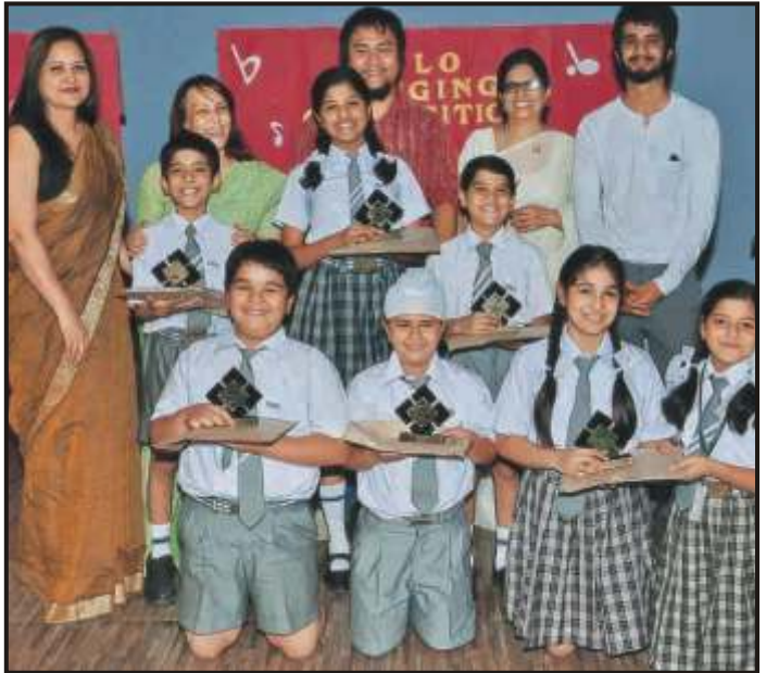
Winners of Solo Singing Competition IV & V.