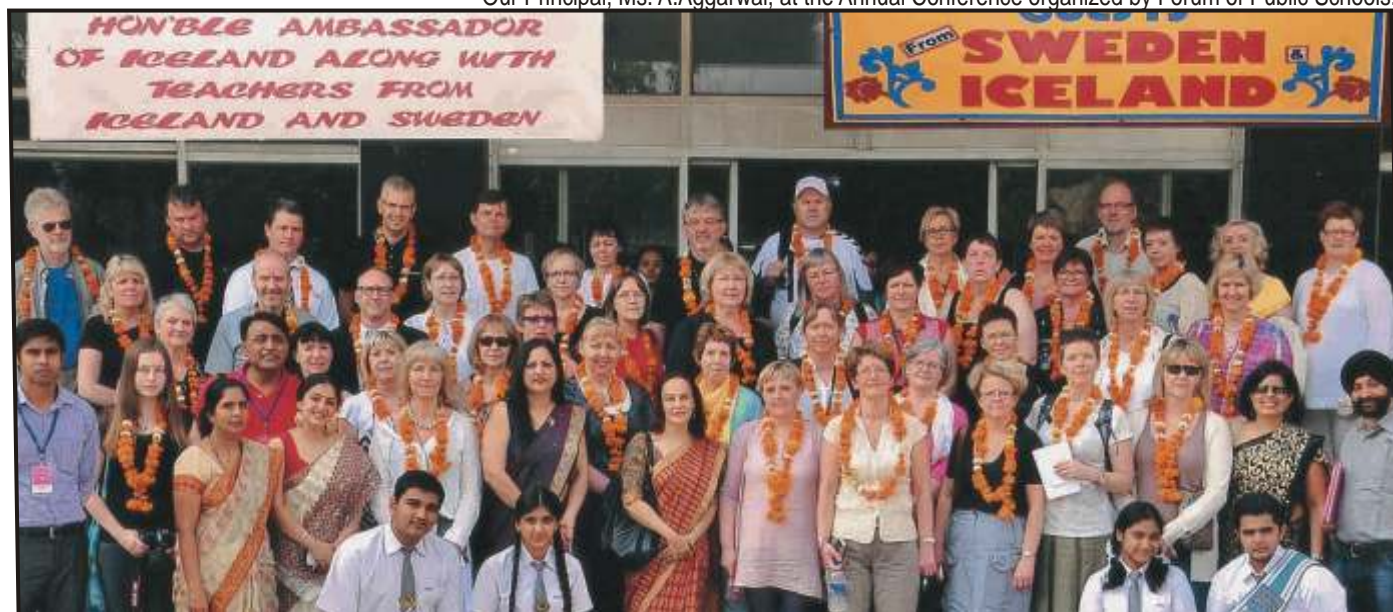
We give our off-shore friends a taste of Indian Hospitality.