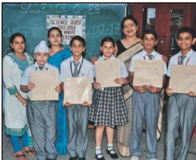
Winners of One Minute Activity – Class VII.