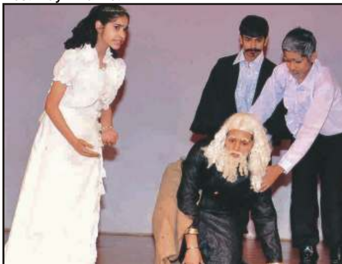
A repentant 'King Lear' during Shakespeare Week