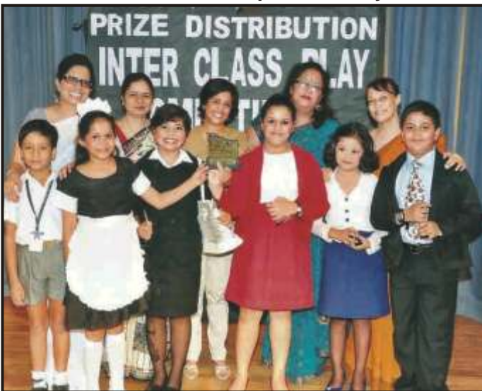
'Villa for sale' adjudged Best Play (class IV)