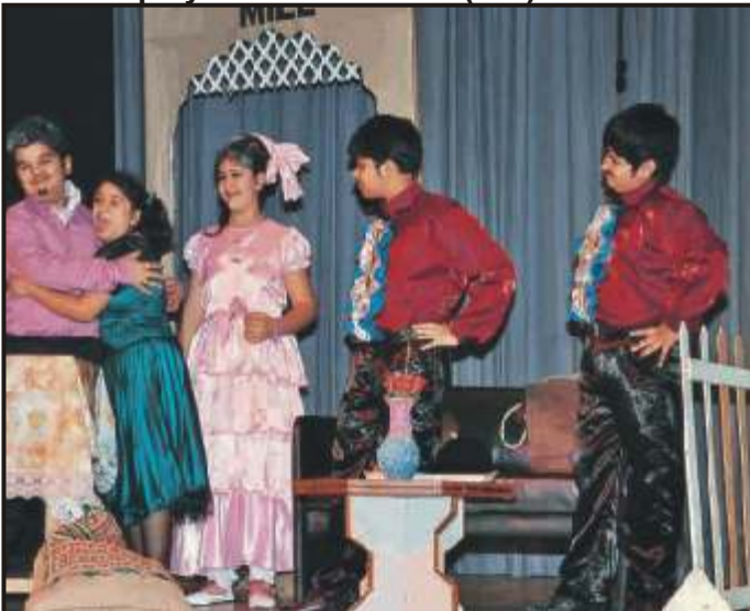
'Susan and Her Brothers' presented by Class VF.