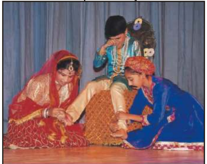
'The Nosey Parker' performed by students of class VD.