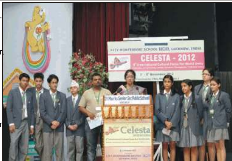
Our team made its presence felt at Celesta 2012.