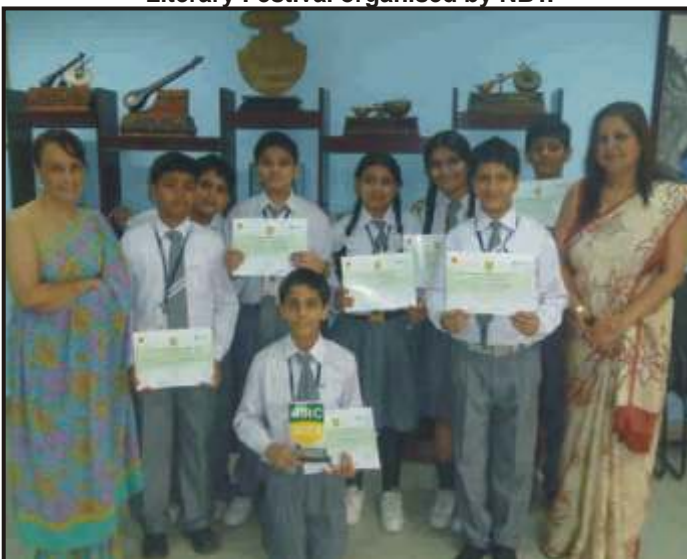
The II Runners-Up of Inter School Robotics Challenge.