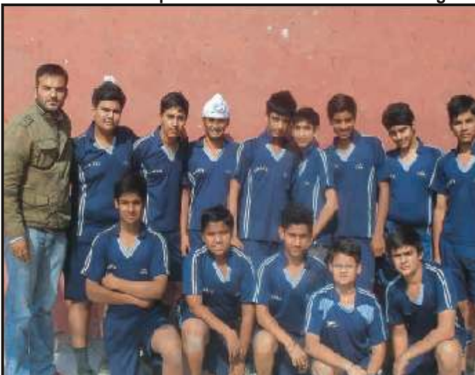
The proud winners at the Jr. level of Zonal Volleyball Tournament.