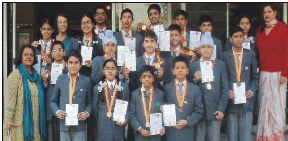
The winners of Quiz on NASA.