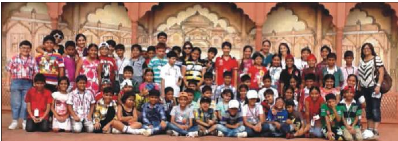
Class IV travel enthusiasts at Jaipur.

An educational tour to Jaipur was organized by the school for the students of classes III and IV. The extensive guided tour of Jaipur city, with a visit to its fort and museum, added a great deal to the children's knowledge of historical background of the city. It acquainted them better with the rich heritage of India. The students stayed at Choki Dhani Village Resort. They visited Amber Fort, Sanganer Block Printing factory and Jantar Mantar. Various activities were organized at these places that combined a verbal presentation and an element of photography. They also learnt nuances of block printing and blue pottery. During the overnight stay at Choki Dhani, the students enjoyed the Rajasthani Fair and witnessed the amalgamation of music and dance.