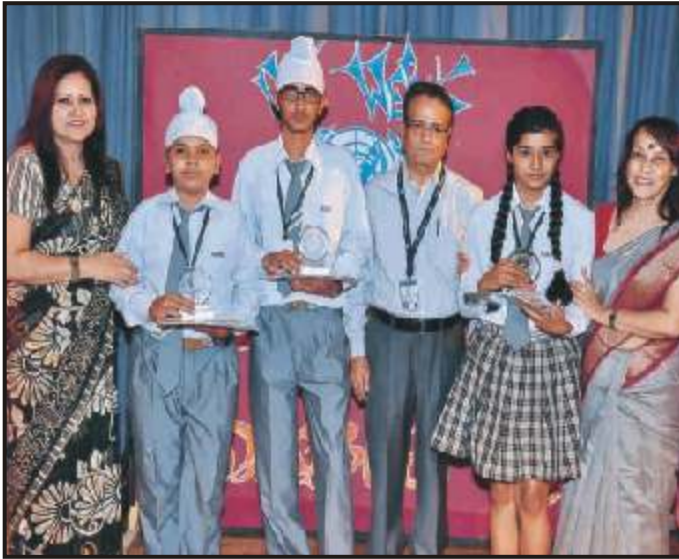
The Winners of 'Know The UN' competition during UN Week.