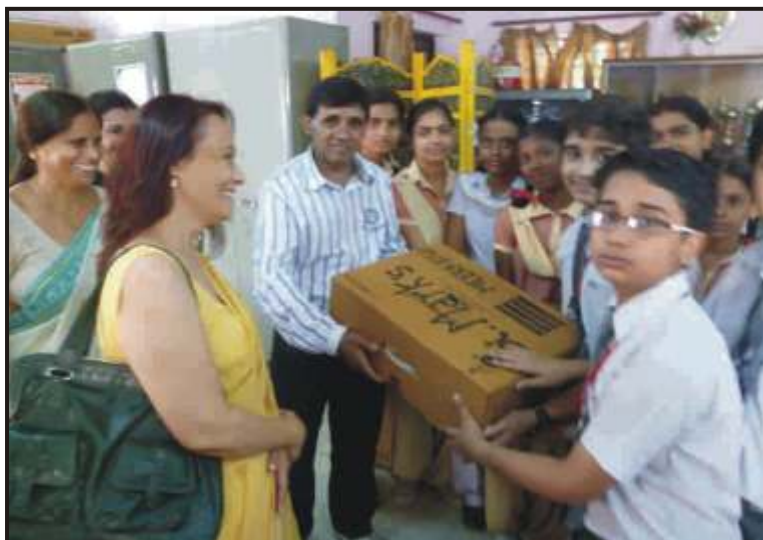
Helping society is our responsibility.

Availability of clean, drinking water is a major issue in most of the govt. run schools. Our students felt that water is a dire necessity for survival. Translating this thought into action, the students of classes VI, VII and VIII initiated a project wherein they collected money from their classmates and teachers and installed Aquaguard Water Purifiers in three schools namely, Govt. Sr. Sec. School for Girls, Ambica Vihar; Govt. Sr. Sec. School for Boys, Ambica Vihar and Govt. Sr. Sec. School for Boys, Jwala Puri.