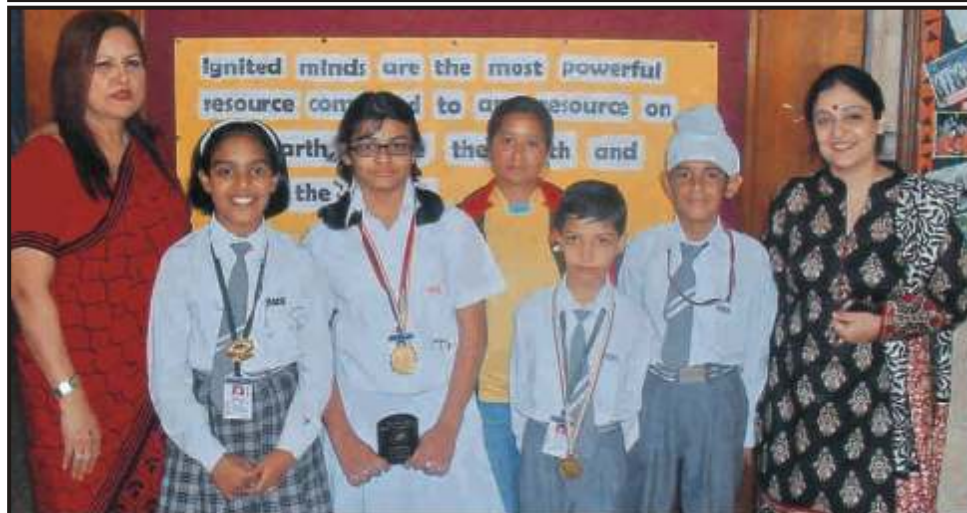
The winners of South Delhi Open Skating Championship.

Students of our school participated in South Delhi Open Skating Championship 2012 on 27 th and 28 th October 2012, and won the following prizes: