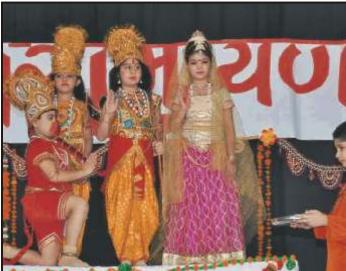
Lord Rama with Sita, Laxman & Hanuman after 'Lanka Dahan'.