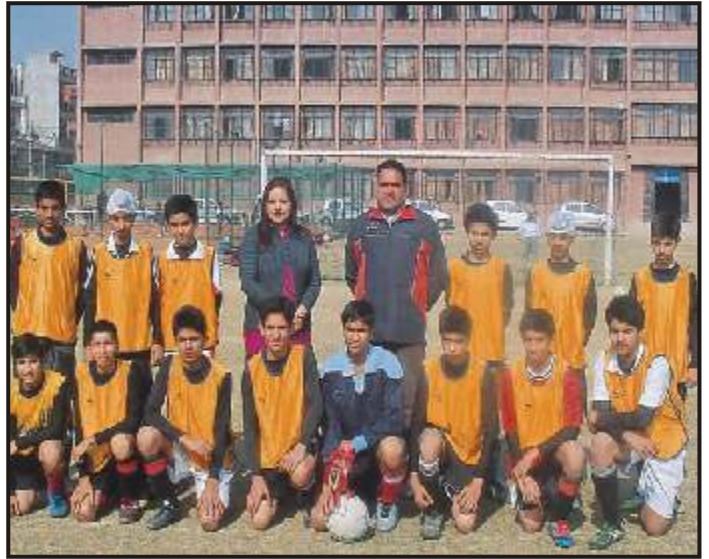
Sub. Jr. Boys Football Team- Winners at the Zonal level.