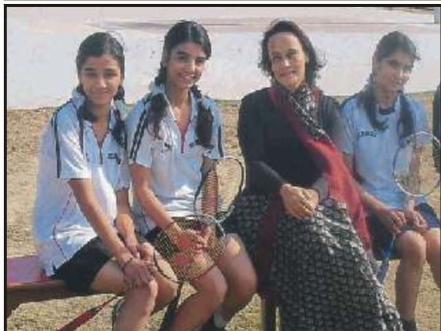
Junior Girls -II Runners-Up

Students of our school participated in the Zonal Badminton Tournament, which was held at SKV, B-3, Paschim Vihar and was conducted by Delhi Administration (Zone XVII) for the year 2012-2013 from 28 th August to 7 th September. Our senior girls emerged champions against SMS Girls Sr. Sec. School, the Sub Junior Girls defeated SKV, B-3 Govt. School and our Senior Boys emerged winners against Little Angels School.