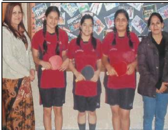
Sr. Girls and Jr. Boys Zonal T.T. champs.