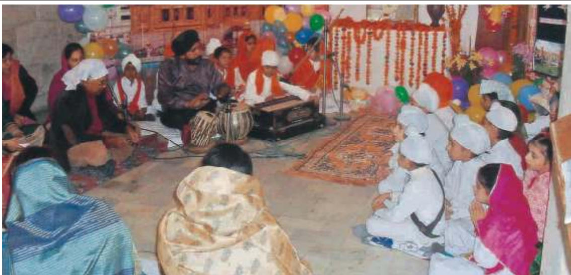
Our young Pathis create a spiritual atmosphere with their Shabad Kirtan

Guru Nanak Jayanti, birthday of the first guru of the Sikhs, Sri Guru Nanak Dev, was celebrated on 27.11.12. The audience was mesmerized by the soulful Shabad Kirtan presented by our young pathis. The recital made the entire atmosphere peaceful and everyone sought the blessings of the Guru.