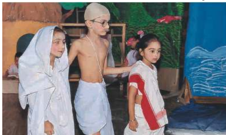
Spreading the message of 'Ahimsa' during Gandhi Jayanti.