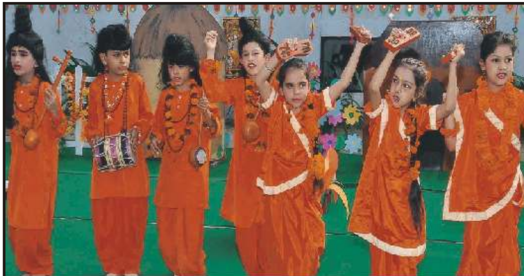
. Singing glory in the name of Lord Rama.

Diwali was celebrated on 09.11.12 in the school premises with great enthusiasm. The students of class III, dressed up in colourful attire, presented 'Sampoorna Ramayana' in which the scenes of the childhood of Sri Ram, swayamvar, exile, victory over Ravana and his return to Ayodhya were depicted. Around 200 students participated in the event, which was witnessed by their parents as well. The programme was very pleasing to the eye and ended with a pooja and aarti.