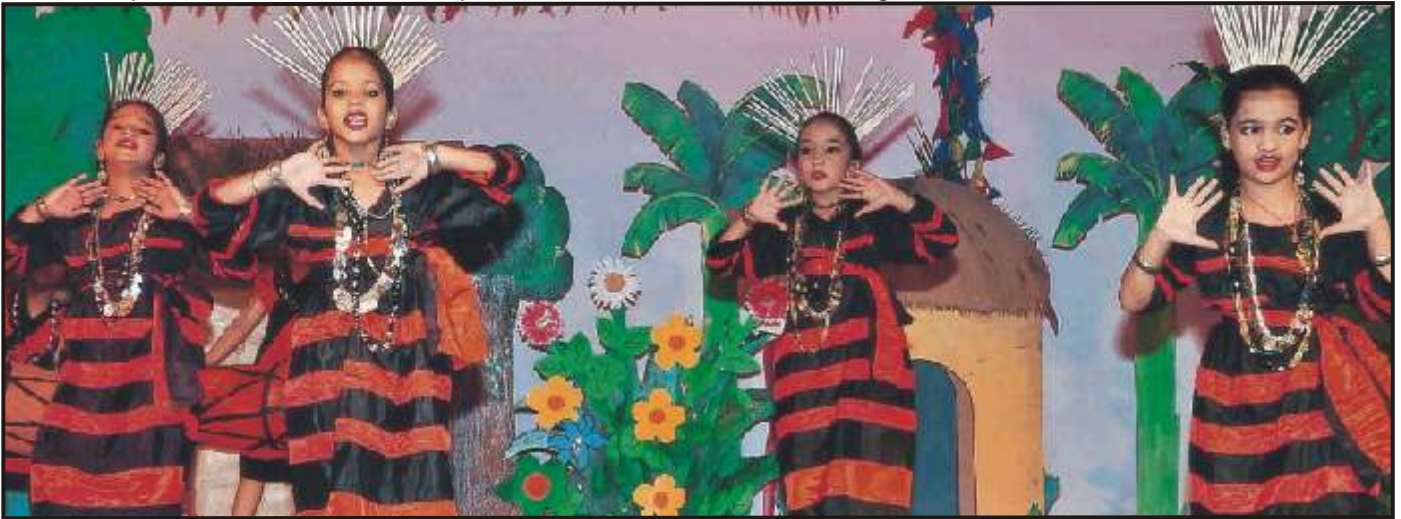
The prize winning Zemi dance performed by students of class II D