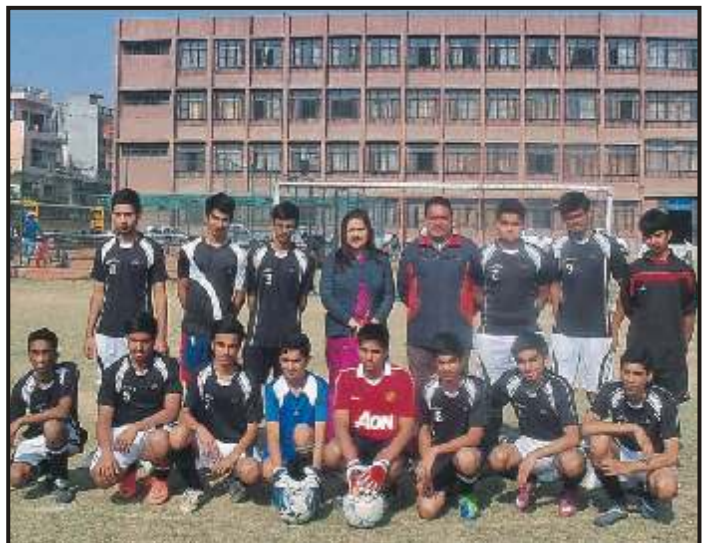
Jr. Boys Football Team – Champion at Zonal Level.