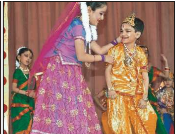
'Thumak Chalat Ramchandra Bajat Paijaniya'.