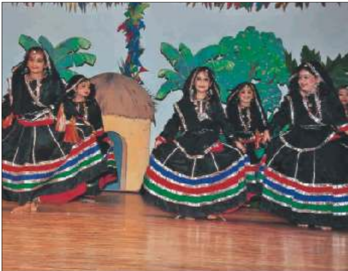
The all time favourite 'Kalbelia Dance' spreads its radiance.