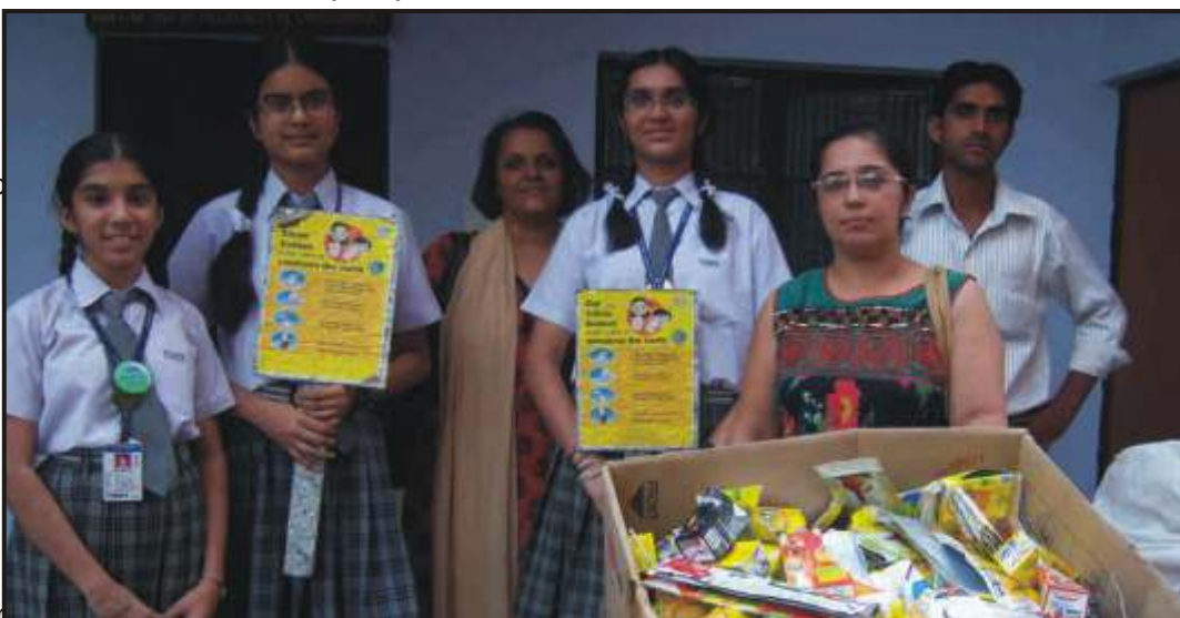
We do our bit for Mother Earth

Our students collected 15 kg tetra paks and sent it to DLF Links for proper recycling. It may be noted that this collection was made by the active efforts of all the St. Markians. The school doesn't have a canteen, so the students actually got them from their homes. It has been ingrained in their minds that proper disposal of tetra paks is necessary for a clean environment.