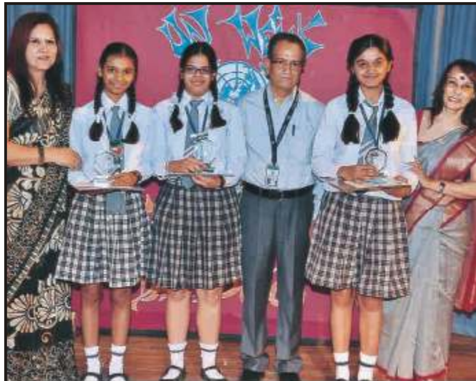
The winners of 'Poster Making' competition during UN Week.