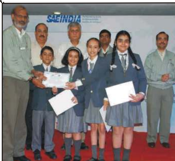
Jet Toy and Skimmer Challenge winners.