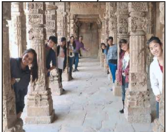
The delegates from Singapore enjoying our rich heritage.