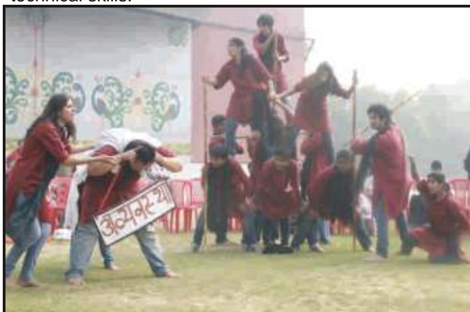
Burning Issues brought to the fore through Theatre.

There were 2 stage performances on 07.11.12. The two theatrical productions, "Laal Pencil" and "Park", addressed serious social issues but in a lighter vein. The message conveyed by these plays reached out to the students in an effective way.