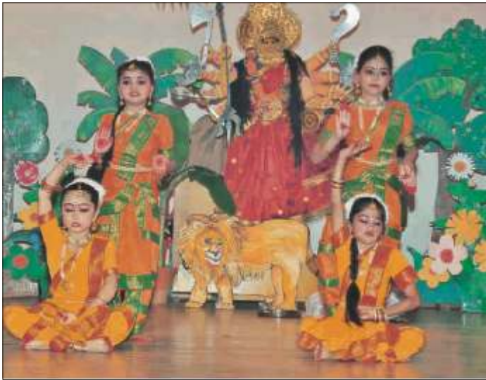
Invoking Goddess Durga for a spiritual start to the Folk Dance Competition.