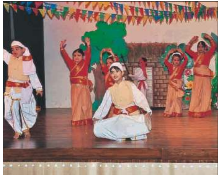
Bihu Dance brings with it the flavour of Assam.