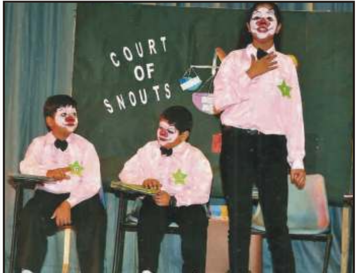
'Twelve little pigs' performed by class VE.