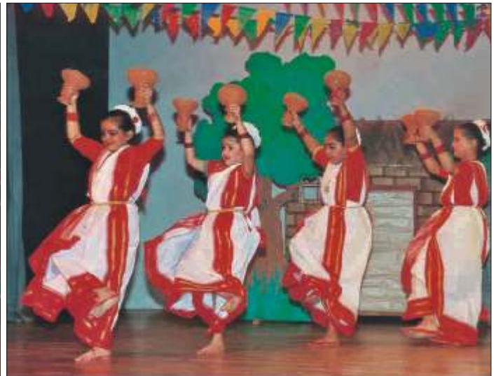
Students performing Dhanuchi dance.