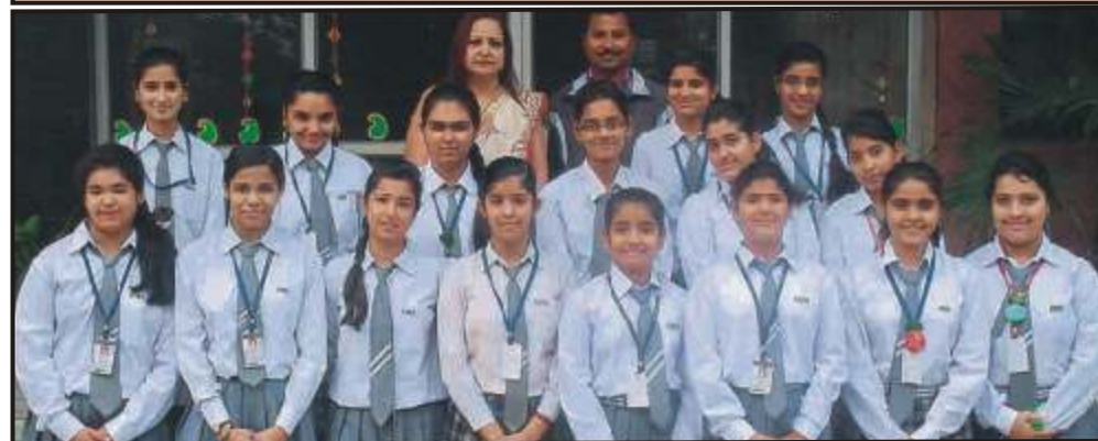
Our first ever Girls' Football Team.

Our school introduced football for girls this year to show their sporting skills. 16 girls got an opportunity to attend the CBSE North Zone Football Championship U – 19 years, which was held at Pragati Public School, Dwarka on 5 November 2012. It was definitely an experience to cherish.