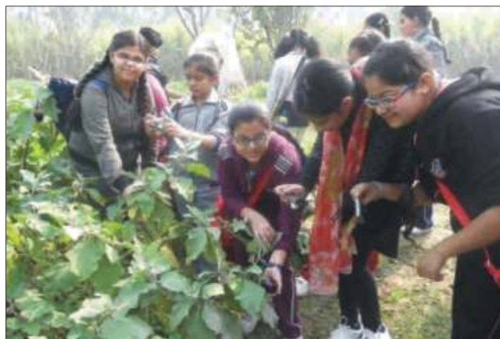
Our Green Ambassadors in the lap of nature.