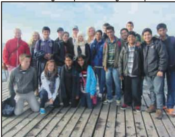
Our students with their hosts at Ystad, Sweden