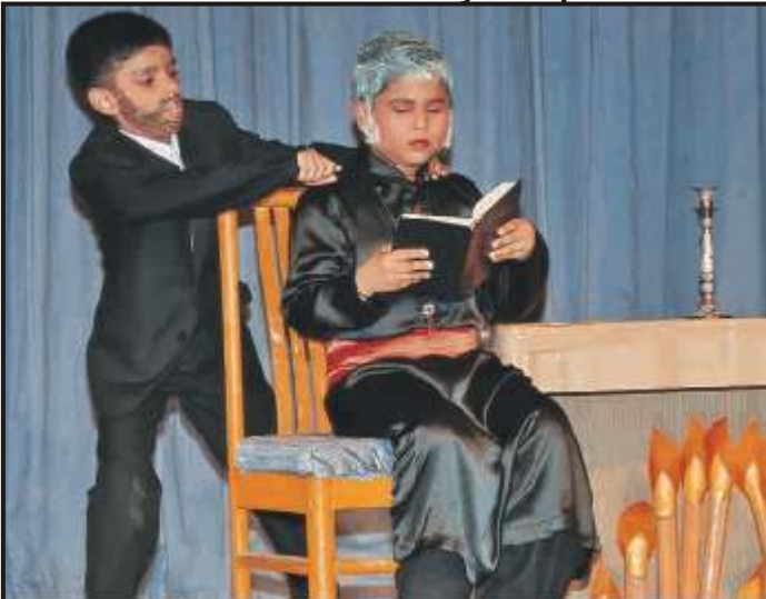
The calm Bishop unmoved by the Convict's threat.