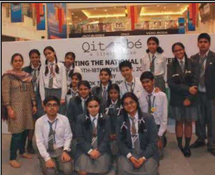
The members of Students' Media Society at the Literary Festival organised by NBT.