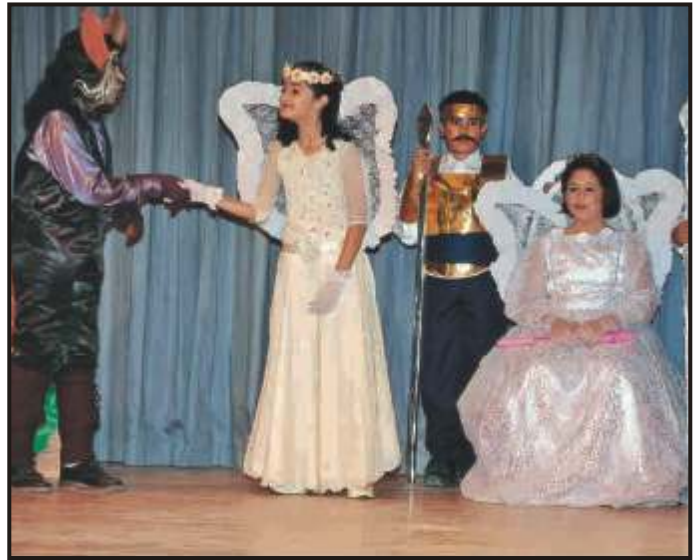
'Holka Polka' performed by class VC.