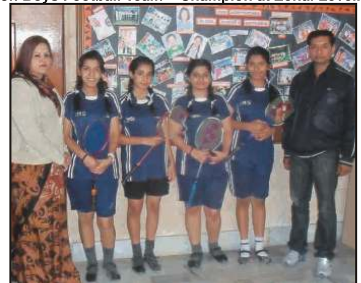
The Badminton Champs at Zonals(Sr. Girls).