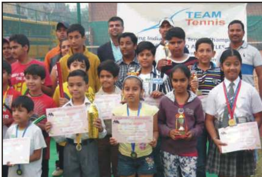
Champions at the SMS Open Tennis Tournament.