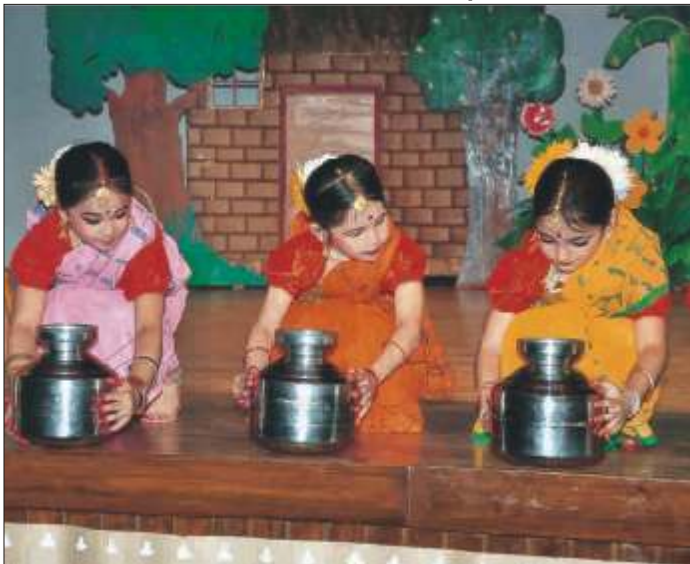
Bangla Dance by our cute little girls.