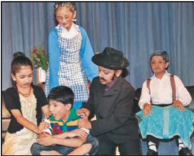
The play 'China Dog' in action(ClassIVD)

It gives us immense pride to declare that the primary section put up a grand show by staging 21 different plays during the Inter Class English Play Competition. It was possible only because of the sheer hardwork and dedication of the students and teachers alike and the co-operation of the parents. It all began on 07 September with the 3rd standard students putting up 7 different plays like 'Beauty is Beast', 'The Demon and the Dancer', 'Chocolates in your Dreams too', 'One Coin Short', 'I Want Another Mother', 'Many Moons' and 'Silent Woody'. All the plays were appreciated and the Best Play award was shared by students of III G and III F. This was followed by a show put up by the students of class IV on 22 September, as they presented 9 different plays. The plays presented by them were 'The Princess's Mouse', 'Rice Cakes', 'The Christmas Eve', 'The China Dog', 'The Bishop's Candlesticks', 'The Story of a Boy', 'Kama Vs Yama', 'Shakuntala' and 'Villa for Sale'. The judges were impressed by many of the performances and encouraged the students. The award for the Best Play was shared by the