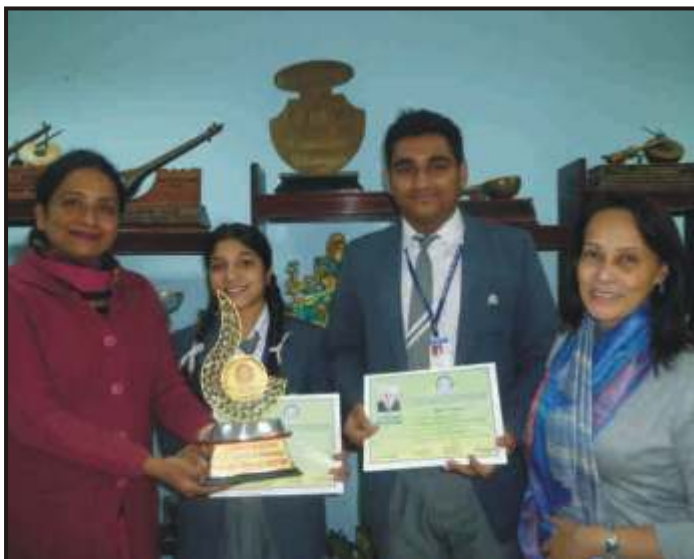
Our Debating Champions receiving their trophies.