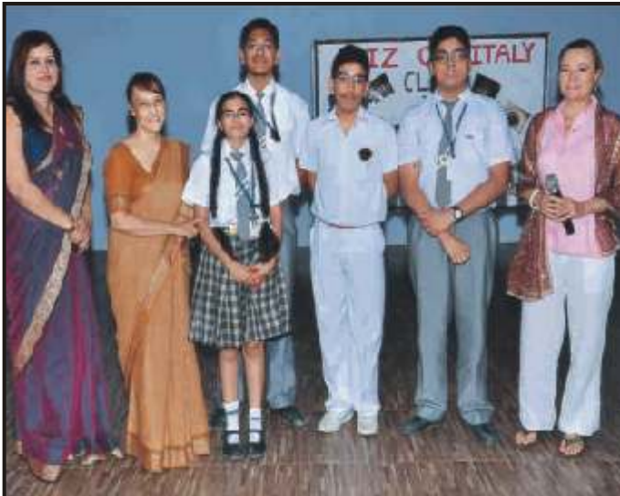
Winners of Quiz on Italy.