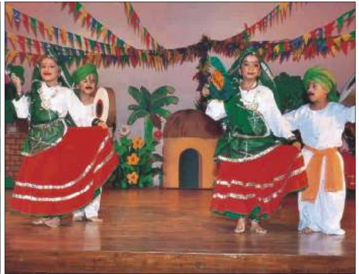
Class II students in the Haryanvi flavour.