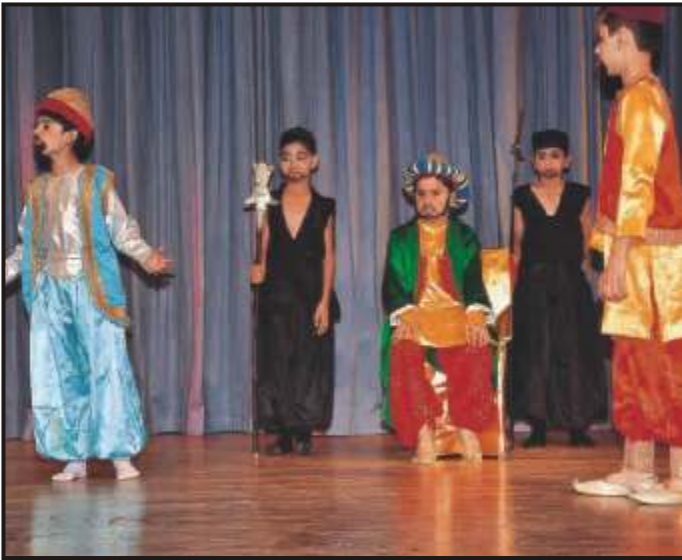
The play 'One Coin Short'(IIIIG) in action.