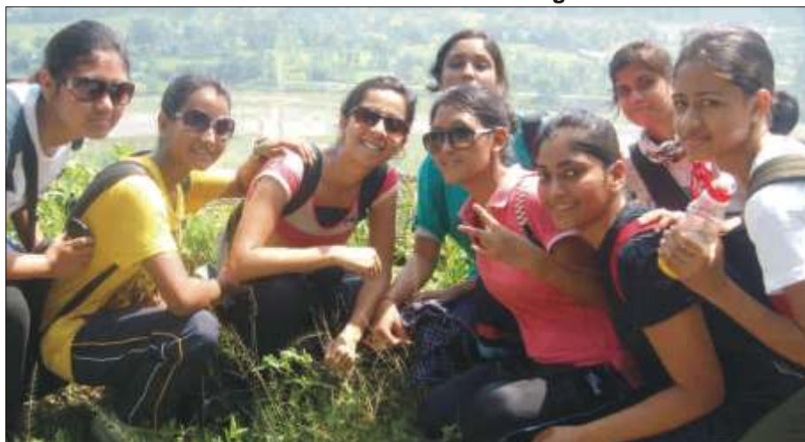
Our NCC cadets in Darjeeling