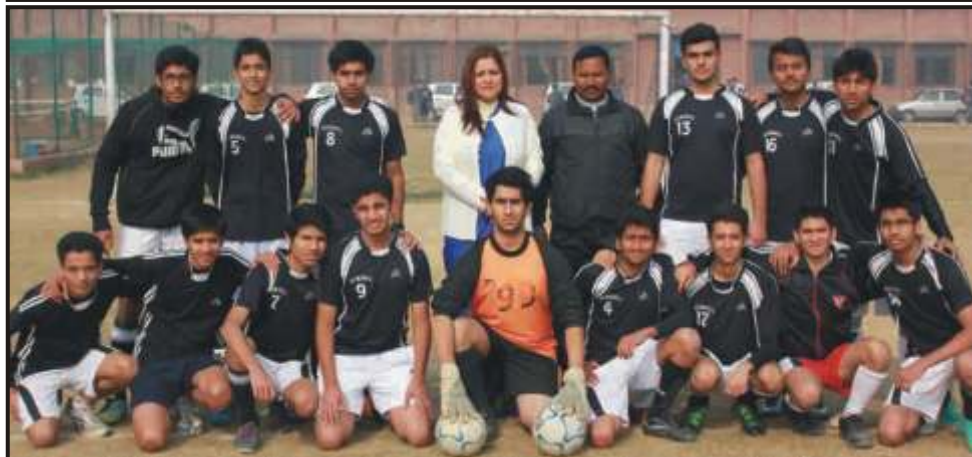
Sr. Football Team- Winners at Zonal Football Tournament