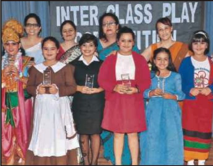
The Winners of 'Best Dialogue Delivery'- Class IV Inter- Class Play Competition.