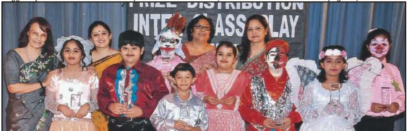
They made their presence felt on stage during the Inter-Class Play Competition for class V.

students of IV F and IV I who presented 'The Story of a Boy' and 'Villa for Sale' respectively. The gala event continued as the students of class V presented 5 plays on 30 October. Their performances included 'Holka Polka', 'Oliver Twist', 'Susan and her Brothers', 'Twelve Little Pigs' and 'The Nosey Parker'. All the plays were appreciated and the best play was bagged by students of Class V C who presented 'Holka Polka'. (Details of individual awards on page 20).