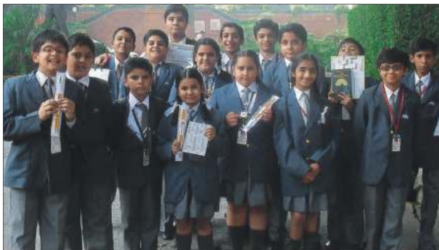
The young readers' brigade at India Habitat Centre