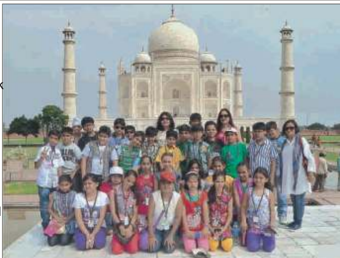
Class III students soaking in the beauty of the Taj

30 Students of Class V went on an excursion to Agra and Fatehpur Sikri on 18 th and 19 th September, 2012. Students enjoyed the fun filled activities such as constructing a Mughal Tree, clicking photographs and locating the sites with the help of clue cards. They were also taken to a Marble factory where they learnt about the art of 'Inlay work on Marble'. On the whole it was a memorable experience, which enhanced the knowledge of the students about art, architecture, history and culture of the Mughal Era.