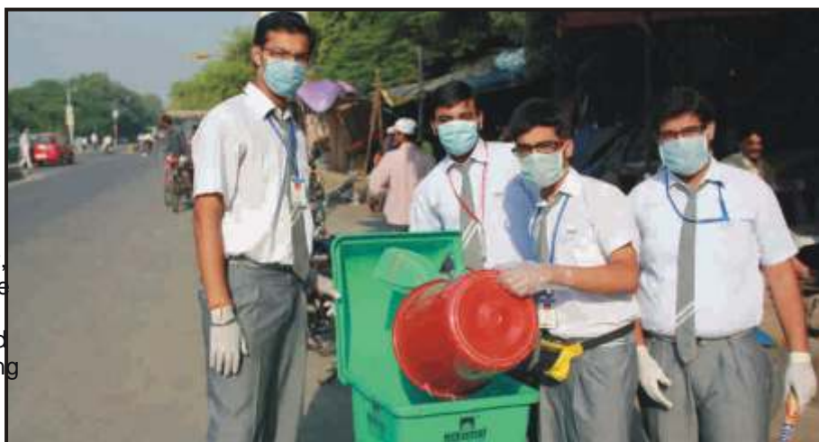
Our students setting an example for the society.

"The best way to find yourself is to lose yourself in the service of others"- Mahatma Gandhi Following the maxim of Mahatma Gandhi, more than sixty student volunteers of our school participated in ' SHRAMDAAN ' to celebrate Gandhi Jayanti. Attempts were made to spread Babu's thoughts through the medium of banners. Keeping up the Gandhian spirit, student volunteers put in a commendable effort and initiated a cleanliness drive in the nearby areas. True homage was paid to the Father of the Nation by these young people who performed this selfless service not just with their hands but also with their hearts.