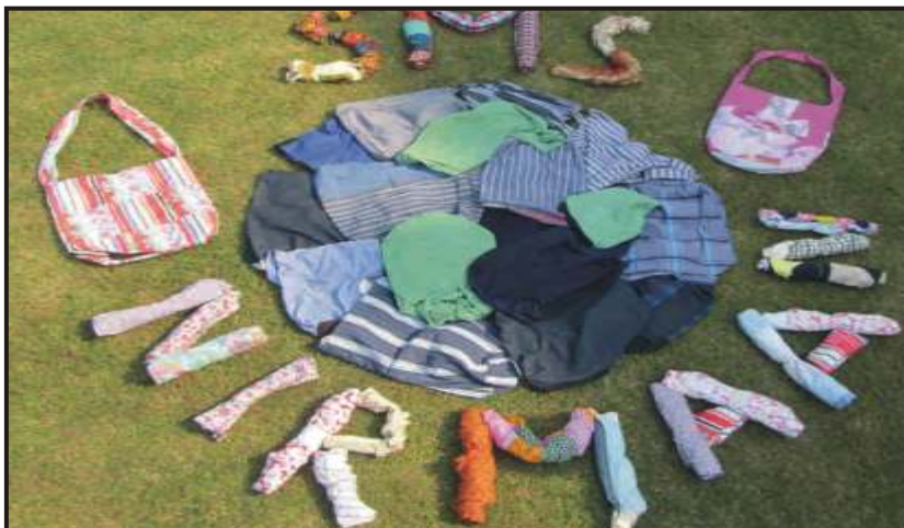
Our share in the making of the society.