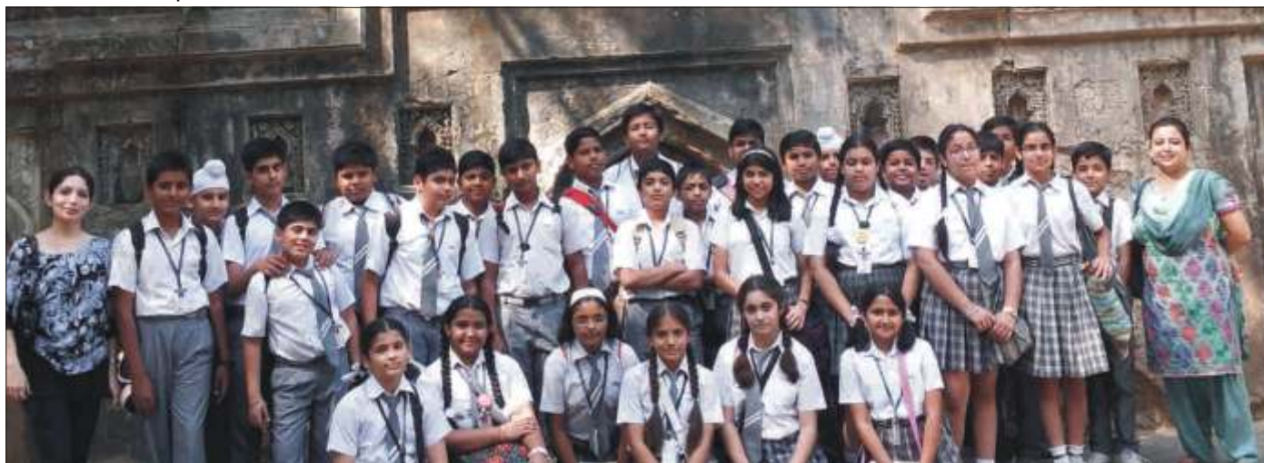
Members of Heritage Club visit Hauz Khas village