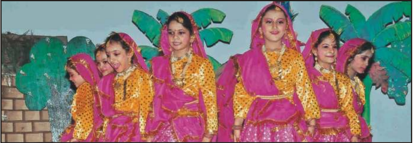
Students of Class II in their vibrant form presenting 'Ghoomar'