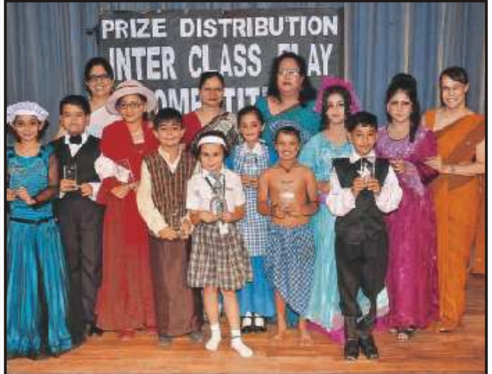
'Special Prize Winners'(Class IV) with their trophies.