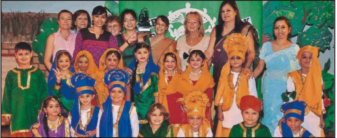
The Bhangra Fever enralls all and walks away with the winner's trophy during Inter -Class Folk Dance Competition.