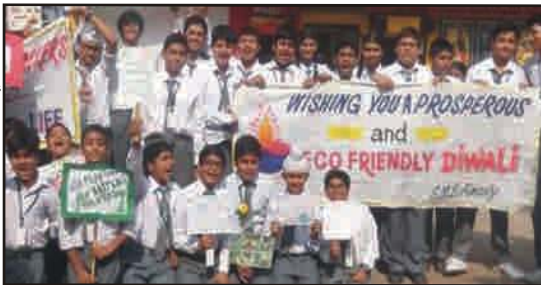
Our students creating awareness through their Anti Cracker campaign.

Earth Saviours Eco Club of our school once again spread the message of celebrating an eco-friendly and cracker free Diwali. The members made various power point presentations, which were shown to the students through Smart Class boards. They talked about the perils of bursting fire crackers and suggested the idea of celebrating Diwali online. A street play was also staged alongwith the Diwali rally in the neighbouring areas as part of the anti cracker campaign.