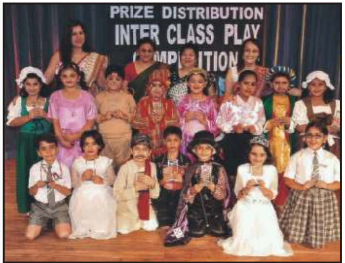
Winners of 'Best Stage Presence' class III.