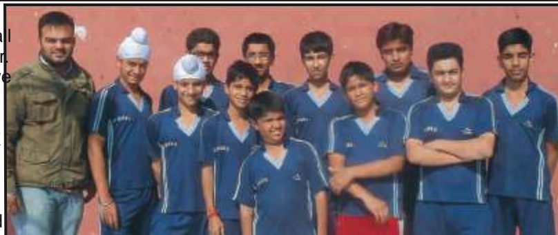
Sub Jr. Boys Volleyball Team- Runners-up at Zonal level