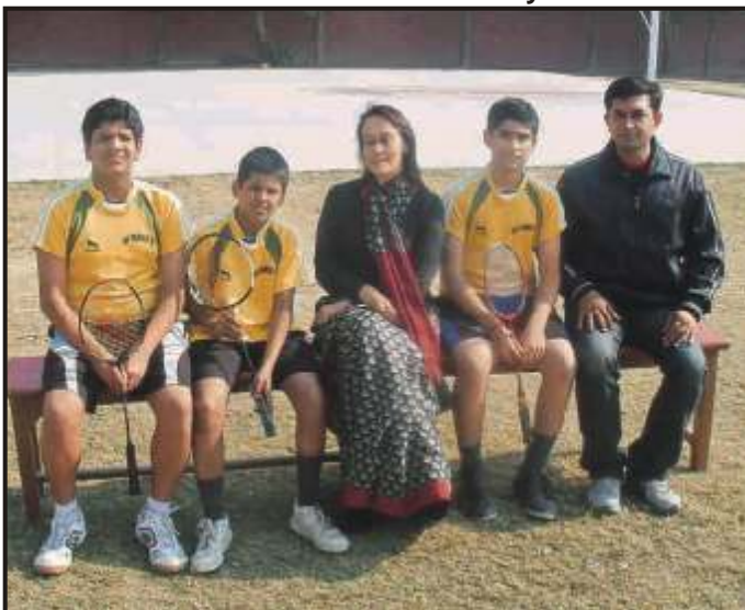
Jr. Boys- II Runners Up at Zonal Badminton Tournament.