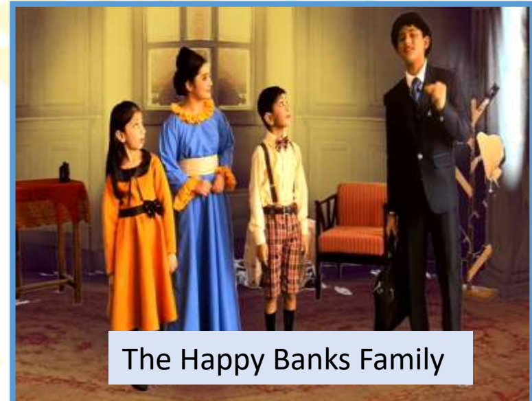
The Happy Banks Family