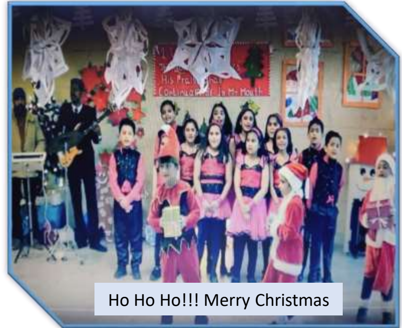
Ho Ho Ho!!! Merry Christmas

“At Christmas, play and make good cheer, for Christmas comes but once a year.” Christmas is a special time to spend with family and friends. It’s the time to offer prayers to the Lord and seek his blessings. The students of classes Nursery to 5 presented a virtual Christmas celebration on 24 th December. The show was full of enthralling performances by our little cherubim. The nativity scene, which is synonymous to Christmas, was enacted in the form of a dance drama. The vibrant choir sang Christmas carols. The children, in their bright and elaborate costumes, were a delight to watch. They danced and sang wishing happiness, love and laughter for everyone around emphasizing the true spirit of Christmas. The show was a fabulous presentation and filled the hearts of the audience with immense joy.