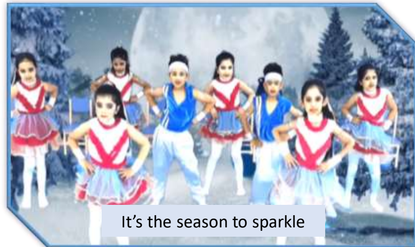
It's the season to sparkle