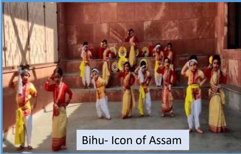
Bihu- Icon of Assam