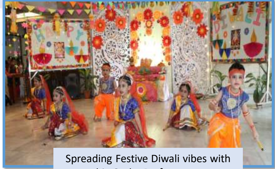
Spreading Festive Diwali vibes with this Garba Performance