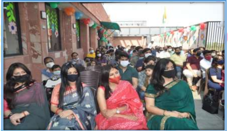
Our Principal addressing the parents during the Orientation Session for Classes Nursery and KG

In order to ensure the students' academic development, along with the school, the parents also need to be involved at every step to keep a track of the progress of their ward over the academic year. While it may not be possible for them to do so everyday, considering they would be busy with their professional lives, the school offers parent orientation programme to discuss various aspects of the students' schooling. Keeping this in mind, our school organized an orientation programme for the Kindergarten parents and students on 19 March 2022.