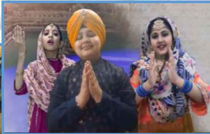
'Tu hi Nirankaar Nanak'