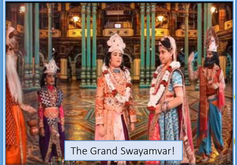
The Grand Swayamvar!