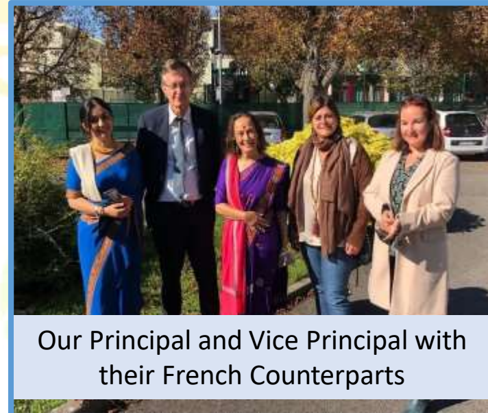
Our Principal and Vice Principal with their French Counterparts