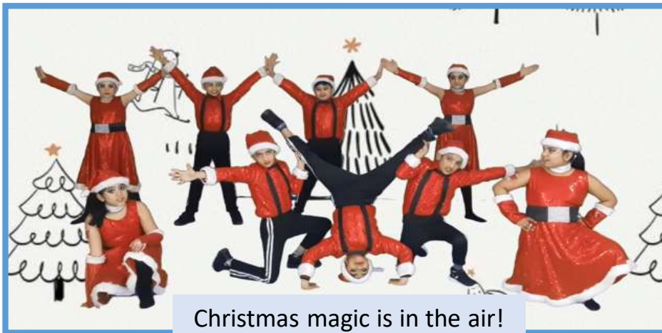
Christmas magic is in the air!