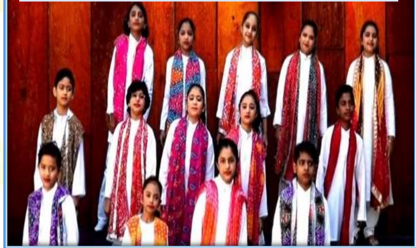
A tribute to the Nightingale of India