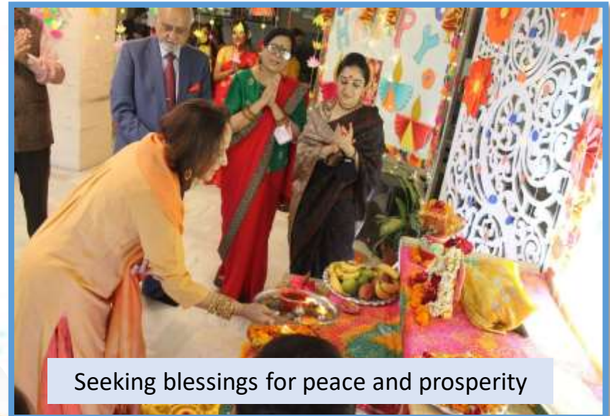
Seeking blessings for peace and prosperity