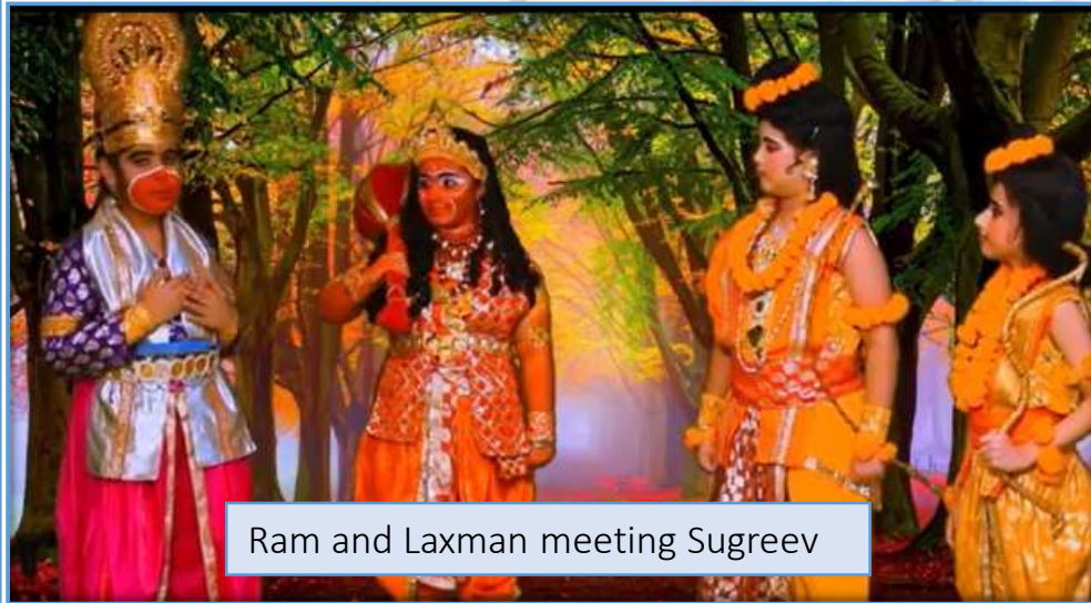
Ram and Laxman meeting Sugreev