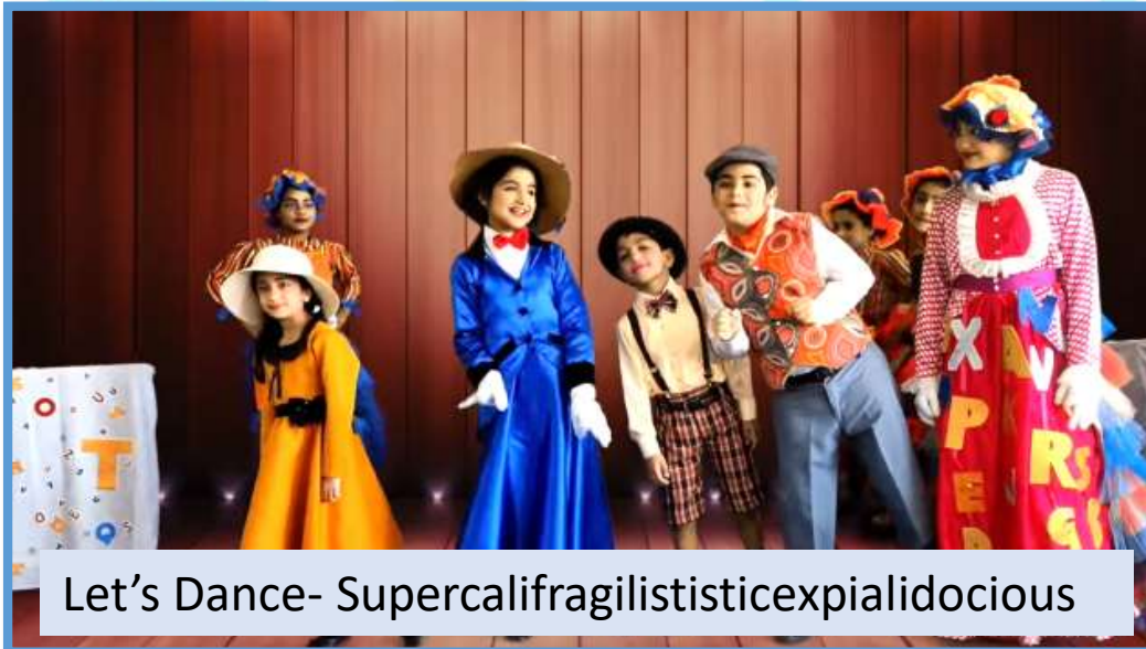
Let's Dance- Supercalifragilisticexpialidocious