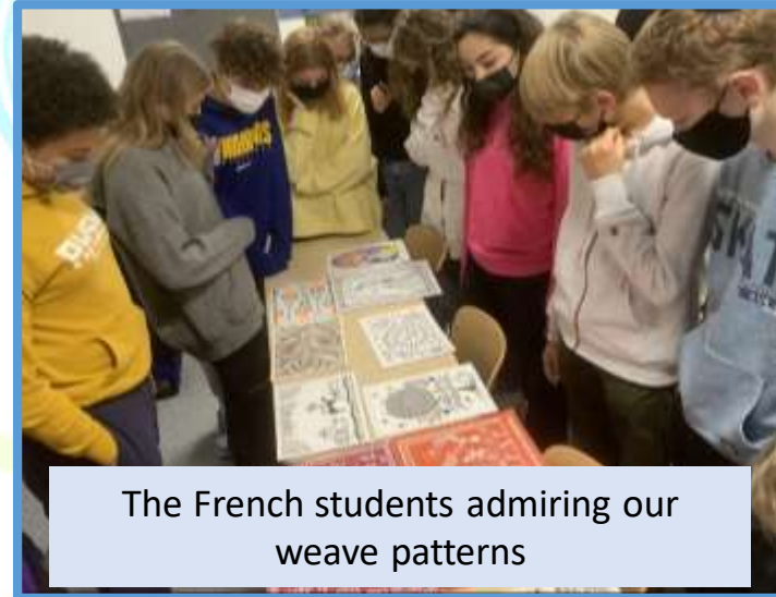
The French students admiring our weave patterns