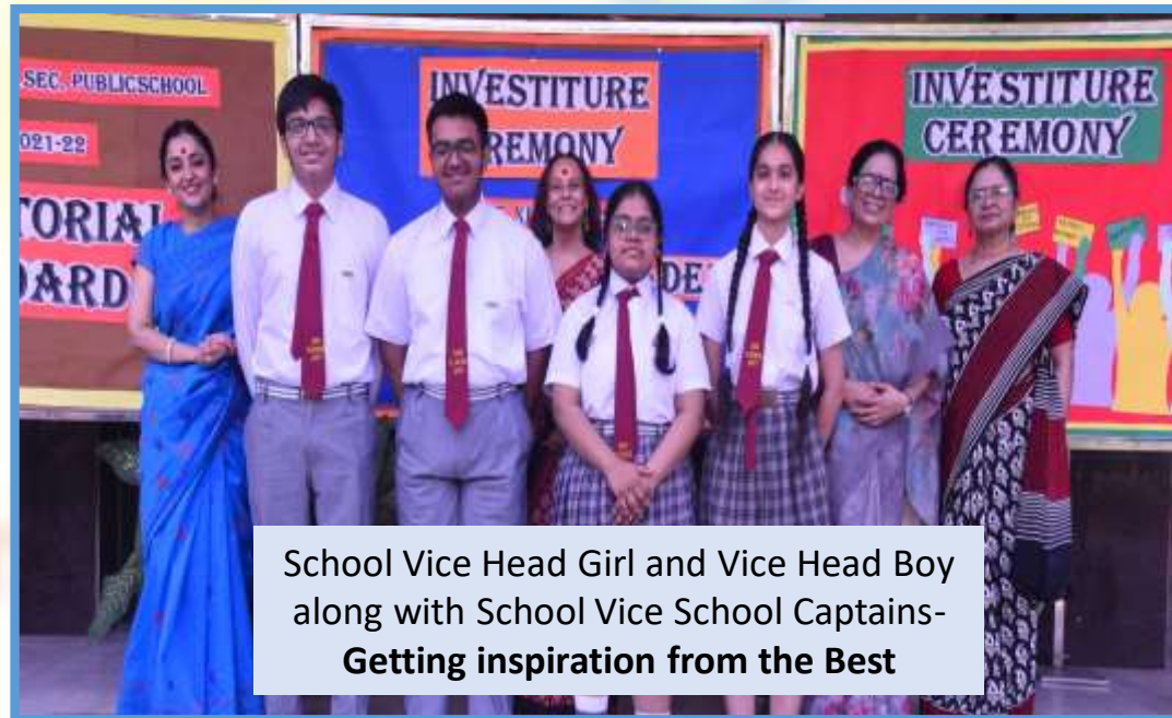
School Vice Head Girl and Vice Head Boy along with School Vice School Captains- Getting inspiration from the Best