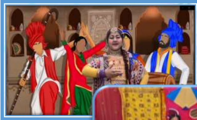
Sunder Mundriye Ho!!!

The students of Pre-Primary and Primary classes celebrated Lohri on 12 January, 2022 in the online mode with great excitement and fervour. The children narrated stories related to the festivals of Lohri, Pongal and Makar Sankranti and also highlighted their importance. They dressed up in traditional Punjabi attire and performed bhangra and giddha on the beats of dhol. The celebration embodied the spirit of brotherhood, unity, gratitude and merrymaking, generating a lot of happiness and cheer all around.