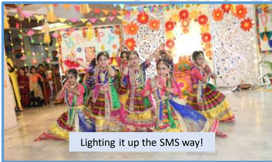
Lighting it up the SMS way!