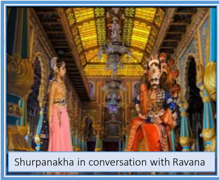
Shurpanakha in conversation with Ravana

Dussehra was celebrated online on 12th October 2021 with a lot of religious zeal and fervour. The online celebration, aptly named as Ram Gaatha , began with a dance and a message on Dussehra. The iconic scenes from Ramayana such as “Ram-Sita Swayamvar”, “Ram, Sita and Lakshman going to vanvas”, “Sita haran”, “Ram-Lakshman in Panchvati”, “Hanuman burning Lanka” were depicted through a musical play presented by the students of classes 4 and 5. Dances were also performed to introduce Lord Ram, Devi Sita and Ravana. Our Principal congratulated all the participants for putting up a spectacular show. She blessed the students while inspiring them to follow the path of truth.