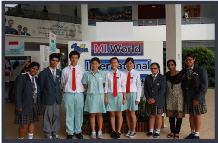
The partaking schools

St. Mark's Senior Secondary Public School, Meera Bagh, New Delhi, India