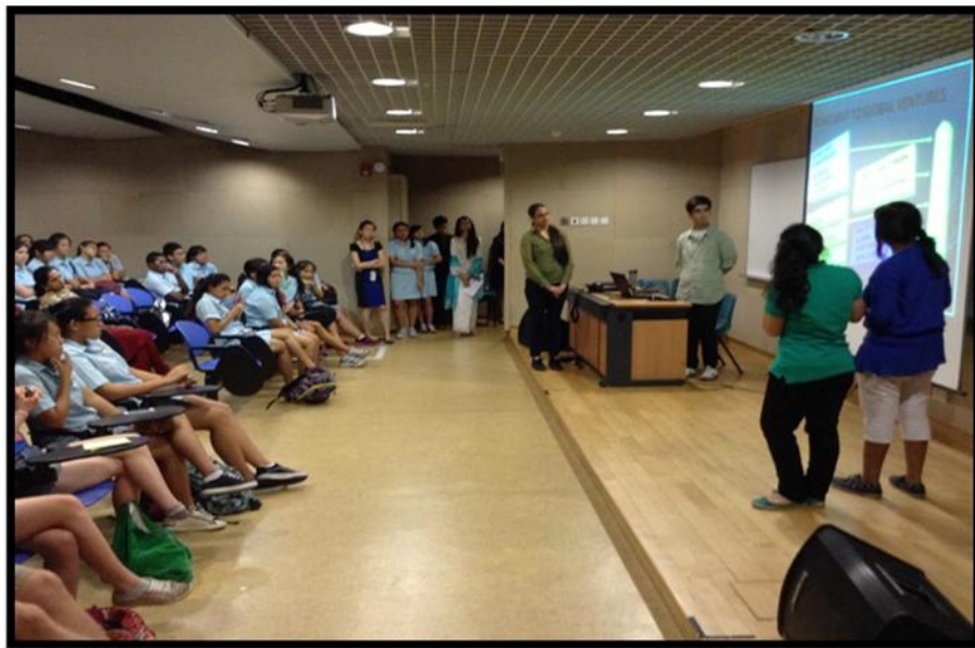
Presentation of our school in process

This was a long day for us. We went to the school in morning and became a part of MI's daily classes. It was a special day since it was MI International Friendship Day. Schools from all countries gave a presentation on their city and school. Then came the fun part. The school had organized NE Amazing Race for us. We were divided into different teams and were given clues and tasks which led us to various destinations in Singapore. It was a good combination of fun and exploration. At last we came to our final destination Lau Pa Sat where we enjoyed food from different cuisines.