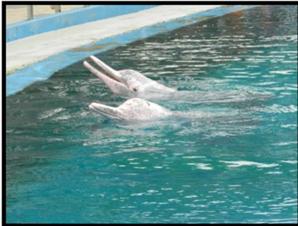
The amazing dolphin show

Since it was a holiday in school, we went with our teacher to the sentosa. We saw an amazing dolphin show and also went through a 3 stage 4D experience where we played a game, saw a movie and then went on a ride, all in 4D! We were fortunate enough to see the Underwater World and the beautiful marine life. Then, we also took a ride in the Singapore flyer and the experience was enthralling.