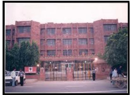
The main view of St. Mark's

The students of SMS are trained to handle curricular and co-curricular activities simultaneously. Care is taken to instill self discipline in their receptive minds. They are being schooled to become responsible leaders with a commitment to society.