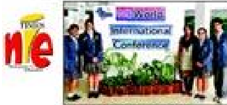
St Mark's Sr Sec Public School