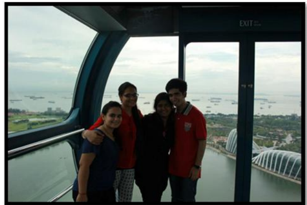
Inside the Flyer