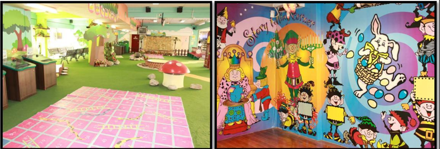
Inside the Princess Elizabeth Primary School

We had a learning journey on this day. We went to the school in morning in our school attire and we were taken to the Princess Elizabeth Primary School where the little children took us for a tour in their school. We were overjoyed to see the colorful walls and the children learning in a unique way. We came back to MI for lunch and then prepared for The Institute Day. Our host buddies taught us the steps for their dance performance. After that we were taken for the football girls' semi-final match between MI and MJC in Jalan Besar Stadium. We cheered for the MI girls with our full zest and zeal but we couldn't witness the entire match as it started raining and the match was delayed.