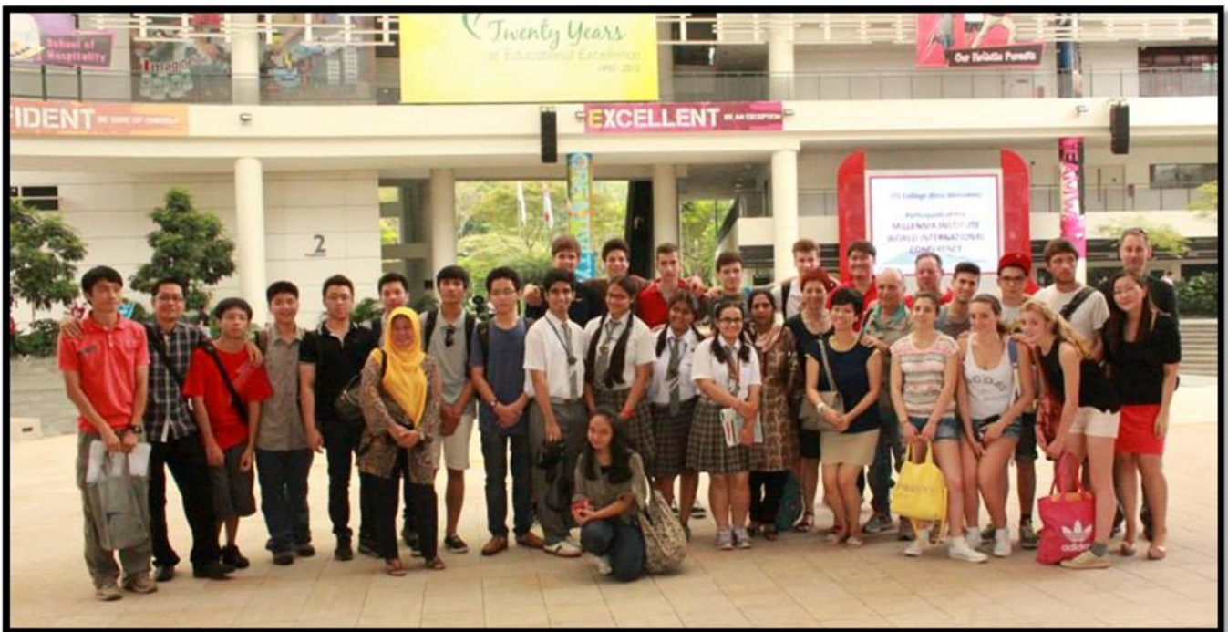
Everyone at ITE West

The day started with the exchange students visiting the ITE WEST College where we came across the diverse courses that are taught there from Instrumental Music to Hotel Management and many others like Art and Dances. Then, we all had a dance practice session wherein all the exchange students along with our hosts practiced a dance Routine which was a collaborated dance piece that included Indian, Chinese and Malaya dance steps.