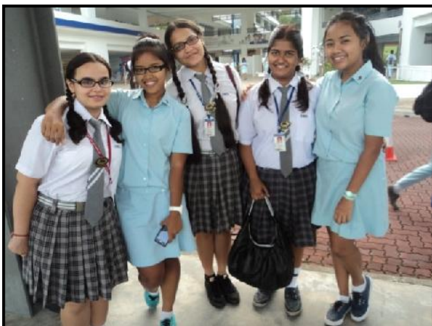
At the Millennia Institute with our hosts

We then enjoyed the school tour they had organized for us. It was amazing to see their beautiful and huge campus. The amazing art works of the children displayed in the entire school attracted everyone. We got the privilege of attending the classes with our hosts which was altogether a different experience. We also set up our cultural booth that day. Later, we had rehearsals for our performance at the Welcome Dinner. After that we left for home with our host buddies.