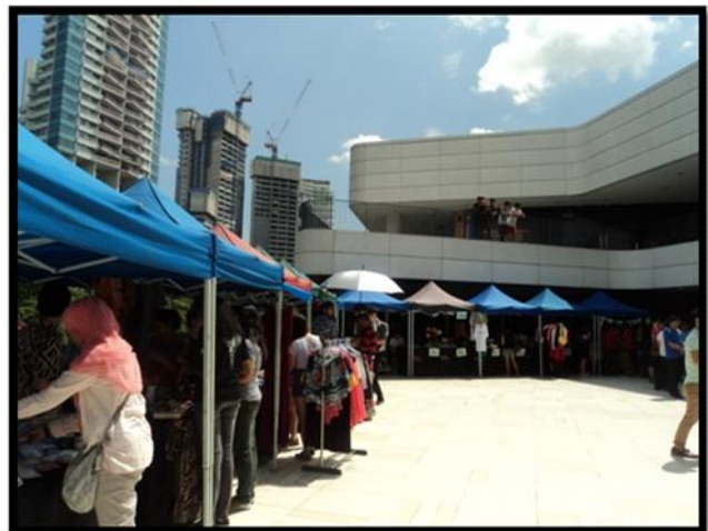
Various stalls set up by different participating countries