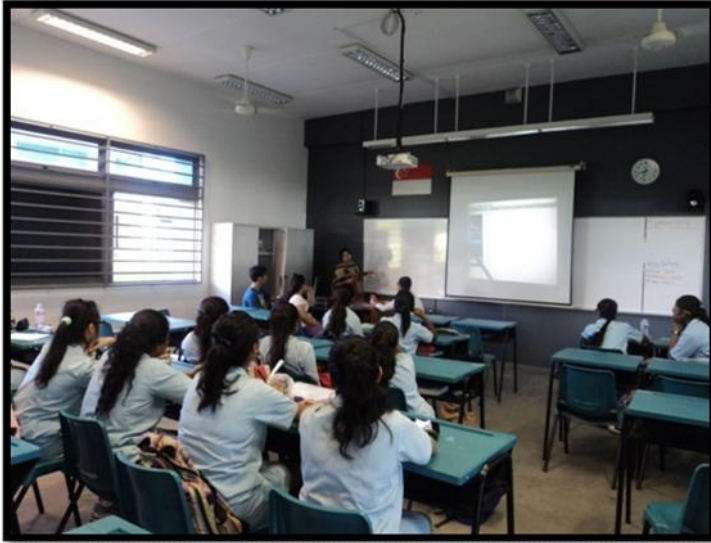
The ongoing language workshop