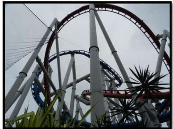
The giant rollercoaster at the Universal Studios