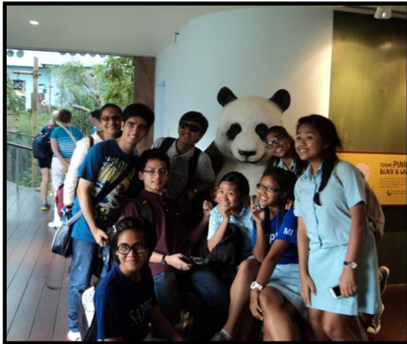
At the Singapore Zoo

a river themed zoo. Though we couldn't take the boat ride because of the rain, we had a good time as we saw two giant pandas along with several other animals and we also saw an animal show.