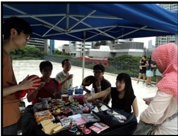
At the stall set up by Korean students