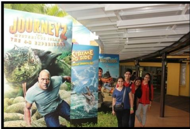
The 4-D Experience