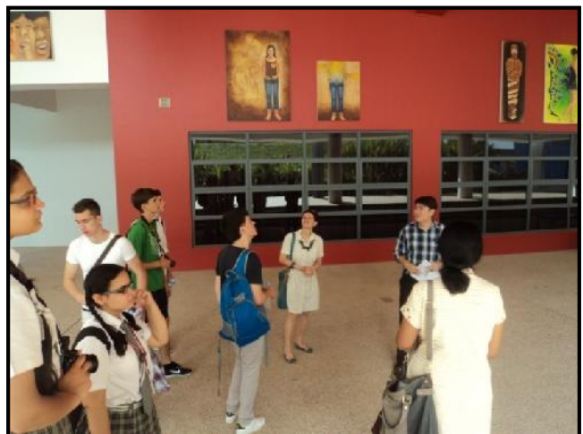
A tour around the campus of MI