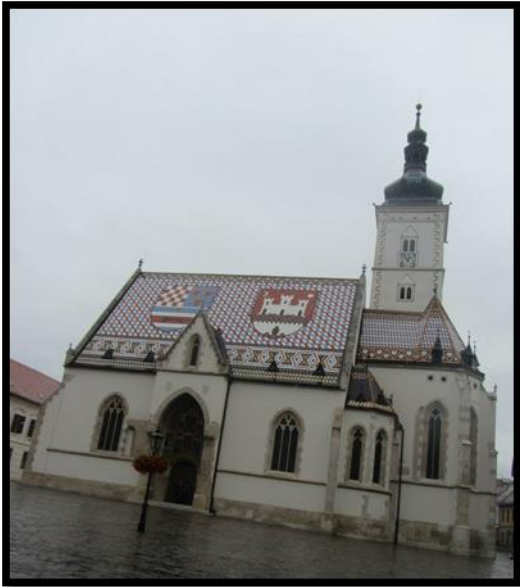
Church of St. Mark, Zagreb

On Day 9, we had a guided tour to the city of Zagreb, capital of the Republic of Croatia. We travelled there in a bus along with our host buddies. It was raining and was fun to walk in the streets of the city with umbrellas. We had some local sightseeing followed by loads of shopping. We are glad that we explored not just Slovenia but the neighboring countries as well. We reached Ptuj at 6:00 in the evening and spent rest of the time with our host families.