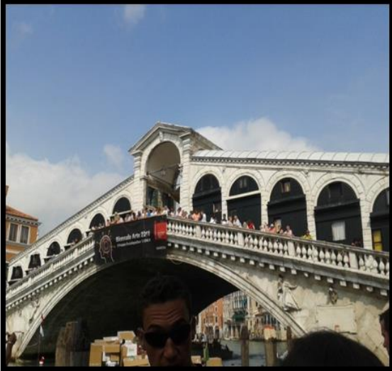
The Rialto Bridge