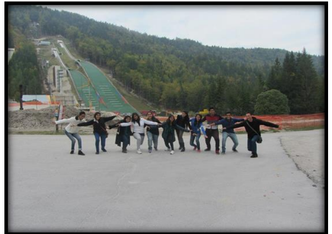
Feeling the chilly winds at the Vrsic Mountain Pass