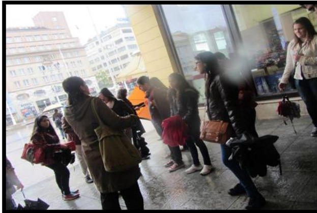
Down The Streets