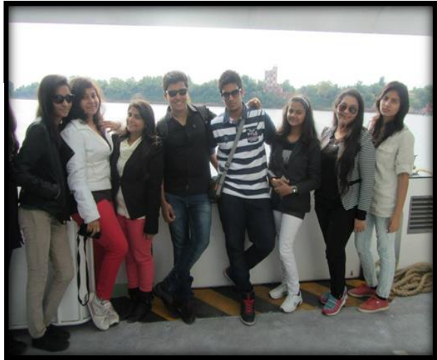
Going to Venice by a ferry

Venice is one of the world's most beautiful cities and a dream destination for everyone. It was our dream that came true. We reached Venice by a ferry and saw various tourist attractions such as St. Mark's Basilica, the Grand Canal, the Piazza San Marco Doge's Palace and the Rialto Bridge. We even went for a Gondola ride and enjoyed a lot. Eating pizzas, ice creams and the shopping made Venice even more special for us.