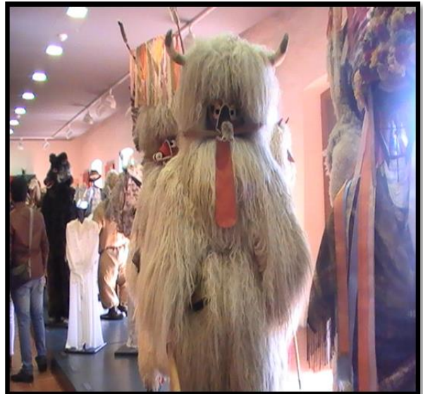
Inside the Castle