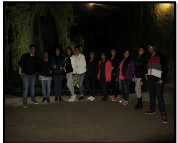
Inside the caves

The Skocjan caves are a unique natural wonder, the creation of Reka River. The Skocjan Caves remain the only monument in Slovenia and the classical Karst region on UNESCO'S list of natural and cultural world heritage. One of the most beautiful experiences was offered walking inside and exploring the caves. It was truly an example of natural beauty with great aesthetic value. We had some awstrucking moments. Although we had to walk a long way back ,we enjoyed through the green meadows and ,of course, the rain droplets.