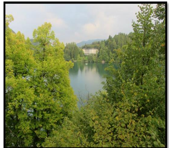
A splendid view from the top