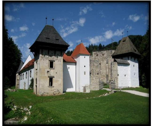
The Zice Monastery

Sometimes we come to a place that simply astonishes us. When we look around we have a feeling that time has stopped and that we have entered another world, an unforgettable dimension. Such feelings can be experienced when entering the mysterious world behind the walls of Zice Monastery. During our visit we were provided with headphones which had pre-recorded information regarding the monastery. We not only enjoyed our visit there but also captured beautiful pictures of the monastery with our Slovenian friends.