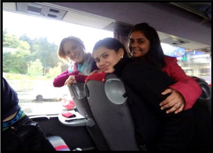
Spending time with our Slovenian friends in the bus