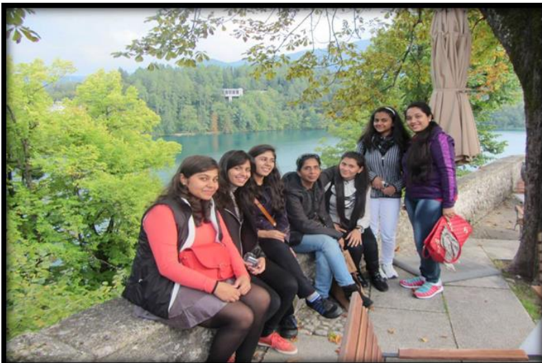
It's picture time!