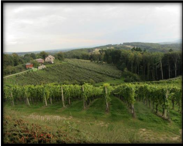
The magnificent vineyard