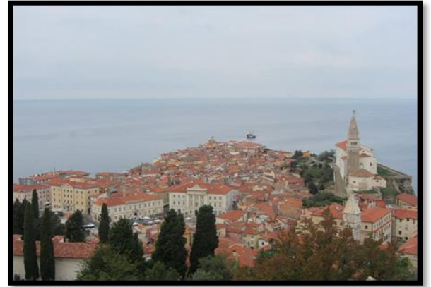
The entire view of Piran

On last day of our mini tour we went to Piran, the oldest town in the country. We had a look of the whole town through a telescope on the roof of a castle and then walked to the tip of the town. The glimpse over an old market was wonderful. We even met a man who was a big fan of Pandit Ravi Shankar and Ustaaad Zakir Hussain. Though it was a small town it gave us numerous memories.