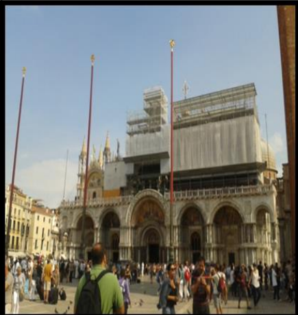
St. Marks Basilica