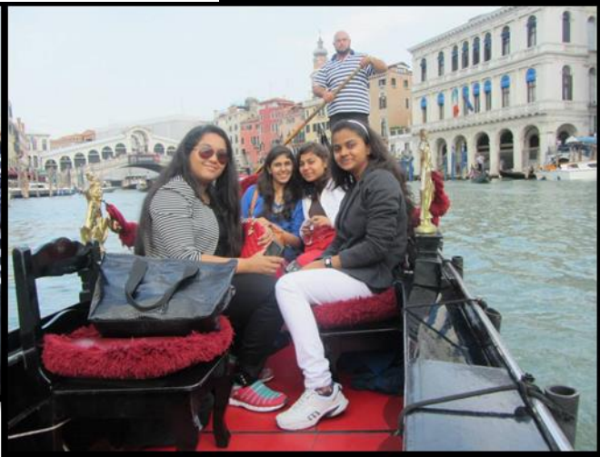
The famous Gondola ride!