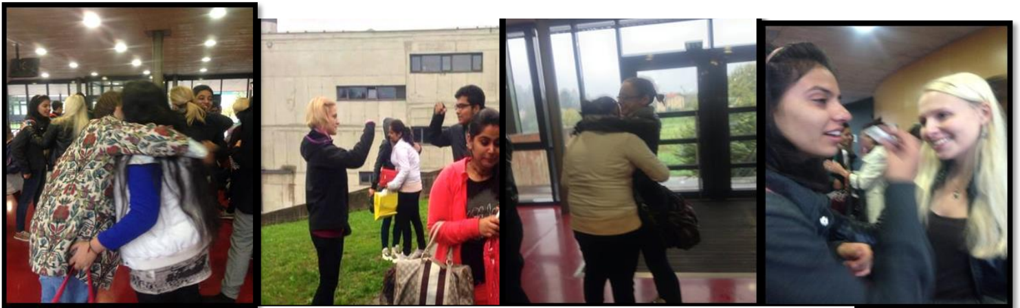
The hugs, kisses and tears

Finally it was time to say goodbye to our friends and their families. They were emotional moments. In a short while, we had got so attached to them. We had formed an everlasting bond with the families. Everybody was reluctant to leave. Our Slovenian friends will stay forever in our hearts and will be thoroughly missed.