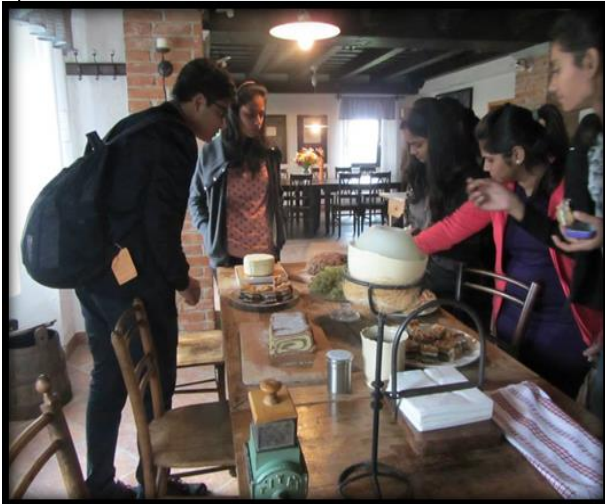
Tasting the Slovenian snacks