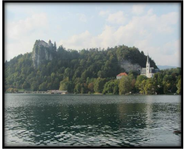
The beautiful Lake Bled

Slovenia has only one island which reigns in the middle of the lake Bled which has the emerald-green water sparkling in the sunshine. It is just like something that one sees in a storybook landscape, a lush little island with a church spire peeking out over the greenery, snow covered Alps beyond and, on one shore, a steep cliff atop which looms a formidable castle. It was a heavenly feeling to take a trip across the lake in the traditional Pletna boat and relax in the atmosphere.