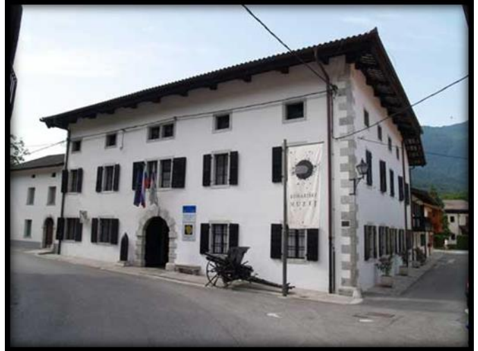
The Kobarid Museum

The world war museum was the most exciting part of the trip. We got to see so many things of the history like the weapons used by the soldiers, their clothes and even the things they used in their day to day life. We also got to know the story of a soldier who had half face who got married and gave birth to a boy. His son wrote a book on his father 'My father without a face'. It was a learning experience for all of us.