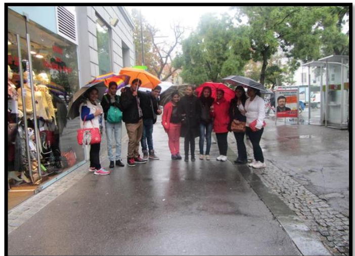
Going around the town in rain

After saying the final goodbye to our hosts and their families we left for Graz in Austria. We had sightseeing in Graz. We saw the Opera house, Town hall and other major parts of the city. Unfortunately, it was raining so we couldn't visit the castle. We did a lot of shopping in Graz and after lunch we headed towards Graz International Airport.