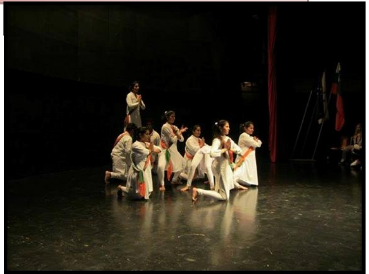
Performing on " JAI HO "