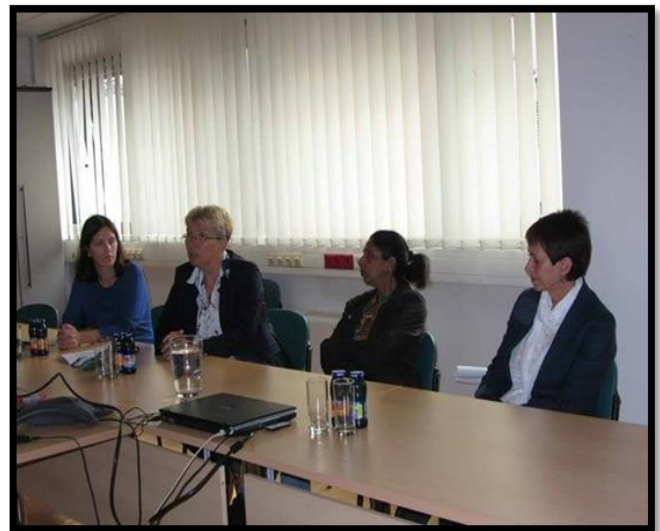
During the meeting at UNESCO office