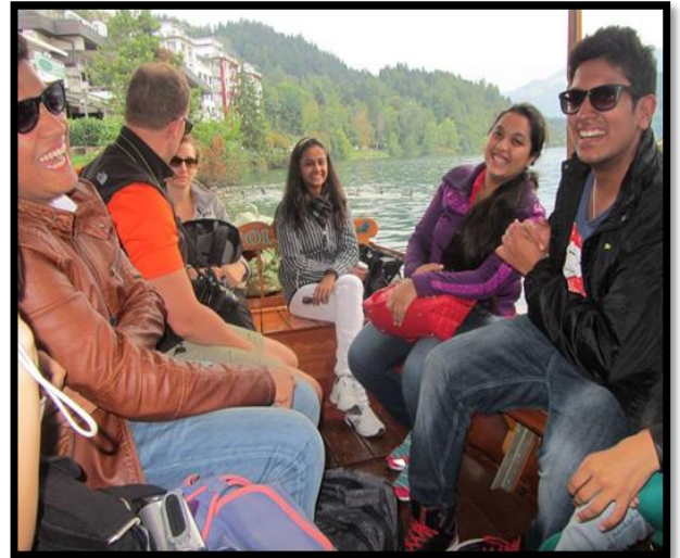
Enjoying the Pletna ride