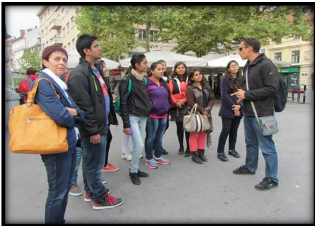
Knowing more about the city from our guide

We went to Ljubljana on the first day of our mini tour in the country. Ljubljana is the capital of Slovenia. It was the main attraction for conquerors like ROMANS and NAPOLEON. One could see the remains of world war and the devastating effect they had on the city. The city was renovated when a serious earthquake took place. The architecture is same to that of Venetian buildings.