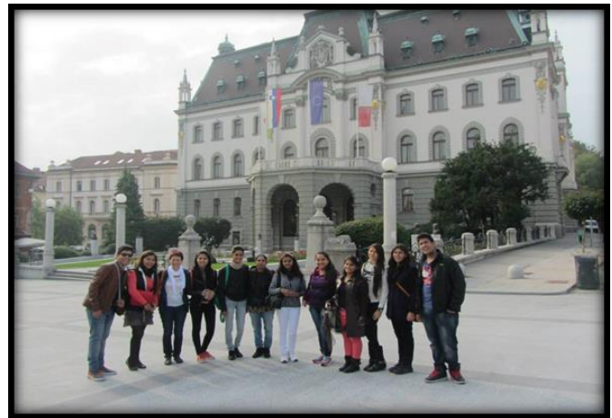
At the University of Ljubljana