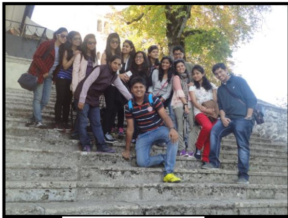
Enjoying in BLED

After visiting the enchanting lake Bled yesterday, we all took a small toy train ride which went through the beautiful streets of Bled, letting the visitors witness its beauty from each and every angle. It was a magical place with a breathtaking view of Lake Bled. Afterwards, we all headed for the capital Ljubljana, where we had lunch in an Indian restaurant. We really enjoyed the delicious Indian food and visited nearby markets.