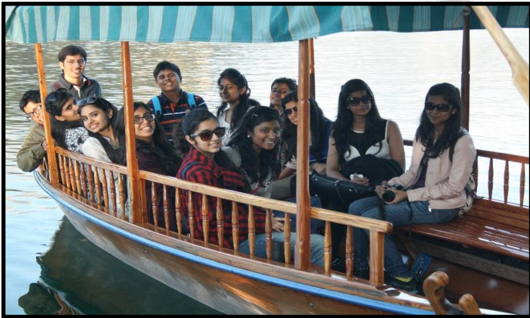
Enjoying the Pletna Boat Ride at Lake Bled

After a one day trip to Venice, it was now time for us to leave for Slovenia with lots of happy memories of Venice. Early in the morning after having breakfast we got ready to leave for Bled. After a drive of around 3.5 hours, we reached Bled. The hotel we stayed in was just opposite Lake Bled. In the afternoon, after having some rest we went over to explore the nearby places. First, we went to the Lake Bled Island by a boat. The scenic beauty of Lake Bled was overwhelming. The view of The Bled Castle from Lake Bled was a view to cherish.