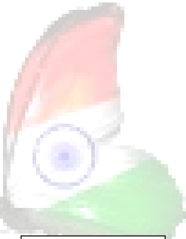
It's Bhangra time!