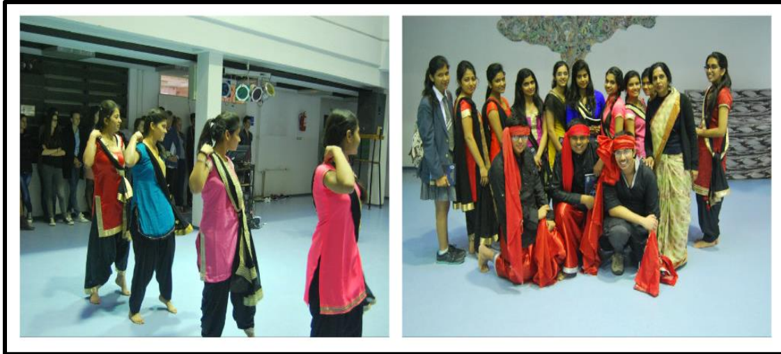
Get, Set, Bhangra!

We performed Bhangra at Batthyany Lajos Gimnazium. Our performance was watched by a huge audience and it was appreciated and applauded by everyone.