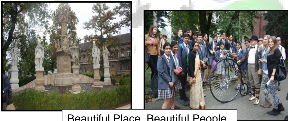
Beautiful Place, Beautiful People

We also went for a Nagykanizsa city tour. Later we also experienced aerobics at the dance class