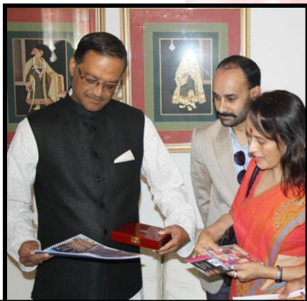
A formal exchange of Mementos.