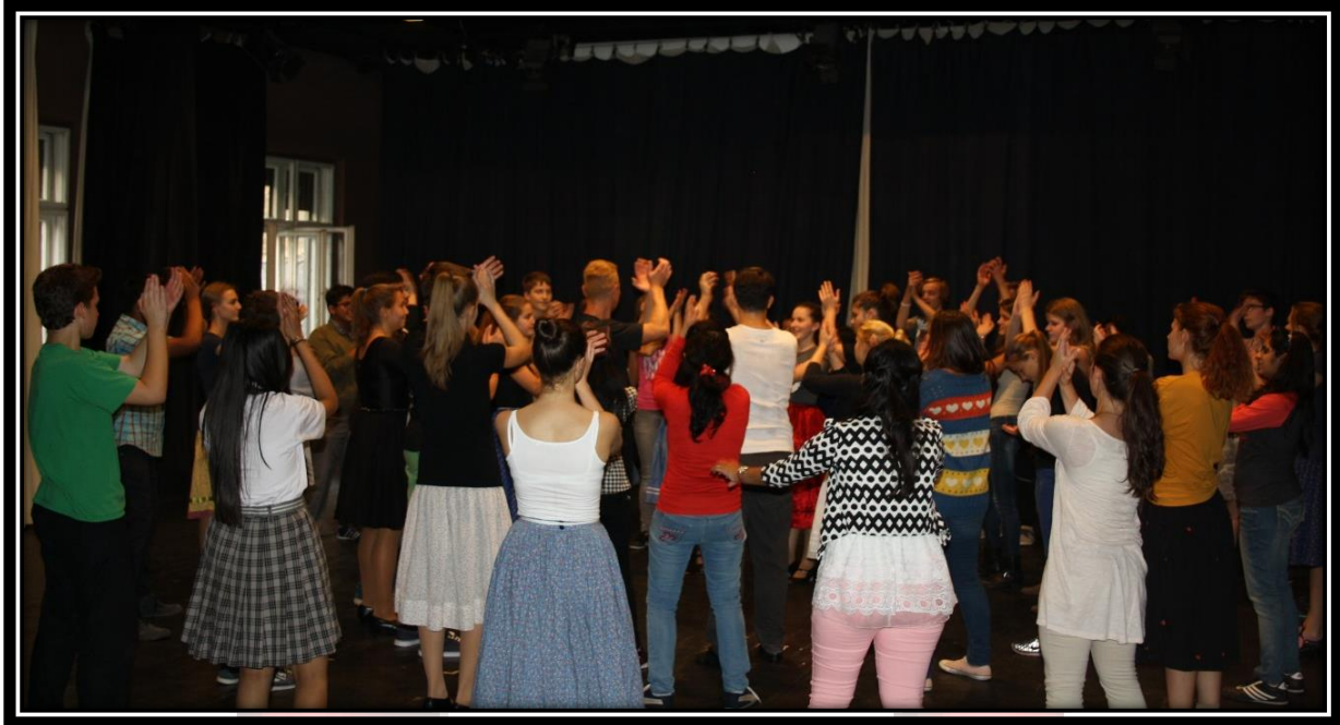
Dancing to all the glory, enjoying to the fullest, at the Hungarian Dance Workshop!