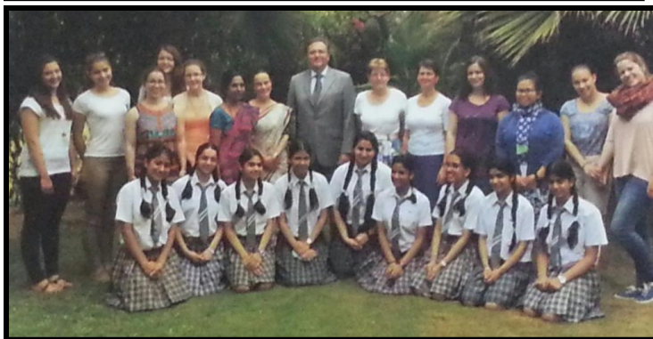
Delegates from Hungary with our Principal and the Hungarian Ambassador.