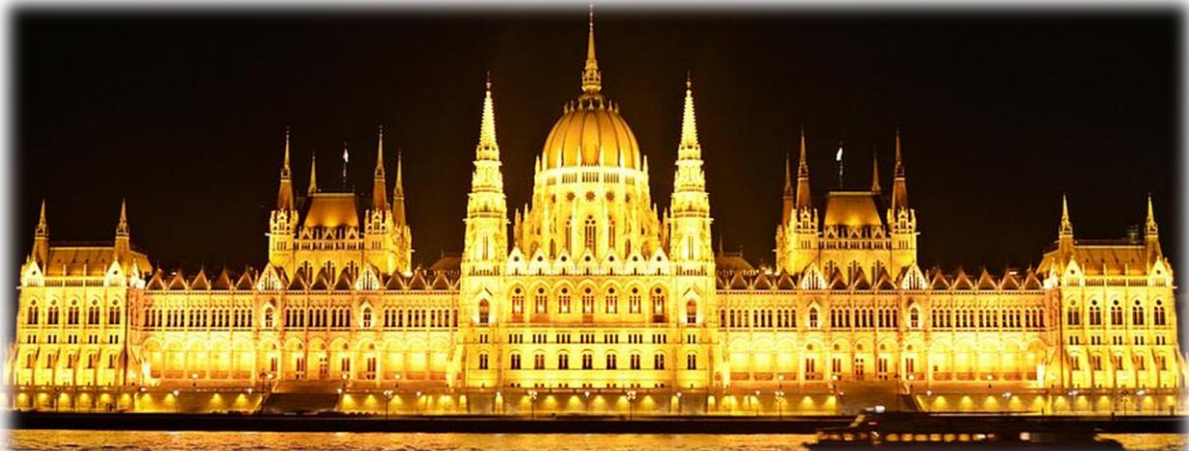
HUNGARIAN PARLIAMENT— NIGHT VIEW FROM THE CRUISE

Sometimes we visit some places which makes us feel that ,”is it something true - so beautiful.” Some wonderful feelings like this arose when we entered this enormous and beautiful Hungarian parliament. During our visit we were given a guide, who gave us the information about the parliament. We not only enjoyed our visit there but also captured beautiful pictures.