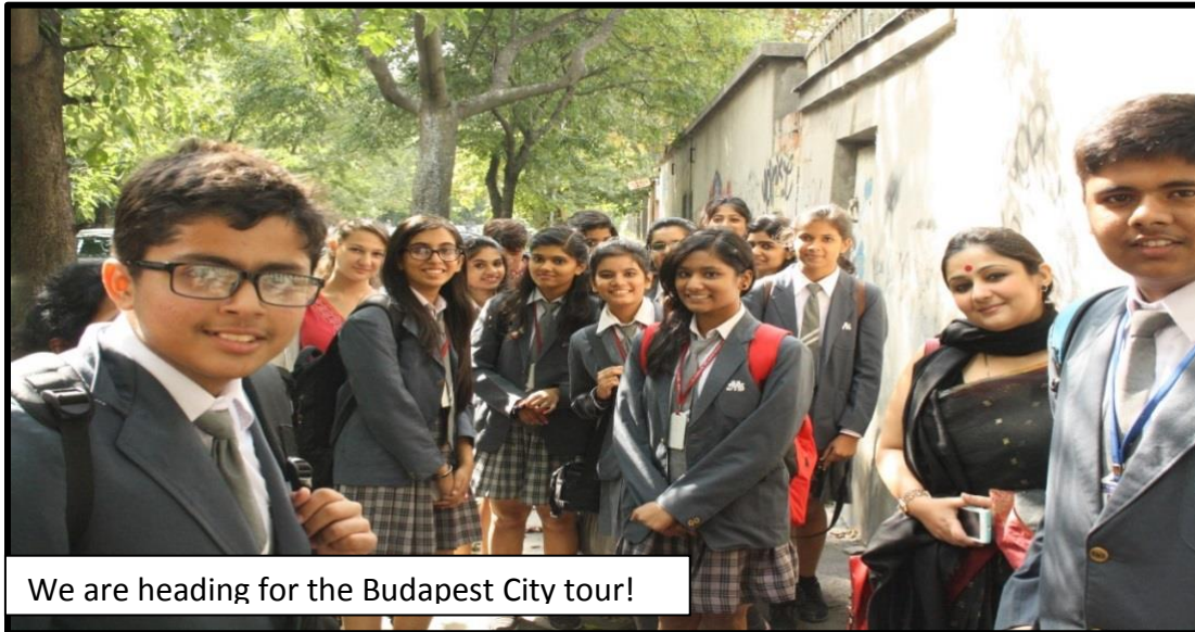
We are heading for the Budapest City tour!

In the unforgettable city tour, we witnessed the beautiful Heroes' Square, The Opera House, St. Stephen's Basilica. We also attended an amazing Hungarian dance workshop and then at night, the heavenly Danube Cruise.