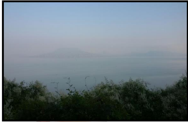
Lake Balaton : MORNING VIEW..

In the morning, at about 7:00 a.m we all assembled at the bus stop and left for the splendid view of Lake Balaton which is the largest lake of Central Europe and is considered as one of the Hungary's most precious treasures.