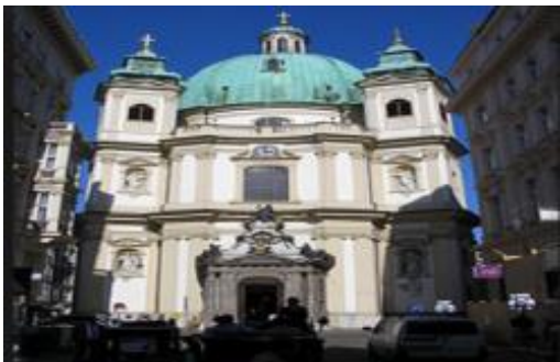
ST. PETER'S CHURCH