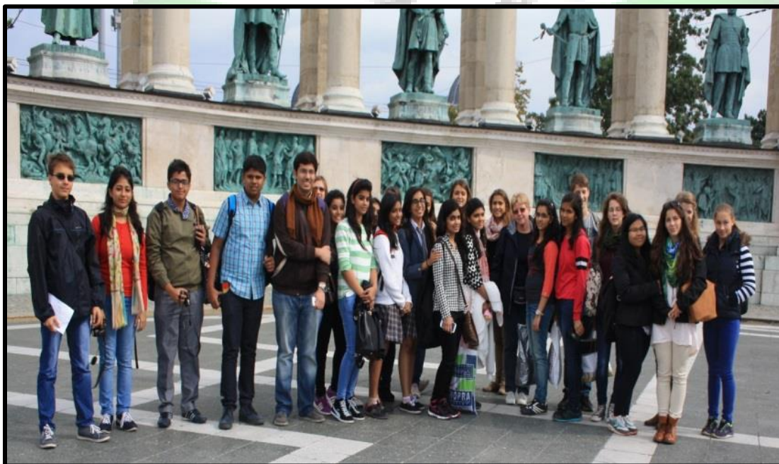
Picture time at the Heroes' Square