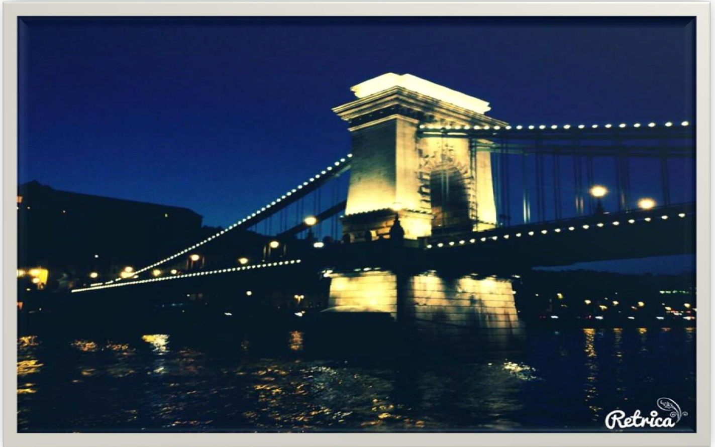
The most beautiful and the oldest – The Chain Bridge