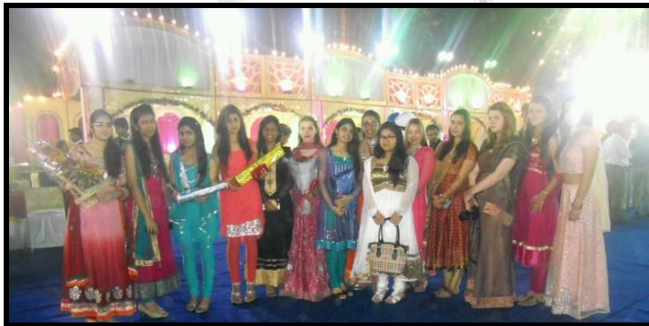
Enjoying at a wedding with our Hungarian friends.