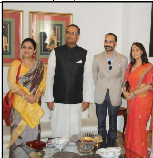
At the Ambassador's Place