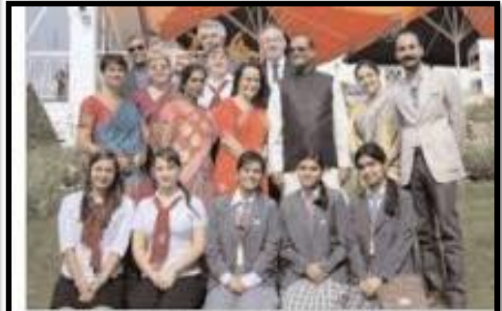
Students of St Mark's, Meera Bagh, visited Hungary.

GD SALWAN Public School has initiated a number of activities over a month for the Swachh Bharat Abhiyan. The school launched the campaign on October 1, with a solemn