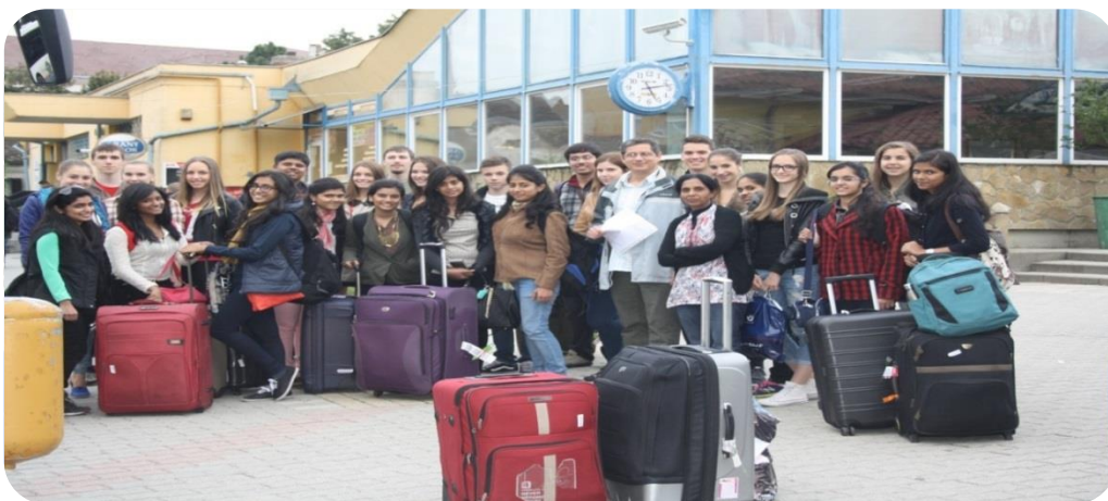
Meeting our new hosts in Nagykanizsa .....

It was around 3-4 hours' drive from Budapest to Nagykanizsa . Everyone was excited at the same time as we were going to meet our new hosts. We finally reached Nagykanizsa, and saw our hosts and host families eagerly waiting for us . They gave us a warm welcome and then we went to our new homes with the new hosts and their families