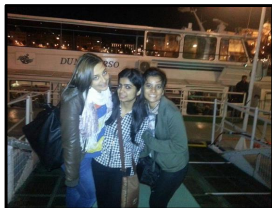
Everyone enjoying the pleasant weather and the beauty of 'Duna'.