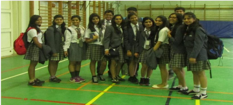
Its picture time in Szent Istevan Gimnazium