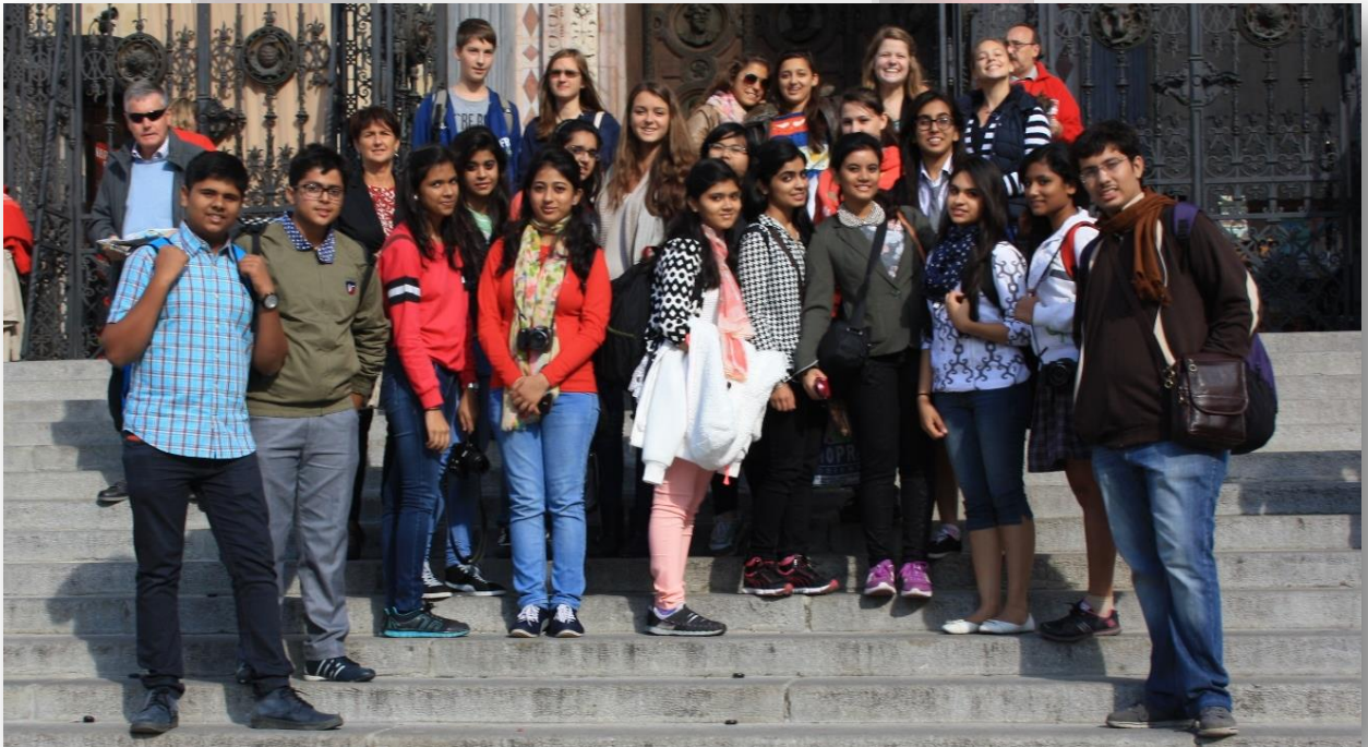
Outside the enormous St. Stephen's Basilica..