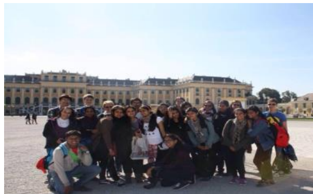
AT SCHONBRUNN PALACE...