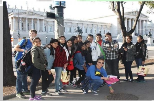
ENJOYING @ VIENNA!!!