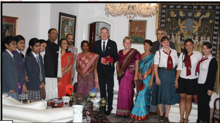
A group picture with the Ambassador