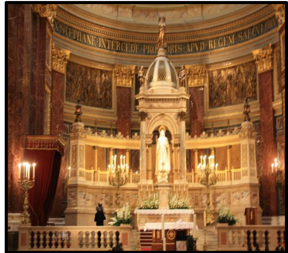
The magnificent Heroes' Square and St. Stephen's Basilica.