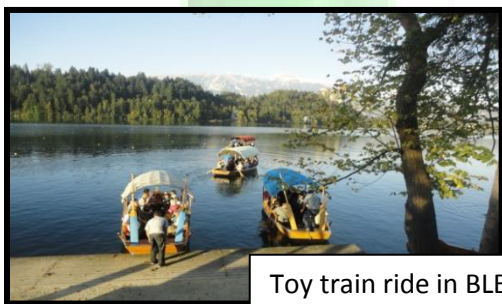
Toy train ride in BLED..