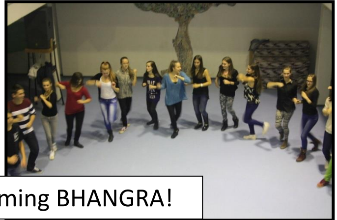
Hungarians performing BHANGRA!