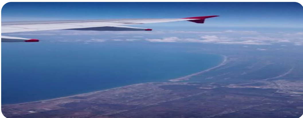
LANDING AT HONGKONG...!!!