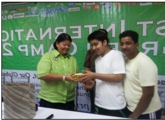
EXCHANGE OF MOMENTOS WITH MAYOR