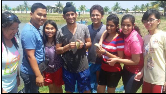
FUN WHILE FISHING!!!

The day started with a discussion at dining hall about the day ahead. We all divided our groups into three teams for the three major activities of the day. One of the team went for fishing competition where we had to catch fishes bare handed! The second team got involved in survival vest