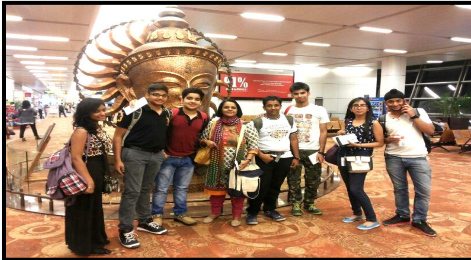
AT INDIRA GANDHI INTERNATIONAL AIRPORT