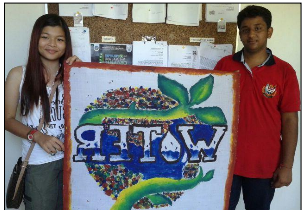
FUN WITH COLOURS...!