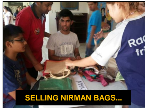
SELLING NIRMAN BAGS...

Mother Earth. After all this ended, we presented our school's initiatives like goonj and nirman enterprise. We also put up a stall and tried to sell nirman bags.