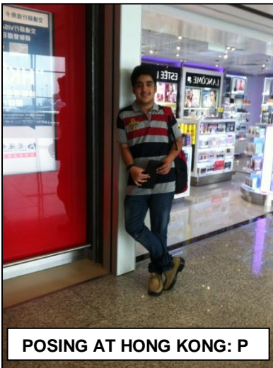
POSING AT HONG KONG: P

This was the last morning in Dagupan city, we got up early this morning at around 3:30...We got ready and boarded the buses for a 3 hour journey to Clark international. We reached Clarke international airport and bade farewell to our teacher escorts at Philippines .We entered the