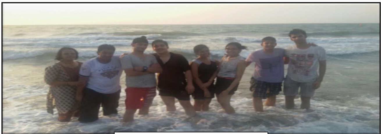
ENJOYING AT THE BEACH...!!!

After a 2hr journey we reached the Clark international airport, Philippines. Then we met our teacher co-ordinators who accompanied us in the 3hr road trip to Dagupan. We halted for lunch at a local eatery where we saw live fishes being killed, cooked and served. It was a new experience for all of us...Then we reached our cottage and went to our rooms, rested for a while and went to a beach nearby. We had a refreshing dip in the sea waters and had fun.