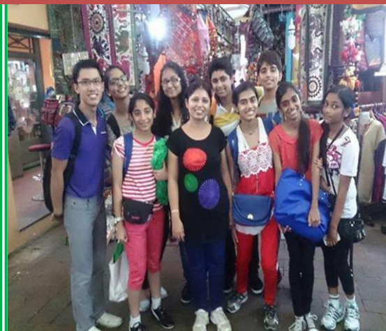
AT LITTLE INDIA