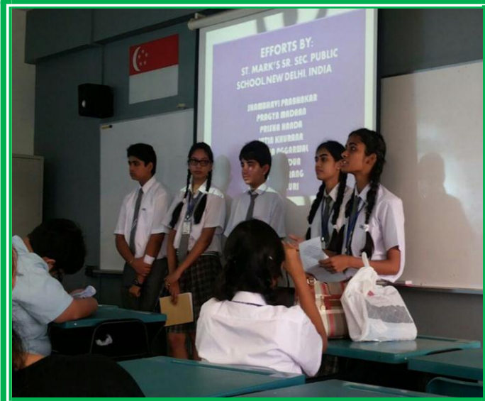
OPEN HOUSE DISCUSSION AT THE INSTITUTE

The day started with a drizzle. We all met in the school where we were ready to present our Power point presentation for which we had been preparing for the past few days. The presentation was about Indian economy and its aspects. There was an open house discussion with the students where we talked about the relations between the two countries.