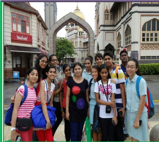
AT THE FAMOUS KAMPONG GLAM

After the lessons, we went to the Capital mall for shopping and had delicious Indian lunch. Since MI was also hosting German students, we all went together to visit the historical monument Kampong Glam and Little India. Later we went to the famous market 'Bugis Street'.