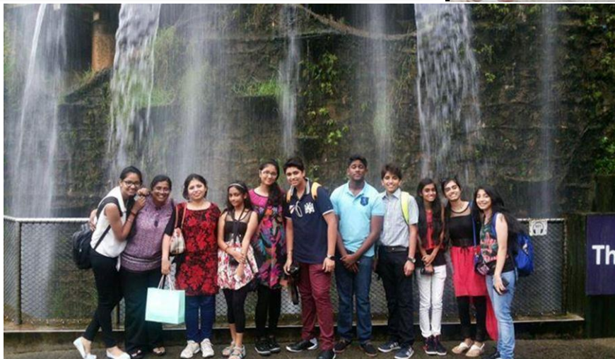
AT THE MARINA BAY AND GARDENS BY THE BAY...