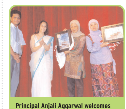
Indonesian teachers from Al Azhar