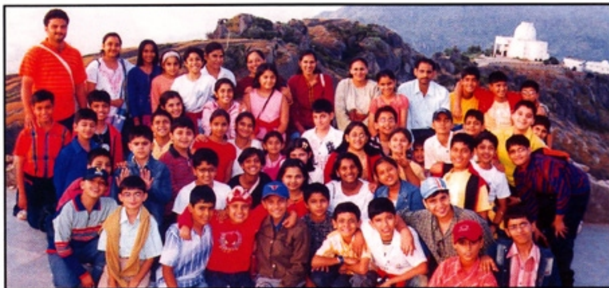
'Fun and frolic' at Mt. Abu