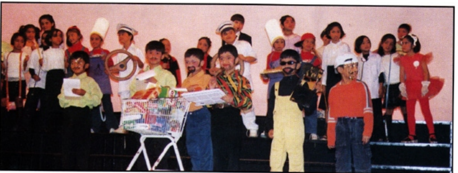
Stepping into their parents' shoes, the little ones present 'Mummies and Daddies'