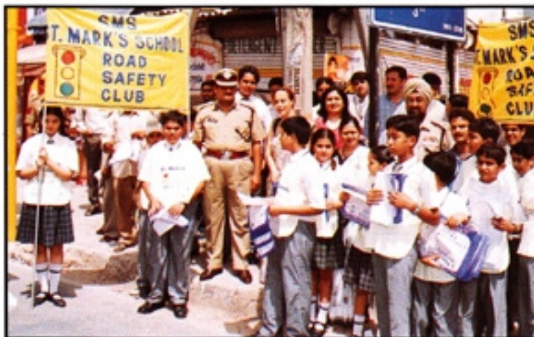
Road Safety Club members take their message to the masses