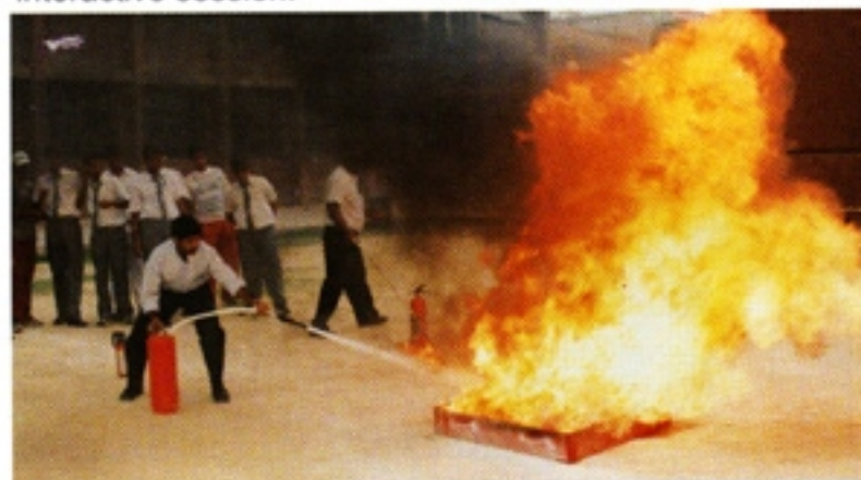
'Situation under control'- the Fire Safety Workshop