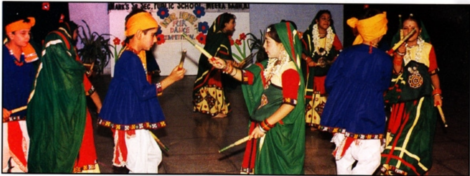
At the Inter House Competition our young dancers dance to the 'Dandiya beats'