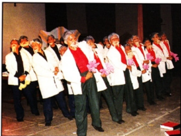
Our scientists at work charm the audience with their song and dance