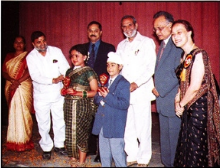
All rounders of the Junior Section receive their proficiency prizes