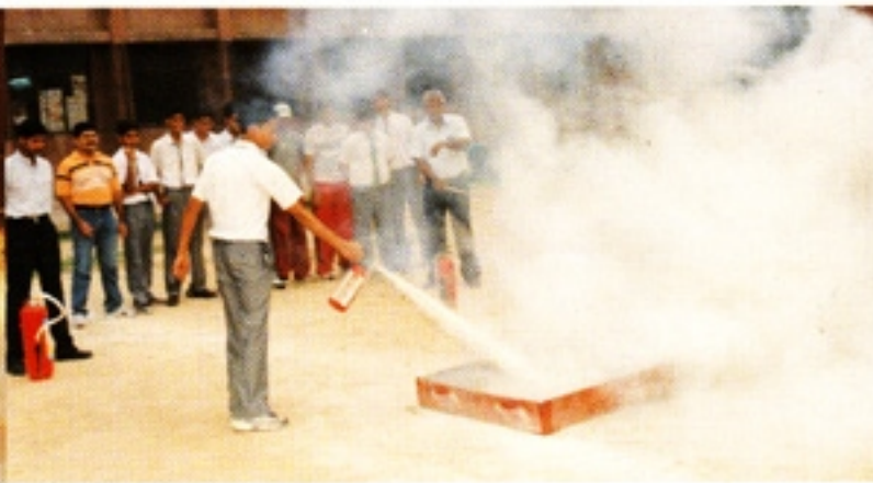
We live upto the traditions of the educational norms- Fire Safety Workshop