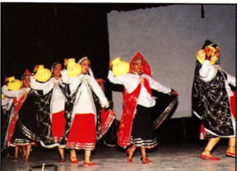
A little tease and a lot of joy is what the Haryanvi dancers of Class VI & VII bring to us