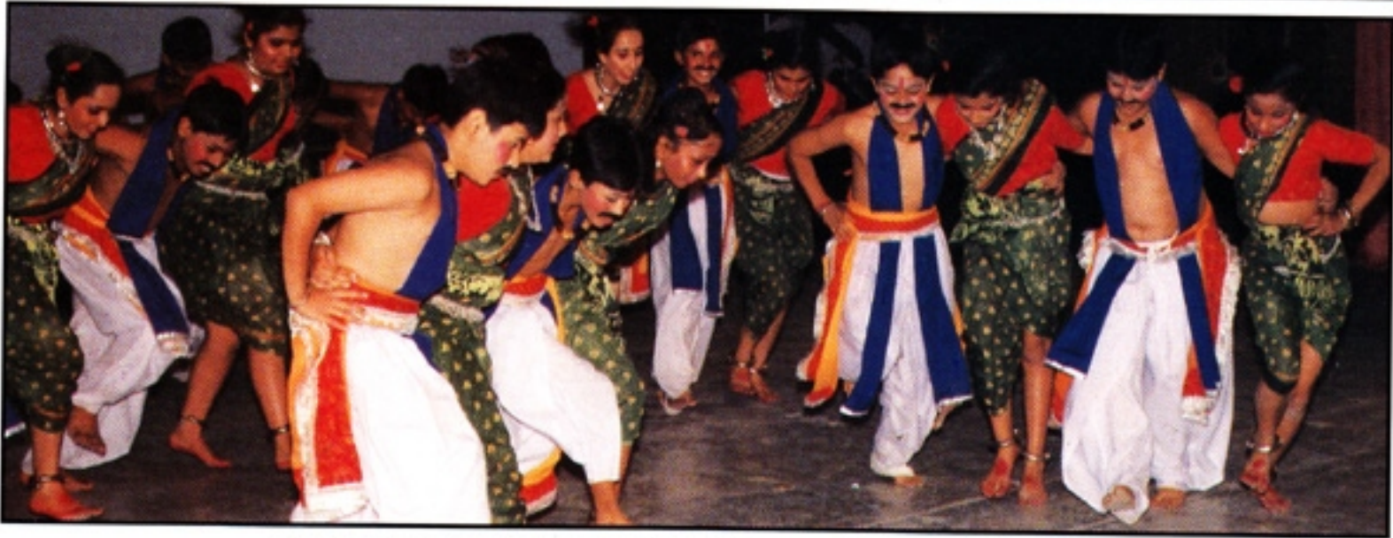
The tribal music is earthy and the tribal dance of Chhatisgarh is divine