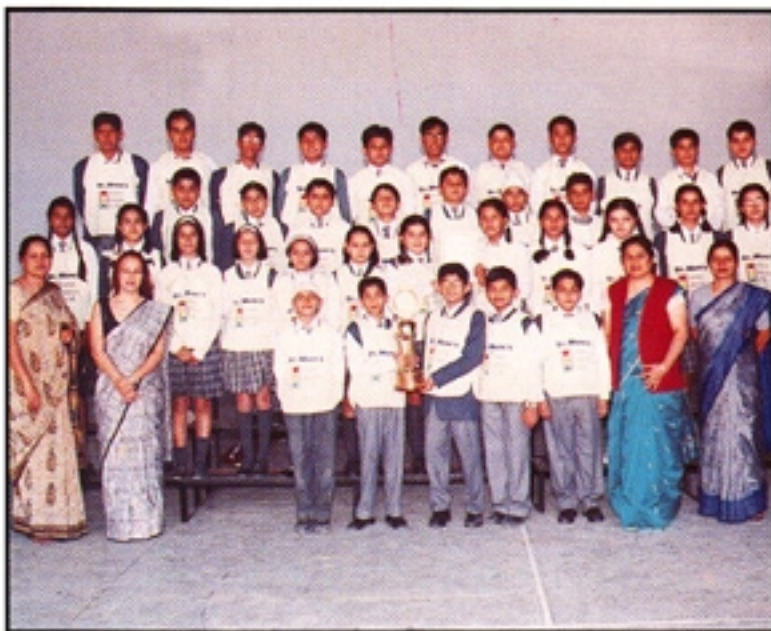
Crusaders of the Road Safety Club were awarded 'School of the Year Award'