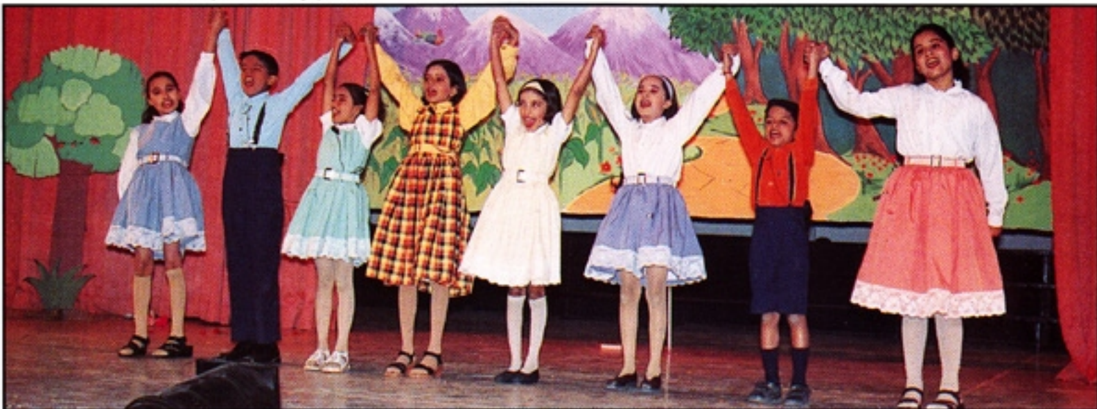
Singing together with joy in 'The Sound of Music'