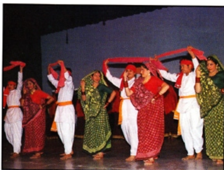
There is merriment in the air as the dancers from Bihar swing to the Bhojpuri notes