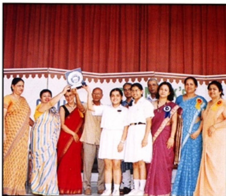
A hat trick by the English Deptt. of our school receives the Best School Trophy for the third consecutive year