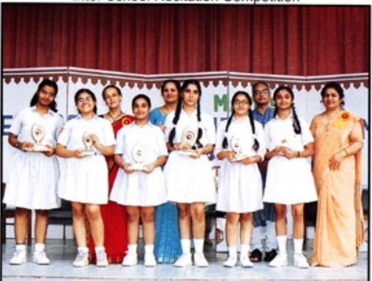
The smiles on their faces denote their pride and joy winners of class IX (Hindi) at the Inter School Recitation Competition