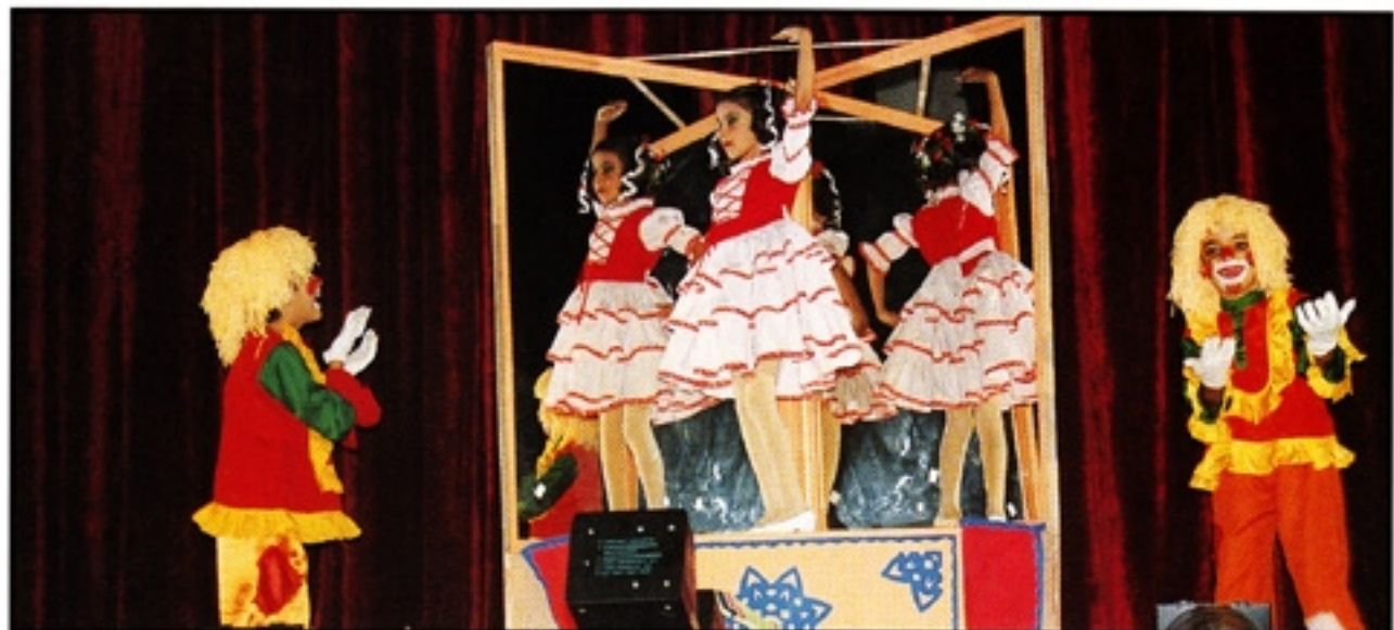
'Dancing Dolls' fill the moments with a cheerful song

The Dancing Dolls of Class II endeared themselves to all while their friends, from both Classes I and II, thanked their parents through a special musical, 'Mummies and Daddies'.