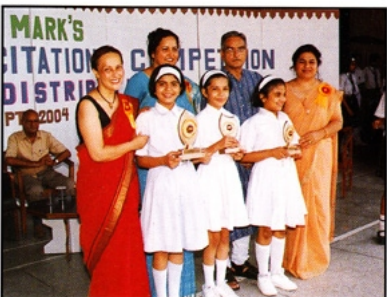
Proud winners of the Inter School Recitation Competition