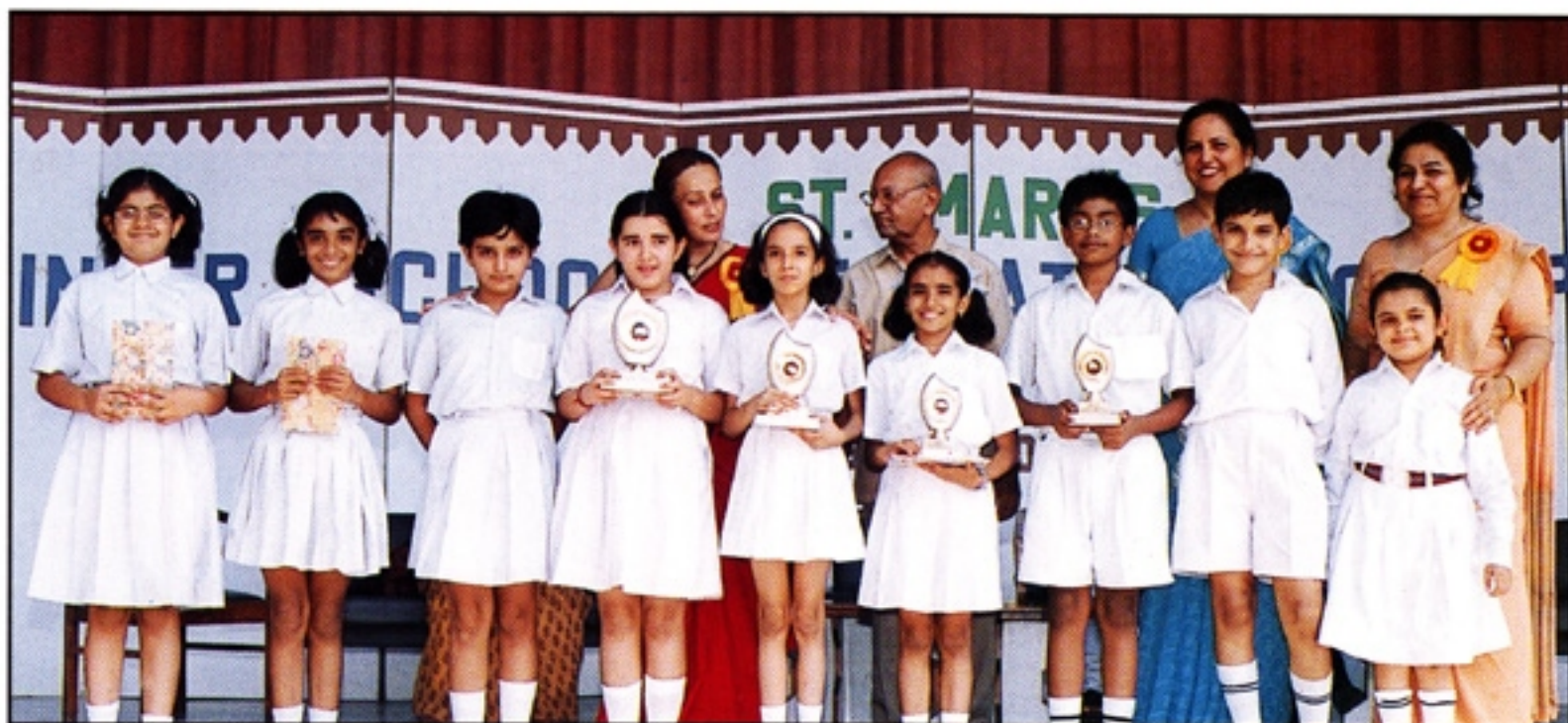
The joy is written large on their faces, for they are winners of class V (English)