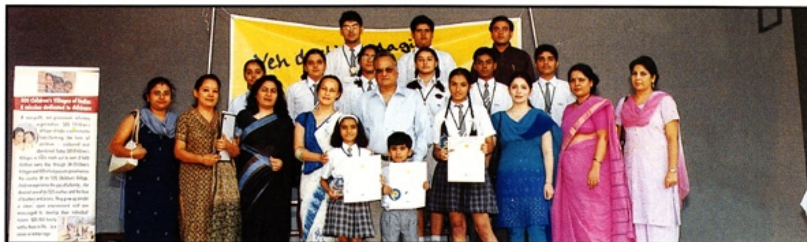
The SOS family becomes an extension of our SMS family