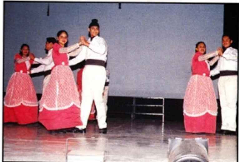
Bringing before the audience the rhythm and joy of dancing the Polka