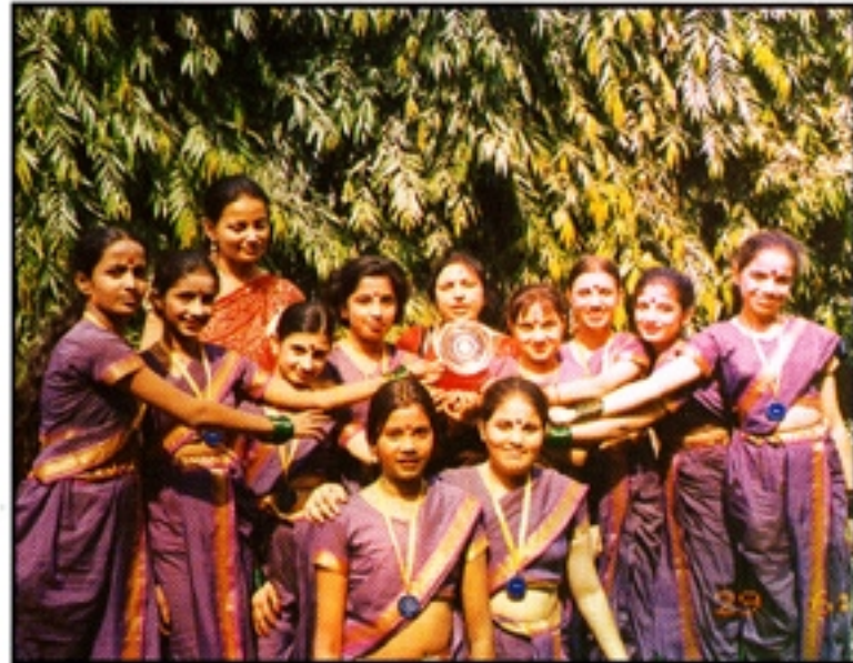
We did it again! Winners of the Inter School Dance competition organised by Rotary Club

* A general knowledge test was conducted by Central Institute of G.K. on 15th September 2004. 732 students participated in the contest and all of them successfully cleared the exam with meritorious percentages.