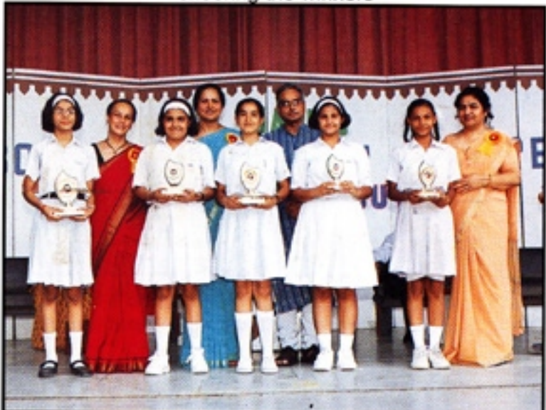
Proud winners of class VII (Hindi) at the Inter School Recitation Competition