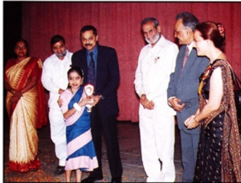
Winner of the proficiency prize at the Annual Day function