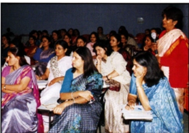
An interactive session at the Effective English Teaching Workshop