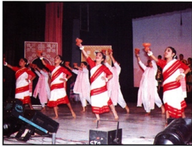
Invoking the blessings of the Almighty, the Invocation Dance presented by the junior students