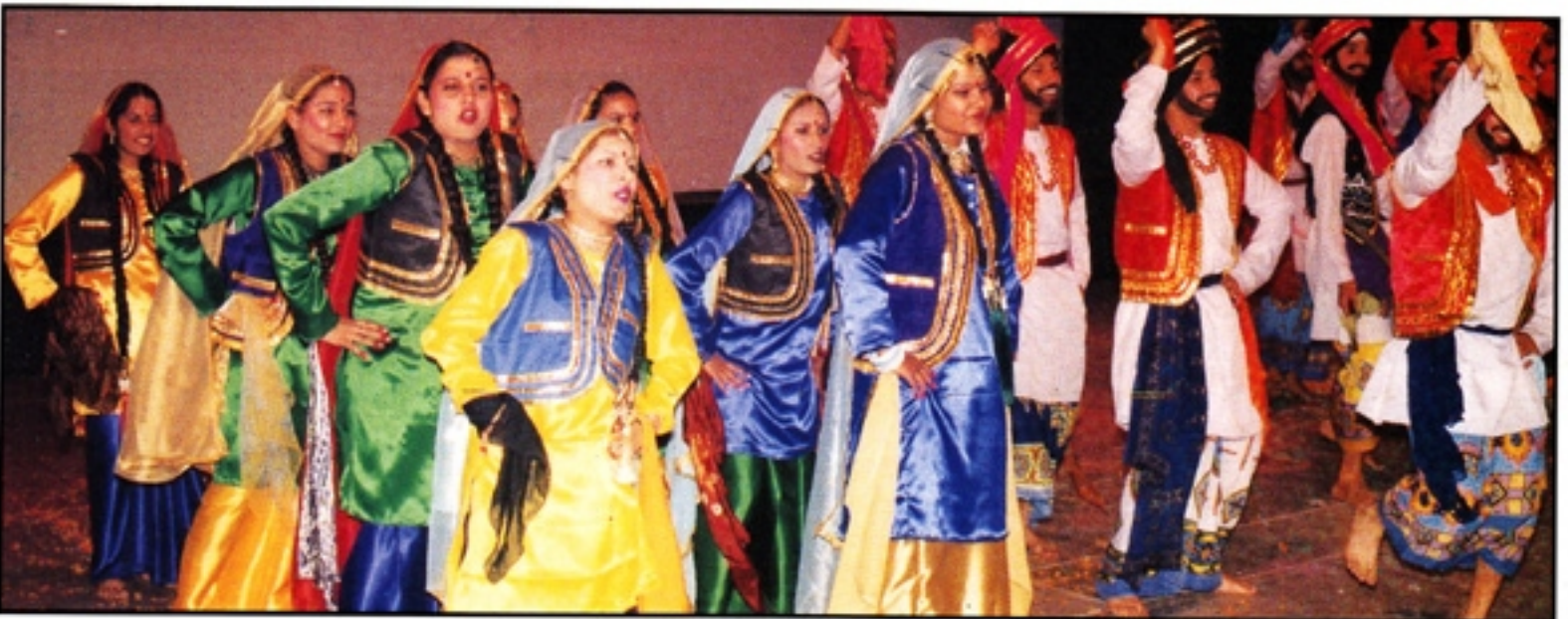
'Beat the dhol' and see if you can stop us from dancing 'The Bhangra' from Punjab