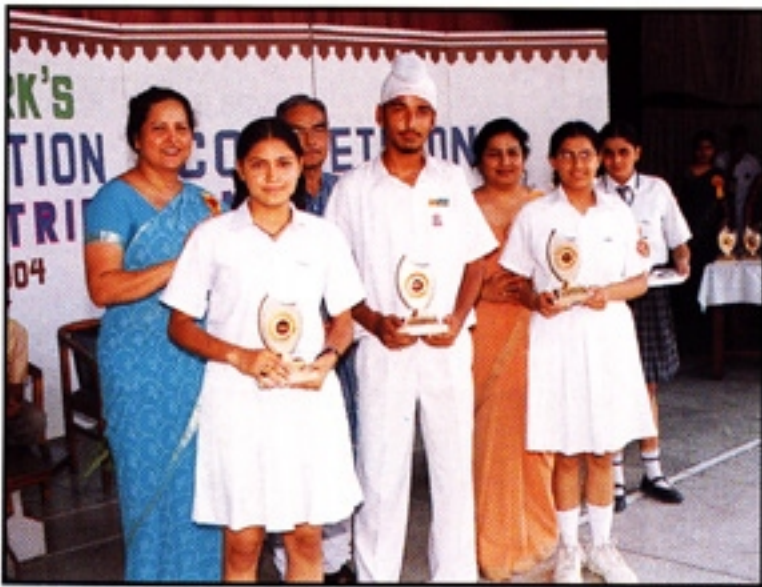
Prizewinners of Class XII (English) at the Inter School Recitation