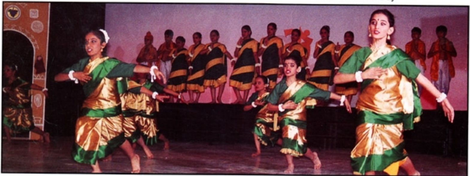
Synchronizing folk music and dance