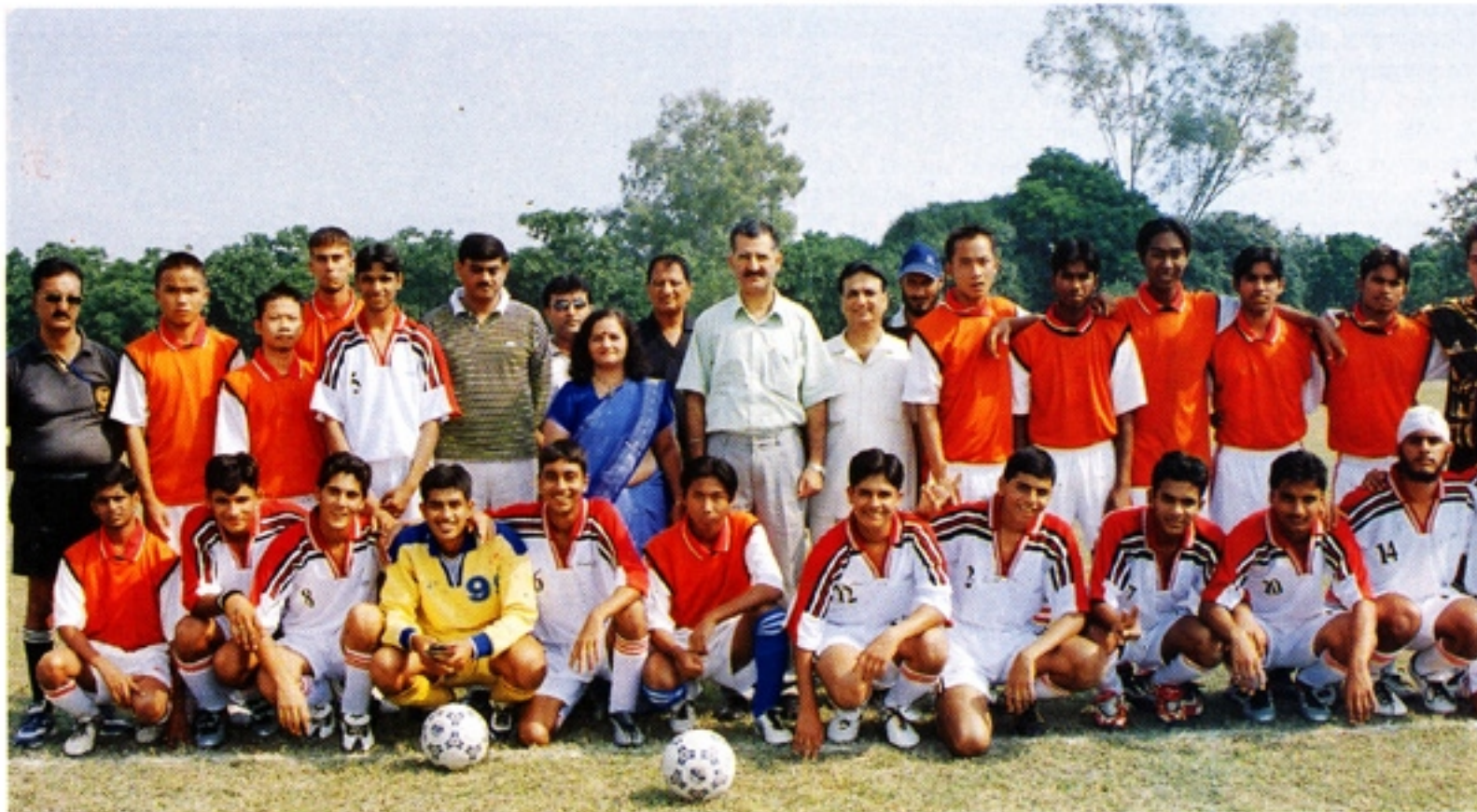
Our jubilant football players at the CBSE North Zone finals

Our Volleyball team participated in Smt. VIDYAVATI ALAG MEMORIAL TOURNAMENT and emerged winners in one of the matches.