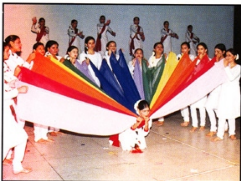
'Picture perfect moment' for our creative dancers