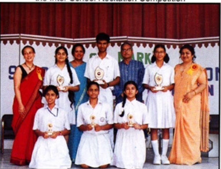
Class IX made a mark at the Annual Inter School Recitation