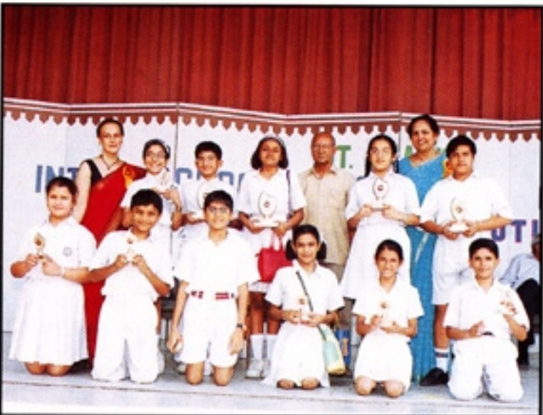
Happy winners of class VI (English) at the Inter School Recitation Competition