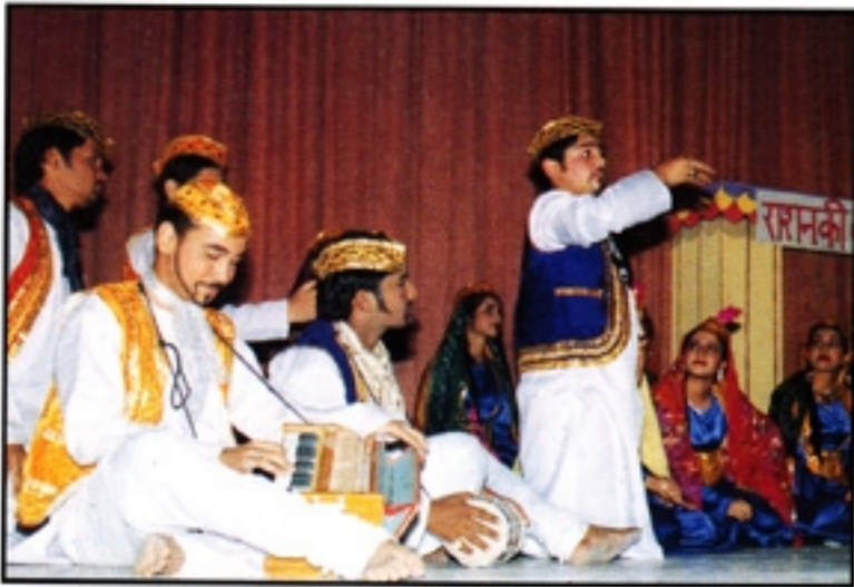
'Milavati Ram' a satire through the medium of Qawali