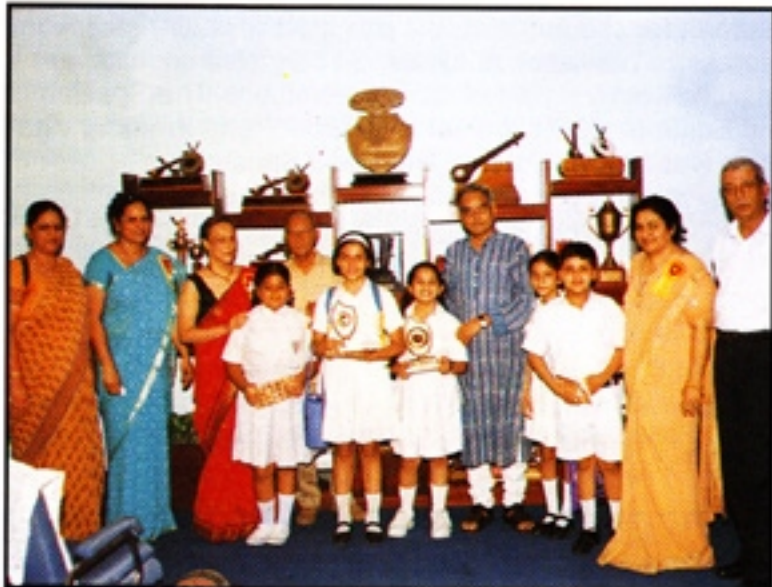
'Proving their mettle', the winners of Class V (Hindi) at the Inter School Recitation