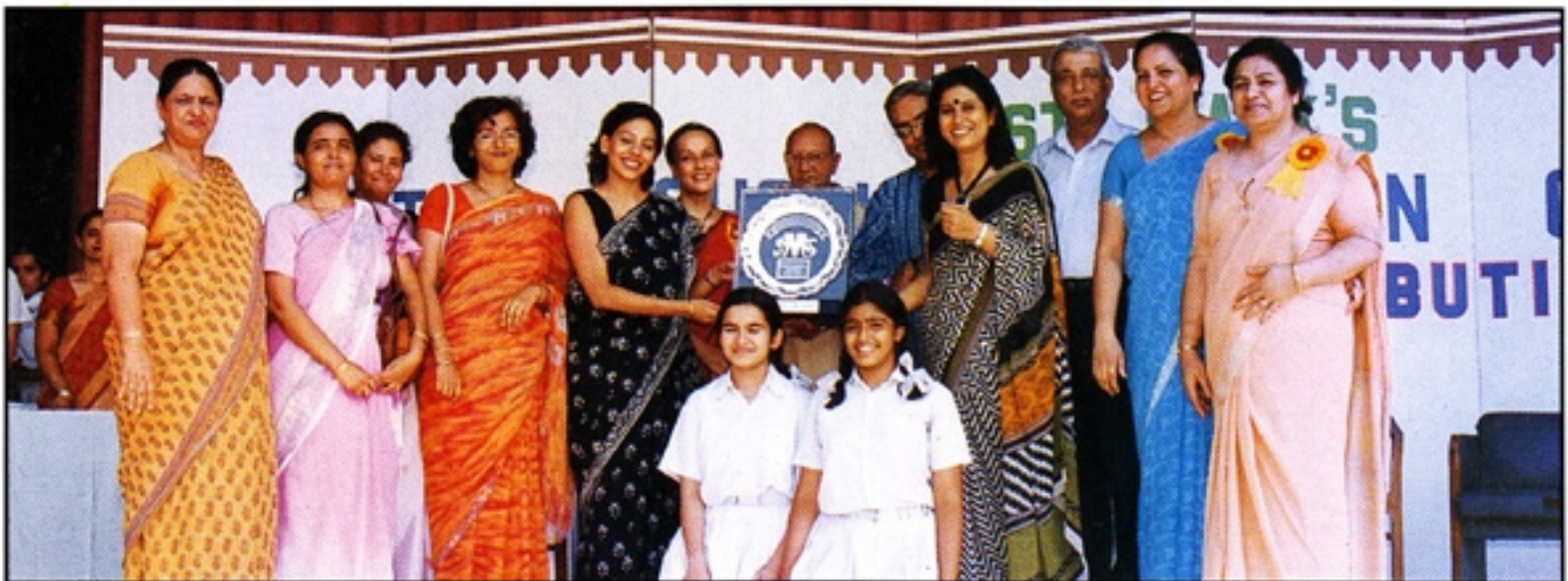
Jubilant winners of the St. Mark's Girls School with the Best School Trophy