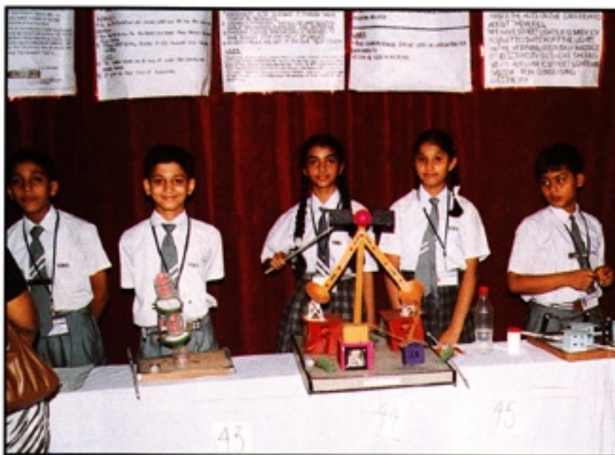
Budding young scientists at the Annual Science Exhibition