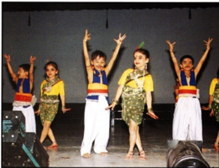
Juniors recreating the magic of Chhatisgarh

How could one forget the ethnic portrayal of the Bengali Dance and the fun and vigour of the Haryanvi Dance presented by Class IV. A spoonful of sugar was sung by our tiny tots of class I as they swayed to the beautiful music. A favourite classic 'Sound of Music' was wonderfully recreated on stage by our talented students of class IV who also brought in scintillating music through the Orchestra. Holi a festival of colours was celebrated by a group of wonderful dancers of Classes III and IV through the folk medium and the Choreography of Krishna Leela added divine magic. Students of Class III were very determined and showed their sense of purpose as they presented the musical bouquet 'together we can do it'. A delicious spread of our rich, cultural heritage was well appreciated by the audience who cheered the participating students.