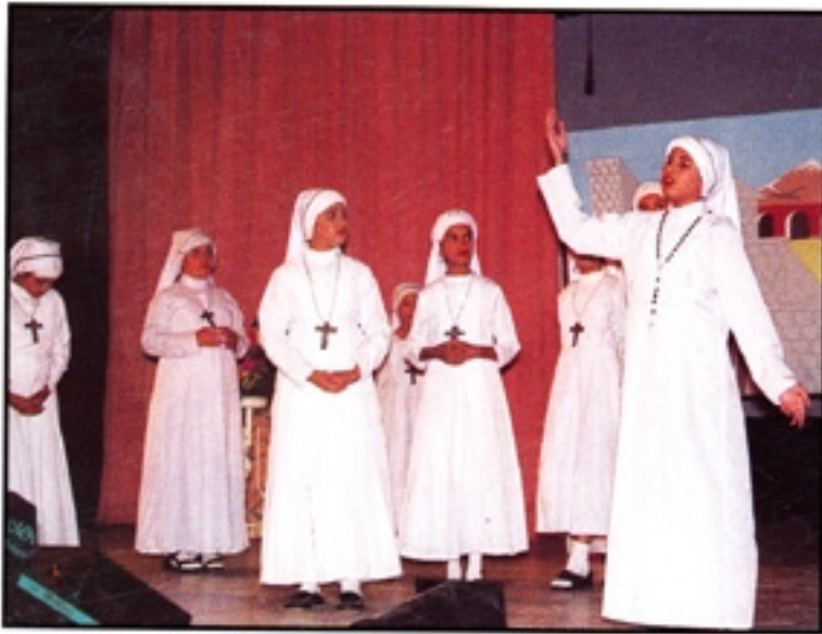
Bringing back to life the classic 'Sound of Music'