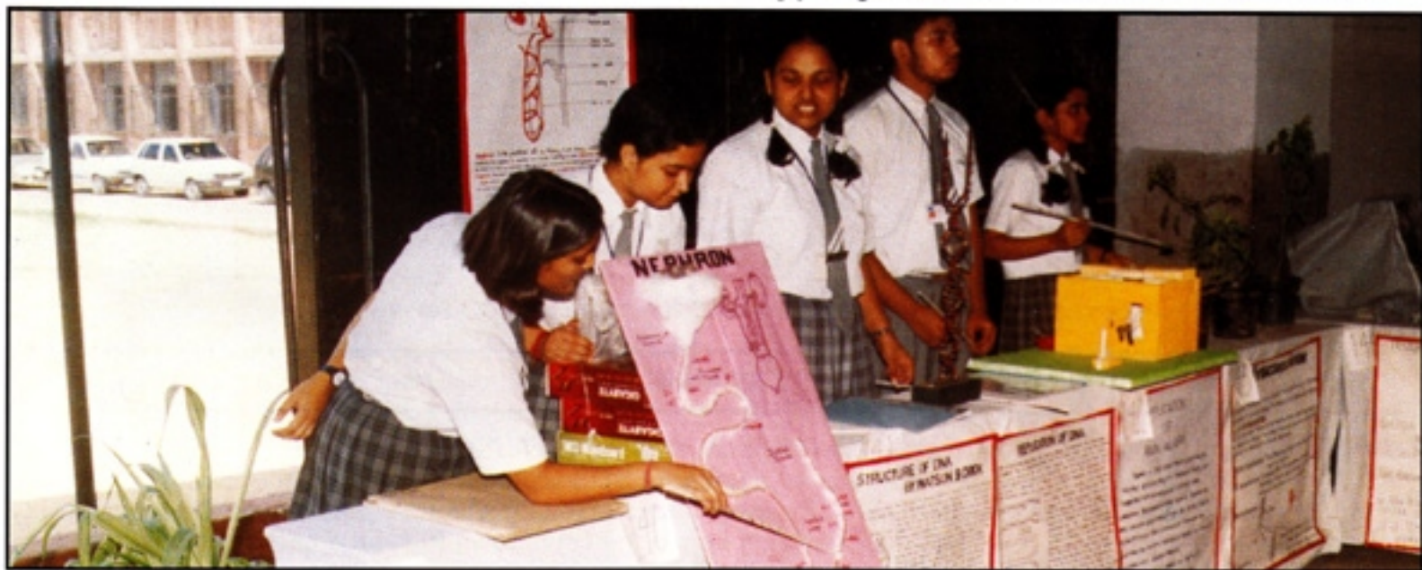
Our scientists explain the 'facts of science' at the Science Exhibition