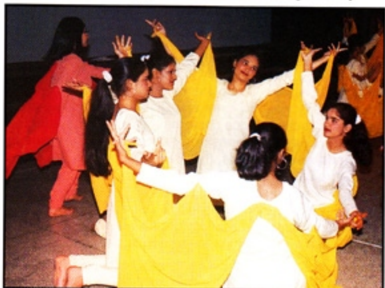
Girls of Class IX present the 'Celebration of Life'