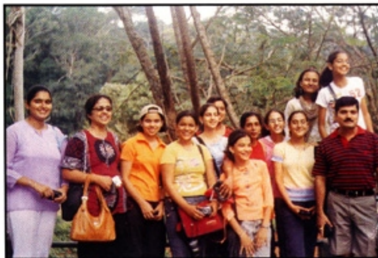
Class VIII & IX unwinding in 'God's own country'

Students of Class VI and VII accompanied by six teachers went on an educational trip to Mt. Abu. The students thoroughly enjoyed themselves. They visited the famous Dilwara Temples and were awestruck seeing the magnificent sculptures. They also visited Toad Rock, Guru Shikar, Nakki Lake and the Bramhakumari Peace Park. They observed the beauty of the setting sun at the Sunset Point, which was a rare sight. They had a gala time at the bonfire, dancing and singing to the tune of popular numbers.