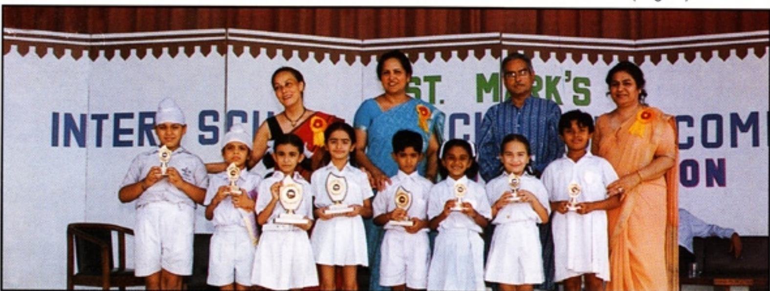
Happy winners of Class II (Hindi) at the Inter School Recitation