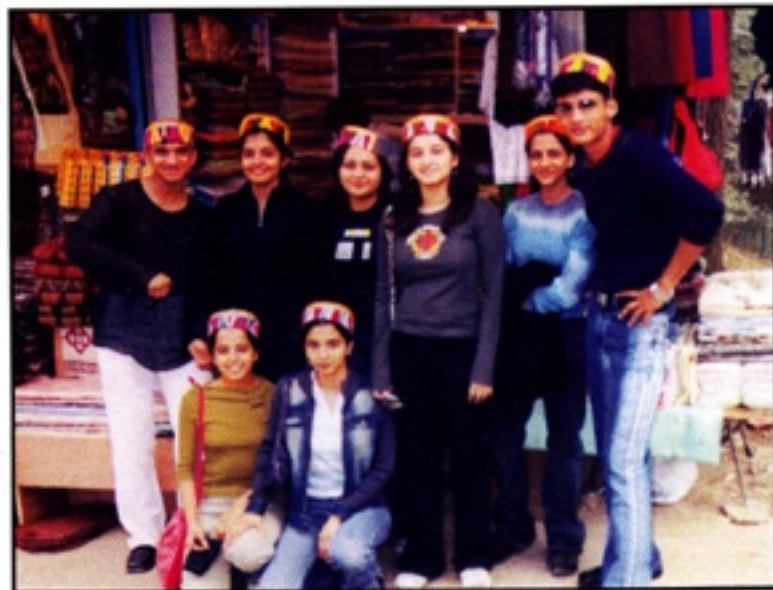
Donning the traditional Himachali caps our students of Class XII celebrate the magic of hills

Our school had organized an adventurous and informative trip to Shimla for Class XI and XII. While on the way they stopped at Chandigarh to visit the Pinjore Garden. When they reached Shimla, it was the beginning of a fruitful experience. They climbed a long way to reach an amusement park and even visited Kufri, Naldhera and at the exotic mall enjoyed shopping.