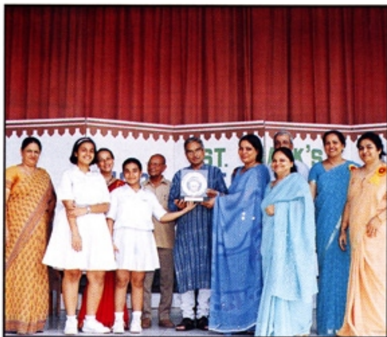
Faculty and proud winners of our school's Hindi Department who lifted the trophy for the maximum prizes