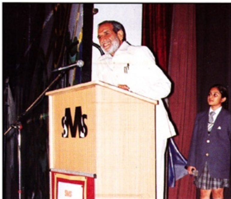
Mr. Sajjan Kumar, Hon'ble Member of Parliament, addressed the gathering on Juniors Annual Day function

The classics of old, the evergreen 'Sound of Music' and the fantasy world of 'Wizard of Oz' was brought to life through musical skits. So emotive were the characters that the audience kept guessing, whether Dorothy and the scare-crow would find their way to the Emerald City. Our students of Class IV really had audience singing along with them as they joyously danced to the notes of DO- RE ME. Vibrant dancers from the different states of India swayed to the rhythm and beats of traditional music, unique to each region. The vibrance of the hills of Kumaon, the vigour and the tribal richness of the state of Chattisgarh, the ethnicity of Bengal, and the lively fishermen's dance of Maharashtra were all presented in beautiful coordination by the students of the junior and the senior classes.