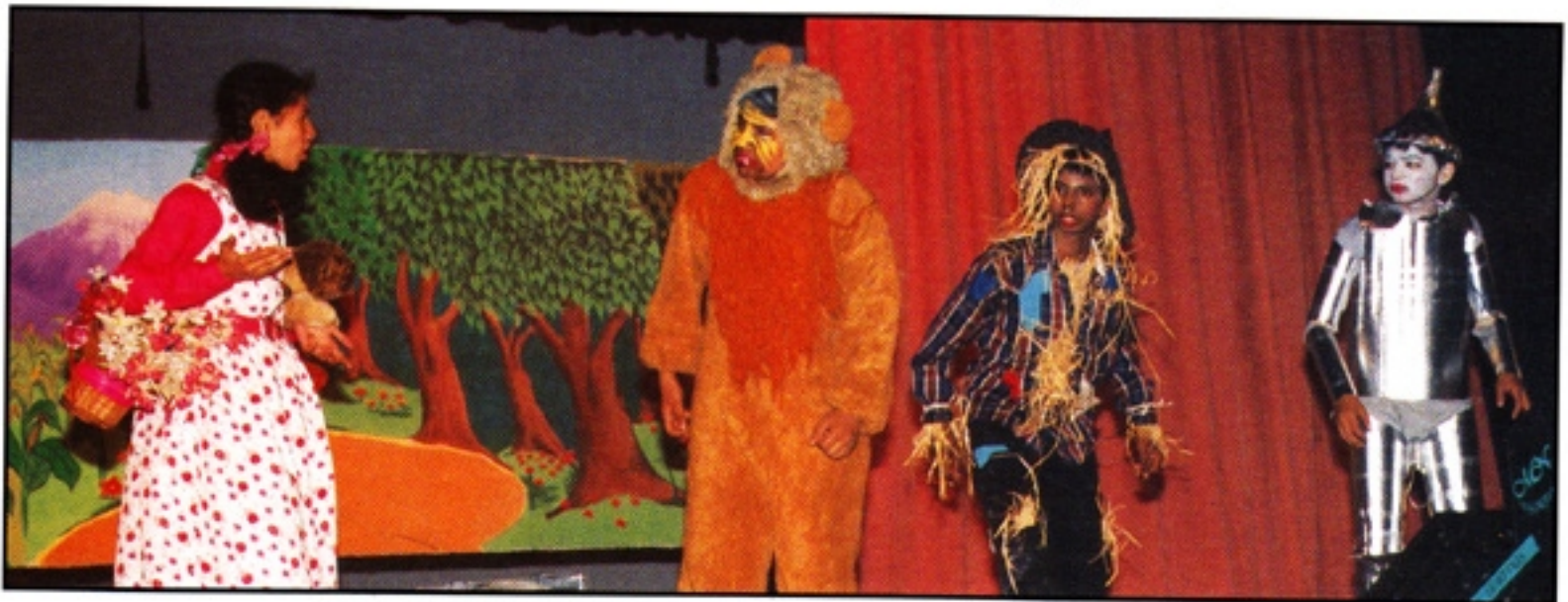
The complaining lion in conversation with Dorothy in the 'Wizard of Oz'