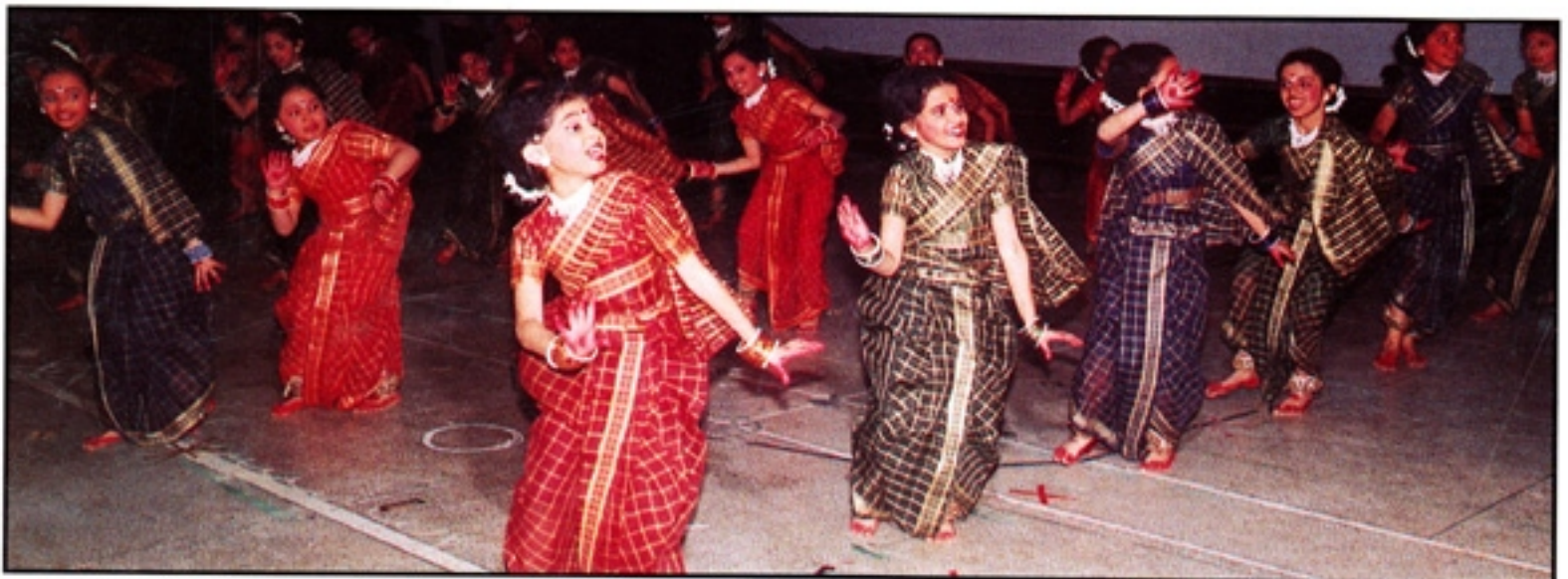
Young dancers from the coastal land of Maharashtra