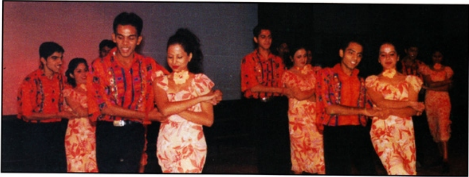
Our 'young merry dancers' jive to beautiful music