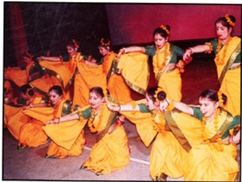
The ethnicity of Bengal comes to life at the Juniors Annual Day