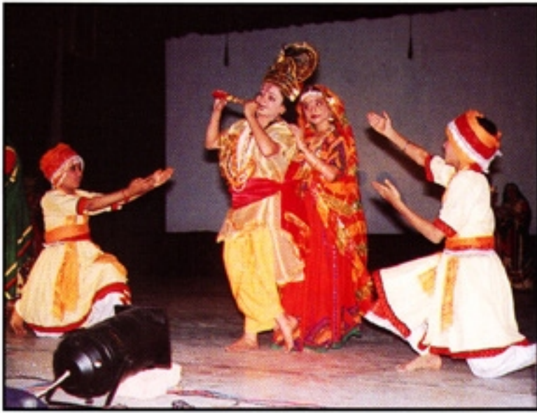
The Juniors present the 'Divine Charm' of Lord Krishna