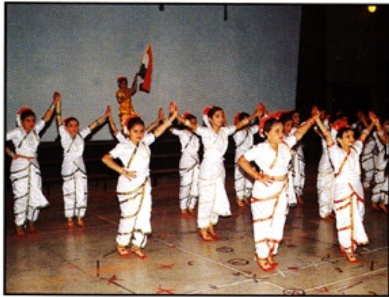
Together we can and will make a difference

November 7 was a special day for our primary section as they were celebrating their Annual Day. The mood was jubilant and spirits were high because the students had prepared a wonderful cultural bonanza showcasing various aspects of music and dance. The day's festivity began with the Invocation Dance rendered by Classes IV and V wherein they paid their respects to the Almighty and invoked His blessings. Mera Bharat Mahaan opened up a chapter on patriotism where the children of Classes I and II sang and danced to patriotic notes. Close on it's heel were the vibrant dancers from the coastal state of Maharashtra represented by Class III and the tribal dancers of Chhatisgarh from Class I.