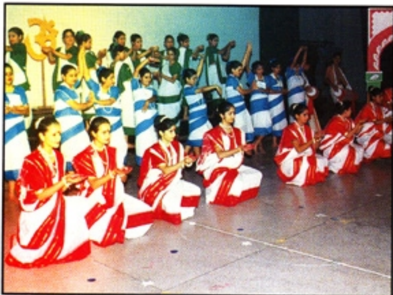
A silent prayer or one said in a group has the same power, believe our students as they present the Invocation Dance