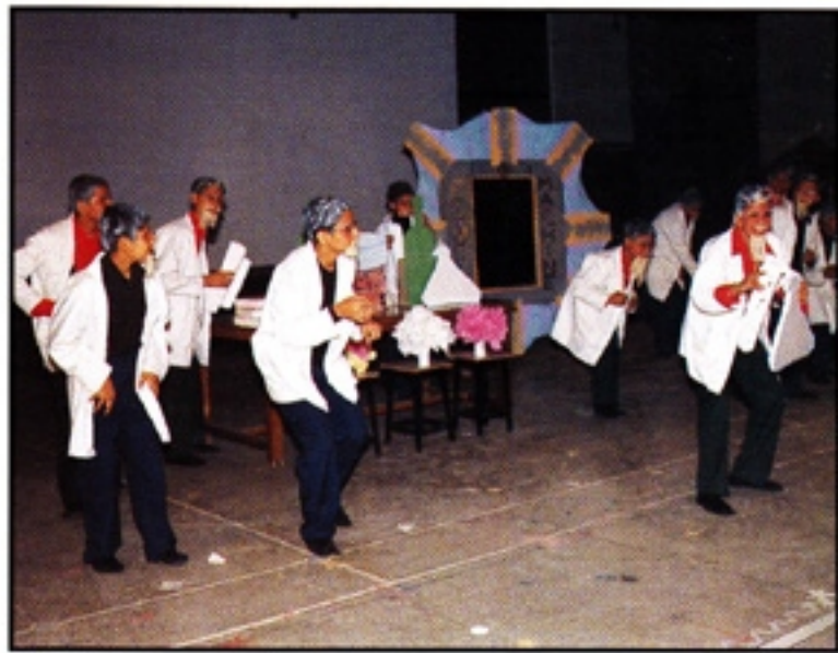
A candid moment for Roses of success!

The foot tapping beats and the scintillating music mesmerized the audience as they watched young dancers bring forth the lively magic of 'Western Dances through the Ages'. Complimenting the beautiful choreography was the innovative lighting techniques and the very attractive dance costumes. Our senior students put on their dancing shoes and danced away their blues. Whether it was the Polka, the Jive, the Fox trot, the Waltz, the Twist, the Salsa or the Rock 'n' Roll, our young dancers seemed so professional, with their coordination and elegant style that the audience was left spellbound. After this western dance we are sure that we will have more recruits to the dance classes.