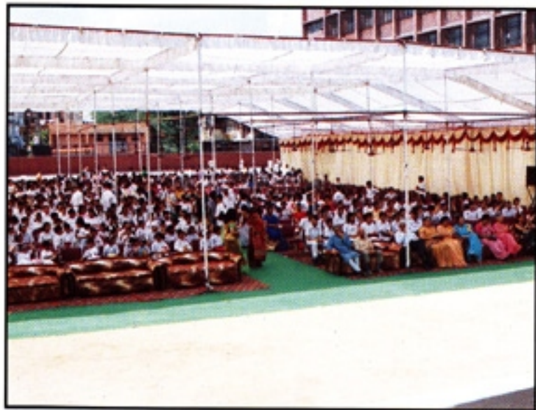
Enthusiastic and participative audience cheering the winners