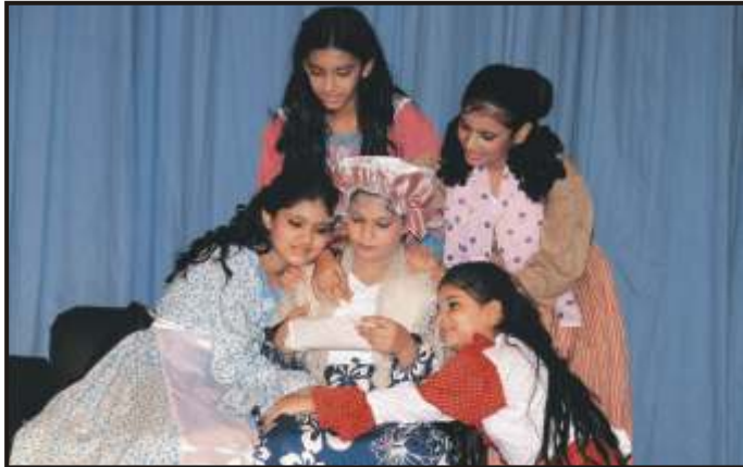
The four 'Little Women' with Mrs. March

It was a wonderful experience for the students who participated as well as the audience who witnessed the various plays. Some of the plays were Oscar Wilde's 'The Model Millionaire', Louisa May Alcott's 'Little Women', Charles Dickens' 'A Christmas Carol' and O Henry's 'The Ransom of Red Chief'. The Hindi plays comprised of Munshi Premchand's 'Thakur Ka Kuan', 'Adhikar Ka Rakshak' and 'Nawab Sahab Ka Vivah'.