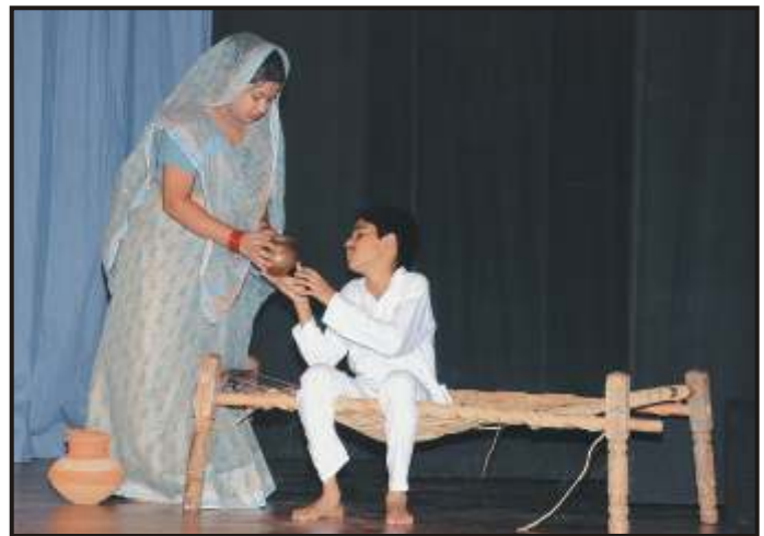
Hindi play 'Thakur ka Kuan' by Class VII