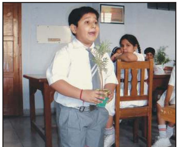
Speaking for a Green Cause