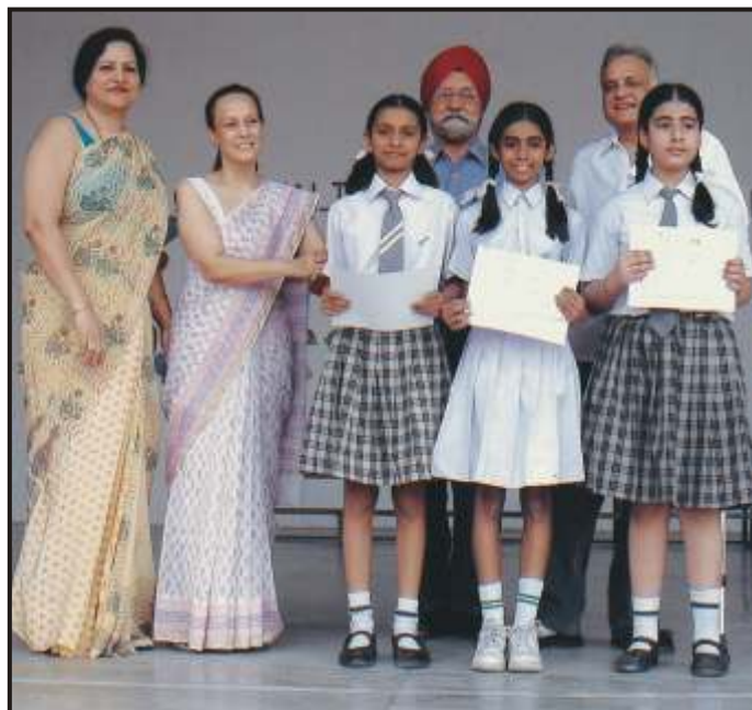
Winners of Aman ki Asha (a campaign organized by The Times of India)