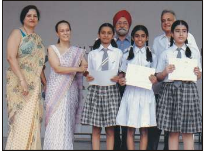
Winners of Aman ki Asha (a campaign organized by The Times of India)