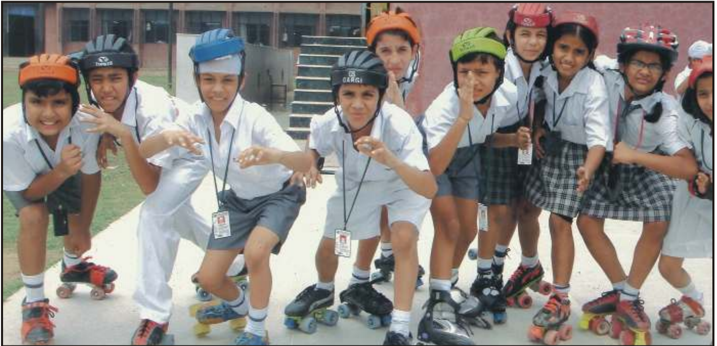
The Skating champs