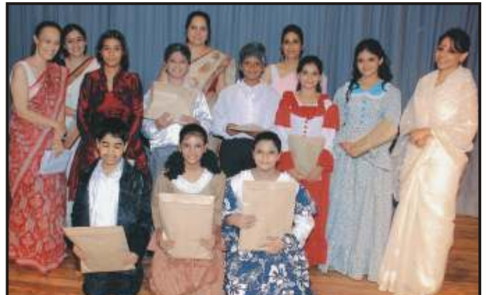
Winners of Inter Class English Play competition (Class VI)