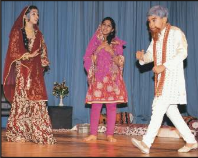
A Hindi Play in Progress-'Nawab Sahab ka Nikaah' (Class VII)