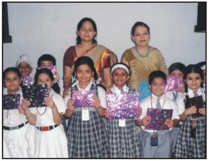
Winners of Inter Class English Recitation Competition (Class I and II)