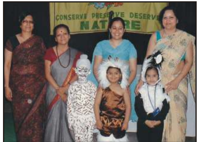
Winners of the Junglee Fancy Dress Show (Class II)