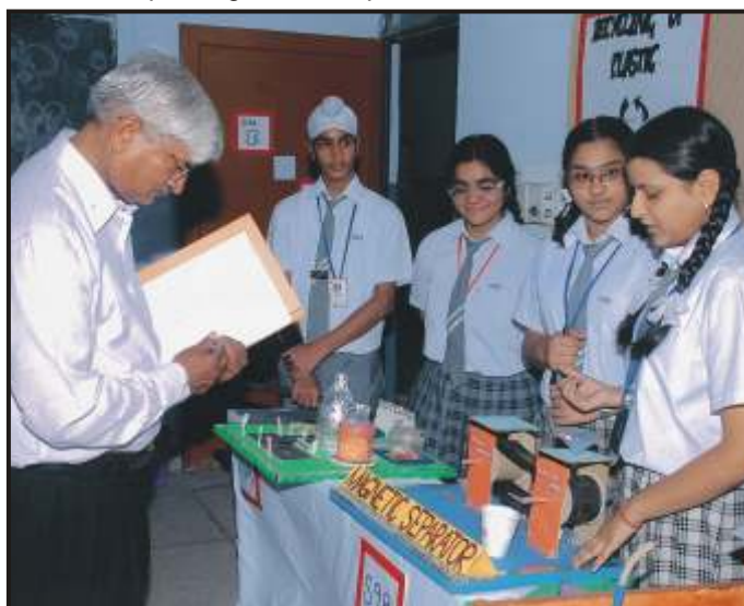
The function of 'Magnetic Separator' being explained