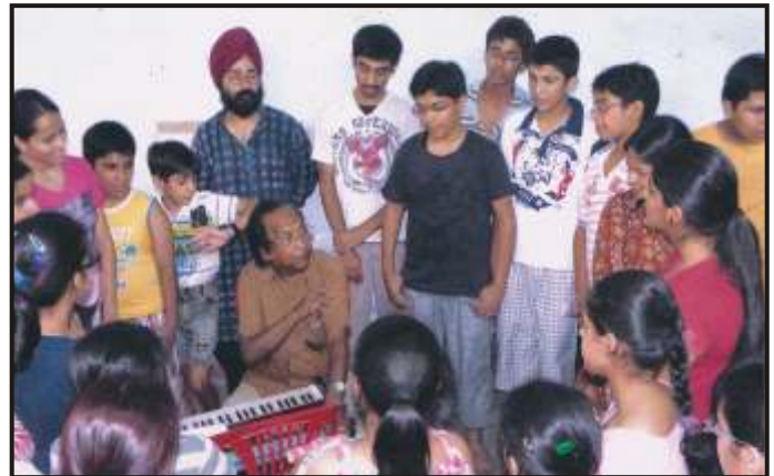
Theatre Workshop in progress