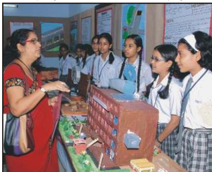
Future SMS in green and eco-friendly