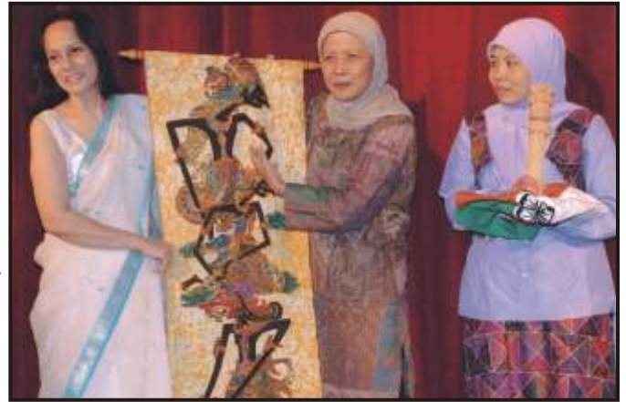
The Exchange of Souvenirs.