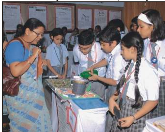
Drip irrigation draws the interest of our judge.