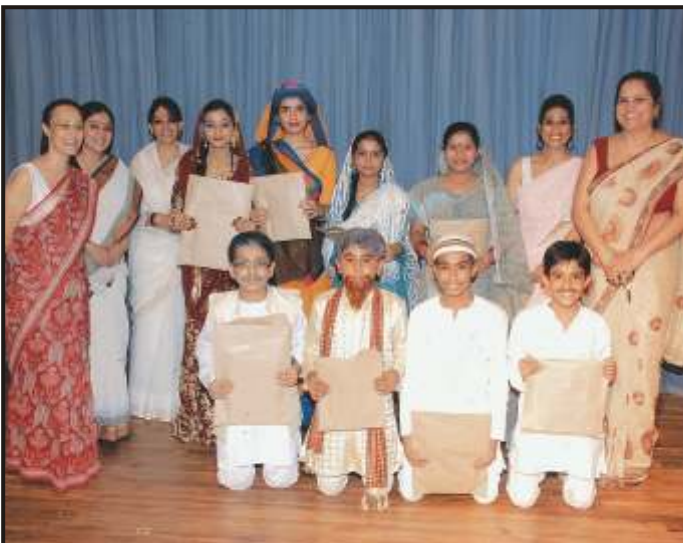
Winners of the Inter Class Hindi Play Competition (class VII)