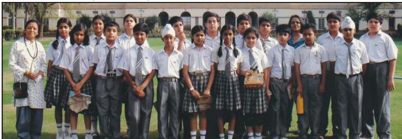
Students visit Teen Murti Bhavan

The members of Snow Leopard Eco Club went for a Nature Walk in the pristine surroundings of Teen Murti Bhavan. It was organized by Nehru Memorial Museum Library. Students were enthralled by the sheer variety of birds like Peacock, Barbet, Hornbill, Owl, Koel etc. in the lush green surroundings of the Bhawan. They were also made aware of the common names of trees like Amaltas, Silk Cotton tree, Gulmohar etc.