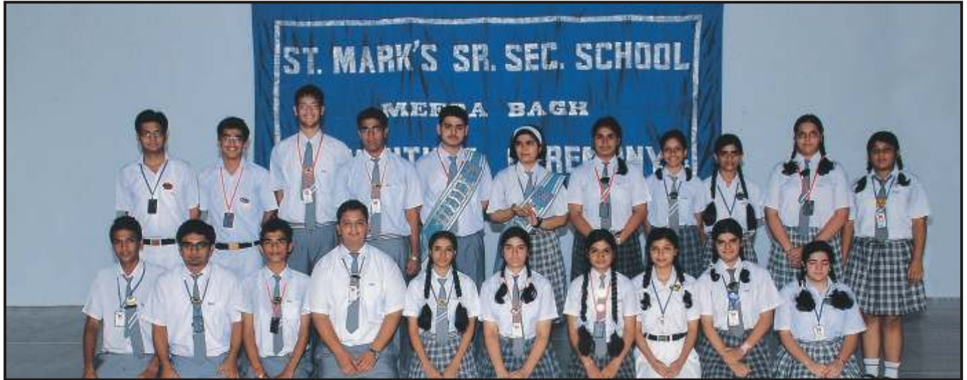
The newly formed students' council