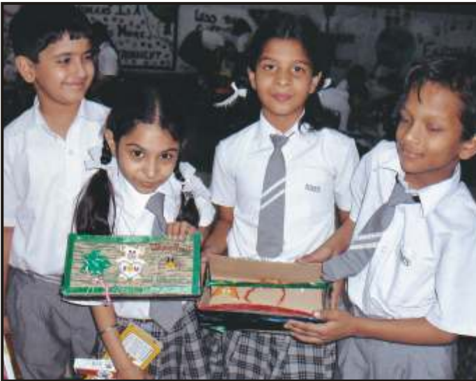
Best out of Waste