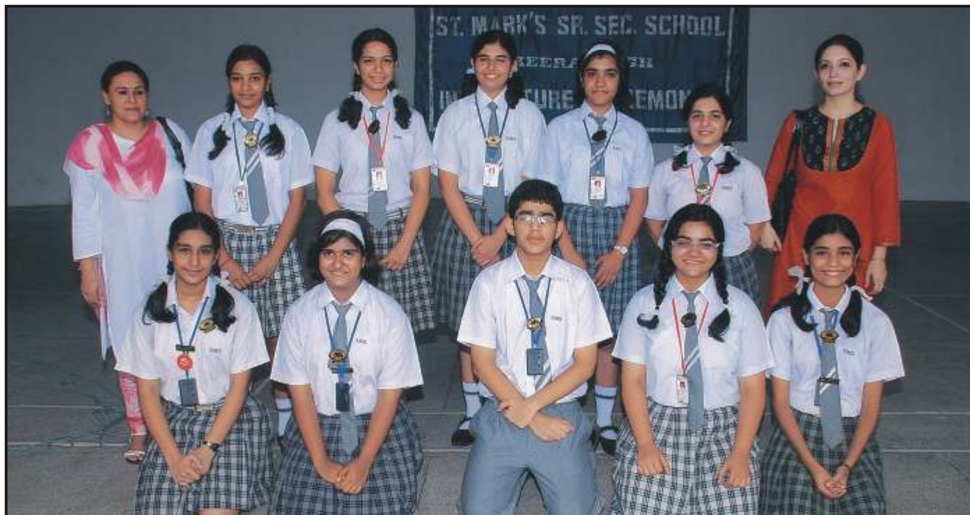
The Editorial Board