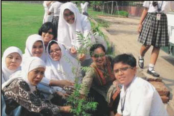
Nurturing the tree of friendship