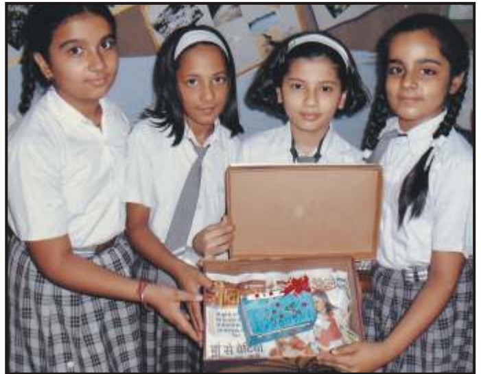
Students of class IV B make a Pencil stand out of waste