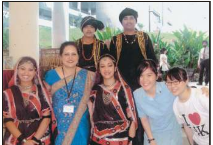
Students all set to showcase Rajasthani Folk Dance.