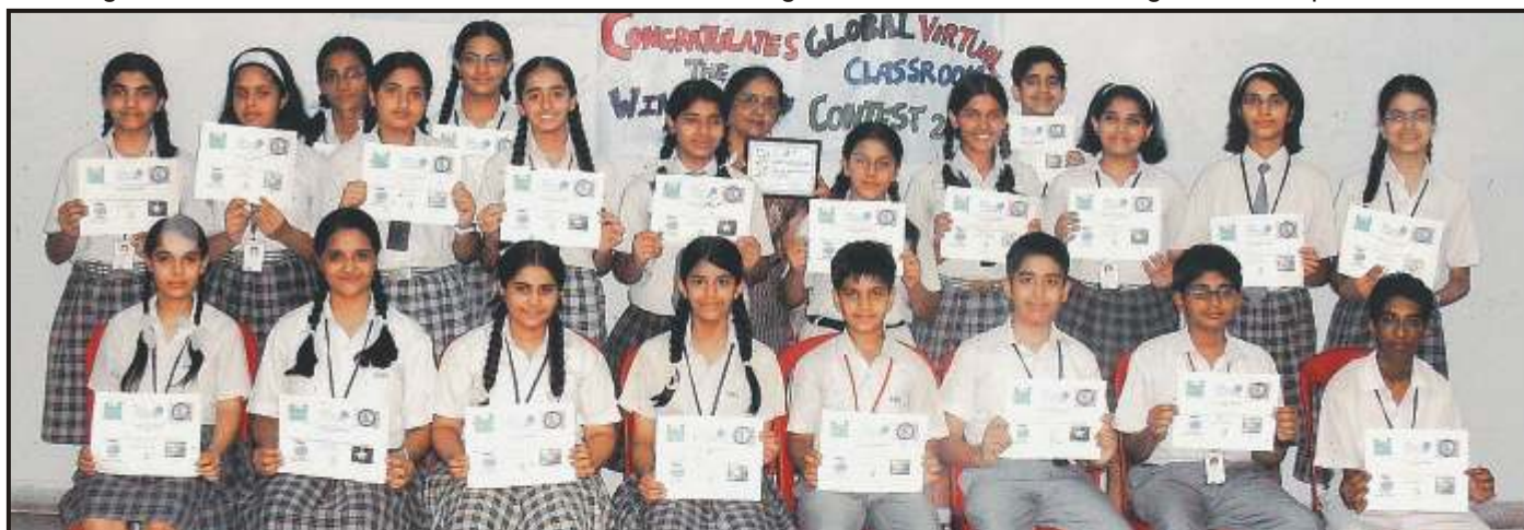
Winners of the Global Virtual Classroom Contest

Two teams of our school won GRAND FIRST PRIZES in Primary as well as Secondary level and a Special Certificate of Merit for Exceptional Helping Focus at Secondary level in GVC (Global Virtual Classroom Contest). This is a free online collaborative learning project that fosters creativity, cross cultural understanding and teaches IT and website design skills to students working together from around the world. It was a proud moment for the participating students when the prize money of $ 1000 and a Plaque for the school was announced by the Give Something Back International Foundation (GSBI), USA. It was a well deserved victory after a six month long process of Technical Creativity, Web Designing and Team Work by all 60 members of both teams, along with their team mates at Primary Level from Percy Julian Middle School, Illinois, USA, Washington West School, New York, John Muir School, San Diego, USA and Wako Kokusai High School, Japan.