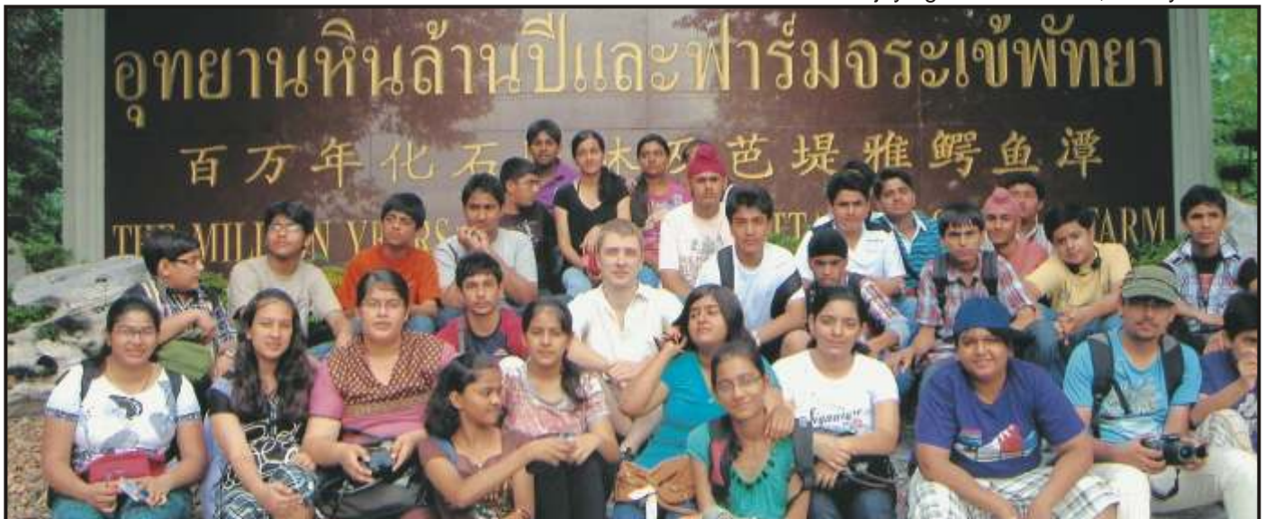
Our students visit Thailand