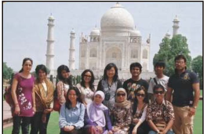
At the Taj Mahal