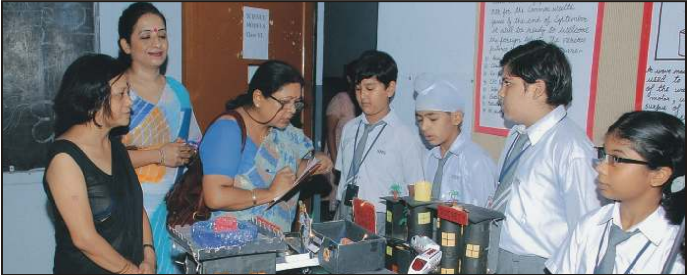
Young Scientists give innovative Ideas for a 'Clean and Green Delhi.'