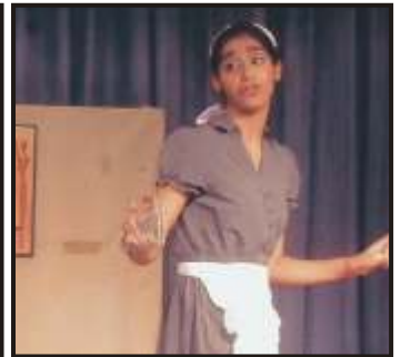
English Plays in Progress (class X and XII)