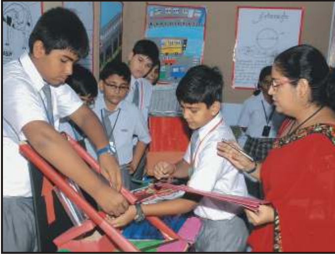
Students of class VII enthusiastically demonstrate 'Convection Currents.'