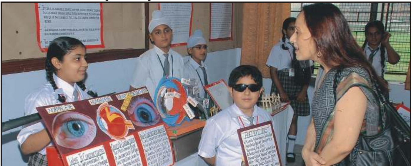
Students showcasing their projects on Conjunctivitis.