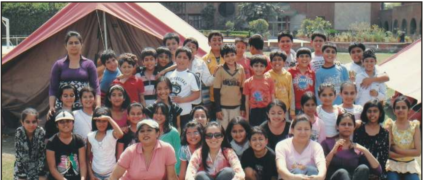
Adventure Camp in School

Students of classes IV and V participated in the Adventure Camp, held in the school premises on 13 and 14 March 2010. The students competed in many adventure activities like rappelling, river crossing techniques, knot tying exercises, tele games, obstacles etc. The camp was specially designed for school students, to train their minds to compete under stress and difficult conditions. The camp was enjoyed by one and all.