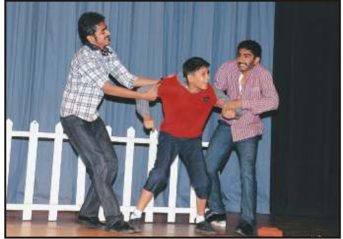
'The Ransom of the Red Chief' in progress