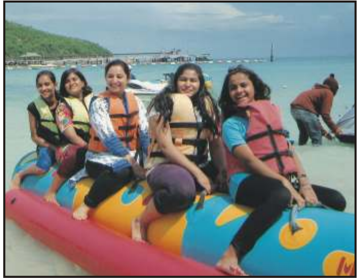
Our students enjoying at Coral Island, Pattaya.

Three teachers and thirty three students of our school went on an excursion trip to Thailand-The Land of White Elephants from May 17 to May 21, 2010. The 36 member group had a memorable experience in Pattaya. The tour was a well balanced amalgam of work and recreation .The visiting spots chosen were Nong Nooch Village which displayed Thai culture and tradition, Elephant show, and Flora and Fauna of the region, The Million Year Stone Park with a breath taking Crocodile Farm, Floating Market, Dream World- A Theme park for children, the highlight of which was the Snow Town, Coral Island (with Parasailing, Banana boat ride, Speed boat ride and Sea bike rafting). They also visited the World's largest Gem Factory (with a ride in a mono rail, viewing formation, mining, refining, cutting, setting and display of gems). A photo book, authored by the students, capturing all salient features of the trip took shape simultaneously. The visit to The Land of Smiles will surely be recalled with a smile by all the members of the group.