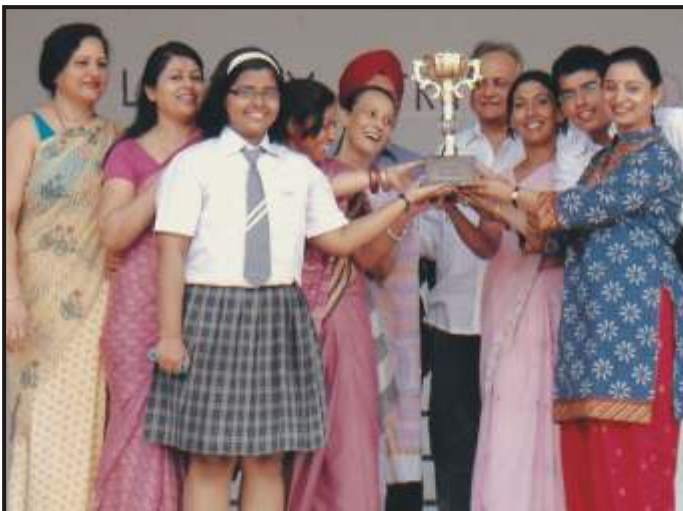
Gandhi House wins the Best House Trophy