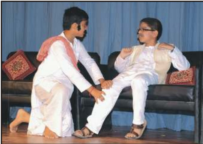
'Adhikar ka Rakshak' by Class VII