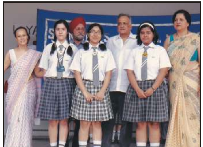
Our House Captains (Class XII)