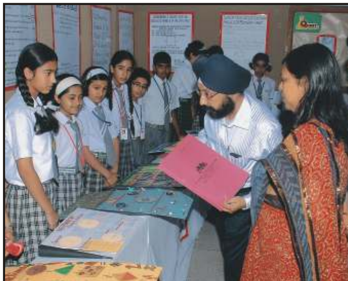
Students explaining the concept of circumference with threads.