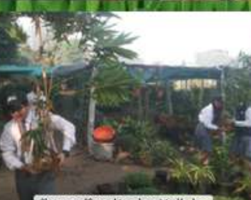
Shopping 'Green' to adorn Madhuban