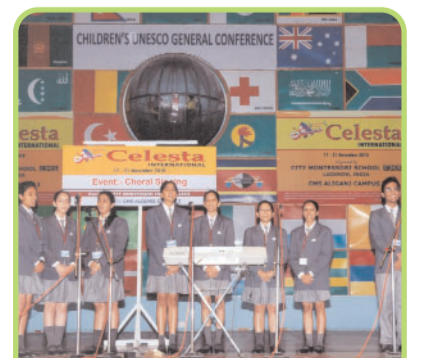
Students participate in Celesta International competition held in Lucknow