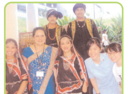
Students at an international conference in Singapore