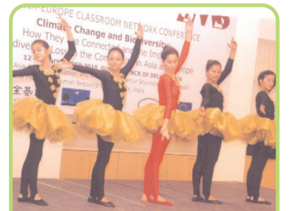
The inauguration of the 9th Asian European Classroom - NET Conference