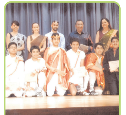
Students paid tribute to the Bard of Avon, Shakespeare, with a three day event