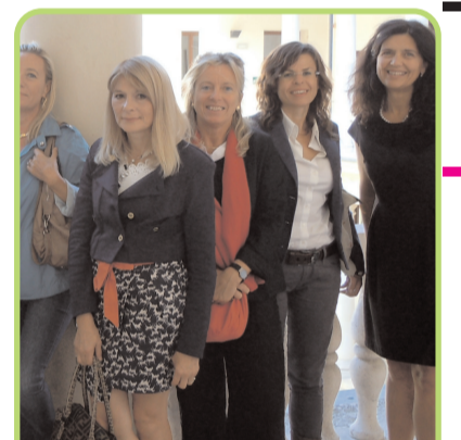
St Mark's at the first Indian Italian School Network Conference