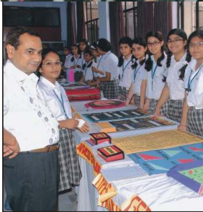
A glimpse of the Maths Exhibition.