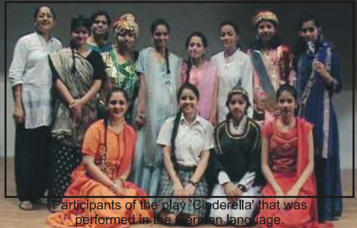
Participants of the play 'Cinderella' that was performed in the German language.