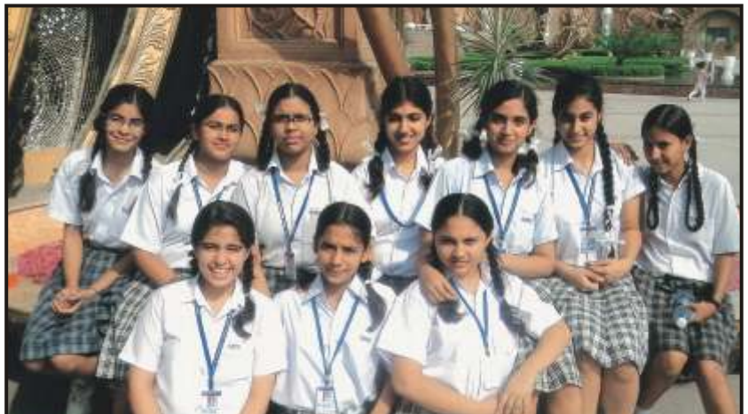
Enjoying with friends at the 'Kingdom of Dreams', the students capture the moment.

Our school took the students of classes VI-X for their annual picnic to the Kingdom of Dreams in Gurgaon, some 30 kms from New Delhi on 29 July 2011. It was a wonderful opportunity for the students to meet Mongolian artists of 'Acromania-The Great Mongolian Circus'. The students were thrilled to witness the show of acrobatics and juggling. The students enjoyed their lunch at Culture Gully after viewing a blend of India's art, culture, heritage, craft and cuisine. They were wonder-struck to see the magical place along with the awesome show which they watched. This trip was a real stress-buster and a dream come true. It was indeed an enthralling experience for the students.