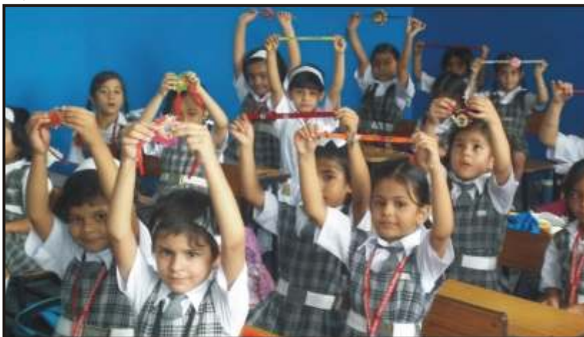
Our zealous students flaunting their bonds of love.

Our school, organized a craft workshop during the summer vacation. Faculty from Camlin had come to supervise the activity along with the Art Department of the school. Students of different classes did beautiful craft work like coffee painting, key stands, mobile stands, photo frames etc. It was a fine learning experience for the students where they could explore their aesthetic skills.