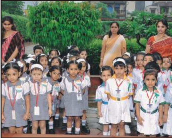
With inquisitive and innocent eyes, the fledglings of SMGS witness the flag hoisting.