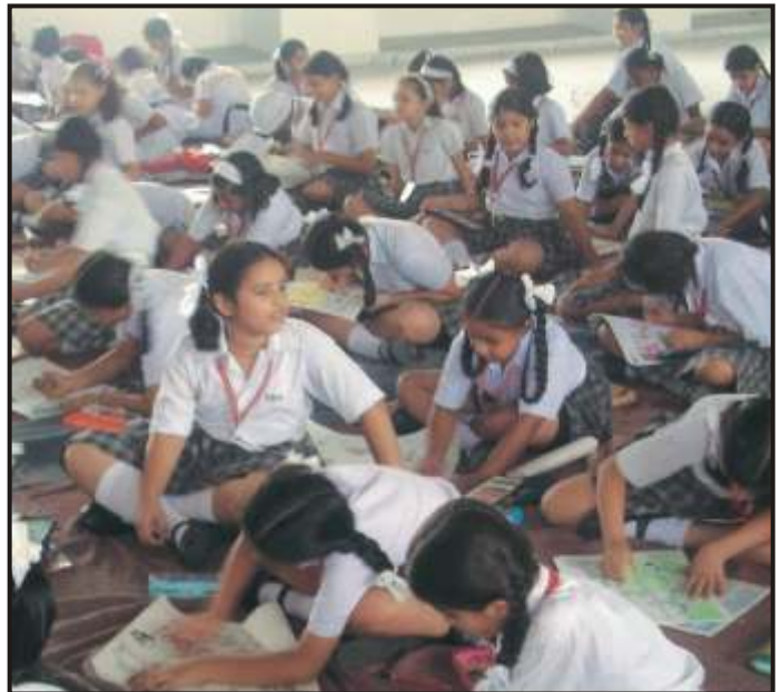
Our young artistic hands giving wings to their imagination