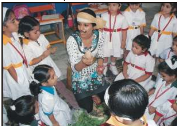
Explaining the importance of vegetables to the little angels of Seedling.

To inculcate the habit of eating green vegetables, a role play was presented by the Seedling teachers who dressed themselves as vegetable vendors. They went to each class to educate the cherubims about different vegetables. The interaction between the teachers and the students was fruitful. Children were very excited to see a vegetable vendor in their class.