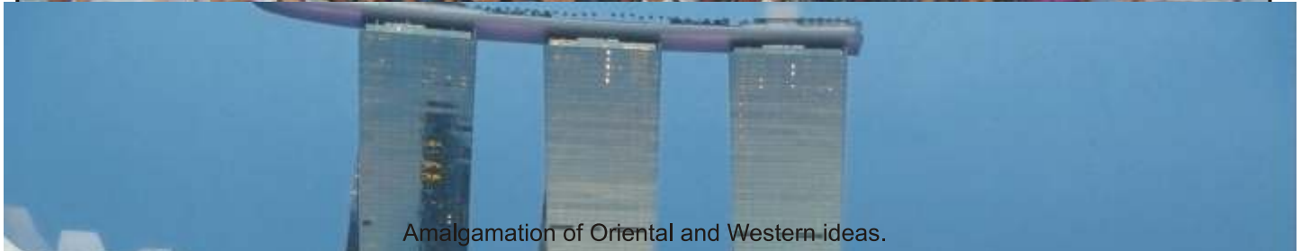
Amalgamation of Oriental and Western ideas.