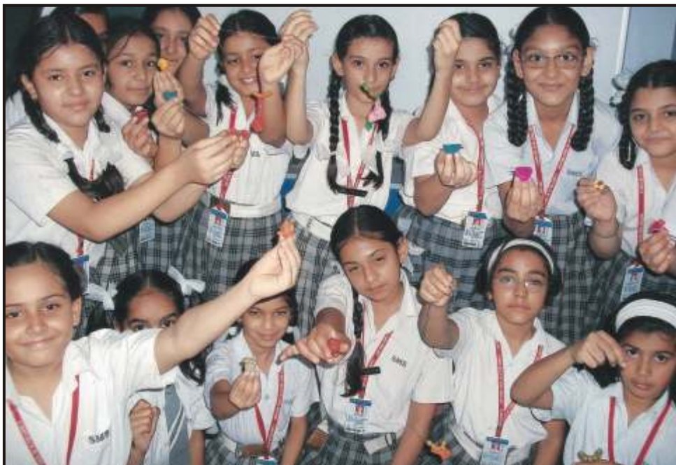
Excited to learn, the students flaunt their handmade beads.

A workshop to teach the students of class IV 'How to Make Beads' was organized by NIE as a creative venture of the NIE programme undertaken by TOI. An interesting interaction took place between the resource person and the students. The students were taught to make colourful beads and lovely flowers out of clay. Dainty beads and buds were tied into trendy necklaces which are in vogue these days. The students took part in this workshop enthusiastically. Little girls used their own imagination and creativity in making necklaces. Their aesthetic tastes were appreciated by all. It was a very beneficial learning experience for the students.