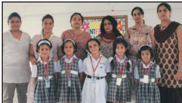
With twinkling eyes and a beautiful smile, the proud winners of English Recitation Competition of Class II pose for a perfect picture.