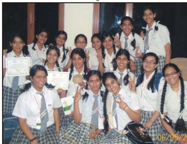
Together we can and together we will make a difference.