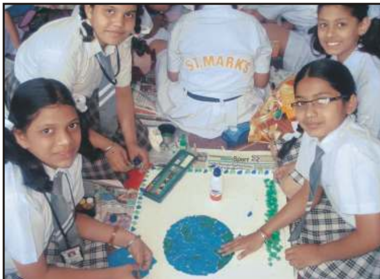
Our students posing for a photograph during the Earth Day Celebrations.