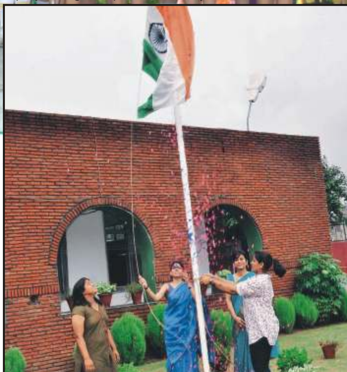
The Tri-colour being hoisted by the Principal and the Head Mistress of the school to mark the Independence Day.