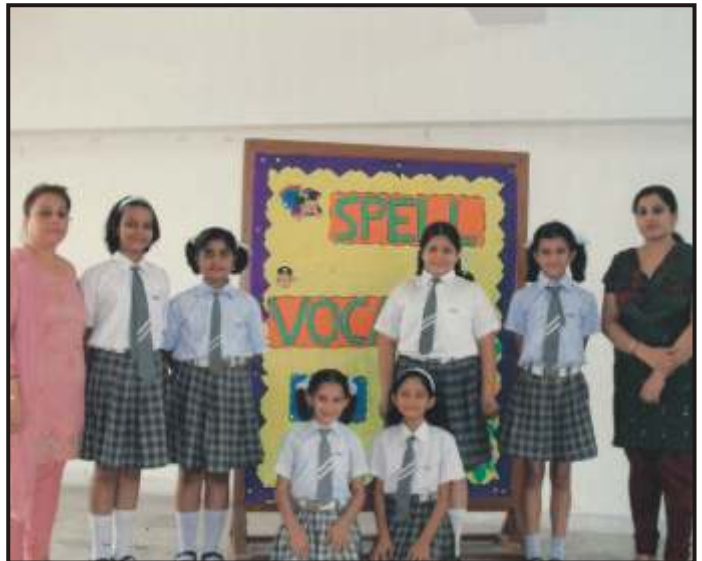
Winners of Spell- Vocab of Class V.