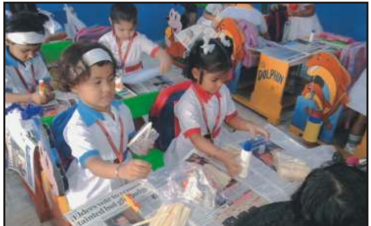
Honing their skills at a tender age, the toddlers make their best out of waste