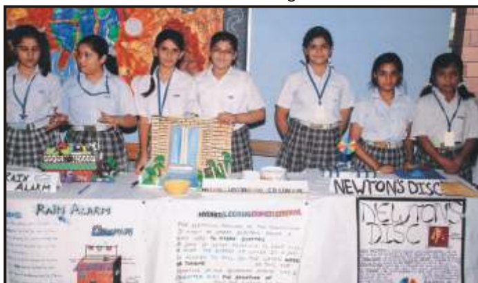
With a beautiful collage in the background, our budding Einsteins flaunting their models.