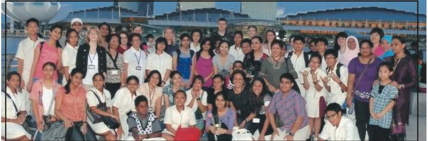
Enjoying an evening in Singapore, the students of AEC-NET, the world over, pose for a picture.