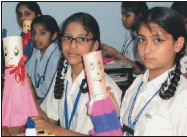
'Dolls are girls' first friend.'