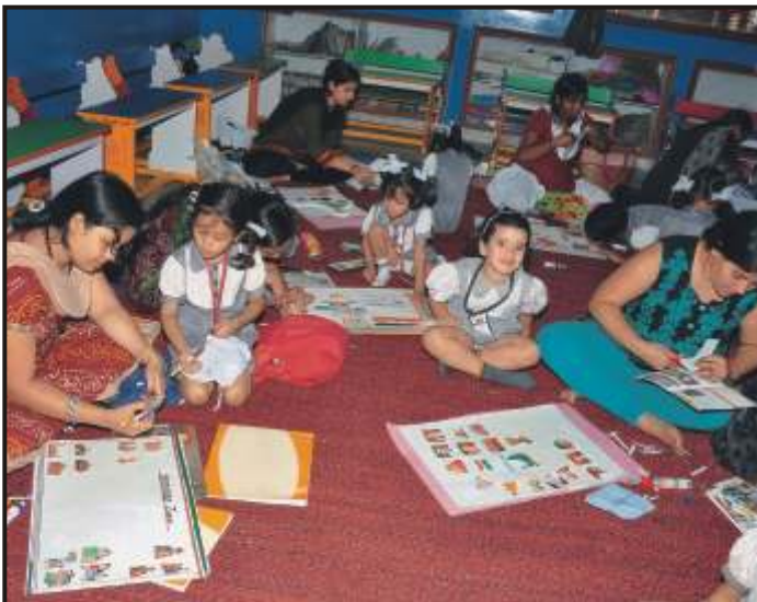
A conglorated effort by the parents and the students to depict India in the form of a collage.