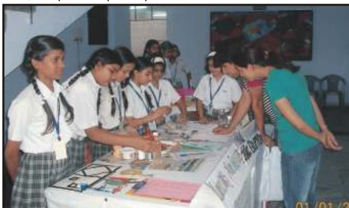
Parents brushing their own knowledge during the Science Exhibition.