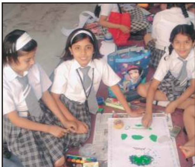
Students making a collage to mark the Earth Day.