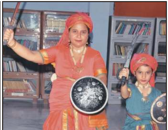
Winners of Character Dramatization- enacting Rani Jhansi- the legendary freedom fighter.