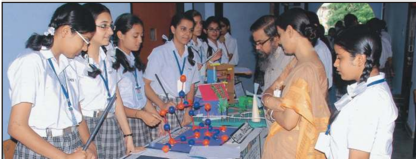
Keen to know the working of different Science models, the parents pose questions to the students.