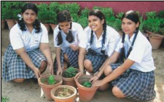
Our eco friendly students plant a sapling.

The students of class IX engaged in the AEC-Net Global Project-'Naga To Earth', planted a sapling each in the school garden. This act made them feel closer to Mother Earth and helped them understand the importance of plants for the environment. These students also went to a nearby village, Nangloi in Chander Vihar, for doing research work on the life of people living over there. They talked to some of the local inhabitants and did a survey on the changes in their life style over the past 25 to 30 years.