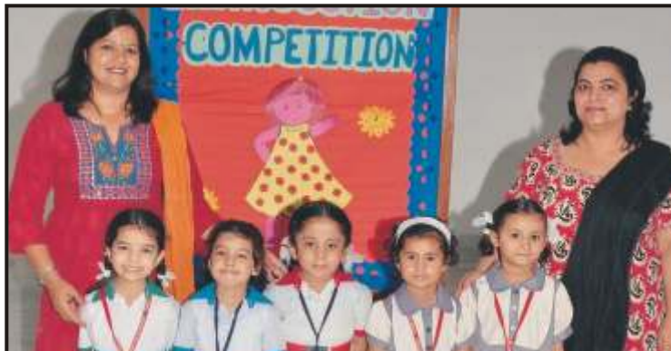
Sunshine smile on the faces of the winners of Self-Introduction Competition of Sapling.