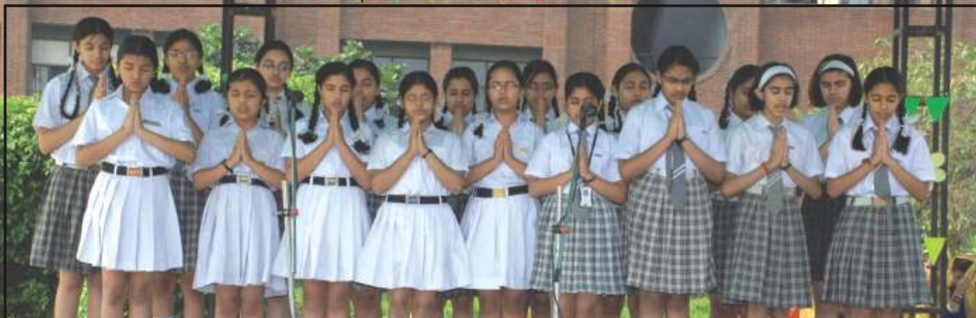
Invoking the Muses' – the students pray during the special assembly.