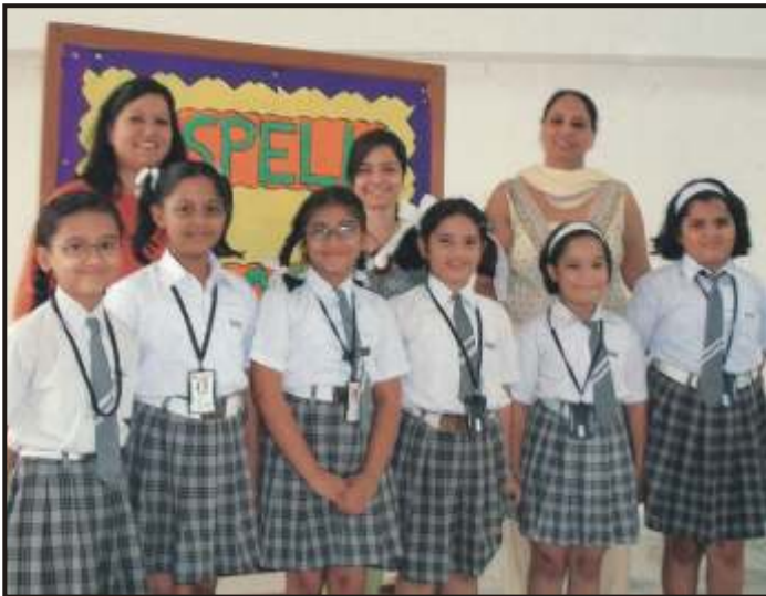
Striving hard to attain more knowledge- winners of Spell- Vocab of Class IV.

Spell-Vocab Quiz was conducted to test the knowledge of English language of the students of classes IV and V. There were six teams from each class challenging each other. All the teams gave a good fight to each other. There were several interesting rounds that perked up the students and their curiosity levels. There was a lot of excitement amongst the audience to answer the questions passed on to them. The quiz was an enriching experience for all the participants as well as the audience.