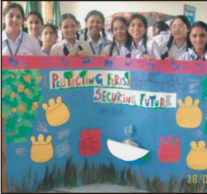
Students exhibiting their collage.