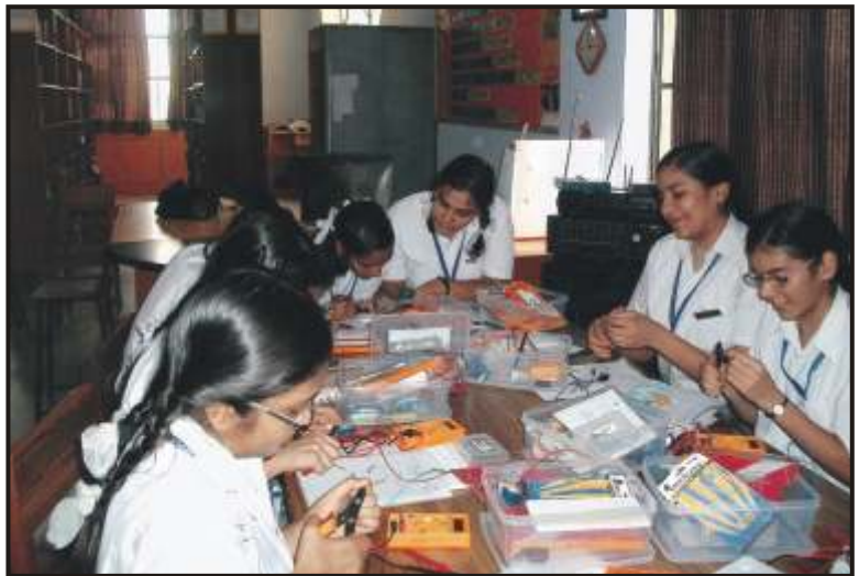
Having hand on knowledge about electronics.

Our school conducted an educational programme for the students of IX and X that gave them exposure to the 'World of Electronics and Technology'. Students achieved hands-on knowledge by playing with electronic components to make different projects. The methodology used for teaching in the workshops was very simple, systematic and innovative. Interactive presentations made the workshops full of fun and adaptive to students' psychology. In the workshops, students made different circuits using electronic components. On the last day of the programme a quiz was conducted to assess their learning. In this programme, students applied concepts practically to real time projects and explored beyond what they are taught in classrooms.