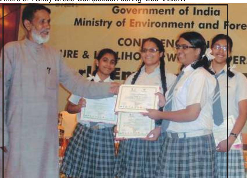
Proud to be Green Citizens, the students of our school being awarded.