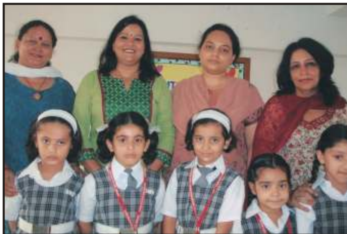
Winners of English Recitation Competition of Class I.