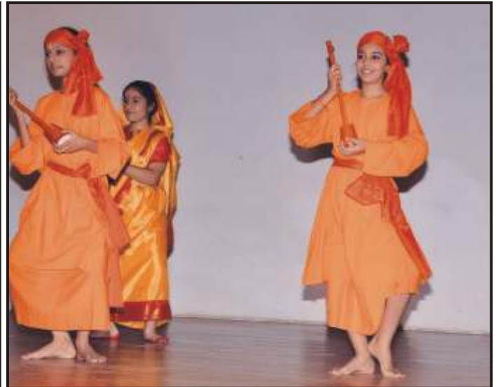
Our patriotic students performing on Tagore's composition translated in Hindi- ' Tu Chal Akela Re.'.