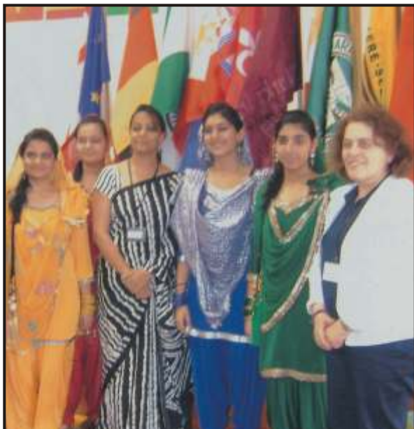
Spreading the colours of Punjab at Pioneer Secondary School, Singapore.

The students of our school were invited to be a part of the International Friendship Day Celebration along with reputed schools from Italy, Denmark, Phillipines and Germany at Pioneer Secondary School, Singapore. The delegation consisted of five students escorted by a teacher. The celebration was marked by a Welcoming Ceremony by the host school where teachers and students from different parts of the world introduced themselves. The Exchange Programme included a discussion on our Education System and AEC-NET Project to improve our teaching and learning methodologies. It aimed at giving exposure to the blooming youth of our country. The stay with people from different communities taught our students to be tolerant and accommodating of various cultures. They further developed a sense of mutual respect and understanding without any discrimination on the basis of caste, creed or colour. The programme also consisted of cultural performances and presentations by the students from different countries. Our students got an opportunity to experience the exclusive Night Safari at Sentosa Island, and they also visited Chinatown, Tea Chapter etc. The Exchange Programme helped to foster a strong bond and lasting friendship between the people of different countries.