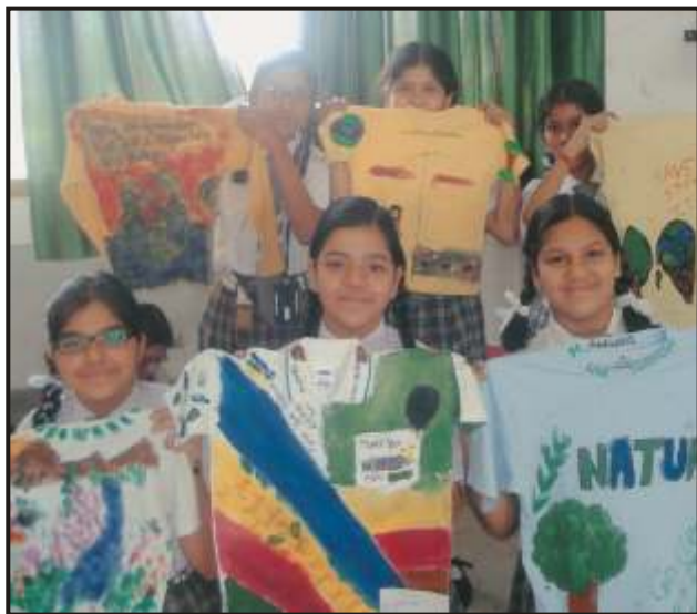
Our little nature lovers paint their T-shirts to exhibit their love and concern for the environment.

Our school celebrated the Earth Week to enlighten the students of our school about the various environmental issues prevalent these days. Various activities took place during this week for classes VI-X. This not only brought to the surface the creative skills of the children but also made them learn and know about the various problems faced by our environment.