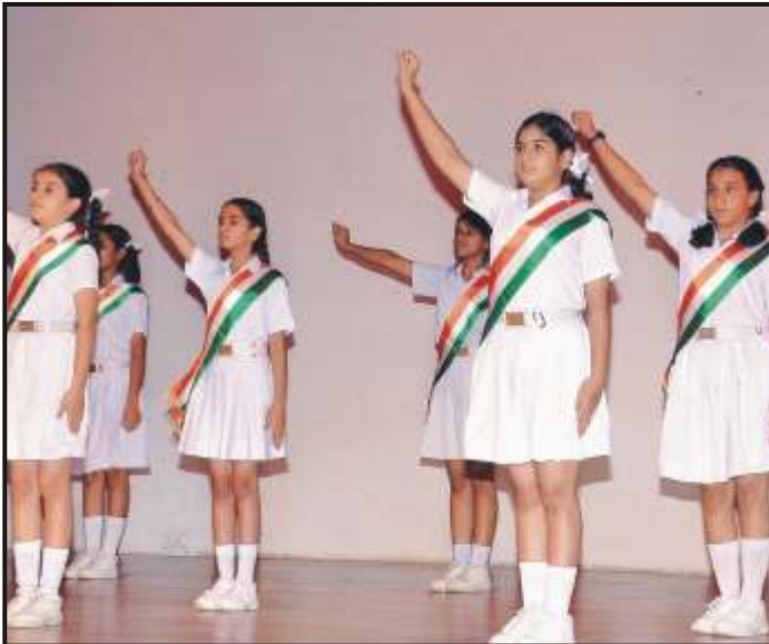
Rendition of our National Anthem in a unique way.