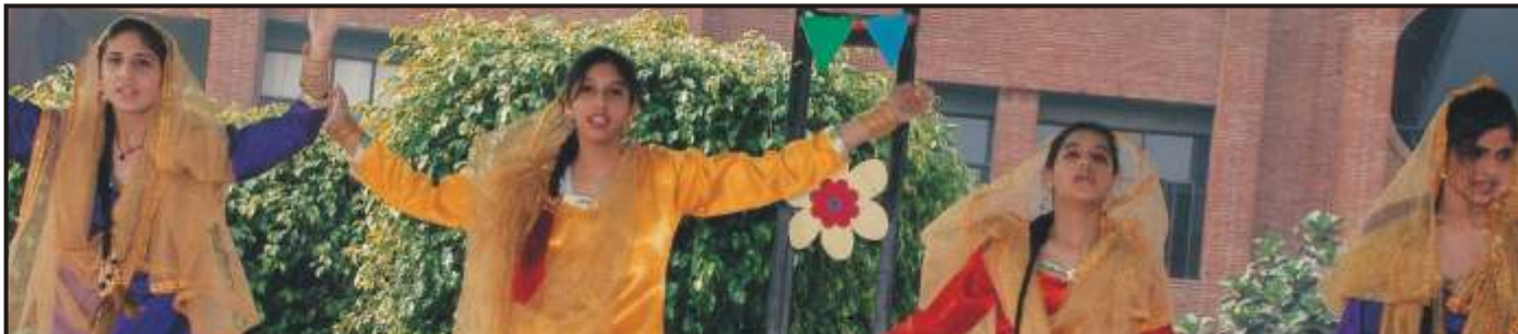
A Gidda performance to mark the harvest festival.