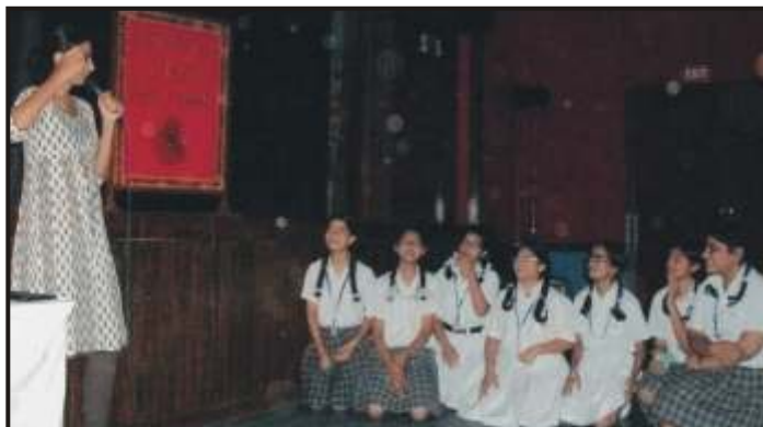
An interactive session with the resource person during the Animal Care Workshop.