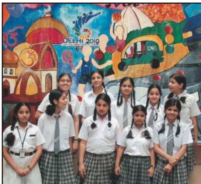
Our young artists with their work in the background.