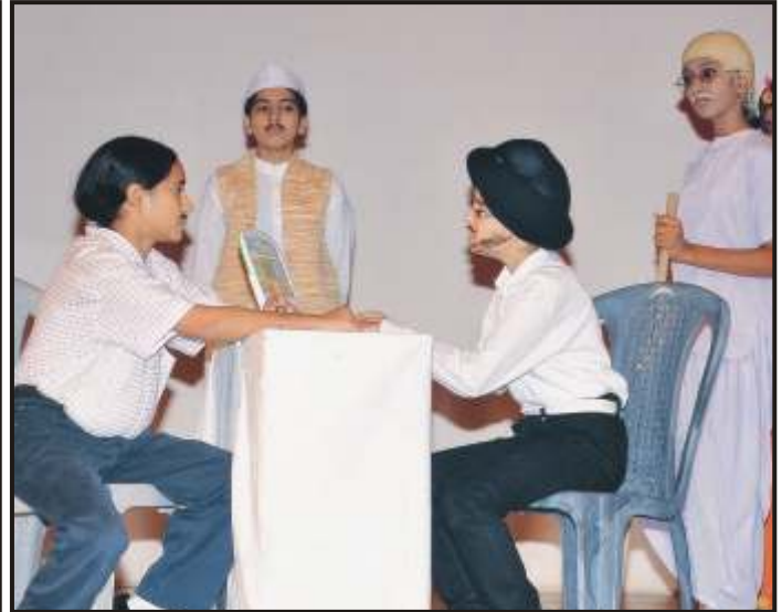
A short Hindi play on the present-day India by the students of Class VII.