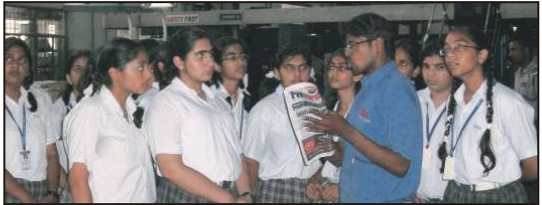
Getting hands on knowledge about the printing of newspapers.

The students of IX standard of our school visited the HT Press on a bright Saturday morning in August 2011. This visit opened new vistas of knowledge for them as they learned how these simple newspapers are printed and sent across to them. This experience left the students enriched as well as entertained.