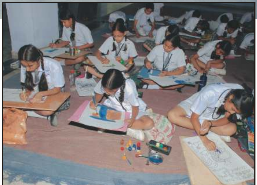
Participants engrossed in their work during the Poster-Making Competition.