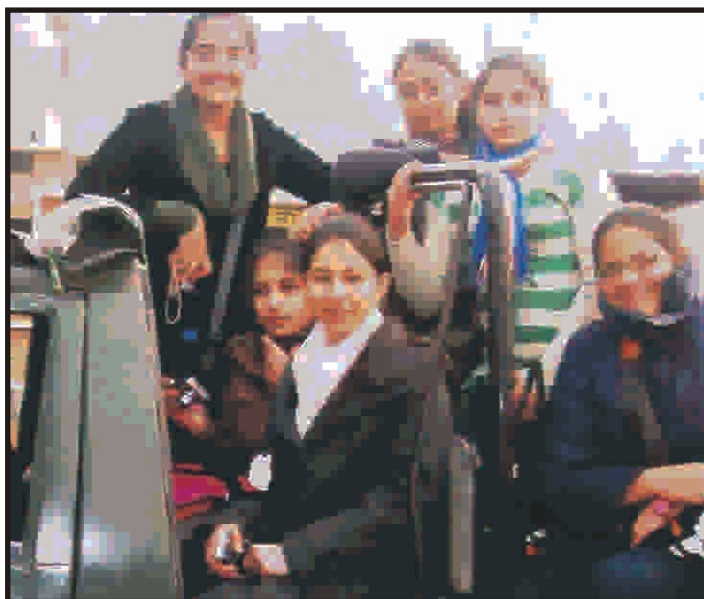
Our students enjoying their trip to Jim Corbett Park.