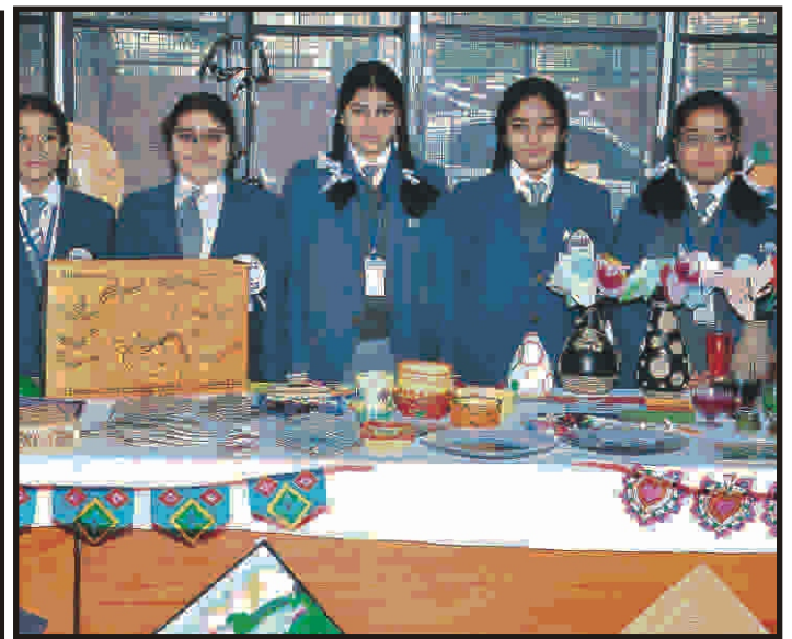
A beautiful display of Art and Craft by the students.