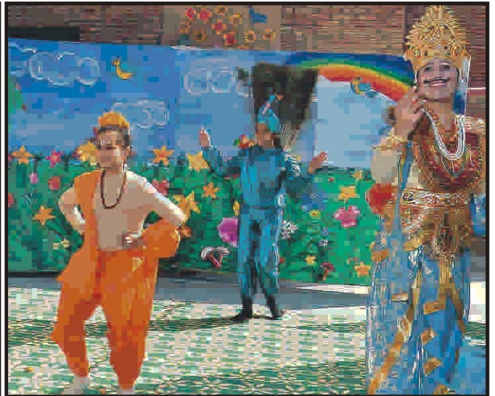
'Shakuntalam' being performed in the Natyashala.