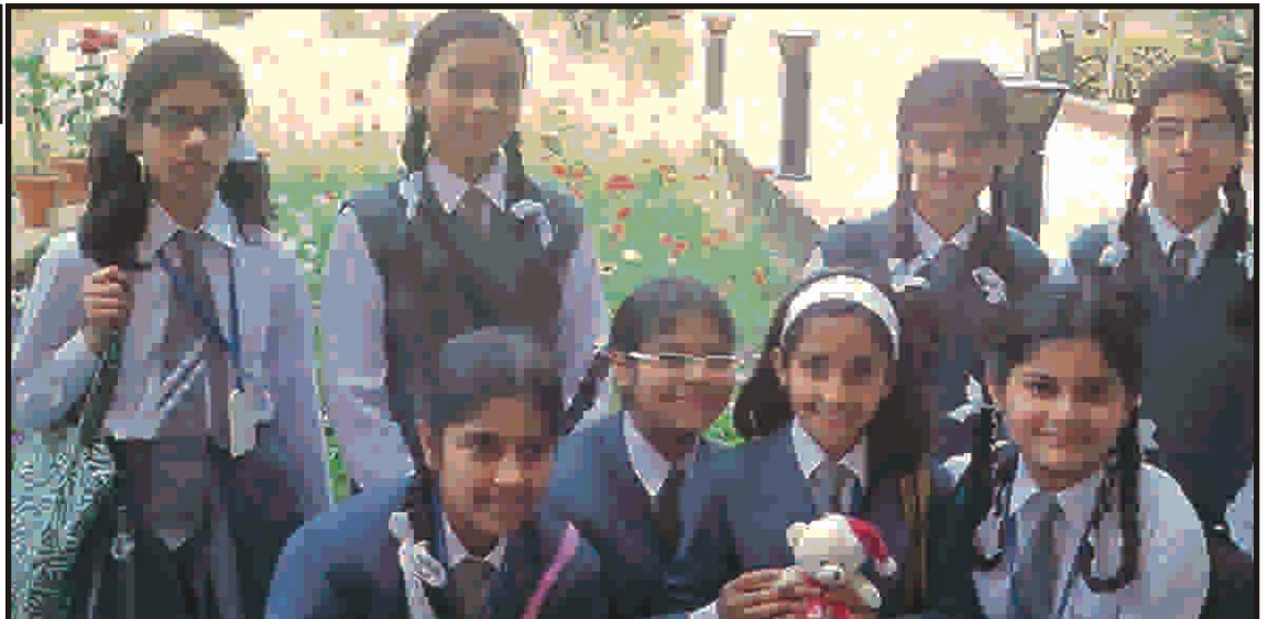
"Project Teddy Bear"- Our knowledgeable darlings pose with their darling teddy.

The children of the 'Travel Teddy Project' took their teddy-Snowy India to a temple, gurudwara and a nearby market on 15 March 2012. They clicked a lot of pictures with the Teddy and had fun. They all enjoyed eating gol guppas and chuski with the teddy. Snowy India will soon leave for Malaysia.