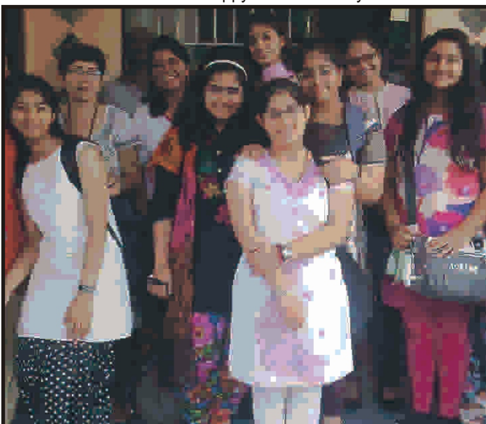
Our zealous students ready to embark on a new adventure.