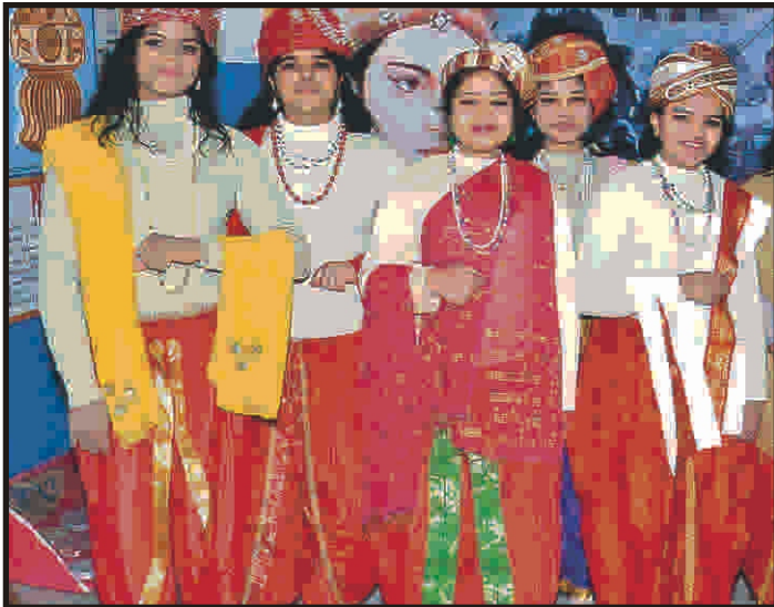
The rulers of the Gupta dynasty in their princely attire.