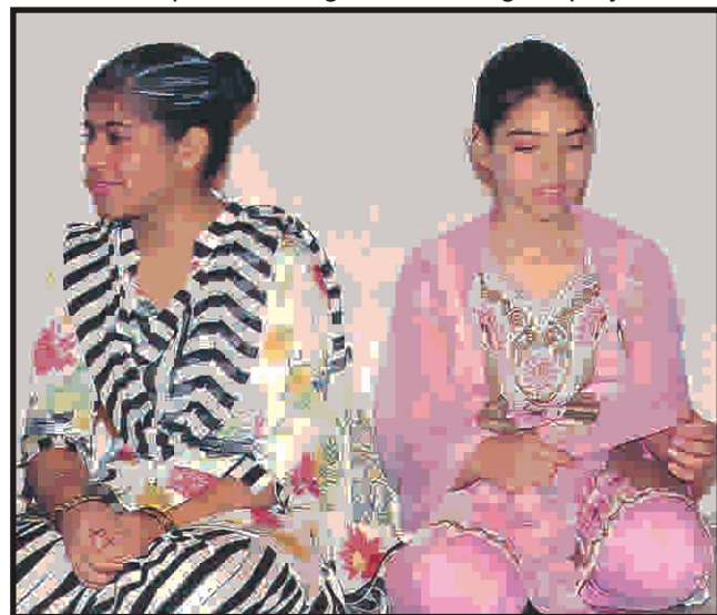
Class IX students enacting the play 'Repentance'.