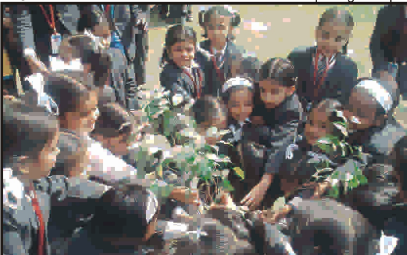
Our little angels in the lap of nature

A visit to a Botanical Garden was organized on 27 February, 2012 for the students of Seedling and Sapling. A plantation drive was conducted at the Botanical Garden. The plantation drive was an attempt to sensitize the tiny toddlers towards the importance of a green environment. The little buds planted saplings to make the place more beautiful and lush. The little ones also had a good time staying close to mother nature as they enjoyed the bio-diversity of the park. They were excited to see the ducks in the water pond and thus had fun and frolic.