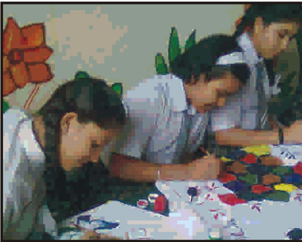
Students enjoying painting their T-shirts.

Delhi recently celebrated 100 years of existence and the Hindustan Times justifiably made it an unforgettable event for all. To celebrate these 100 years of Delhi, the Hindustan Times held a T-Shirt Painting Workshop for the students of class VI of our school in the month of December. The workshop brought out the talent of the students as they coloured and decorated their old T-shirts and turned them into art works on which they poured their love for Delhi.