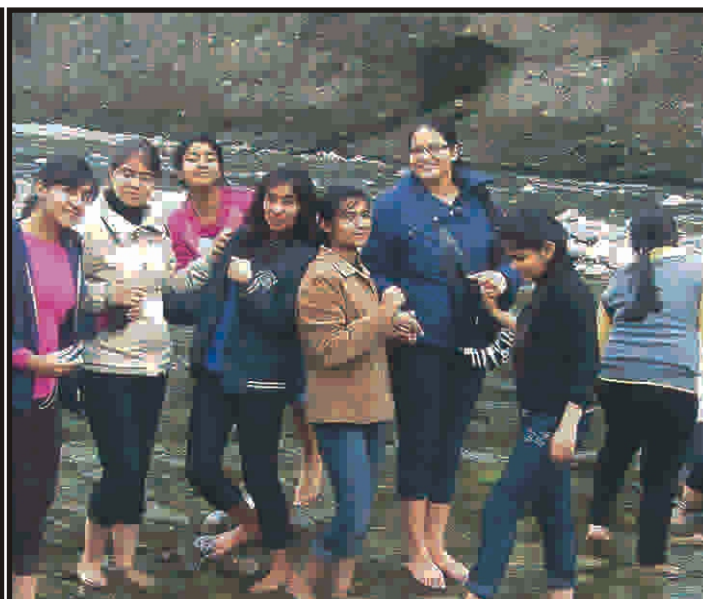
Enjoying the bounty of nature with ready smiles.