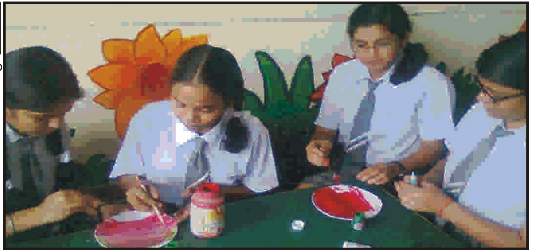
The Crackle Painting Workshop in progress.

HT Pace organized a workshop in collaboration with Fevicryl Pidilite for the students of class VIII of our school. Students learnt the creative art of painting flower vases, ceramic plates, pots and utensils using the crackle medium of Pidilite. The workshop was a fun learning experience for the students as they learnt an innovative skill that added all the more colours to their creative insights.