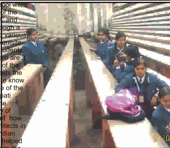
Our little explorers at the 'Jantar Mantar'.

To give the new year an amazing start, the students of our school went for an educational trip round India's capital city-Delhi as a part of the global projects –“Cosmopolitan Passport”, “Hop on and Hop off” and “Windows to the Past”. It helped them view different places through a totally new perspective. The students with their teachers visited various historical landmarks of Delhi on 4 January 2012 to enjoy the exquisite beauty of Delhi. First of all, the India Gate was visited by the students. There the students got to know more about the India Gate. There are 3 flags at the India Gate. Each flag represents the armed forces of the nation; the red flag represents the Army, the white flag represents the Air Force and the blue flag represents the Navy. They also got to know about the height of the India Gate. They even caught a glimpse of the Republic day parade rehearsal. Then they went to the Rashtrapati Bhawan. While walking to the Rashtrapati Bhawan, they saw the Parliament House, the Ministry of Home Affairs and the Ministry of Finance. Then they visited the Jantar Mantar. There they learnt how time was calculated through structures designed by Indian architects in the ancient times. In their hearts, they applauded the ancient Indian architects who had very unique and innovative ideas that have helped our country make a mark in the world. This visit helped to nurture the 'Cosmopolitan' in them.