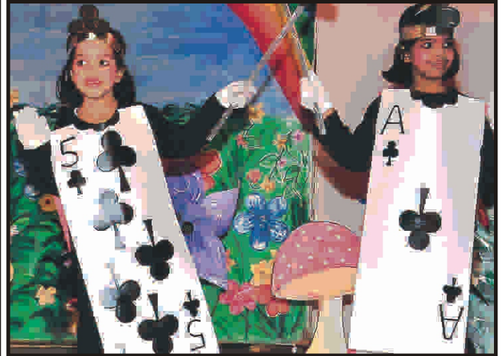
Our tiny- tots put up a mesmerizing performance.