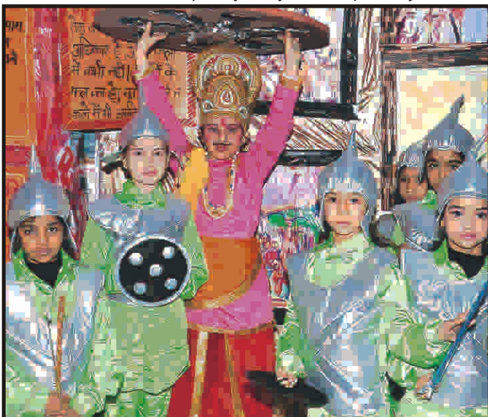
. A glimpse of the Mahabharata.