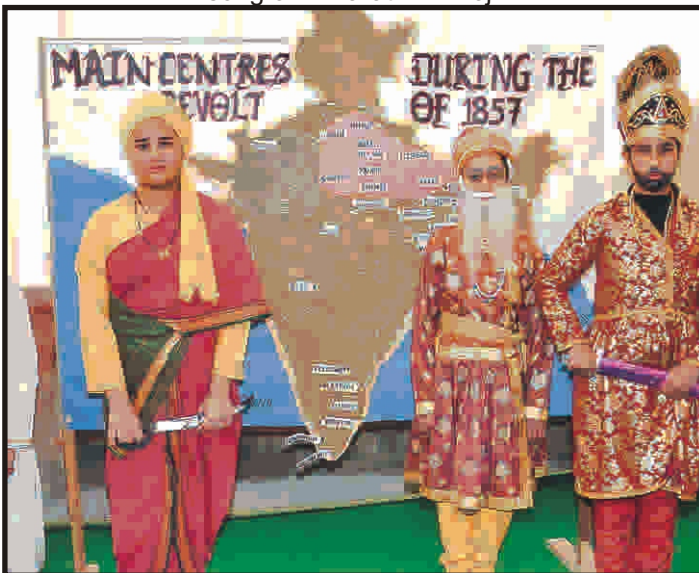
Our students posing as the rebels of the Revolt of 1857.