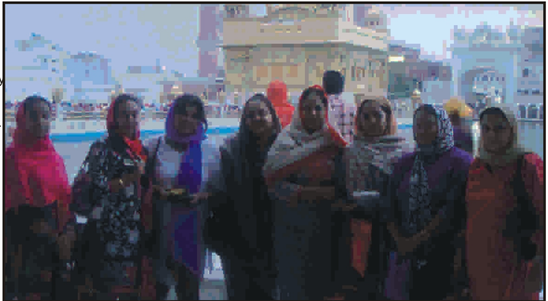
Our staff members posing for a picture with memories that would last a lifetime.

The teachers of our school went on a two day trip to Amritsar. It was a retreat for all at the end of the academic session. They visited the Wagah border where they sang patriotic songs alongwith others. Apart from that, they also visited the famous Harmandir Sahib. The staff members went to the Golden Temple and paid their obeisance. The trip was full of fun, food and peals of laughter.