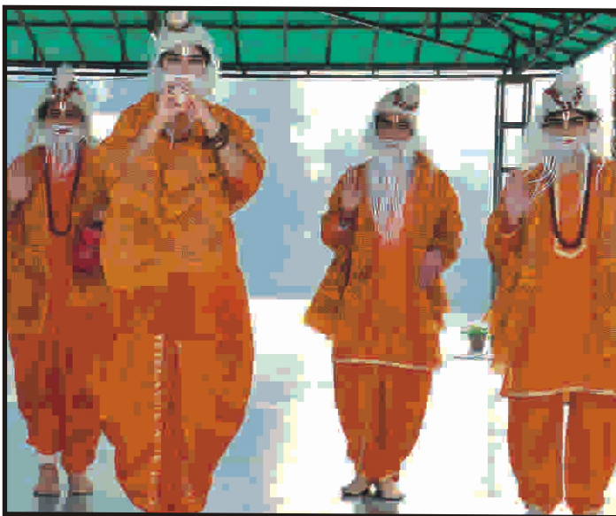
Sages of the Satyuga.