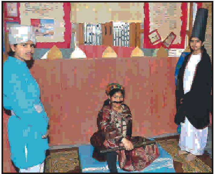
. Akbar in his Ibadat Khana.