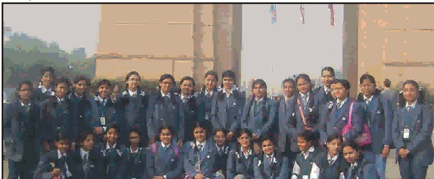
Our young historians at the 'India Gate'.