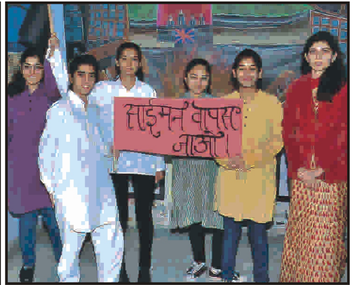
'Reliving the past'; our students showcasing the 'Simon Commission'