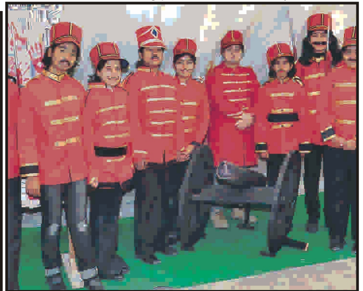
Sepoys ready for mutiny.