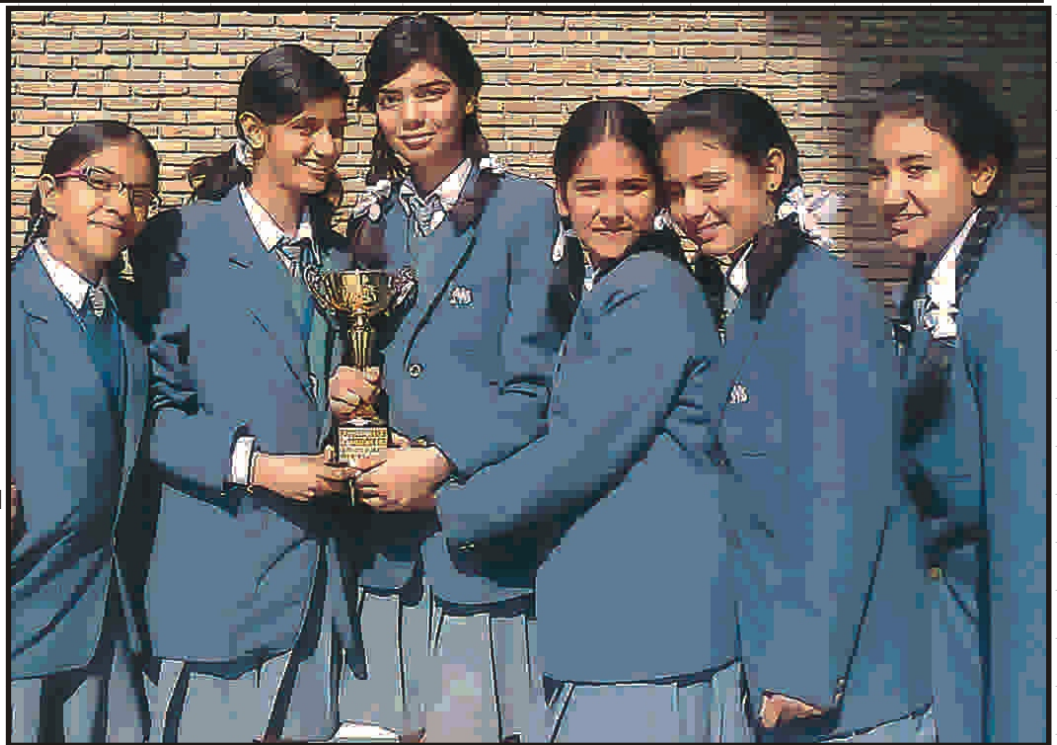
Winners of the National First Federation Cup flaunt their award.