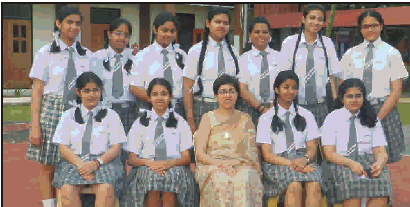
Attending the school assembly at Seri Puteri Science Secondary School ,Kuala Lumpur