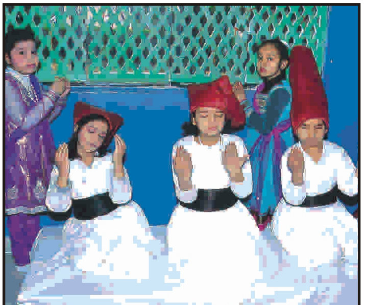
Little hermits portraying the Sufi Movement.