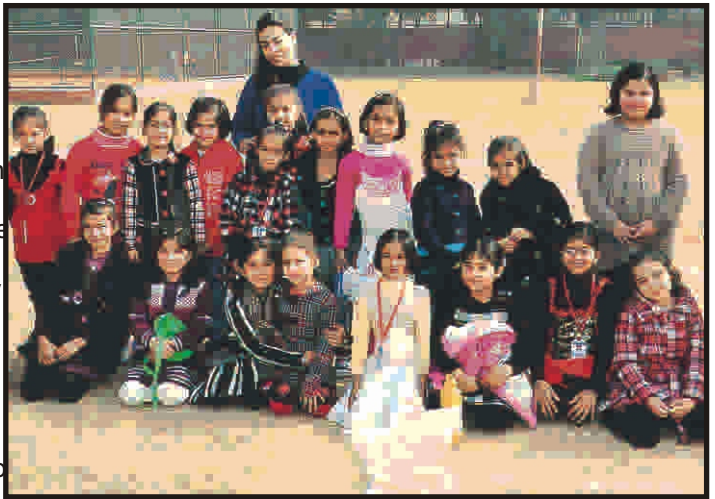
Christmas time is 'Party Time' for the students in the school.

The Christmas season is marked with festivities, spreading its charm everywhere. Our school celebrated Christmas amidst fun and fervour. The celebration began with a thanksgiving to Lord Almighty followed by a Carol singing event for the tiny tots of Seedling and Sapling classes on 21 December 2011. The rendition of festive favourites such as 'Rudolph the Red Nosed Reindeer', 'Joy to the world', 'Jingle Bell Rocks' etc. captured the spirit of Christmas. The students of classes Seedling to VI enjoyed themselves thoroughly during the Christmas parties organized specially for them. To add to the Christmas cheer, IV and V class students presented Christmas plays on 23 December 2011 in the school auditorium. Class V students presented the 'Nativity Play', which showcased the story of the birth of Jesus Christ. Class IV students' play was titled 'A Celebration called Christmas' and was a treat for the eyes of the audience.