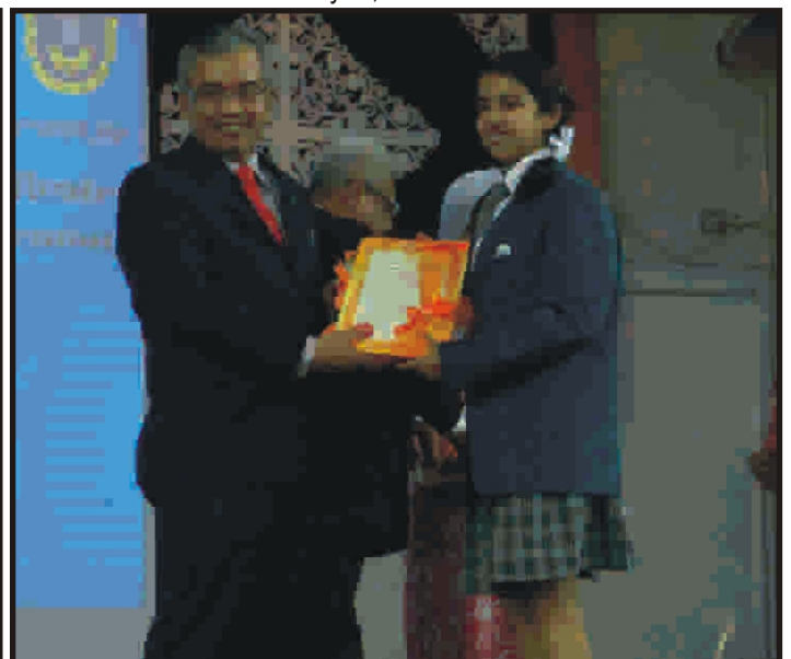
Receiving certificates on behalf of the student delegates participating in the International Symposium.