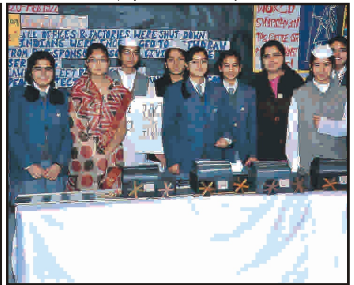
Bringing alive the Non- Cooperation movement and the Kakori Conspiracy.