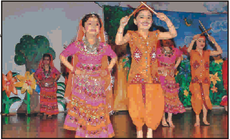
Our little cherubims performing 'dandiya'.

Just as every year new flowers bloom with the coming of spring similarly new buds bloom in our school every year. To welcome the students and the parents of Seedling, an Orientation Programme was organized in our school. The incredible performances of our tiny tots rejuvenated the parents. The Principal, Ms Sheena Kalenga apprised the parents of the rules and regulations of the school. Our little cherubims performed a folk dance and also presented a short play 'Alice in Wonderland', leaving the spectators spell bound and ecstatic. The show was applauded by one and all.