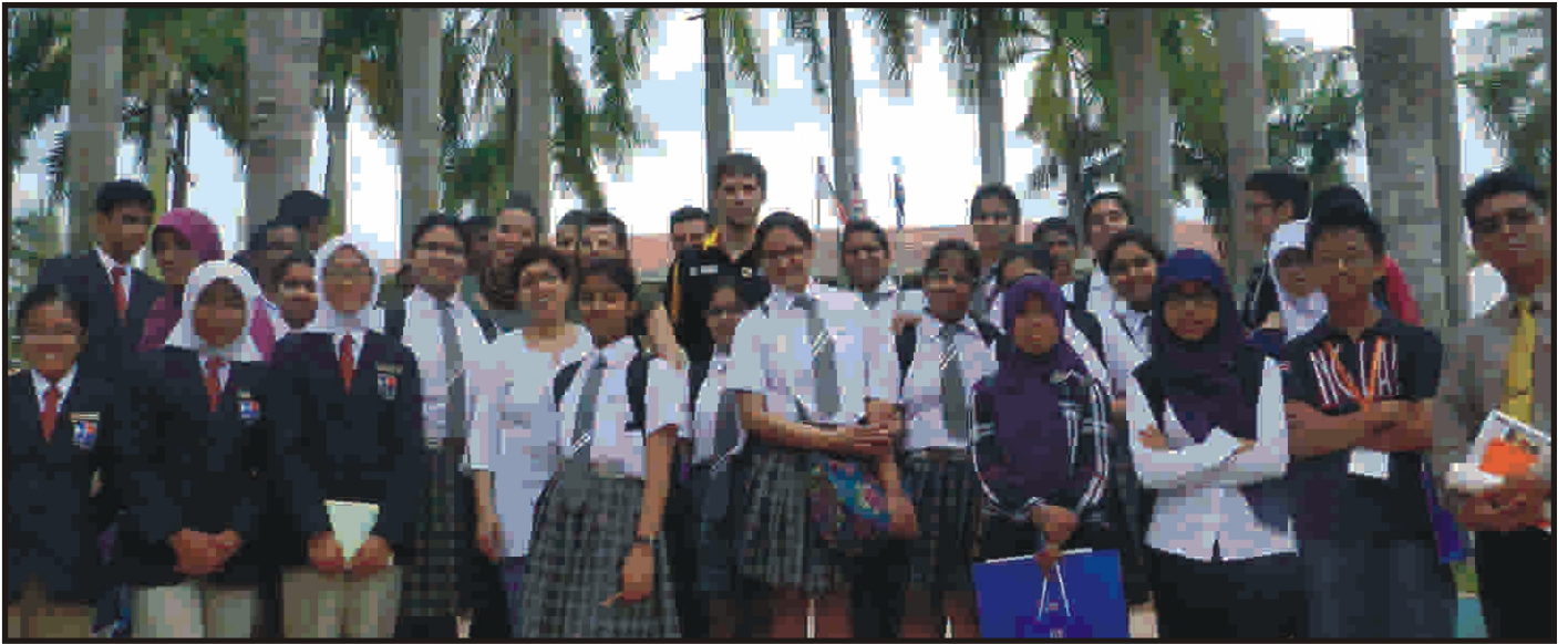
Our students joining hands with students of Kolej Yayasan Saad in Melaka, Malaysia alongwith students from Indonesia and Italy.