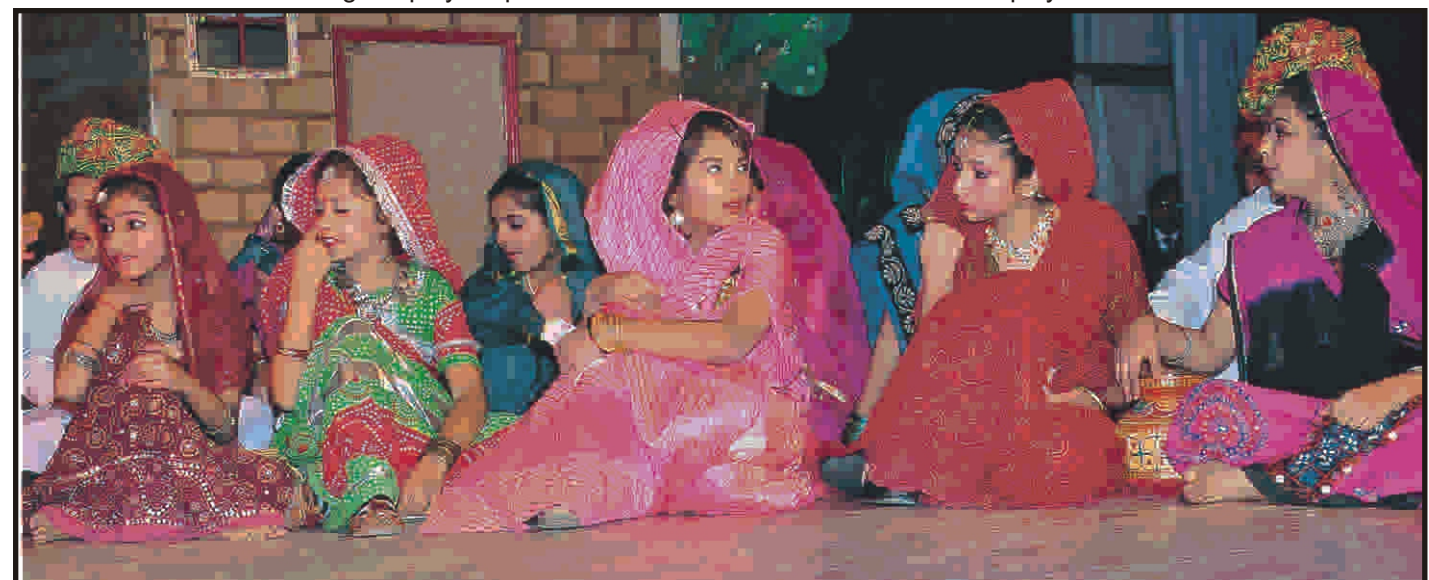
A village panchayat scene presented by Class VII.