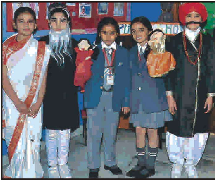
Our talented students dressed as Social Reformers.