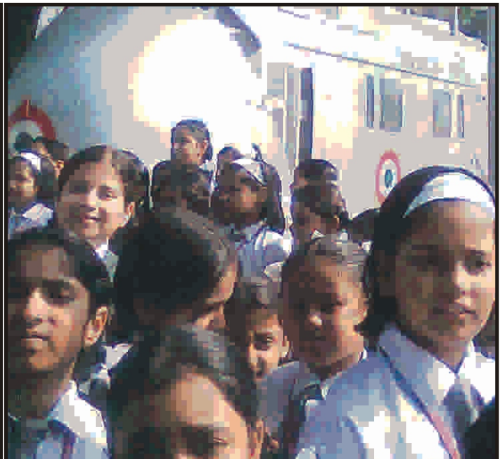
Happy faces at the Air Force Museum.