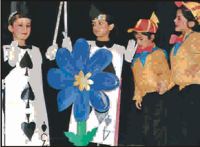
Our budding actors charm the audience.