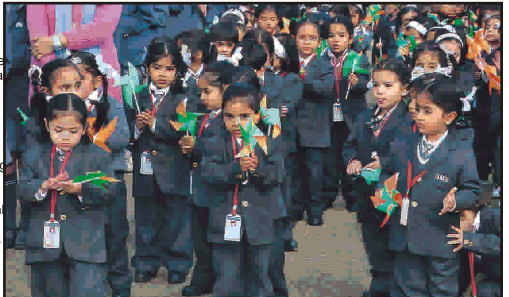
Our tiny-tots celebrating the spirit of freedom.

26 January is a red letter day in the history of our country as it is the day when India became a republic. As true patriots, the students of our school celebrated the Republic Day with great zeal. A general assembly was held on this day where the students of class VI sang a patriotic song. The song was followed by our Principal's speech which gave the message of cultural values and ethics, and infused the spirit of nationalism in the students and the teachers. The celebration aroused in the students the importance of being an Indian.