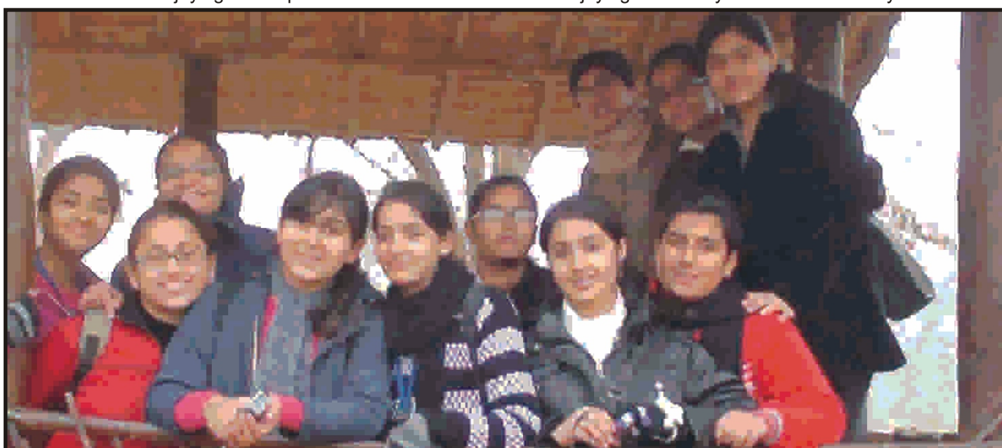
Falling in love with Mother Nature.