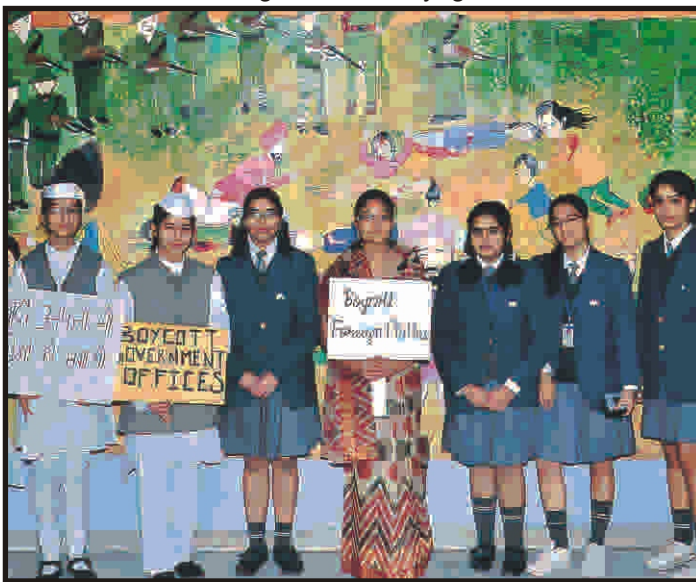
Our students depicting the Boycott Movement that took place during the British rule.