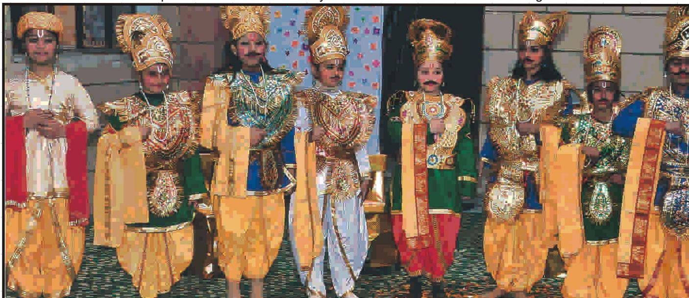
Kauravas and Pandavas playing 'Chaupar'.