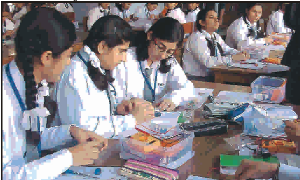
Creative minds at work with their electronic kits.