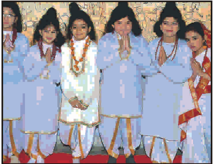
The Pandavas in exile.