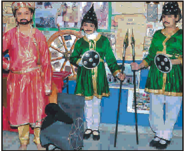
. A student dressed as Babur with soldiers.