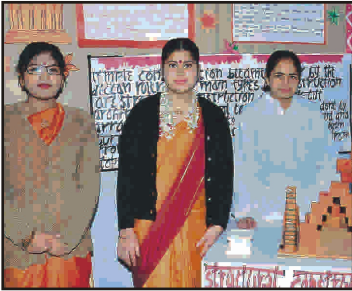
. Our students dressed in South Indian attire presenting the heritage and culture of the southern states of India.