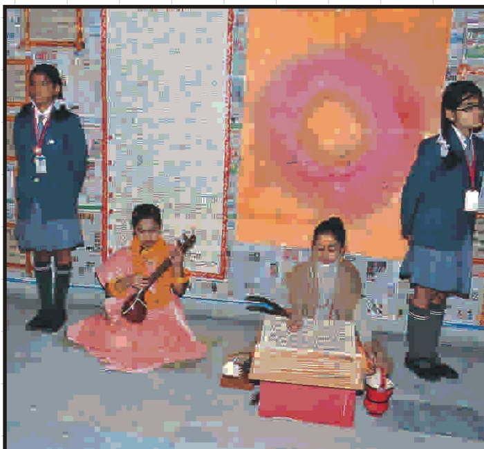
Our zealous students depicting the Vedic Age.