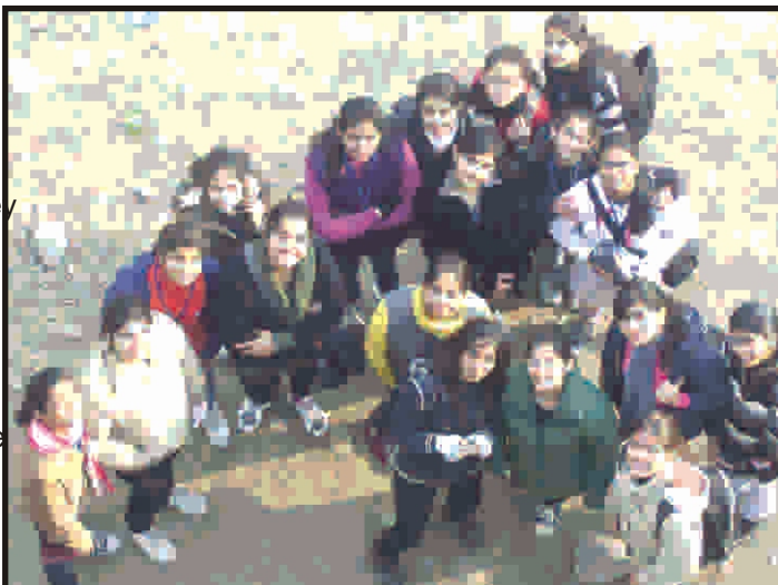
Our environmentalists embark on a thrilling journey.