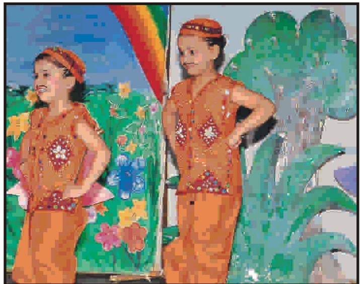
A foot tapping dance to enthrall the audience.