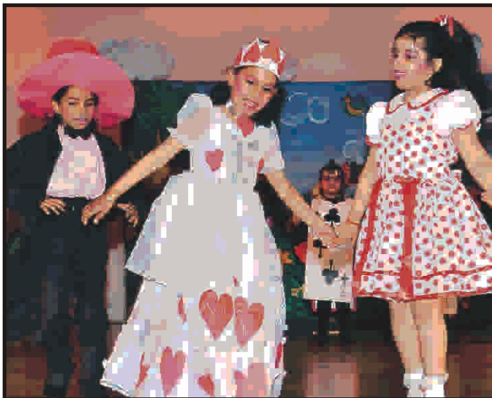
Bringing alive the magic of 'Alice in Wonderland'.