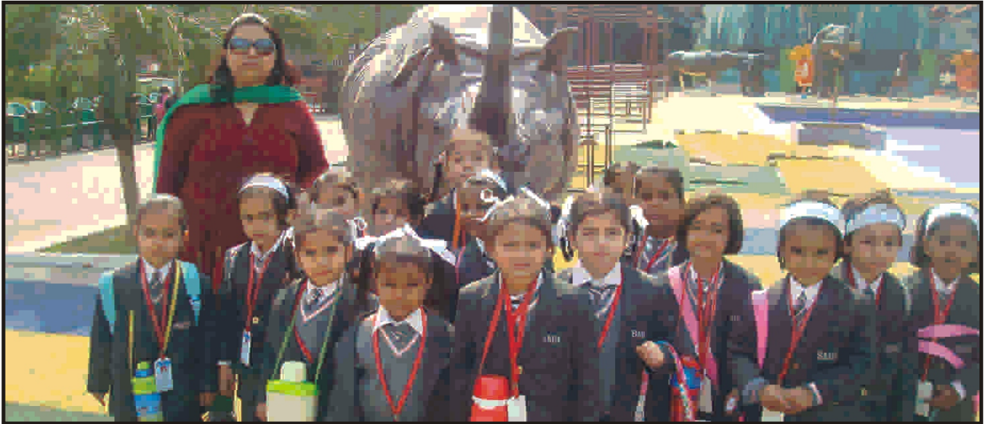
Having a gala time at Fun 'n Food Village.

A picnic is a short trip for pleasure to a beautiful place. It provides us with much needed leisure. Picnics add spice in our life and refresh our tired nerves. Our school planned an excursion to Fun n Food Village for the students of Sapling class on 16 February 2012. The young ones of Sapling were thrilled and excited. The air was filled with music and the shouts of children enjoying themselves. Children enjoyed various rides like Express Train, Space Journey, Fun Ball, Caterpillar Ride etc. Sumptuous lunch was served to the children. A dance competition was also organized for our tiny toddlers. Children danced to famous Bollywood songs and came back with cherished memories.