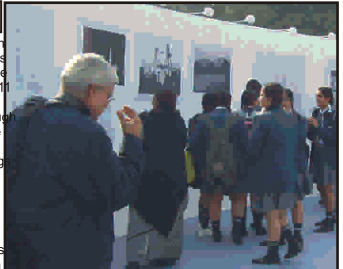
Our students admiring famous art work.

As a part of the AEC-NET Projects -"Picture it". "Cospopolitan Passport", "Hop on Hop off", our school provided our students an opportunity to view the history of their capital i.e 'Delhi'. The students were taken to an Art Exhibition on December 17, 2011 at Janpath in Delhi. The cultural exhibition gave a better and clearer view of the history of our city to all the students. Through the medium of photographs and paintings, they visualized the major movements which took place in India to eradicate the British rule from our country. The exhibition even had paintings and photographs of the map of Delhi in different years under the rule of different rulers. Movements like the Non-Cooperation, Swadeshi, Boycott and the Civil Disobedience were depicted in a very realistic manner. Paintings depicting the historical moment when Delhi was made the capital a century ago were also viewed by the students. The visit to this exhibition awakened the spirit of patriotism and nationalism in the hearts of the young ones.