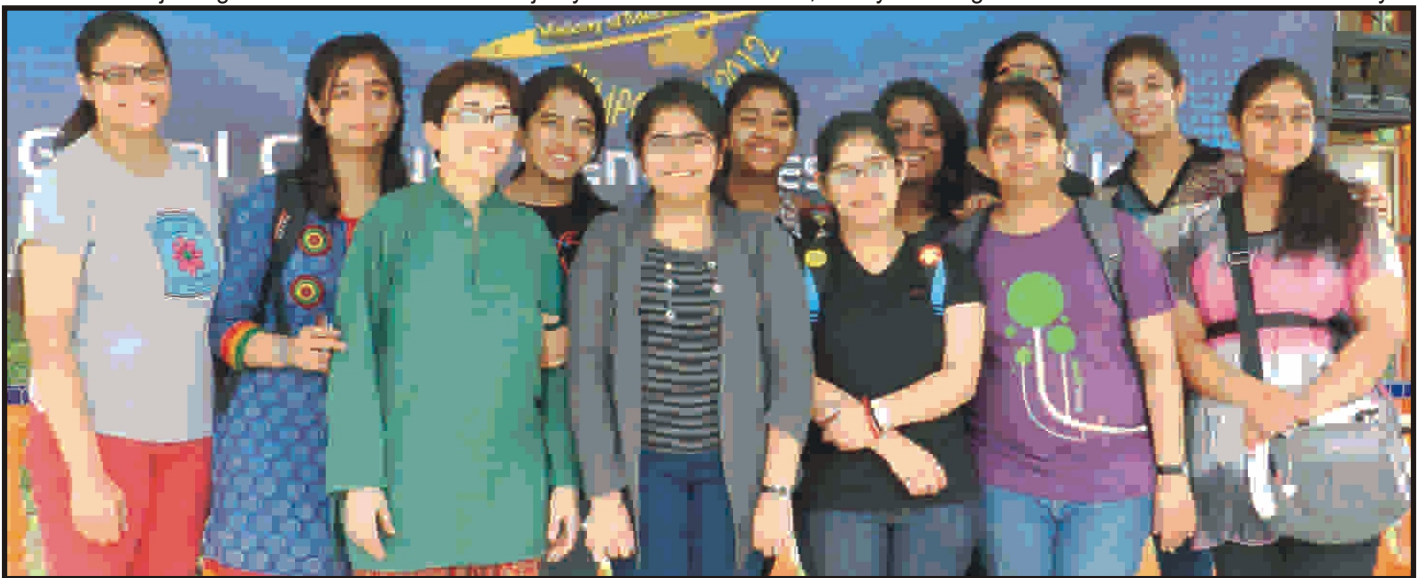
Happy to reach Malaysia to attend FRSIS 2012 at SMS Muzaffar Syah, Melaka.