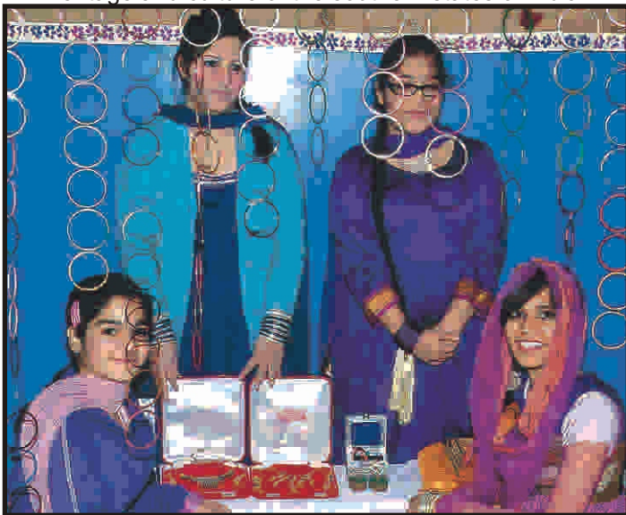
A glimpse of Shah Jahan's Meena Bazaar.