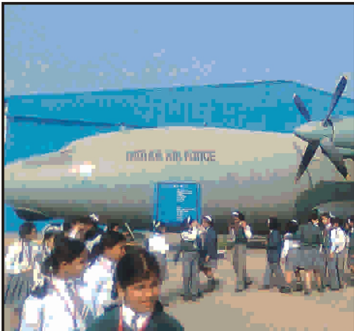
Our enthusiastic students gazing at the old marvels of our Air Force.

The Times of India, under its NIE programme, organized an educational excursion in the month of December to the Air Force Museum for the students of class IV of our school. On this trip, the students learnt the history of the Indian Air Force. It was fun for them to see fighter planes like-MIG, Jaguar etc. The students also saw parts of the enemy planes and choppers damaged during the India-Pakistan war in 1971. There was a wonderful display of artillery, uniform and the achievements of the Indian Air Force officers which infused a great patriotic feel in the students. This kind of an outing was a welcome change for the students.