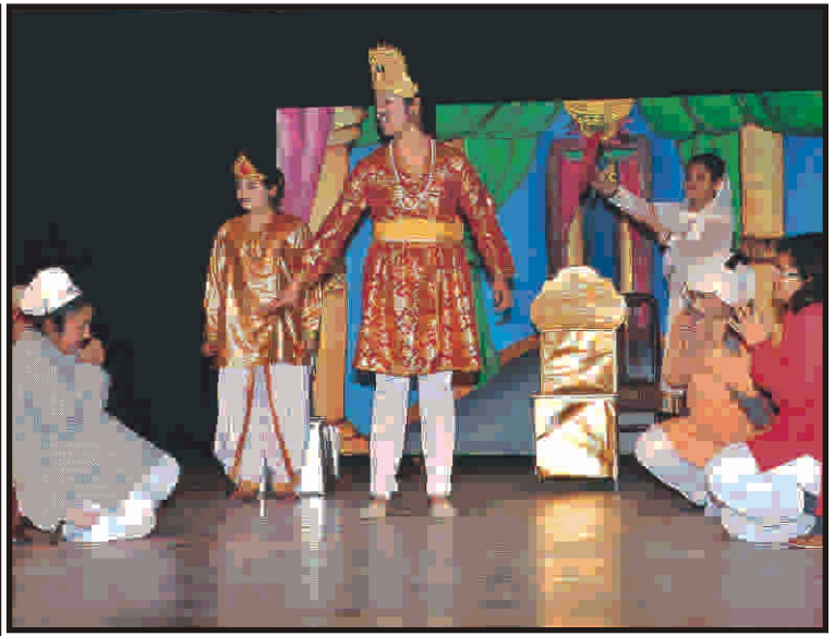
Scenes from the Hindi plays.