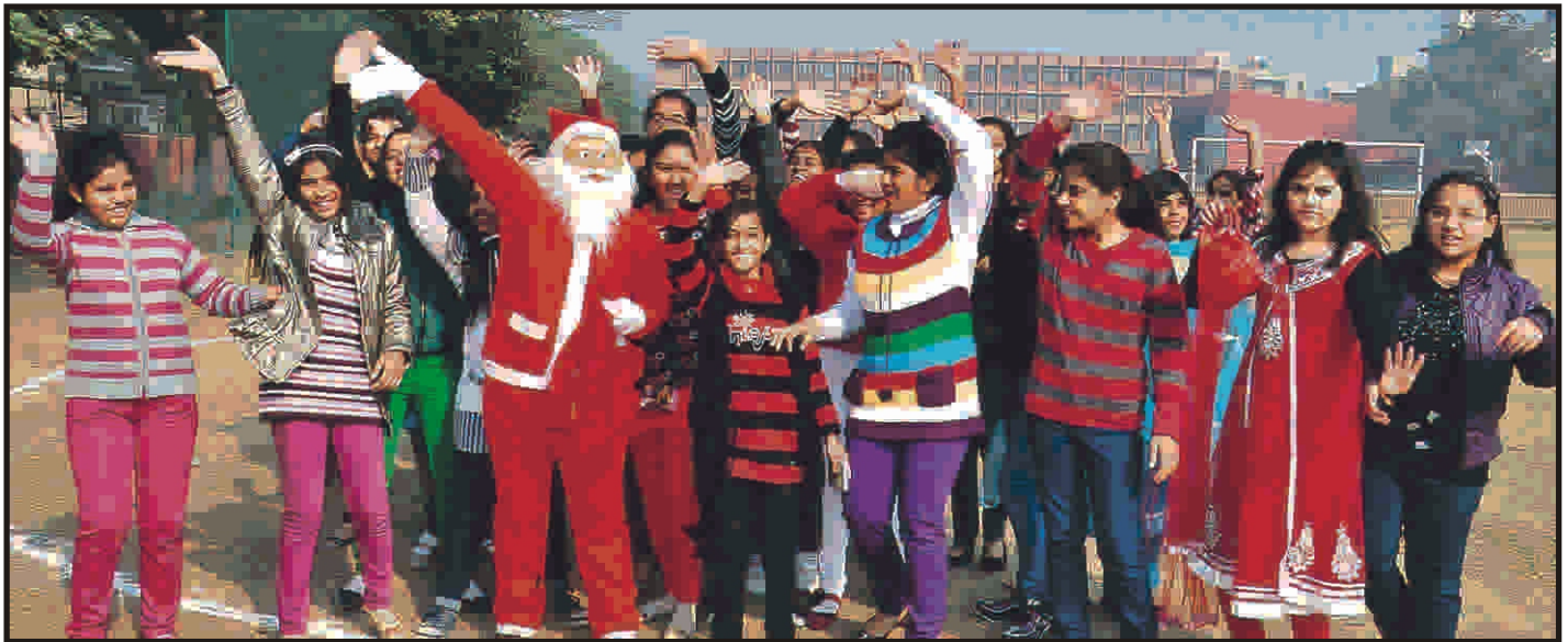
Students of class VI enjoying Christmas with Santa.