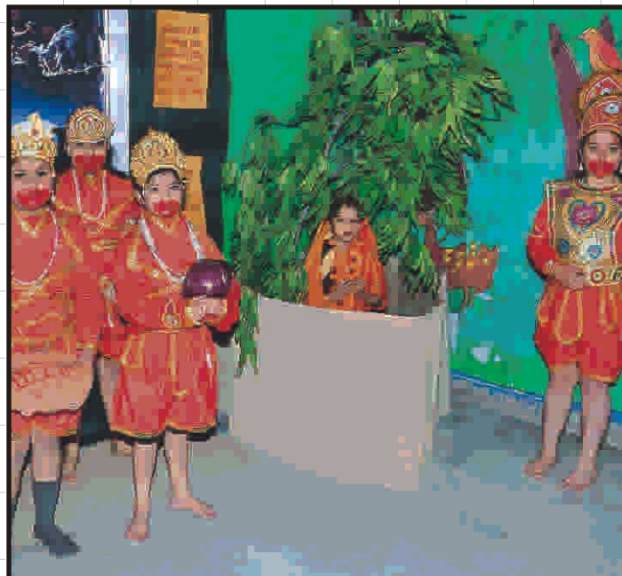
A scene from the Ramayana.