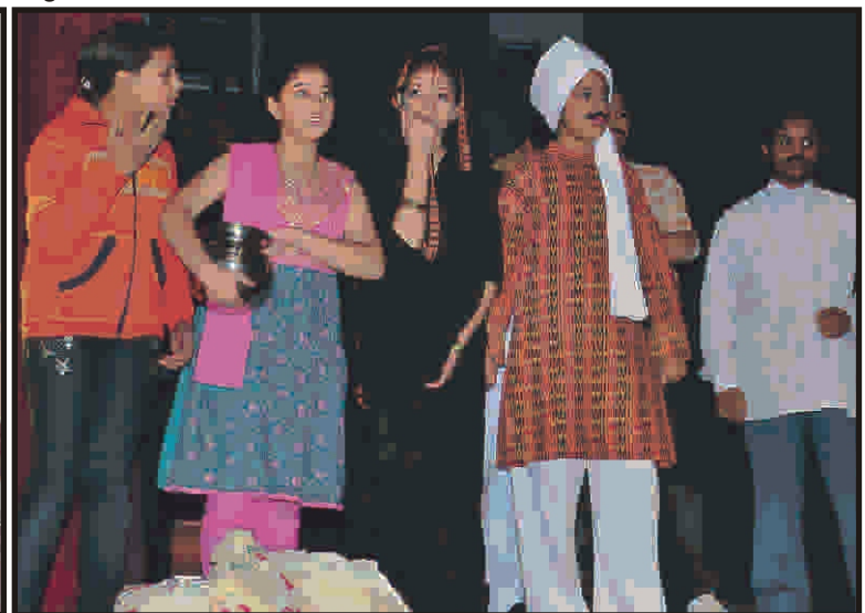
A scene from the play 'Ek Chori Aisi Bhi'.