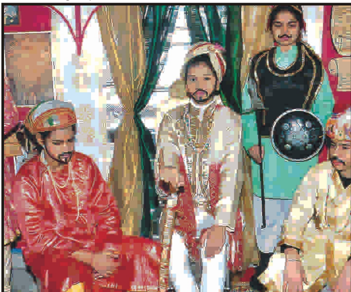
Humayun in his court.