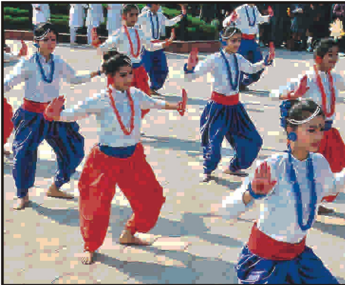
A mesmerising dance performance on the title song of ' Bharat Ek Khoj'.