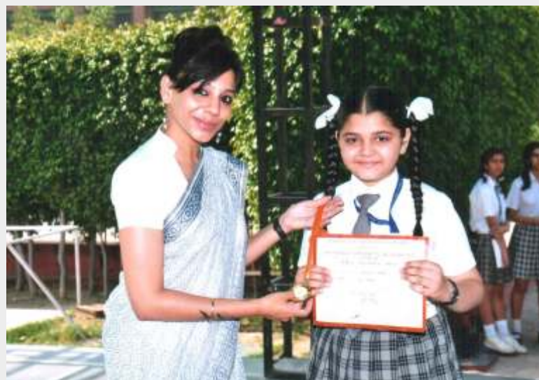
A talented student being felicitated with the certificate and a medal for her excellent performance in Lawn Tennis.