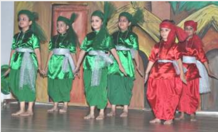
The glimpses of a Bengali dance.