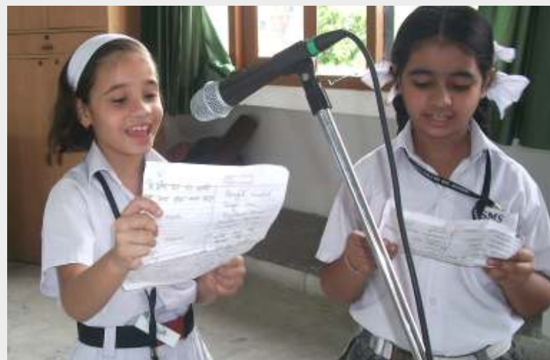
Our budding poets presenting their poetry.

Hindi Week was held in our school from 29 July to 2 August 2013. The week had interesting activities lined up for the students, providing them a wonderful podium to enhance their confidence and help them speak out their mind. The students of classes III to X took part in varied fields and portrayed their inherent talent for their mother tongue in the activities viz., Calligraphy Writing Competition, Spin a Yarn competition, Radio Jockey Competition, Compose a Poem, Short Play Enactment and a Quiz based on the renowned Hindi poets. The students were appreciated for their excellent performance and were awarded with certificates.