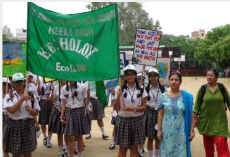
Our concerned samaritans making an effort to conserve nature.