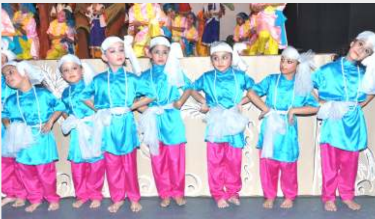
Our young dancers swaying to the ethereal Ravindra Sangeet.