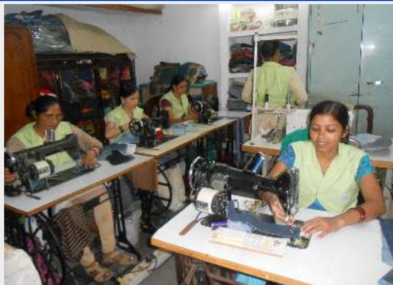
'Goonj'-Lending a helping hand to the needy.

In its relentless pursuit to sensitize students towards the poor and the under privileged, the school organised a visit to Goonj, an NGO where the students learnt about some of the initiatives taken by Goonj such as : School To School (S2S), Rahat, Not Just A Piece Of Cloth and Clothes For Work. Goonj not only collects and distributes clothes but also turns the old material into a huge development resource. It is an NGO, a voice, an effort that provides amenities for India's so called impoverished millions. It distributes the right thing to the person in need. A heartfelt appeal was made to the students to be mindful of the unused/surplus clothing taking space in their closet right now which could be a treasure for someone in need. The students pledged to contribute as many things as possible to Goonj and also create awareness about its initiatives.