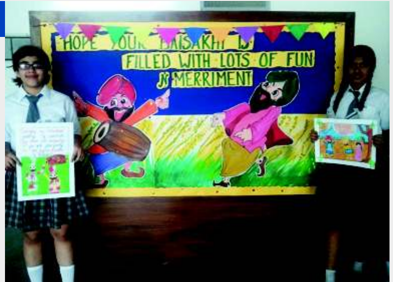
Celebrating the festival of Baisakhi by putting in it colours.

The harvest festival of Baisakhi, celebrated on April 13 every year, is a time for renewed faith and energy. People of north India, especially in the villages of Punjab, swing to the beats of drums and celebrate the day with great pleasure. This festival was celebrated with immense gusto gaiety and enthusiasm in our school. This year, the students of class VIII of the school participated with great zeal in the Poster Making Competition and exhibited their talent on the auspicious occasion. Their paintings were breathtaking and exhibited the true spirit of the festival. It was a successful event and everyone enjoyed the festivities.