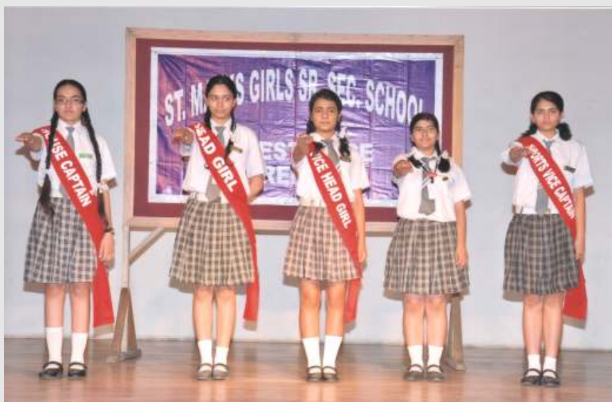
The swearing in ceremony of the office bearers.