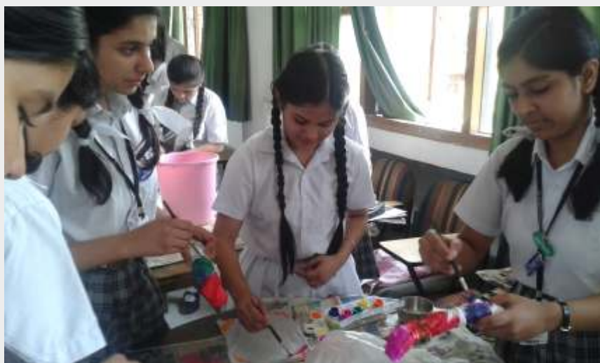
'Art is imagination-our students busy in the process of tying and dyeing dupattas.

"Art enables us to find ourselves and lose ourselves at the same time." Keeping in mind the significance of art, the school in association with HT Pace organised a Tie and Dye workshop to help children learn a new form of art. It was conducted on 3 May 13 for a few students of classes VIII - IX. The students learnt the process of tying and dyeing a piece of cotton cloth using bright colours. They made beautiful designs and participated enthusiastically in the workshop.