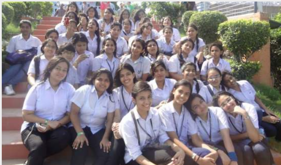
Having fun under the sun.

Students of class XI and XII of our school went for a picnic on 2 August at WOW, Noida. It was a much needed break for them. Their enjoyment started the moment they boarded the bus. They sang songs, played games on their way to the picnic spot. As they reached the spot, they immediately ran to take rides of their liking. There were a number of adventurous rides which gave them adrenaline rush. In the afternoon the students were served sumptuous lunch which was followed by rain dance where the DJ played music and our