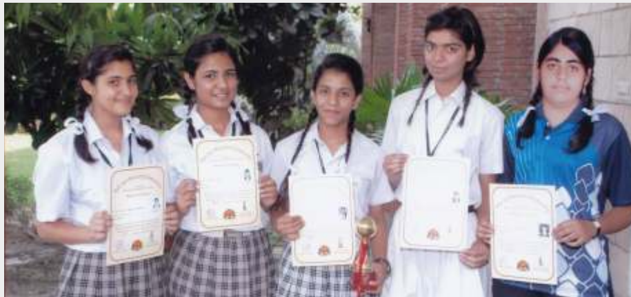
"We are the champs"-Our sportswomen who won the Basketball Open Nationals.