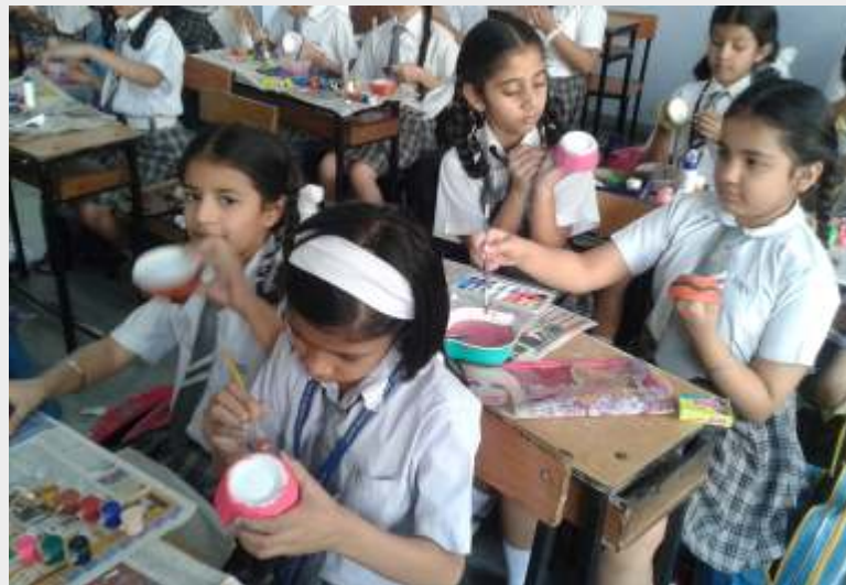
Our artists decorating their pots with vibrant colours.

HT Pace organised a Ceramic Pot Decoration Workshop for the students of Class-V in the school on 1 May 2013. The students enthusiastically participated in the workshop as they were skilfully guided by the HT Pace Coordinator, as to how to master the art of pot decoration. They had brought ceramic pots of various shapes and sizes which they painted in beautiful colours. Once the colour had dried up, beautiful patterns were artistically crafted with the help of shilpkar clay. These motifs added to the beauty of the pots. Further, the students were taught to paint the pots. As the workshop catered to the interest of the students, they very soon mastered the innovative idea and created wonderful designs on their pots. In the scorching heat, the workshop was like a fresh whiff of breather from the mundane daily schedule. Looking forward to more such workshops, the students carried on creating their masterpiece to master this newly learnt forte.