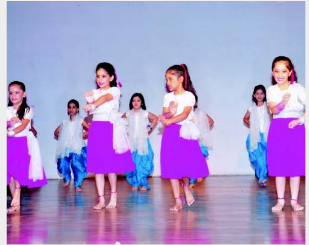
A dance performance to celebrate the spirit of independence on the auspicious occasion of Independence Day.