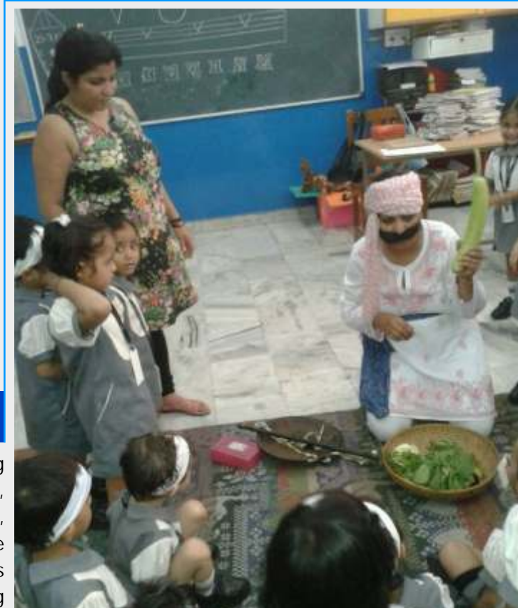
The tiny tots getting hands on knowledge about vegetable and money.