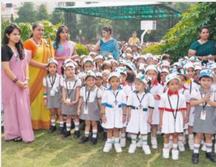
Our honeybuns standing in rapt attention during the flag hoisting on Independence Day.