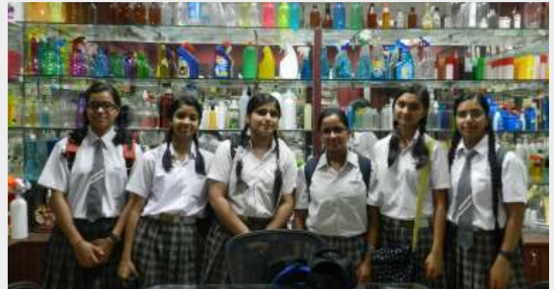
Our conservationists on their visit to a plastic bottle factory.

On 11 May 2013, some of our students involved in the Global Projects-Plastic Fantastic and Picture it Too-visited Vishwakarma Industries in Badli Village, where plastic bottles are manufactured. The main purpose of the visit was to see how plastic bottles are manufactured and gain detailed knowledge of the various steps involved in their making. The students clicked pictures of the processing unit and also made videos of the process, which they later shared with their friends on the websites of the two projects.