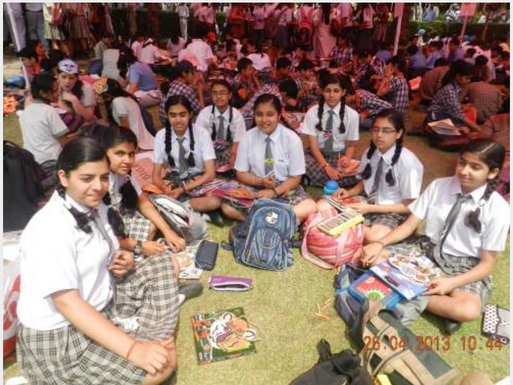
A date with the CM at the CM House.

Our students became a part of the Earth Day Carnival organised by the Delhi Government Eco Club at the Chief Minister's residence on April 26, 2013. There were over 3000 students from various schools of Delhi and 8 different kinds of activities organised by WWF. A group of 8 girls of classes IX and X attended this colourful event. The nature trail at the Chief Minister's residence, which has exotic flora and fauna and indigenous trees besides habitats of bats and various birds, brought them closer to nature. The nature trail was decorated with eco-friendly material and was divided into various parts for activities like story-telling session, making of animal masks, making posters, newspaper habitat game and film screening session. It was an amazing learning experience for the students participating in the various activities as well as seeing puppet show and the heritage of India through bioscope. The students cherished the time spent there and realised that we must be more environment friendly to conserve mother earth and ensure a secure future.