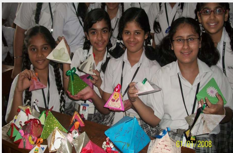
Our young mathematicians exhibiting their geometrical designs.