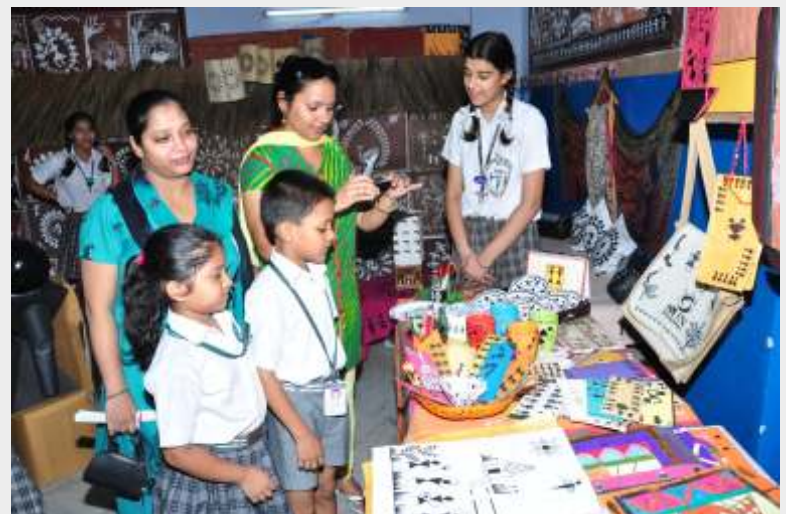
Parents appreciating the artistic Warli Art of our students.