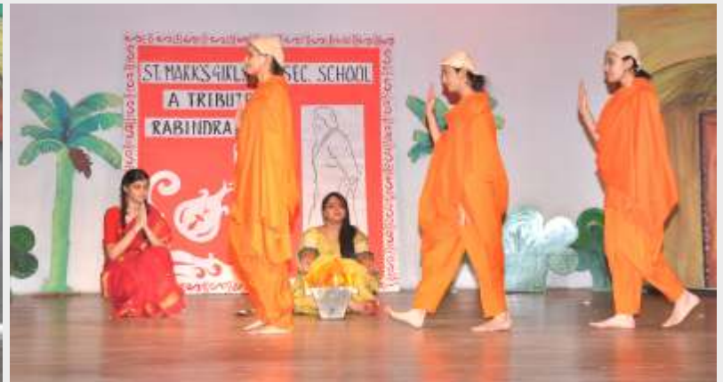
The play 'Chandalika'.