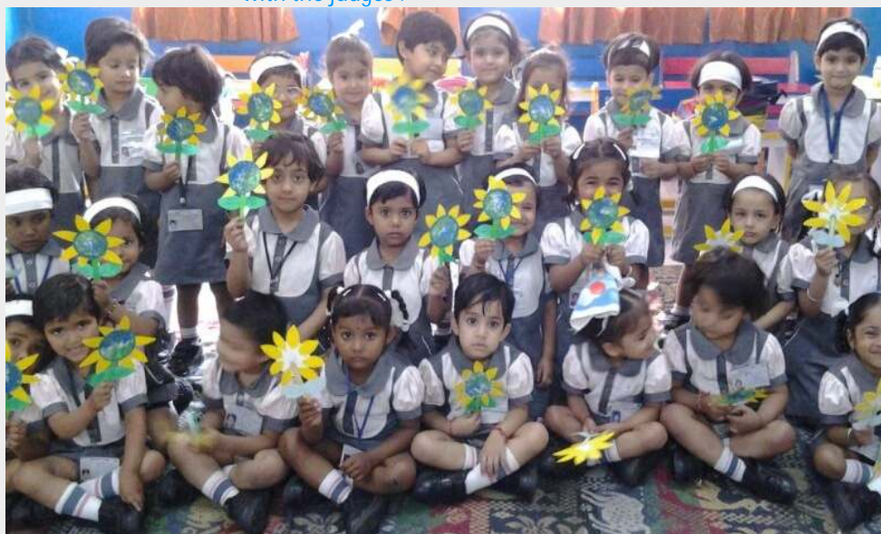
our young toddlers smiling with paper windmills in their hands to mark the occasion.