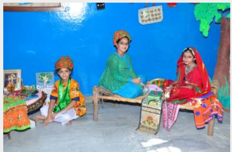
The artists of our school presenting the folk art of India.