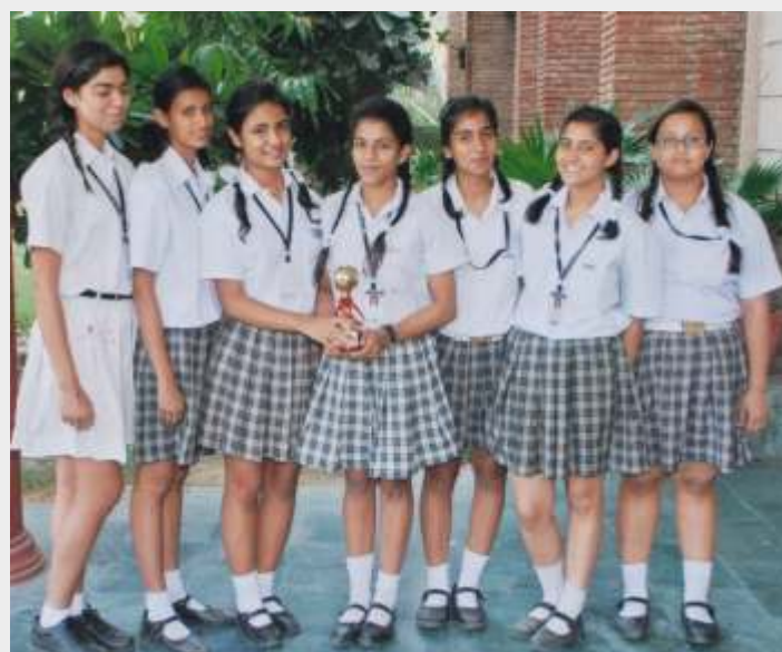
The winners of Basket ball Zonal (Sr. Category) pose for a picture with a trophy in their hands.