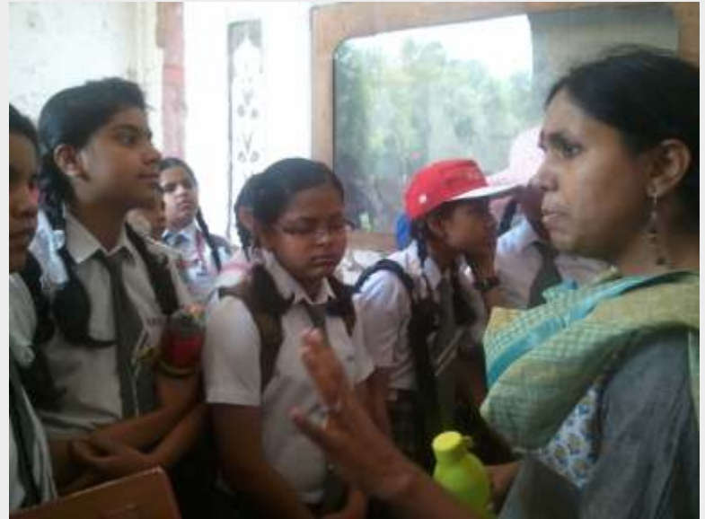
Our arduous historians appreciating the architecture of the Red Fort.