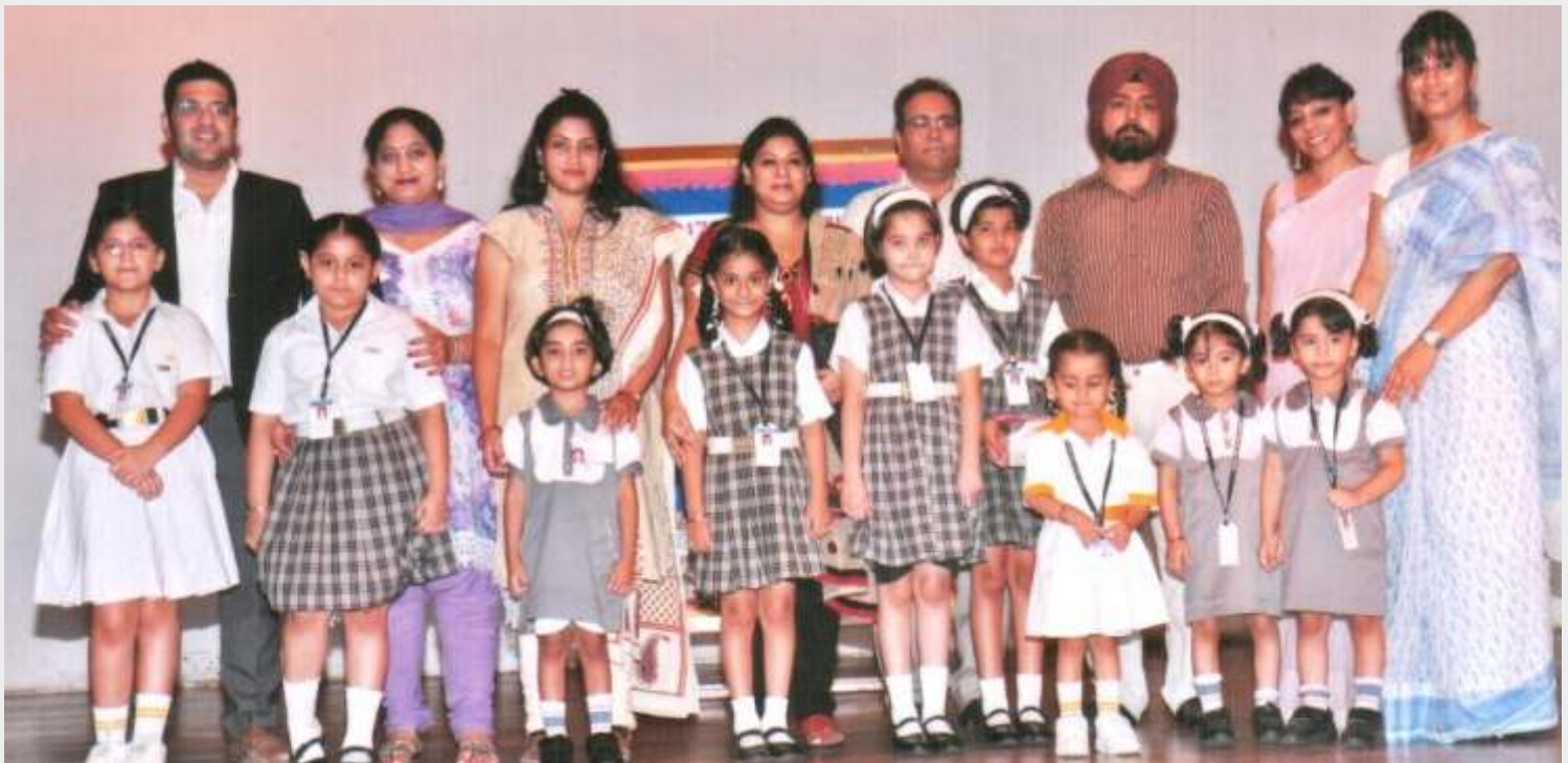
Our students standing proudly with their parents who won the Art Competition.