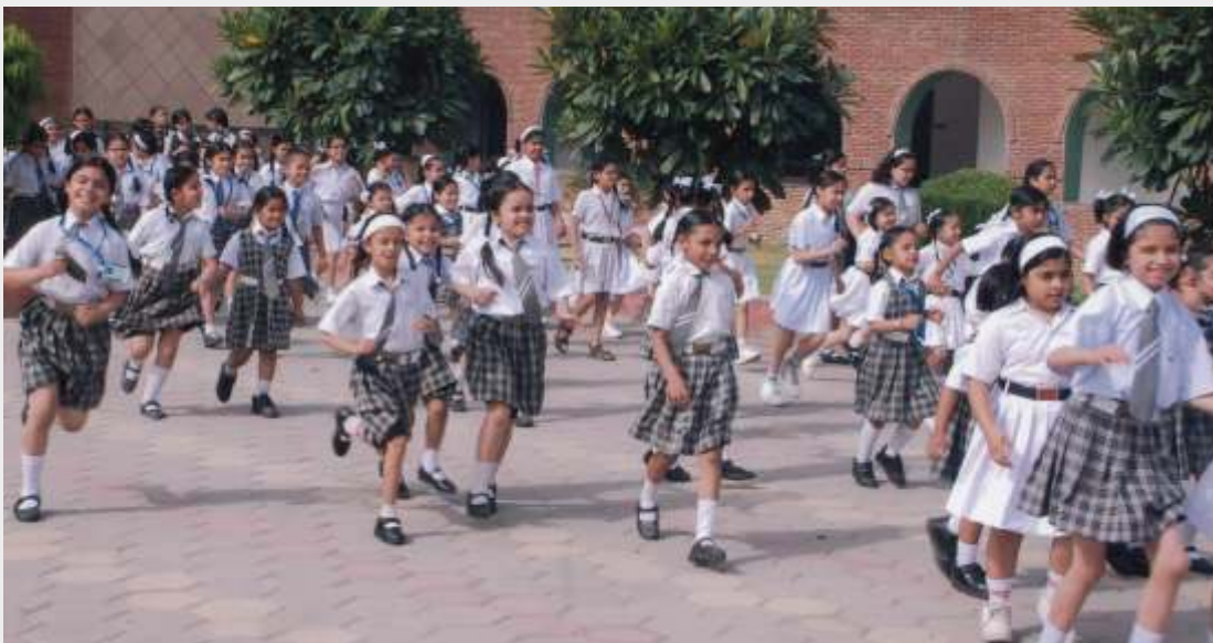
Ready to face a crisis-our students rehearsing during the fire mock drill.

Truly, disasters are unpredictable and shocking. They bring with them a lot of destruction. It is thus crucial to know how to handle oneself in case of such a devastating event. Keeping the same idea in mind, the school organized a mock drill in the month of April to teach children how to save themselves as well as help others in case of a fire. The students were allotted