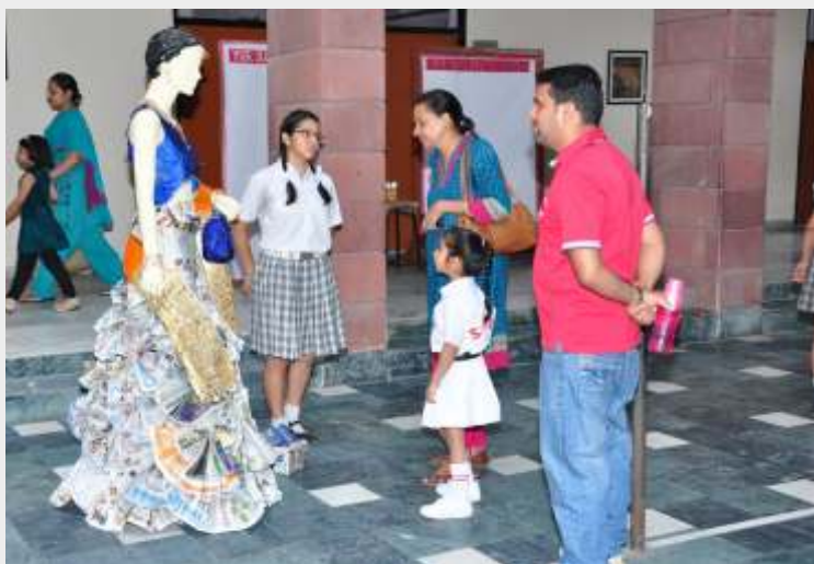
A mannequin attired in a modern dress made from nothing else but newspaper.