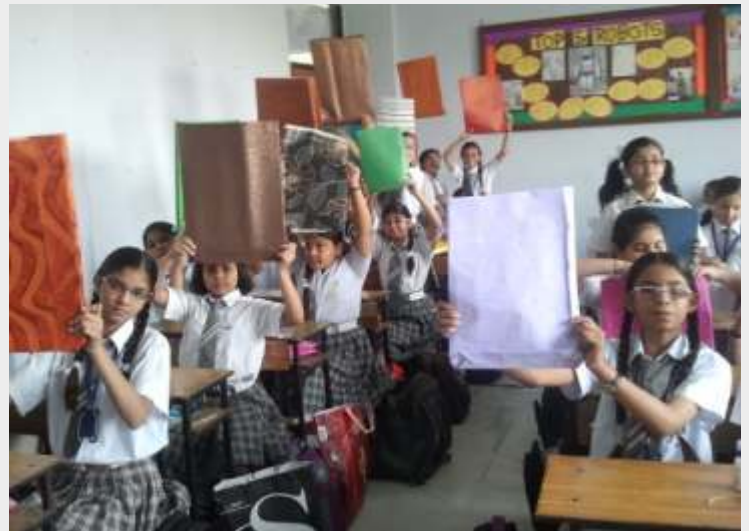
The students displaying their paper bags.

Nowadays people have started taking interest in favour of nature. They have started taking initiative to make our environment clean. One such step towards a clean environment is the use of paper bags. HT PACE organised a Paper Bag Making Workshop for the students of class VI on 2 May 13. The students learnt to make paper bags using bright and colourful handmade sheets. They also took a pledge to use paper bags and save our mother earth from the hazards of polybags.