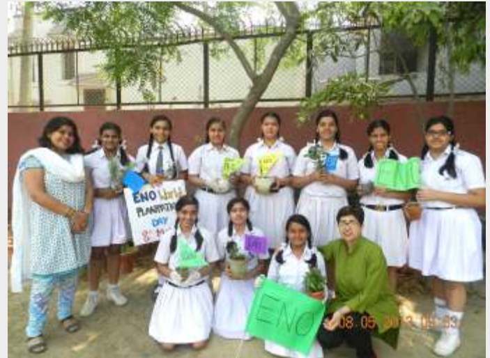
Inspired by the plantation drive the young earthlings ready to plant saplings.

The ENO Tree Planting Day-an event organised by AEC Project, Fun Page Fun Time was celebrated by the students of class IX and X of our School on 8 May 2013. As a tribute to mother nature, saplings of various plants were planted by our nature lovers. With immense enthusiasm, the students took part in this activity. Later, they took the saplings home in order to nurture them. It was a small initiative towards the preservation of our planet and resurrection of the pollution free environment where all the elements of nature live in harmony.