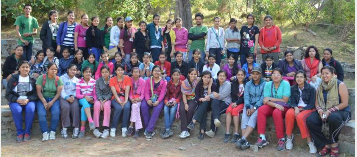
Our students pose for a group picture in Shimla.