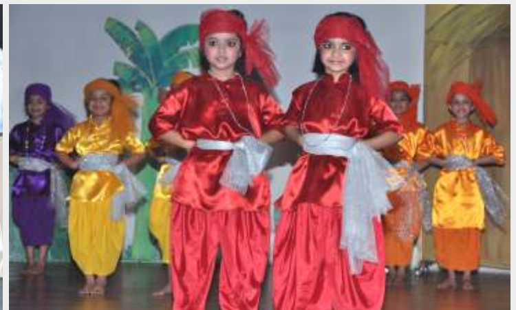
A mesmerizing dance performance by our little buds.