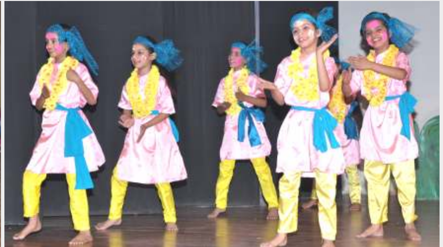
Our dancers putting their best foot forward to mark the day.