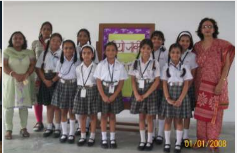
Winners of "Radio Jockey" during Hindi Week.