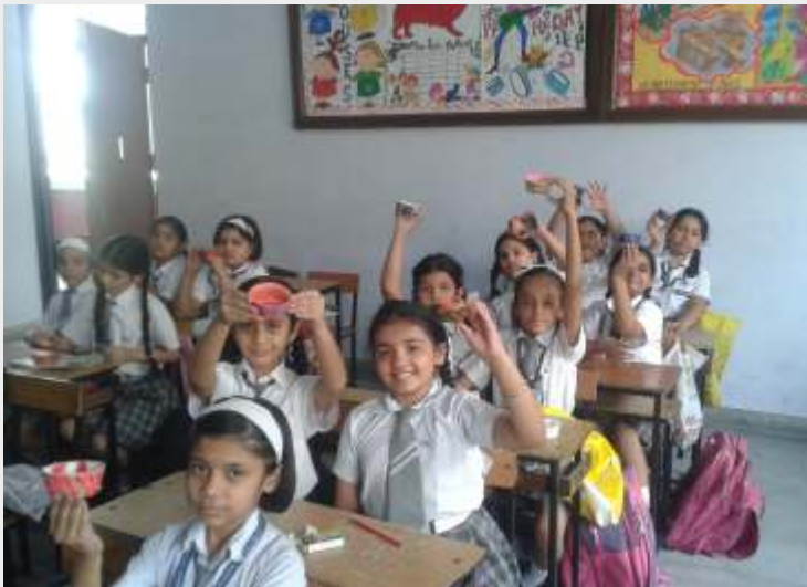
The young artists of our school flaunting their little baskets.

Imagination is not a legacy but is cultivated with a harvest of ideas and inspiration. To add a spark to the innovation of our students, a craft workshop was organised in our school on 30 April 13 for class IV by HT PACE. Students made beautiful and colourful baskets using ice cream cups, shilpkar glitters, paints, etc. They enjoyed the activity thoroughly.