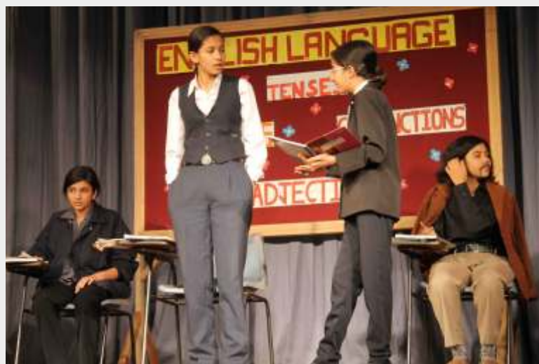
'Mind Your Language' - A still from the hilarious play.

Atelier Theatre Group organised Bachpan Theatre Festival 2013 that aimed at providing a stage for the young enthusiastic who are still in school. Supported by the Ministry of Culture, India, this festival aimed to offer a non-competitive space to the young minds to express their creativity on stage. Our school was a proud part of this festival. The young talent of Class VIII presented a comedy play called 'Mind Your Language'. The play was an adaptation of the famous London television series 'Mind Your Language'. In the play young adults from various nationalities come together to learn English language. The perfected acts of the students playing the nuances of the English illiterate adults invited peals of laughter from the audience every now and then. The hilarious play was applauded by one and all sitting in the audience.