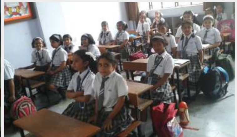
Attentively listening to their seniors and seeing the power point presentation on the heritage sites are the learners of our school.