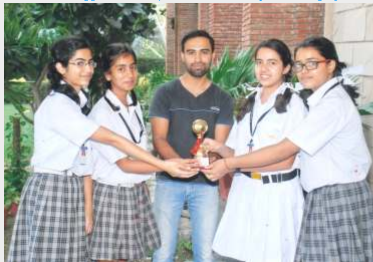
The smiles on the faces of these winners exhibit their passion for the game.