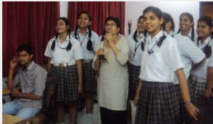
Video conferencing session in action.

A Video Conferencing Session was organised through Skype chat, for students of class IX and X. in the school's conference room on 17 May 2013. During the session, our students introduced themselves to their partners of Nayang Girls' High School in Singapore. The main purpose of the video chat was self introduction and face-to-face interaction among the students of both the schools before they become penpals. Nayang Girls' High School is a unique school with students participating in various Global Classroom Programmes and by collaborating with such a school, our school wants to give opportunities to our students to embark on learning experiences that will open their eyes to the world beyond the boundaries of India, thereby contributing as world citizens.