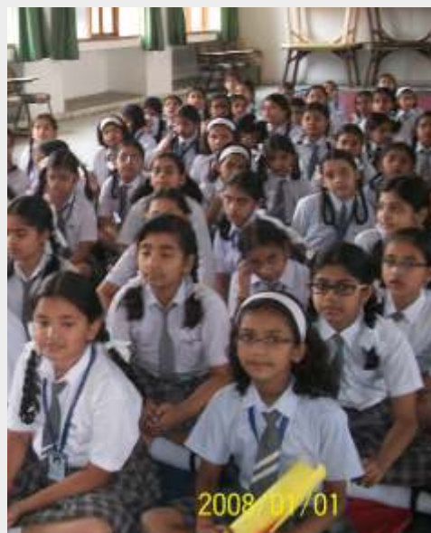
Our zealous audience listening to the facts revealed by their peers.