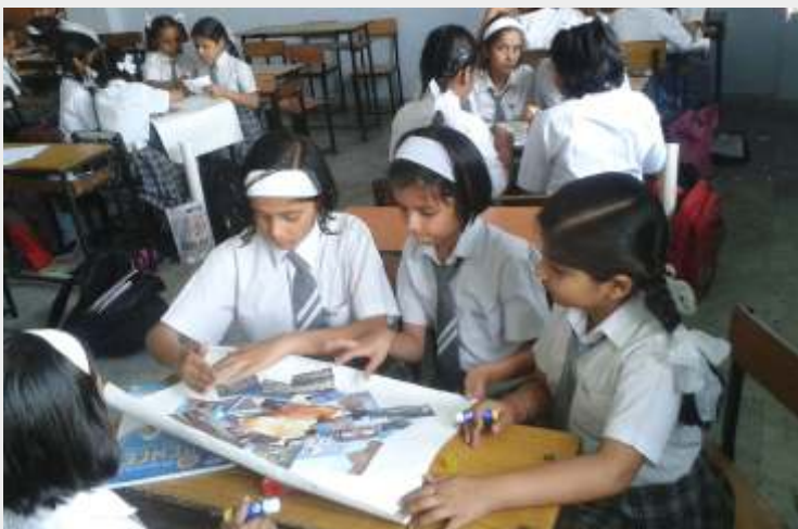
Collage making activity in progress.