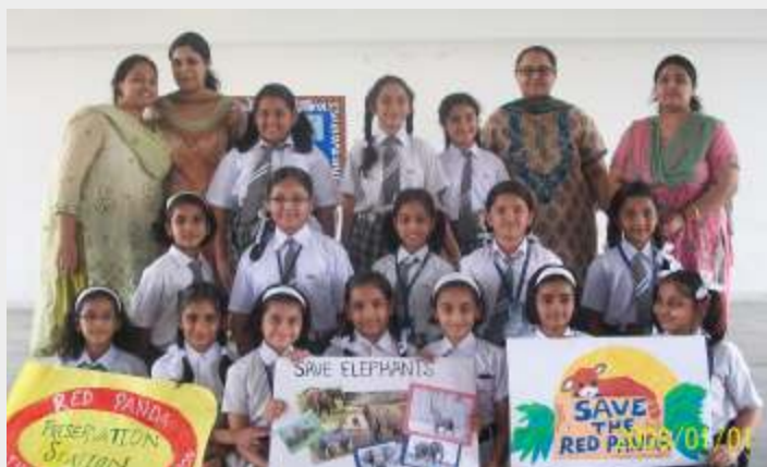
Winners of Talk on Engendered species posing for a picture with the judges .

Seedling classes celebrated Earth Day in their classrooms with fun-filled activities. Children were told about Earth Day like what is Earth, things we should do to protect it etc. Class Sapling was explained how to recycle paper. The students were taken to the recycling room and shown how to recycle paper. The recycled paper was used by cutting it into different shapes and writing slogans on them. Classes I to V took part in various exciting activities which were-Talk on Endangered Species, Tattoo Making, Poetry Writing, Paper Graffiti Competition and News Bulletin. Students of classes III, IV and V also put up a 'Pledge Board' where they wrote a pledge they wanted to take for their planet and pinned it down on the board.