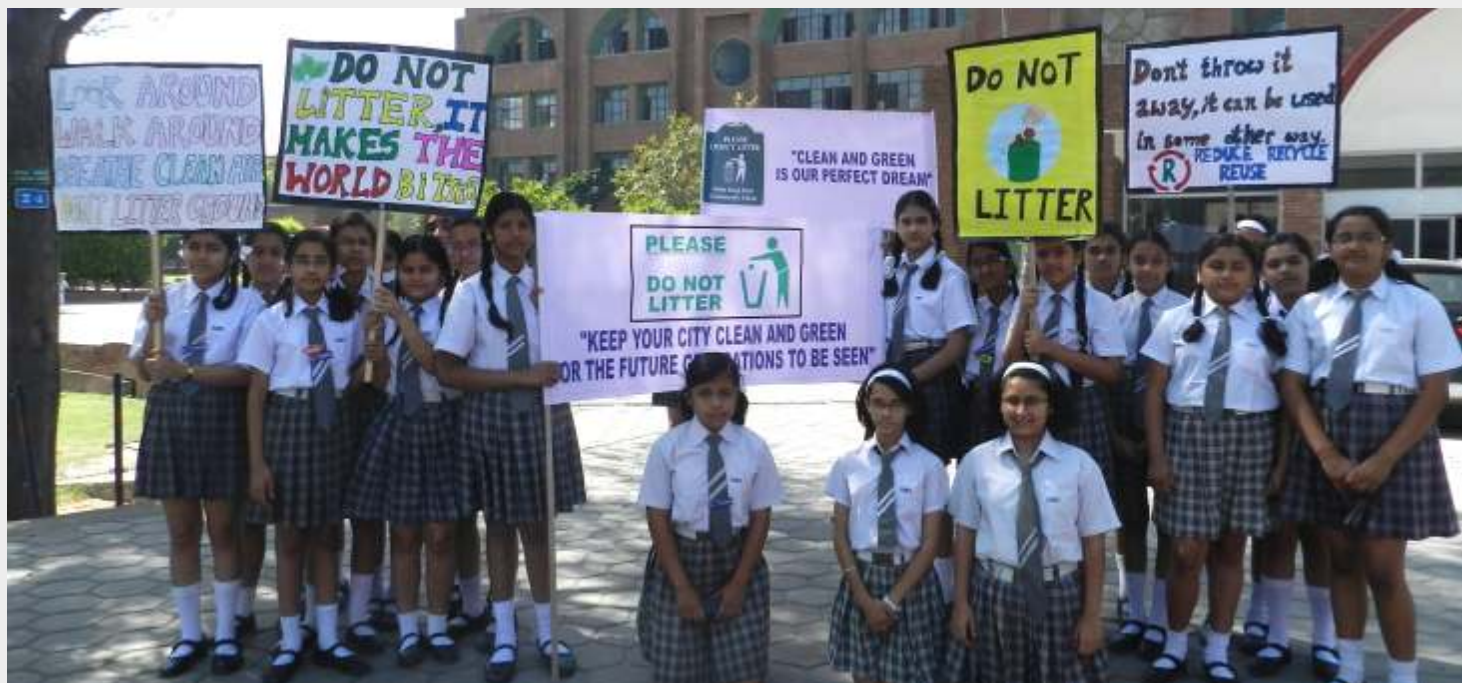
An effort to save Mother Earth.

Market places, local parks, bus stands or even outside your own home- there isn't a single place left that one could call spotless. Are we so addicted to littering around that it has become our everyday routine? Our ostentatious attitude of practicing cleanliness under the garb of littering is what characterizes most of us today. Littering is now a common problem faced throughout the country. Although each one of us wants to live in a healthy and clean environment, the present scenario reflects a contrasting picture. Therefore, the students of classes VII and VIII of our school took an initiative towards a cleaner Delhi and took out a rally with an aim to spread awareness among people about the ill-effects of littering on 17 April 2013 near GH-5, GH-6 and GH-7 blocks in Paschim Vihar. The students used placards that displayed inspiring slogans like DON'T THROW IT AWAY, IT CAN BE USED IN SOME OTHER WAY, CLEAN AND GREEN IS OUR FUTURE DREAM, LOOK AROUND WALK AROUND, BREATHE CLEAN AIR, DON'T LITTER THE GROUND etc. to discourage people from littering the roads. Moreover, they encouraged the students of their school to keep the roads clean by refraining from littering the streets as that spoils the beauty of our country.