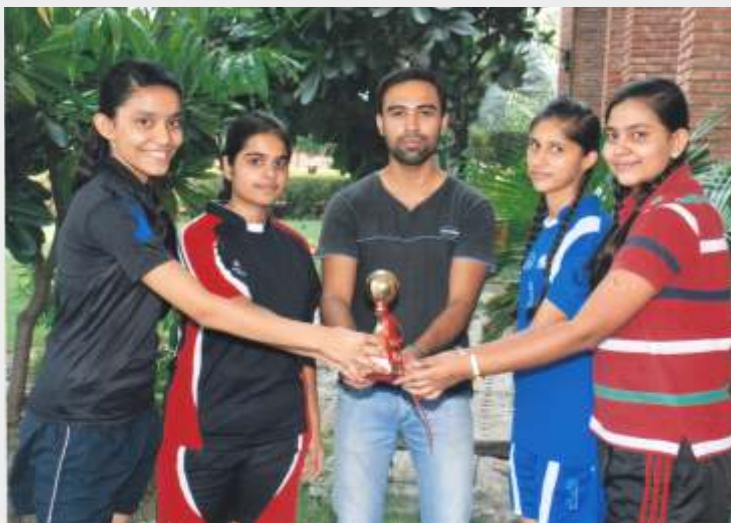
Our talented Table Tennis players flaunting their trophy.