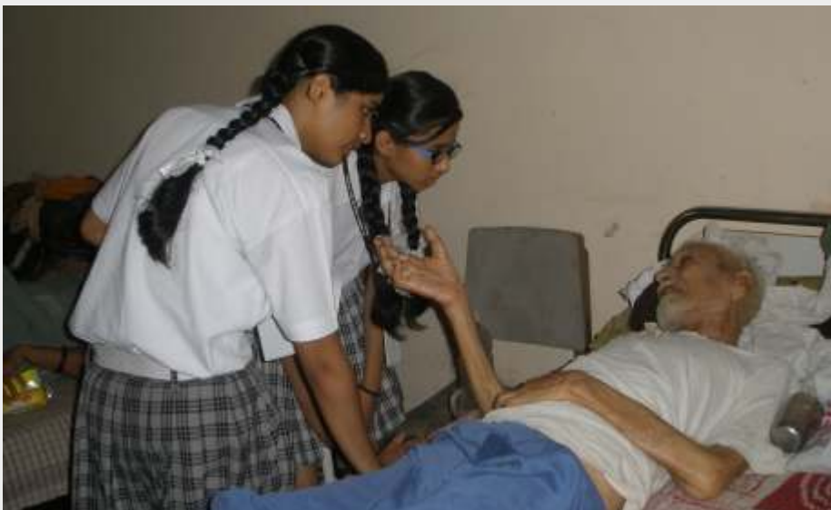
Lending a compassionate year to elderly.

These are lines said by a wise man which were reflected on the faces of the senior citizens of Sai Vridh Ashram, which was visited by the students of our school on 13 July 2013. The students noticed that the elderly there are alone because they have either lost all their loved ones or have been abandoned by them. This realisation brought tears in their eyes yet they hid them