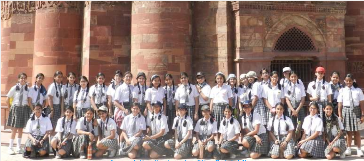
Appreciating the beauty of the Qutub Minar.

The Eco Club students of classes IX to XI of our school went for a Heritage Walk to Qutub Complex on 18 April 2013 on World Heritage Day. The main purpose of the Heritage Walk was to create awareness among the students to protect the priceless monuments of our country and keep them alive for our coming generations.