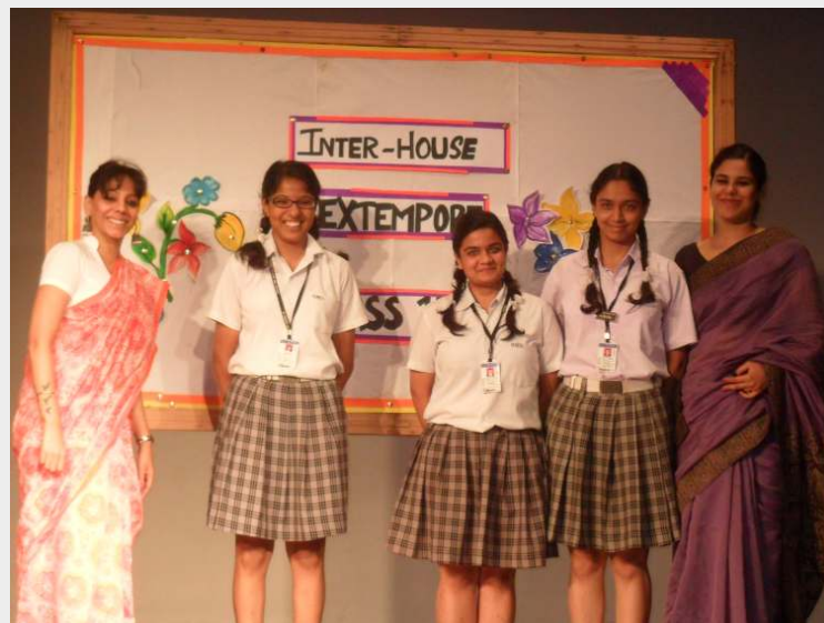
"Science is life" - showcasing scientific principles in a unique way.