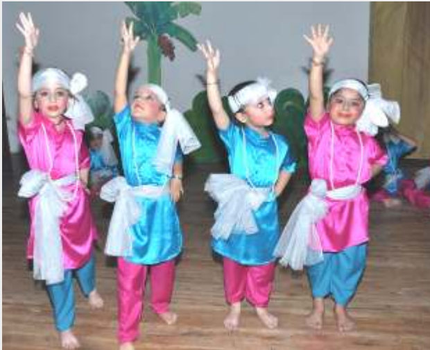
A spell binding performance given by our students on Tagore Jayanti.

To watch the video log on to www.saintmarksschool.com ▶