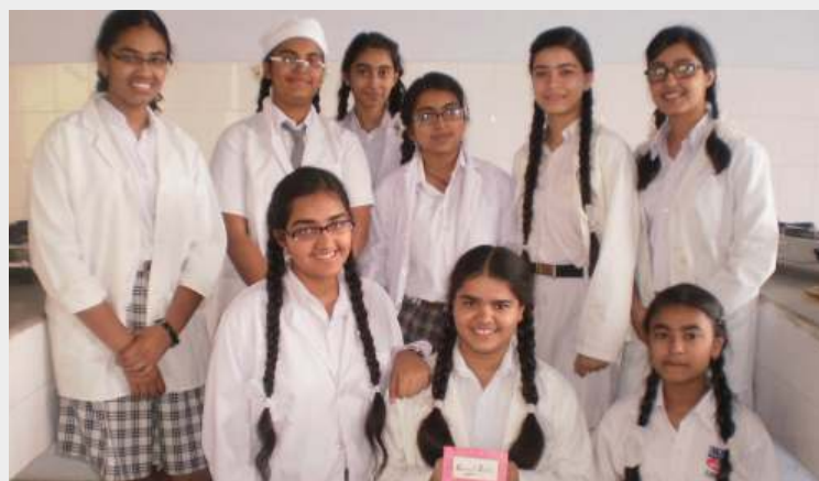
Our junior master chefs.