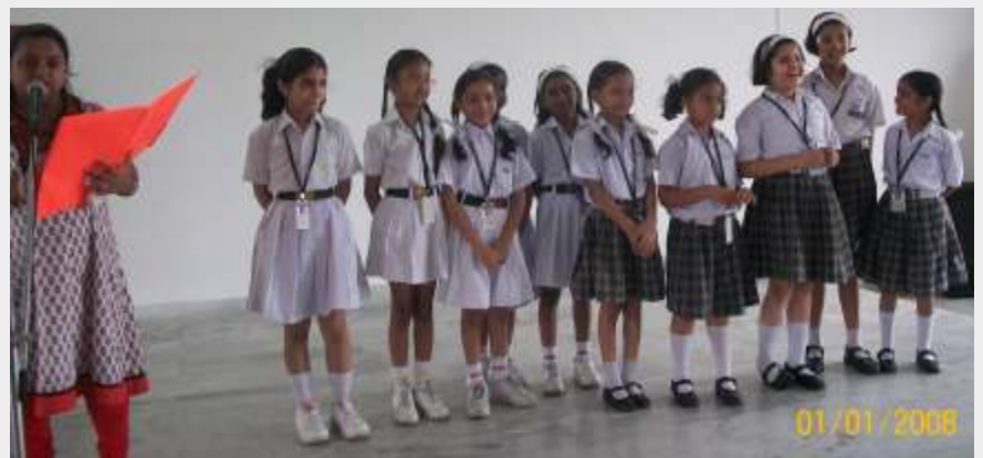
Winners of Story Writing and Enactment Competition.