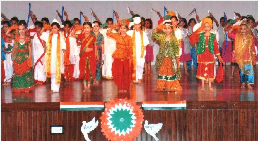
Unity in diversity.