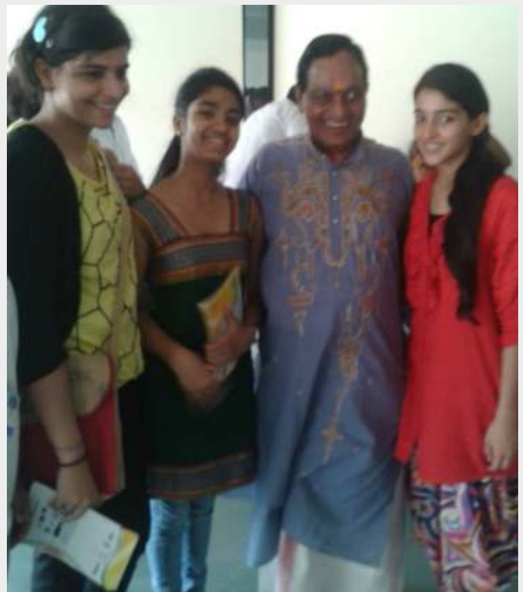
A snapshot of our volunteers who attended the Spic Macay Convention at Kolkata.