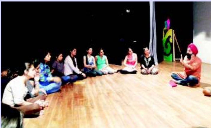
Our teachers putting their thinking caps on for the Theatre Workshop.

Acting is not a state of being but a state of appearing to be - Noel Coward SMGS in its relentless pursuit to keep its teaching fraternity abreast with the nuances of life and teaching technology organised a two day theatre workshop on 17 and 19 May 2014 under the Ageis of ATELIER. The two day session encouraged the teachers to use theatre in education and make teaching learning process fun and effective. It focussed on relationship building, team work and leadership. The workshop also encouraged the teachers to trigger the senses of the students and motivate them to give a creative outlet to their repressed emotions. The session left the teachers inspired to stir the imagination of the students and channelise their potentialities in the right