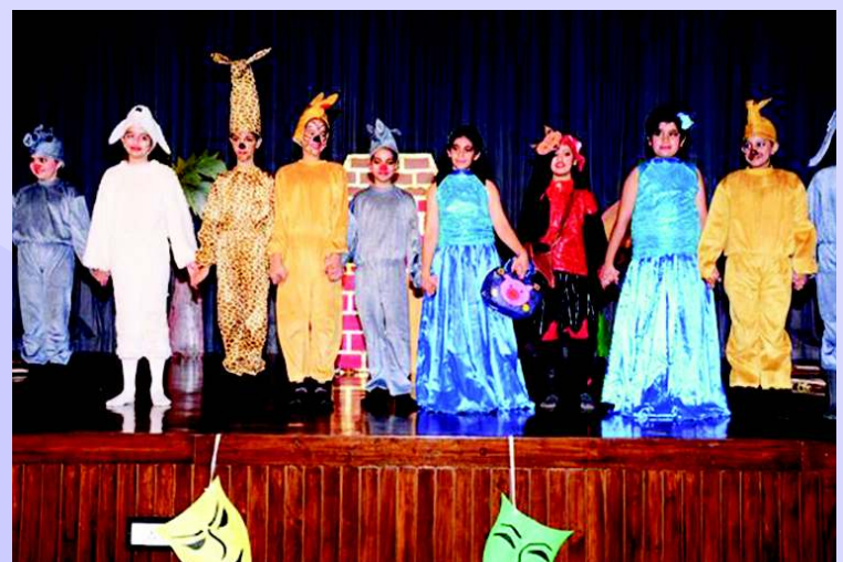
Our young soubrette bewitching the spectators with their performance par excellence.