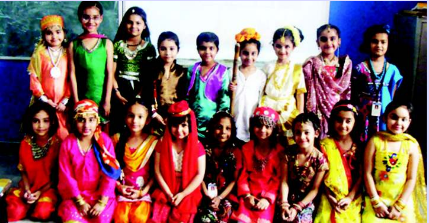
Representing different states in vibrant costumes are the students of class II.