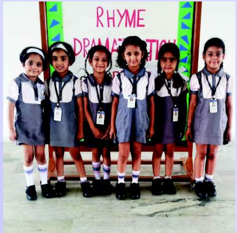
Young paladins of the Rhyme Dramatization.

'Verses open new vistas of imagination in the young minds.' Keeping this in view, an Inter Class Rhyme Competition was held on 5 August 2014. The participants recited spell binding rhymes with confidence. The audience was enchanted and applauded their friends for their great effort. The judges appreciated all the participants and declared the winners.