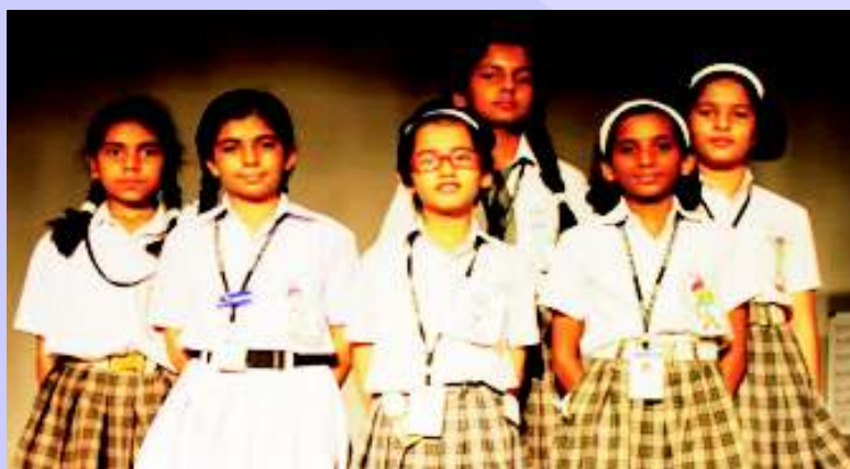
Winners of the GK Quiz.