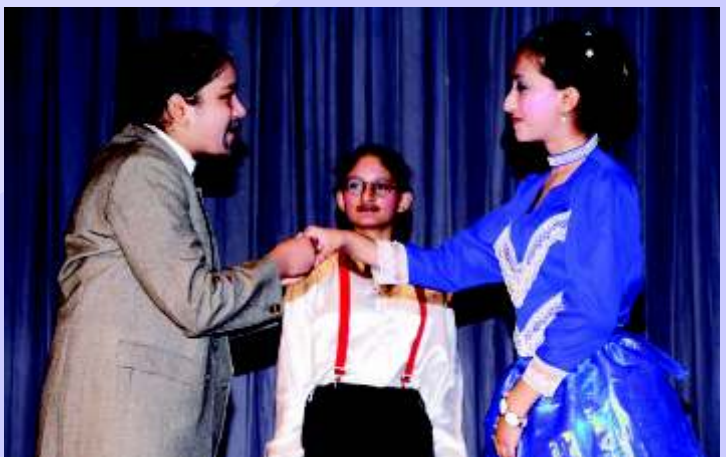
Recreating the magic of G.B. Shaw and Munshi Premchand on stage.