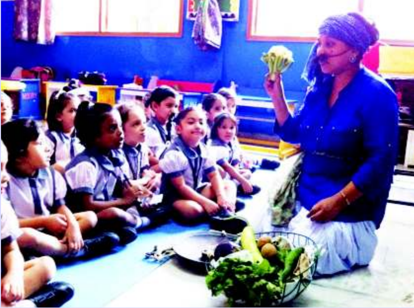
The essence of a market scene recreated in class.

Fun learning is a fundamental concept and works wonders if implemented well. The teachers of our junior most class, Seedling, certainly have been thinking on these lines and thus manage to come up with novel ideas to make education a complete joyride for the kids. Our young angels got a whiff of freshness in their mundane routine and were pleasantly surprised to see their teachers in the guise of a vendor. The essence of a market scene was captured and recreated by their teachers in the 'Vegetable Vendor Activity.' Amidst such an authentic setup, the tiny tots improvised on their psycho-motor skills as they learnt to identify the various types of vegetables shown to them. This spectacle demonstrated the necessity of such basic activities from time to time.