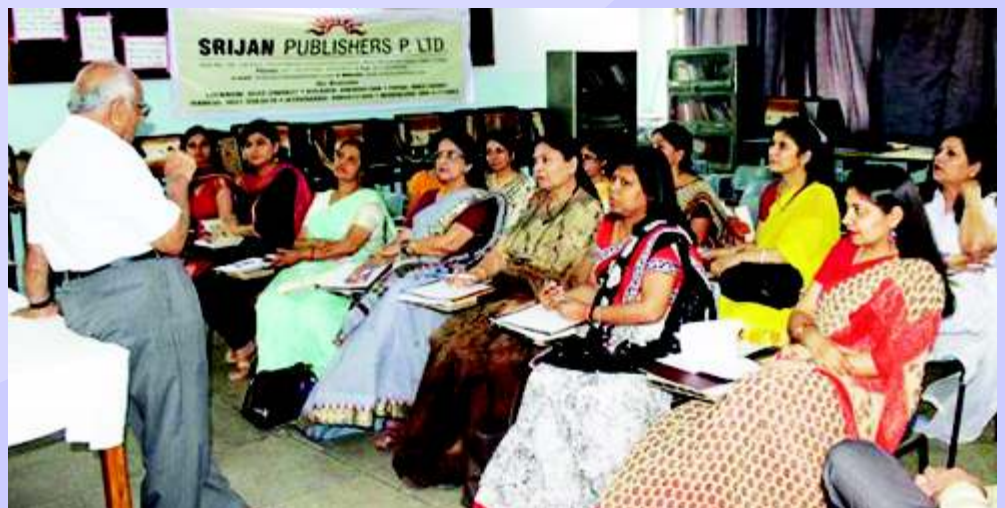
Our teachers sharing the rich experience of the resource person.