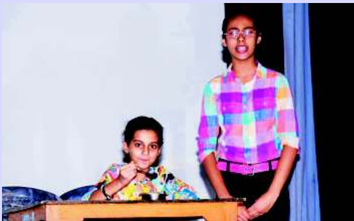
Our young maestros proving their mettle on stage.