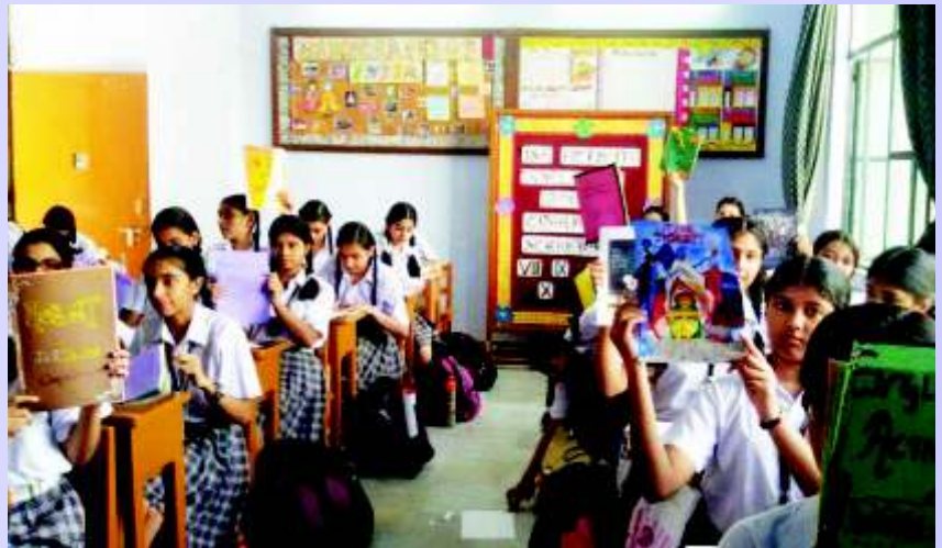
Broadening their horizons while exploring the world of words.

Indeed, books are miracles. They wash away from the soul the dust of everyday life. They not only add to our knowledge and broaden our horizon, but also help us to cope up with discomfort and aggravation. In order to inculcate this wonderful and healthy habit of reading amongst students, our school recently organized interesting and informative activities for them. Titled 'World of Words', the first activity was a Scrapbook Making Activity organized for the students of classes VIII to X from 8 July to 10 July 2014 wherein the students read novels assigned to them during the summer break and made an interesting compilation of their favourite characters, scenes and dialogues in a colourful and lively scrapbook in the school. The second activity was held for the students of classes VI and VII from 28 to 31 July 2014. Titled 'Myths and Legends', the activity was a remarkable collection of legends, folklores and related pictures presented by the students creatively. The ideas of the children were interesting and innovative, and impressed the teachers. Our avid readers and the budding authors of tomorrow exhibited their outstanding talent through these activities and showcased their zeal, passion and love for books.