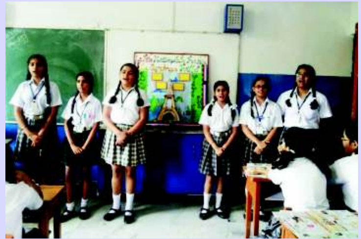
Rendition of a French song.

Le Quatorze Juillet on the 14th of July is celebrated as the National Day of France. We, at St. Mark's Girl's Sr. Sec School, celebrated this day with great enthusiasm. The French Department conducted a few activities on this day to help the students of classes VI-IX understand the relevance of this day. The students actively participated in all the activities assigned to them. Each student wore a French flag to express her excitement. The day began on a positive note as class VI made beautiful collages on the famous things of France, whereas class VII students participated in a Quiz on France. Class VIII wrote about the 'Prison of Bastille' and 'French Freedom Fighters'. Class IX made PowerPoint presentations on varied topics related to France and presented them in their class. The celebrations amplified when a group of students performed a French song 'La maison où j'ai grandi' for the classes. The event was wrapped up with the national anthem of France and a video on French Revolution. The French Department was exhilarated to celebrate this day with great joy and festivity.