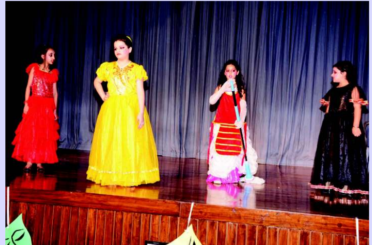
Our budding actors on stage mesmerizing the audience with their endearing performances.