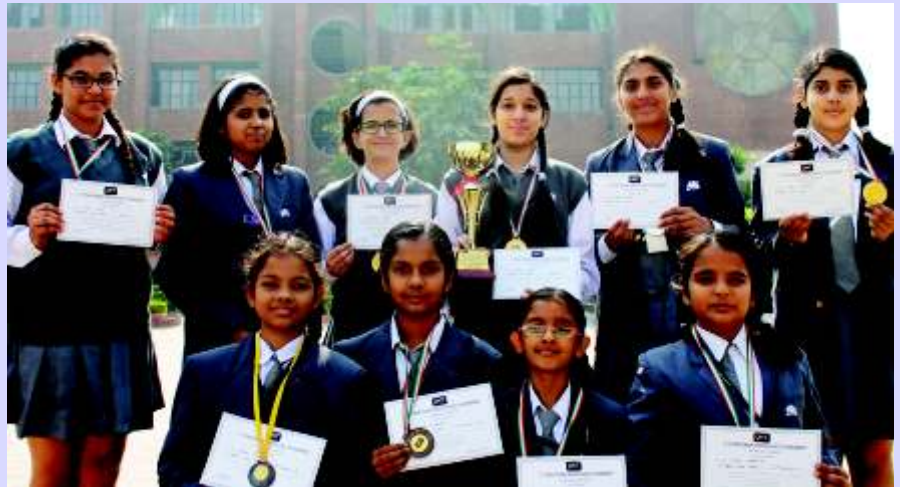
Winners at the Inter School Lawn Tennis Tournament.