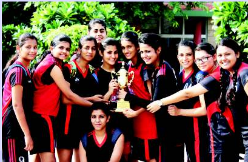
Winners at the Basket Ball Zonal Championship.

“Talent wins games but teamwork and intelligence can alone win championships.” The students of our school participated in the under16 Basketball Tournament held at Bosco Public School on 9 September 2014. They displayed a great amount of vigour and participated with a zealous attitude. Our school has taught the students well that winning is not absolute and an arduous input is what counts. This is what kept our students going despite tough competition. The students secured the third position.