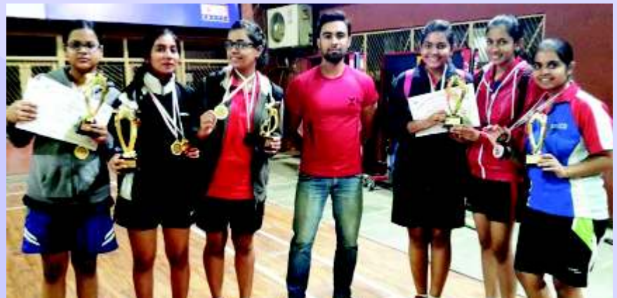
Students who won accolades at the Inter District Table Tennis Competition.

When students come back from a competition or a match smiling from ear to ear and pride resting on their brow, the school flag raises itself a little higher. The Table Tennis team of our school consists of students from all age groups-the juniors, the sub juniors as well as the seniors. The students have once again won accolades in a number of matches that they played. Our school has always tried to instill fair play and hard work in the minds of the students. As they say, integrity and veracity always pay off.