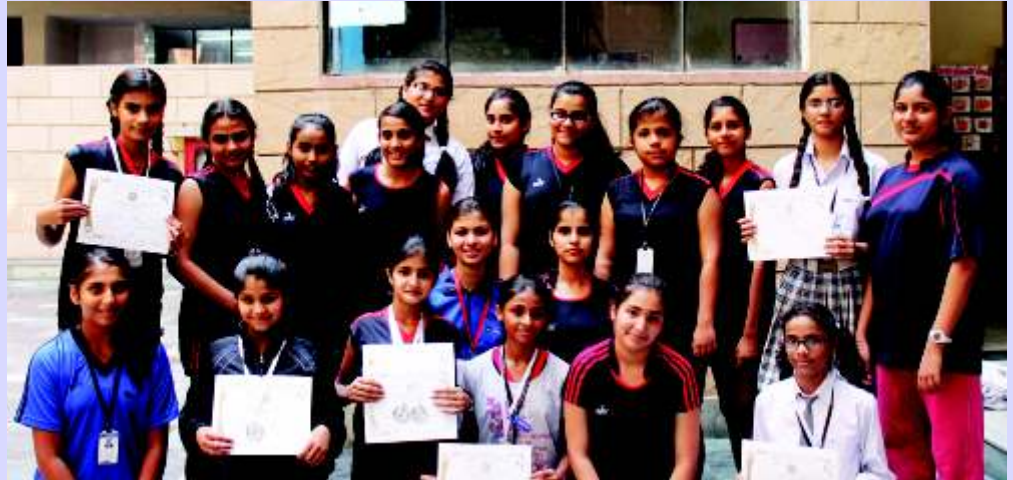
Winners at the CBSE Athletics championship.