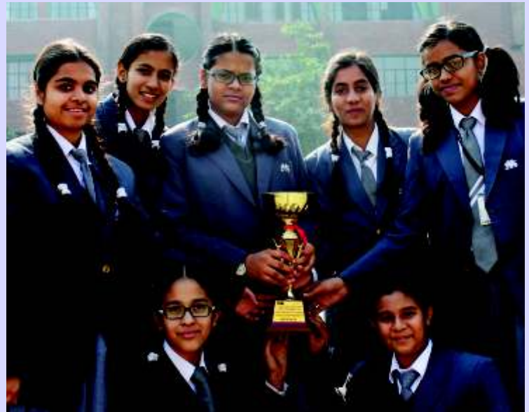
Champions at the District Table Tennis Tournament held at Bosco Public School.

The above mentioned students also participated in the State Level Table Tennis Tournament conducted at the Indira Gandhi Stadium.