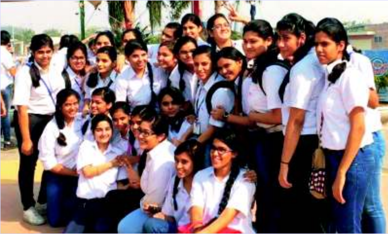
Our young adventurers posing for a photo shoot.

All work and no play makes Jack a dull boy. Undoubtedly excursions are needed to break free from the monotonous and humdrum routine of daily life and, relax and refresh one's mind and soul. In its pursuit to provide students with the much needed break an excursion was organised for the students of classes XI and XII to Adventure Island on 21 October 2015. The students thoroughly enjoyed the day out and relished each and every moment. They enjoyed various rides and joyously indulged in the rain dance. It was indeed a memorable experience for the students and a memory that will stay in their hearts forever.