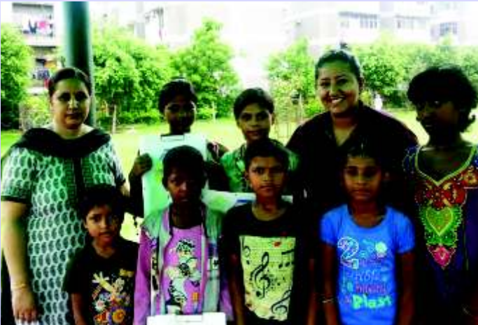
Our teachers giving wings to the under privileged minds with Project UDAAN

No one has yet fully realized the wealth of sympathy, kindness and generosity hidden in the soul of a child. The effort of true education should be to unlock that treasure. The potential of some wonderful children remains untapped because they are deprived of their fundamental right to get educated. Keeping this in mind, our school has initiated Project UDAAN in which basic education is provided to the underprivileged children of the society. The genius minds and creative artists trapped in the clutches of poverty are emancipated through education. Giving wings to their imagination, some teachers and students of our school are teaching the children of Jwalapuri Camp No. 5 who are in the age group of 6-13 years. It is an ongoing project through which we hope to make a change in the life of these children.