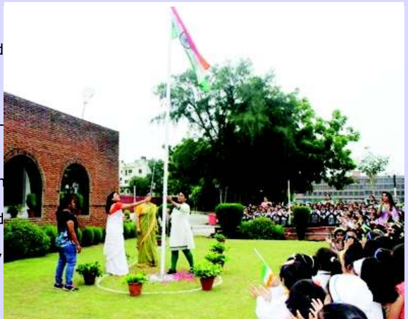
Hoisting the national flag with pride.

The month of August is characterised by patriotism, zeal and ideals of sovereignty and liberty. On 15th August this year, we all celebrated the 69th Independence Day of India. Our school organised a special programme to mark this occasion. The event was made even more memorable by the keen participation of the junior-most students of our school i.e. the cherubims of classes Seedling and Sapling. The tiny tots of Seedling accompanied their parents to take part in a Collage Making Competition on the theme 'Incredible India'. The students of Sapling crooned motivational melodies expressing immense devotion towards their country. Furthermore, they flaunted tri-colour bands and waved flags to promote nationalist sentiments. The highlight of the celebration was when these little angels turned into chefs to prepare delicacies like the Tiranga Sandwich. Teachers, disguised as multifarious freedom fighters, gave their Midas touch to the event as they tried to inculcate the values of courage and honesty, encouraging the students to stand up for their rights.