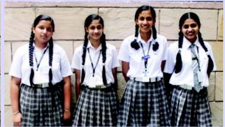
Junior winners of the Table –Tennis Zonals.