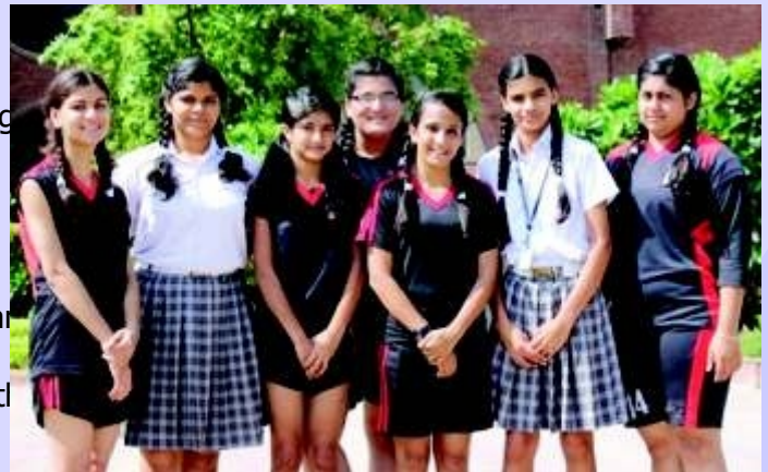
Our proud sports enthusiasts.

Our ardent sports enthusiasts participated in an Open State Summer Meet held at Chhatrasaal Stadium, New Delhi from 22-24 July 2015. It was a mega event giving an opportunity to the students to showcase their potential. Those who managed to prove their mettle, competing with over a thousand children from different parts of the country are :