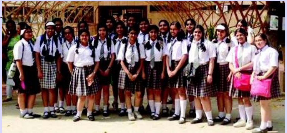
Our exuberant students on a visit to the IIT Open House.