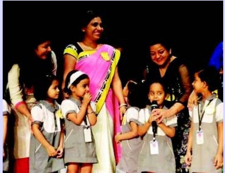
Our young artists painting the world with smiles.