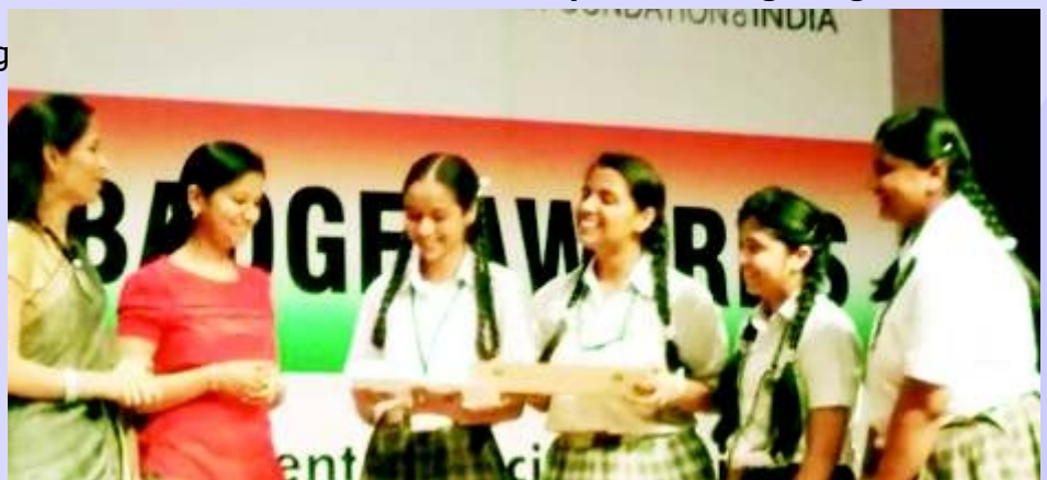
Young samaritans being acknowledged for their efforts.