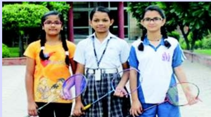
Winners of Badminton Zonals beaming with pride.