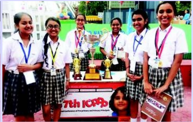
Our young achievers, exhibiting the overall Championship trophy with pride.

"Every accomplishment starts with the decision to try."