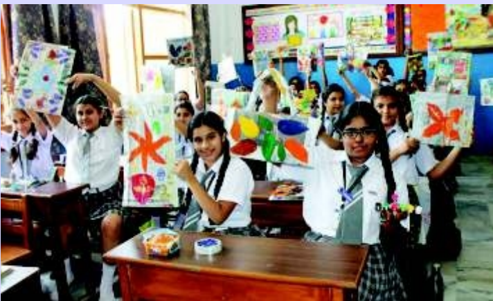
Potential artists exhibiting their master pieces.