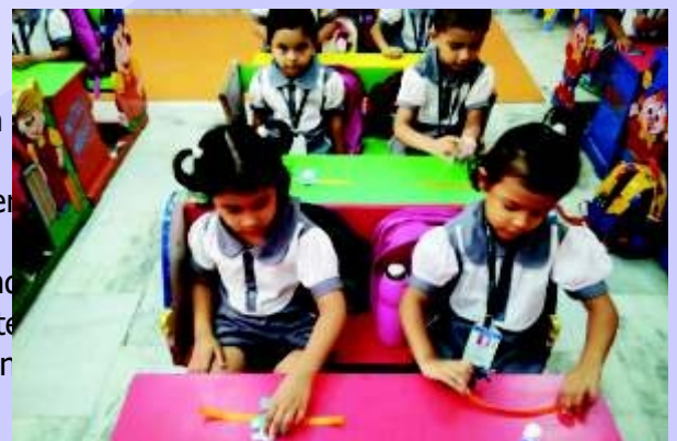
Embellishing the thread of rakhi with love and affection.

Rakshabandhan is a festival marking the dynamic bond between brothers and sisters all across the country. Rakhi is a sacred thread embellished with sister's love and affection for her brother. In the Indian tradition, the fragile thread of rakhi is considered even stronger than an iron chain as it strongly binds brothers and sisters in the circumference of mutual love and trust. To celebrate this festival, our seedling students made beautiful rakhis to tie on their brothers' wrists. They decorated their rakhis with colourful sequins, stones and strings.