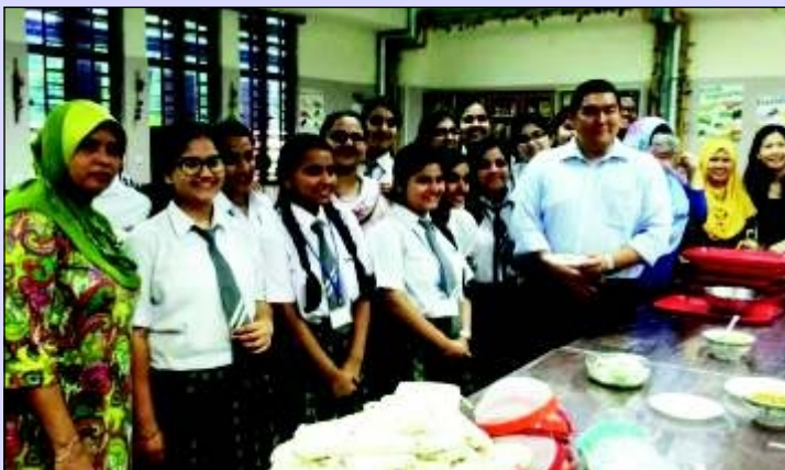
Our students with host parents and the Principal of Pioneer Secondary School, Singapore.