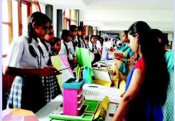
Our students unveiling the wonderful intricacies of Mathematics.

The knowledge of mathematics and science is almost innate in us. The mathematical and scientific worlds are extraordinary places and it's worth spending time there. To be able to say this with evidence and experience, a Maths and Science Exhibition was held by the students and teachers of our school. Model displays were used to lucidly describe various phenomena. Experiments were conducted to explain many others. The bravado around some existing realities were given a scientific angle by the students and the mathematical importance of everything present on the earth's surface was also explained. Science and mathematics run parallel to our lives and we need to have an understanding of their rudimentary forms and basic structure in order to truly appreciate the beauty of life.