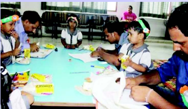
Where craft meets nationalism.