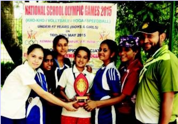
Bringing laurels to the school - our young achievers.

Keeping in mind that every strike brings one closer to the home run, our school sent its representatives to the National School Olympic Games 2015, a U-16 championship which took place from 15-17 May 2015. The venue for it was Mickey House, Kidwai Nagar, Kanpur, U.P. The event witnessed some amazing performances in speedball and yoga by our very own young talents. Those who stood out and added another feather to the school's cap were: