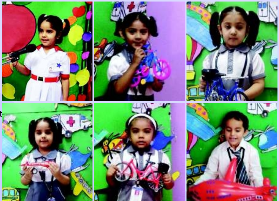
The young ones absorbing academic knowledge in a Show and Tell Activity.

Definitions and theories do not encompass the entirety of what the world has to offer as knowledge. With this spirit in mind, the primary students of our school were engaged in a Show and Tell Activity. They used different props related to vegetables and fruits and spoke a few lines about them in front of their classes. It was the first step towards being a public speaker for our tiny tots. Stuttering and fumbling through the speech, the students paved their way into a new world for themselves after this activity. It was a learning experience for them not only in terms of textbook knowledge but also in building confidence.