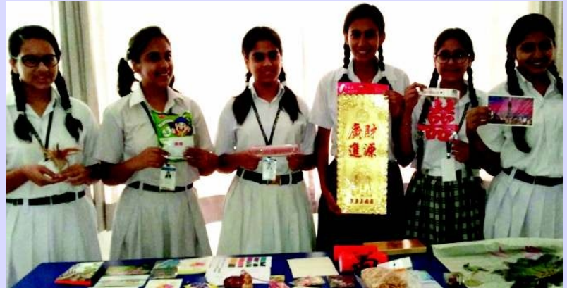
Delving into the depth of knowledge through our international friends.