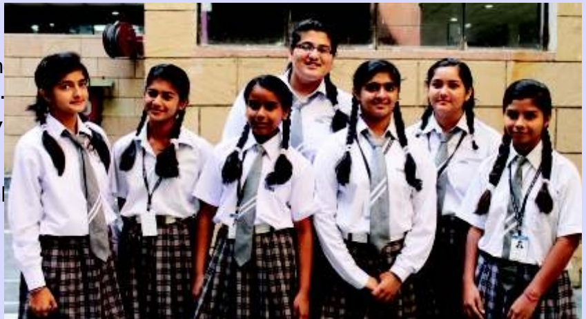
Our students who exhibit true sportsmanship.

"It's not whether you get knocked down; it's whether you get up." — Vince Lombardi The students of our school are instilled with the ideal of perseverance and healthy competition. Thus, whenever there is a match approaching, the students are given a platform to display their great sportsman skills. The Under-16 Basketball Tournament was held at R.D. Rajpal Public School on 4 August 2015. Our zealous participants played in a praiseworthy manner, exhibiting a remarkable sportsmanship. Those who competed, brought a smile to our faces. The participants of the tournament were: