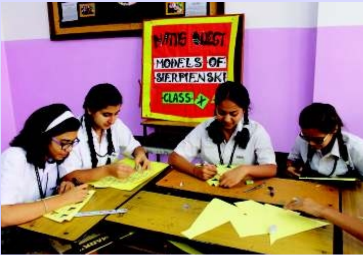
Young Archimedes at work.

We have often heard that mathematics is a fundamental element present in every sphere of life. It is where the true beauty and essence of nature lies. So, to bring out that very aspect in an interesting manner, our teachers to covered various arenas during the Maths Quest. Class VI participated in a 'Coding and Decoding' activity and 'Planning a Birthday Party' thereby understanding the concept of planning and getting to know the tiniest details of finances required in such planning. Class VII did model making on various given topics. Class VIII did a scaling activity wherein they were made to fit the basketball and football grounds on an A4 size sheet choosing an appropriate scale factor. Class IX made models on mathematical grounds using mathematical shapes, designs and patterns. Class X made models of Sierpinski triangle whereas Class XI gave interesting and informative lectures on Mathematics behind the Digital world. The connection of mathematics and modern technology was the highlight of the lecture and class XII participated in a quiz on Boolean Algebra. The entire event provided a rich and enjoyable learning experience to the students.