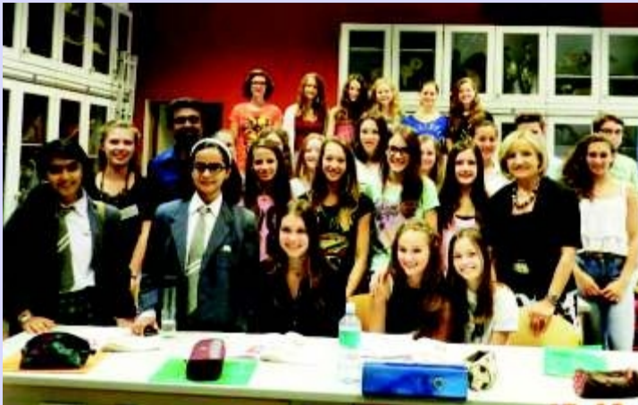
Our students savouring the joy derived from the Art of Learning.