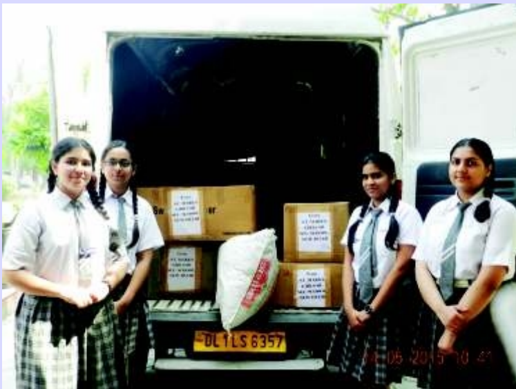
Attempting to provide some aid and support to the Nepal victims through relief funds.

At this time, Nepal was given help from all over the world. Our school also joined hands with Goonj in this philanthropic act. The students were sensitized about the need of the hour and teachers as well as students donated cash and kind generously for the cause.