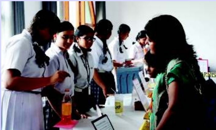
Unravelling the beauty of Science.