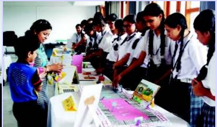
A display of scientific acumen by our students.