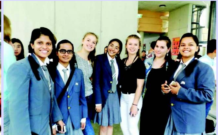
Smiles that overstep geographical boundaries.