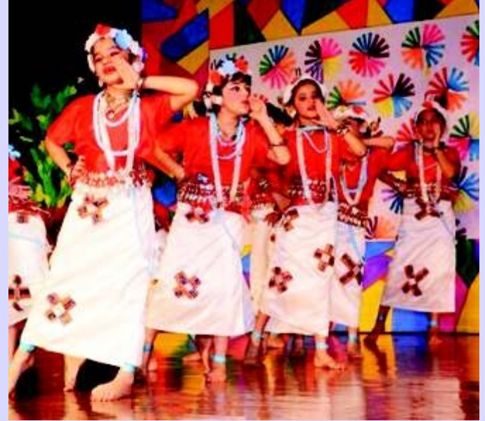
A few glimpses of Indian folk dances presented by our young dancers.