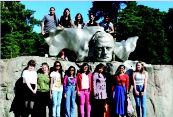
Getting acquainted with Finnish history, culture and traditions through city tours.