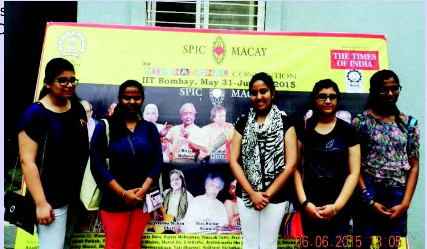
Our ecstatic students on a visit to IIT Bombay on a Spic Macay Convention.