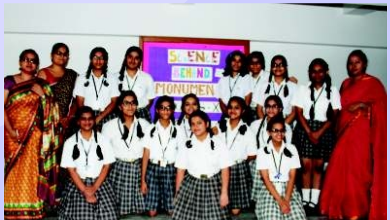
The diligent participants of the PPT activity on the topic 'Science behind Various Monuments'.