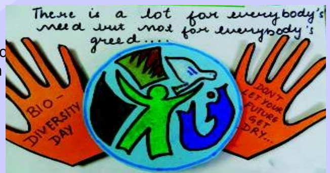
Little realizations, big changes.

Our school well understands the importance of the students to connect with their environment and therefore on the occasion of World Biodiversity Day, a Poster Making activity was organized for classes X and XI. The posters made by the students spread awareness about "Diversity for Sustainable Development". With this activity, the students could not only understand the significance of a connection on an individual level with the environment, but were also able to establish it.