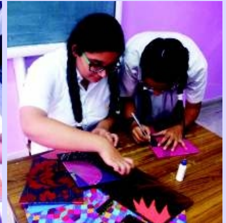
The stake holders of Protsahan Enterprises making things of waste.