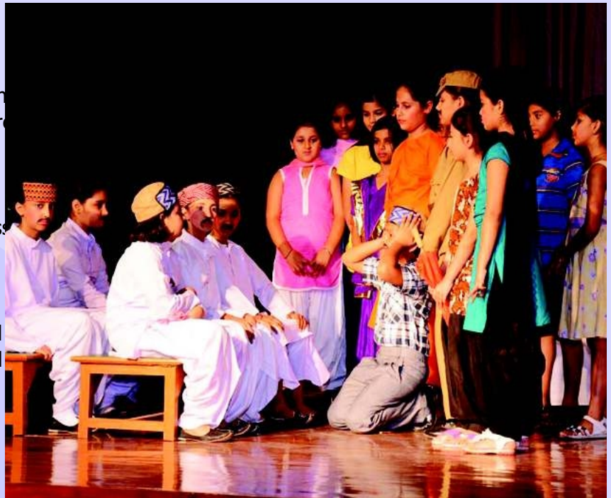
A play in progress.

They say, "Theatre gives you wings as an actor." The stage of our school witnessed many such winged actors of classes III, IV and V during an Inter-Class Play event held in the month of August. The class III plays were as follows - III A-Peter Pan, III B - Malgudi Days, III C- The Jungle Book, III D- Hansel and Gretel, III E- Jack and the Beanstalk and III F- The Wizard of Oz. The little girls of class IV presented before the audience a potpourri of plays ranging from folk tale, 'Ali Baba and the Forty Thieves' to fractured fairy tale, 'Beauty and the Beast'. Plays like 'The Wizard of Oz' and 'The Enchanted Wood' transported us to a fantastic world whereas the selfless love of the swallow in 'The Happy Prince' melted the hearts. Finally, the audience landed into the animal world in the play 'Charlotte's Web'. The students of class V enchanted the audience with plays like- The