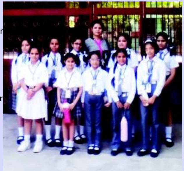
Our young samaritans out to lend a helping hand.

Very rightly said and these words were brought to live demonstration as the students of our school of classes III, IV and V collected "ek muthi anaaj" (grains, potato and onions) and went to AKHIL BHARTIYA NETRAHIN SANGH - a Residential School and Training Centre for the Blind at Raghubir Nagar to donate the things collected. The students were taken around the school where they saw Braille books and how the students used them for reading. They visited their Computer Room where training was imparted by a talking software - JAWS. The students sang beautifully to entertain their hosts. Compassion and Kindness were the key words for the students who learnt how to empathize and extend a helping hand to the needy.