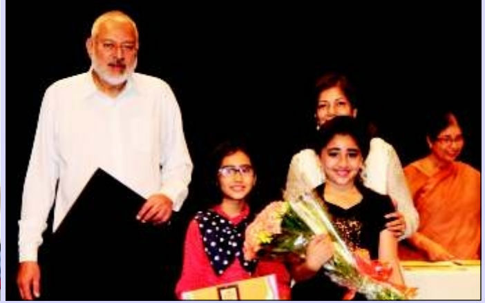
Vasant Valley - Our proud theatrical prodigies. Our young achievers being acknowledged for their talent.