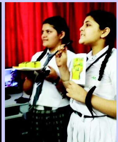
In conversation with Argentines.