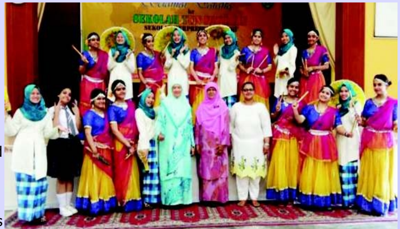
Our students after presenting our cultural richness through a mesmerizing dance.

The students of our school visited Singapore and Malaysia as a part of a student home stay programme from 31 March to 9 April 2015. The purpose of the visit was to get an in-depth knowledge about the culture and lifestyle of Malay and Singaporean students. Our students performed a Gujarati dance for their hosts and gave a presentation showcasing the history and objectives of our school. In Malaysia, they visited the capital city Kuala Lumpur along with Melacca and Johor Bahru. Moreover, they visited various places in Singapore including Universal Studios, China town,etc. The students visited four schools : Sekolah Menengah Sains Muzaffar Syah in Melacca, Sekolah Tun Fatimah in Johor Bahru, Pioneer Secondary School and Nanyang Girls High School in Singapore. Overall, it was a great learning experience for the students and gave them an opportunity to enhance their knowledge about the cultures and lifestyle of their Singaporean and Malaysian counterparts.