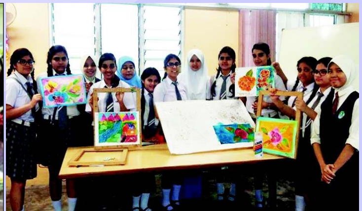
Learning attained with enjoyment - our students gaining a beautiful experience.