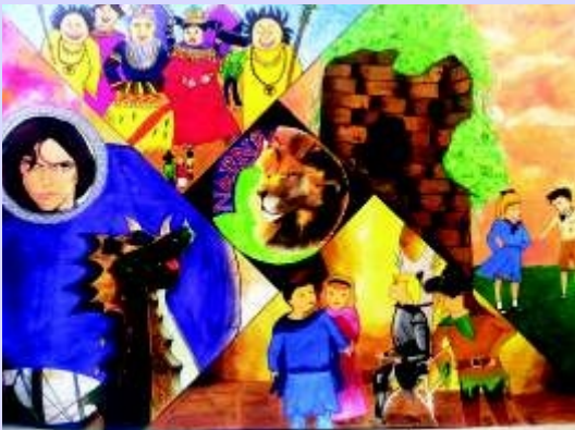
The breathtaking mural that brings Narnia to life.