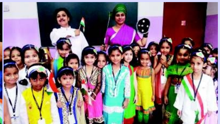
Our freedom fighters standing tall.