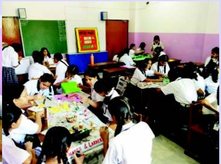
When students bring mathematics to life.