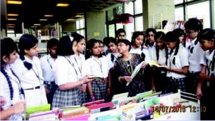
A French enlightenment.

In our pursuit to fully acquaint our students with the Ps and Qs of the French language and to provide them an enriched global outlook, various out of the box methods are adopted. A visit was organised for the students of classes IX and X to Alliance Française de Delhi. It was a part of an endeavour to honour France on its National Day i.e. the 14 of July. The educational trip began with our learners witnessing a French film. It was followed by a quiz on the same. They also marvelled at the well-stocked library of Alliance with classic pieces of French literature. The day was planned to give our students a good exposure which it did.