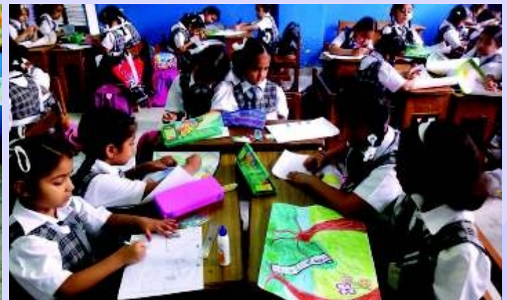
Young enthusiasts at their creative best.

“The earth doesn't belong to us; we belong to the earth.”