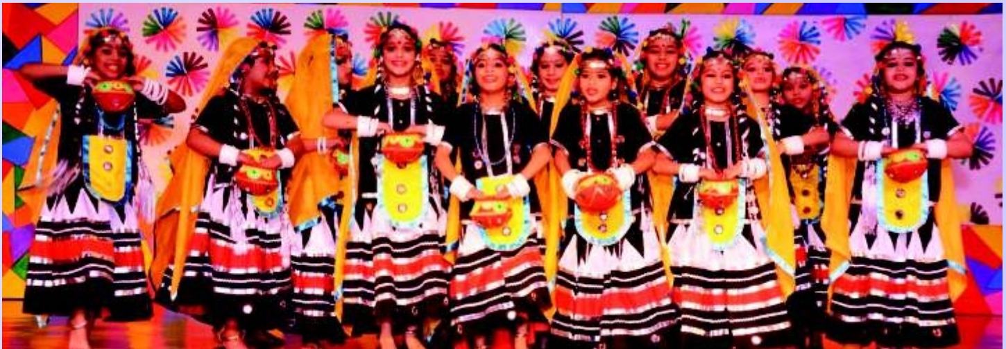
Our tiny tots dancing to the beats of a rhythmic song.

Our school organized an Inter Class Folk Dance Event for Classes I, II and III wherein all the sections performed scintillating Indian folk dances. The astounding décor radiated an ethnic and folk flavour. The children participated solicitously setting the stage on fire. The event was brilliantly anchored. The fun filled extravaganza offered folk dance forms of Kashmir, Assam, West Bengal, Goa, Telangana, Karnataka, etc. The dance event livened up the atmosphere and the participants swayed the audience with their graceful and energetic moves. It was an enriching experience for the children who displayed their dancing abilities.