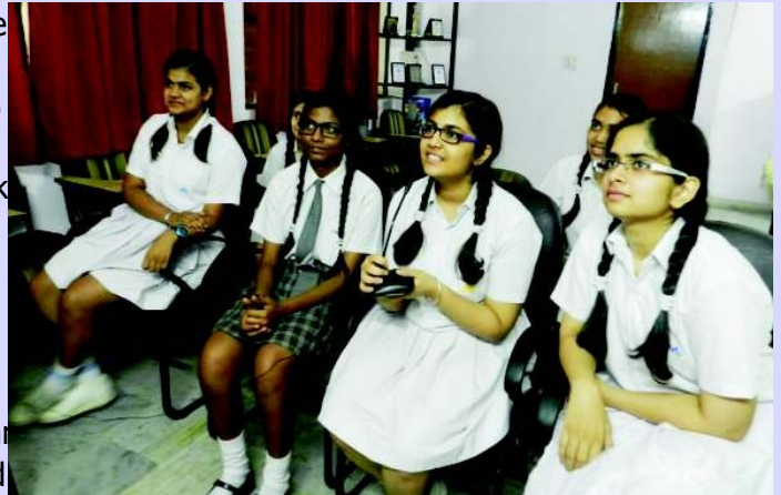
In conversation with their peers across borders.