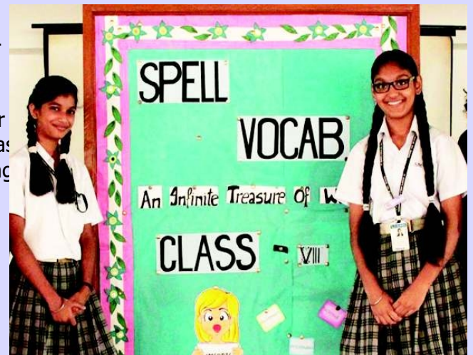
Spell Vocab Challenger's winners from Class 8.

In the words of Albus Dumbledore, "Words are the most inexhaustible source of magic we have-capable of both inflicting pain and healing wounds." In an endeavour to encourage its students to further enrich their vocabulary, our school conducted a Spell Vocab Quiz for the students of classes VI to X. Through various interesting as well as challenging rounds, the vocabulary of the participating students was put to test. The participants as well as the audience thoroughly enjoyed these rounds that tested how proficient they were in the world of words. One notion that was thoroughly embedded in their conscience by the end of the quiz was that a good vocabulary considerably enhances one's power to influence and make a mark in this ever changing world. The winners were as follows: