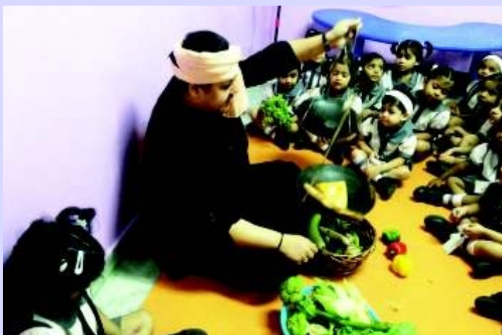
Our young cherubims imbibing knowledge.

To aid teaching through fun, the teachers of Seedling class surprised their kids in the guise of a vegetable vendor. Along with the idea of making education a joyride, the students learnt to identify various vegetables, about their usage and the concept of weight and money. Sometimes, teaching has to be done in an unconventional manner to make the classroom more than a place with a blackboard and chalks. Changing existing paradigms of teaching methods is extremely important to be able to contribute to education. Not all concepts can be memorised, some need to be experienced. Thus, to bring a wave of fresh air, the teachers conducted this activity.