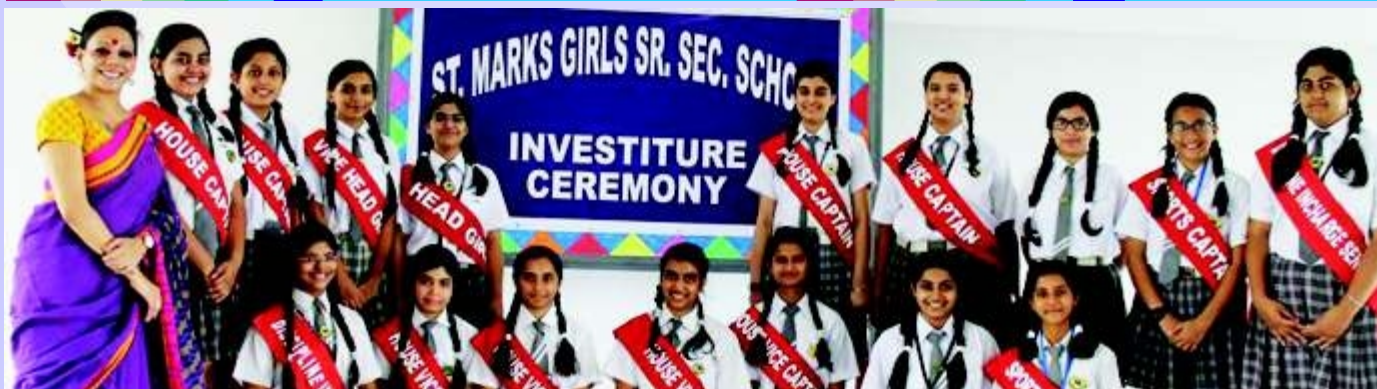
The school conferring responsibilities on our able leaders.

Our school honoured deserving students of the Junior, Sub- Junior and Senior wings in the Investiture Ceremony held in the first week of July. In the hunt for these worthy names, the students were first tested for their leadership skills, mental acuity and confidence via a written round followed by a group discussion. The aspirants gave their views on the ideal school environment and also suggested measures for improving the existing order. The potential leaders from the lot were then declared holders of various prestigious positions and the responsibility of making their alma mater scale new heights was handed over to them.