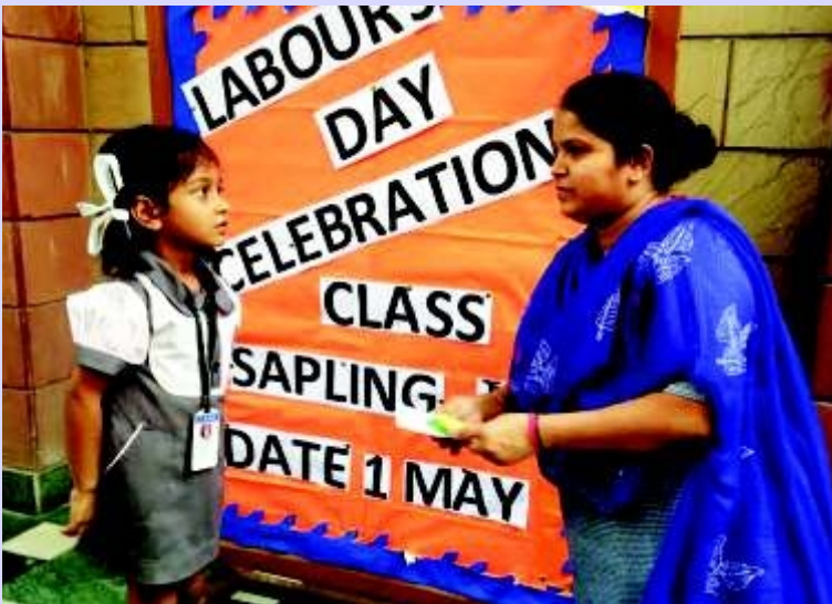
Expressing heartfelt appreciation with love.