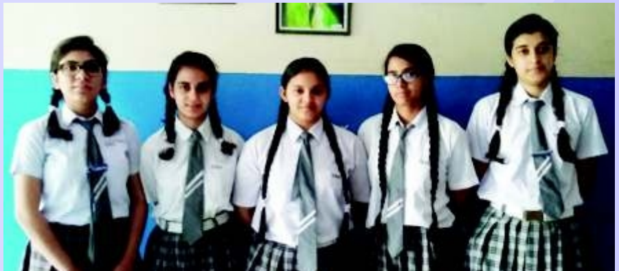
Our talented team of diligent students.