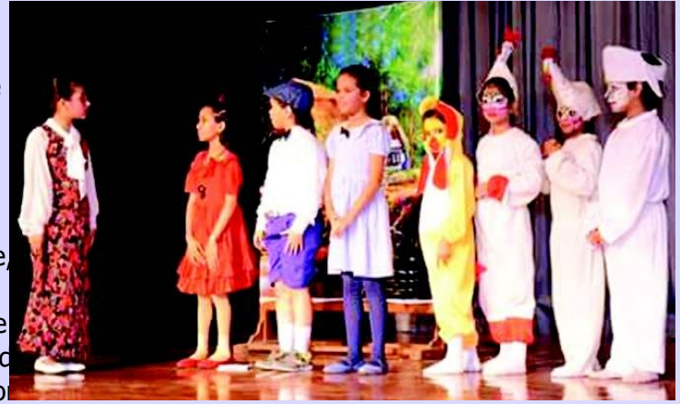
Our amateur artists putting their best foot forward.