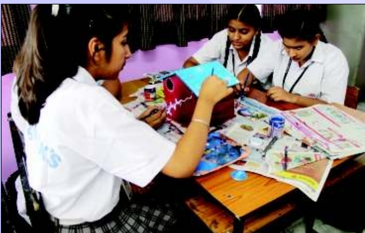
Making an endeavour to help our winged friends.

Every animal needs shelter to save itself from the harsh weather ... As we live in our houses and feel safe, we encouraged students of our school to help those who suffer the most during rainy season, our birds. During heavy rains and thunder most bird nests fall down from trees ... Infants die and eggs are broken. So to help birds save their kids, the students made small bird houses and fixed them on trees in and around the school to provide a steady shelter to them and to develop love and empathy for these beautiful creatures of nature.