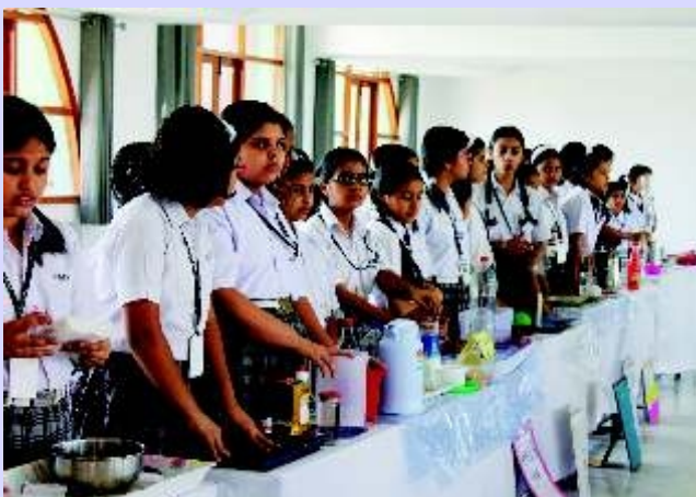
Our fervent students presenting astounding models and experiments.

Imagination is more important than knowledge. Knowledge is limited, imagination encircles the world. To give wings to the imagination of young minds, our school organised its annual event 'Science Quest' from 27th July to 31st July 2015. Different activities were conducted during this five day event. Students of class VI displayed their love for Science through a 'Kids' Lab'. They performed a number of experiments to showcase their understanding of the subject. Students of class VII displayed their photography skills when they clicked pictures of different animals and birds. They also prepared a timeline related to different scientific events. A Symposium on 'Green Chemistry' helped to increase the knowledge of the students of class XI. Students made PowerPoint presentations on Science behind Structures of Monuments. Science Extempore was organised for students of class XII in which various issues related to Science were addressed by the students. Culmination of the Science Quest was through a Science Exhibition where students displayed their imagination and scientific temperament through model displays. Efforts of the students were well appreciated by the parents.