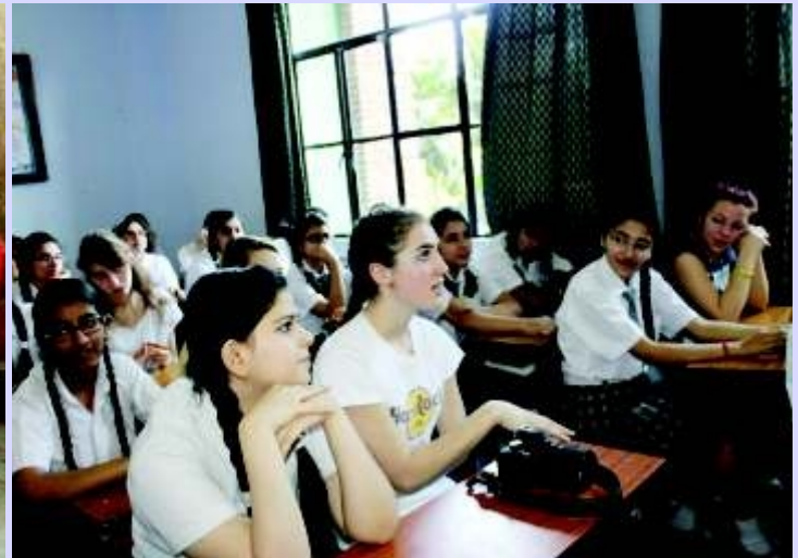
Our student delegates with their peers from Italy. The Italian delegates getting apprised of Indian subjects.