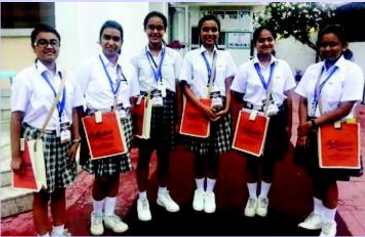
Ready to explore and learn.