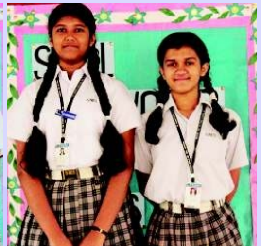
The impressive winners of the Spell Vocab Challenge after a commendable performance.