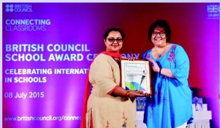
Getting felicitated in international arenas.