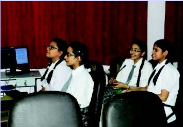
Ebullient class XII students endeavoring the task of learning German language.