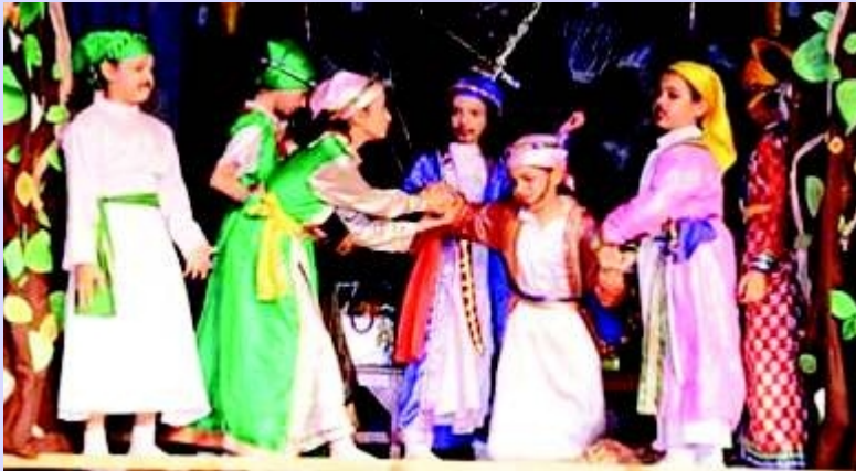
Our young actors mesmerising the audience with captivating performances.