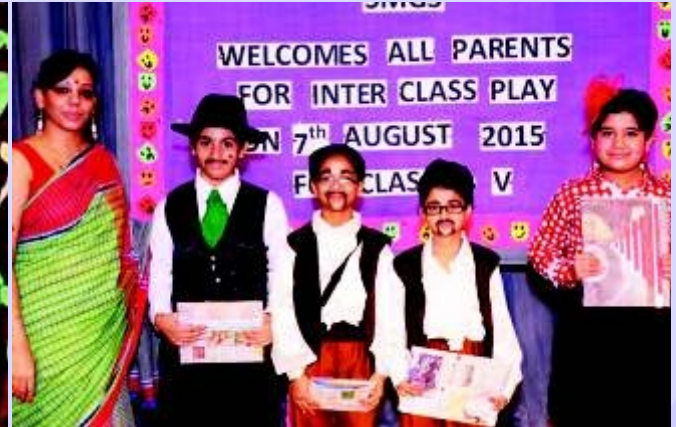
Winners of Inter Class Play.