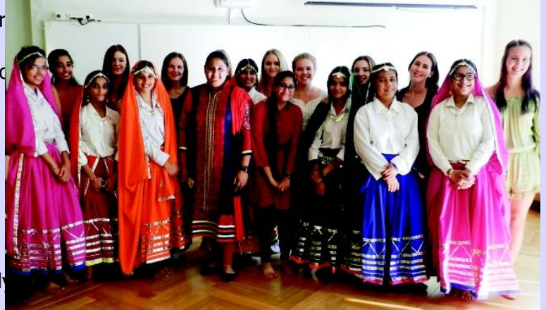
Making friends across boundaries to enhance global understanding.