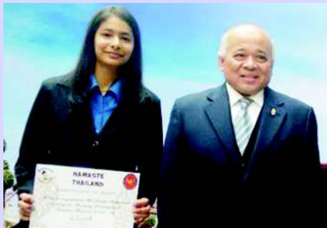
An interesting cultural exchange with the Thais.