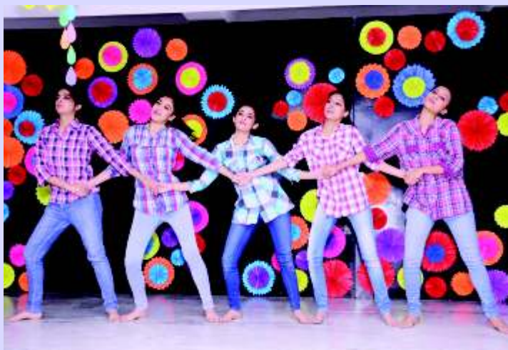
Students of Class XI entertaining their seniors and making the day special for them.