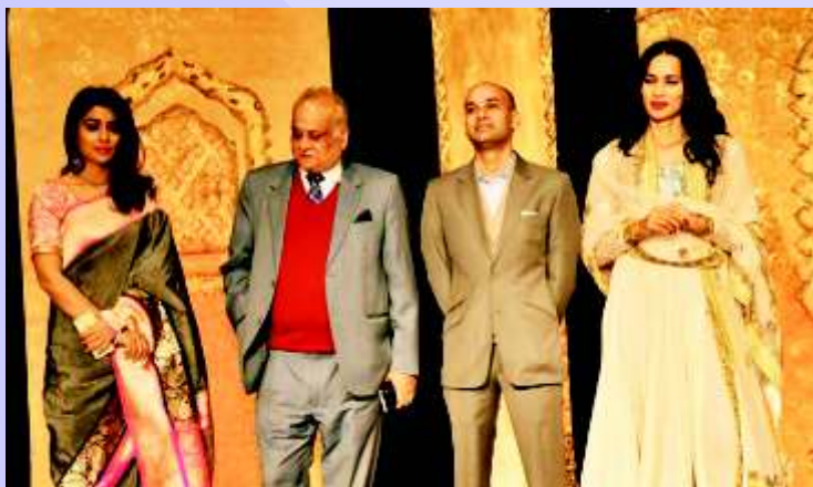
Getting ready to delve into the depths of spirituality at 'Ibaadat 2015'.