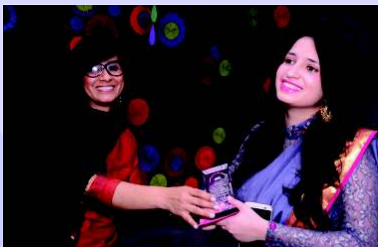
A token of remembrance for the 14 year long journey.