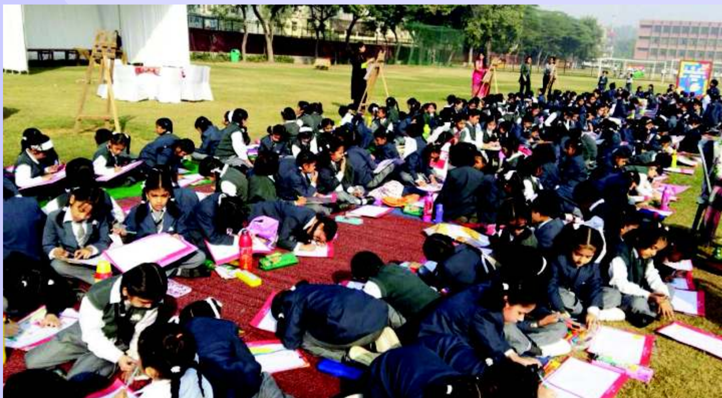
Giving expression to their imagination.

Based on this thought, our school gave an opportunity to the little ones to participate in an event specially designed for bringing out the artist in them. The school organised Rang Mahotsava (Art Event)- both for the students and teachers on 4th December 2015. All the students from classes I to IV were given two topics – "World under water" or "Happiness is..." Their creativity proved to be boundless. Art never expresses anything but itself. It was exhilarating to see the happiness and enthusiasm of the students lost in materializing their imagination and giving it a structure and form on paper. They were able to give wings to their thoughts which uplifted their curious souls to a great extent. The event was thoroughly enjoyed by both the students and the teachers who depicted their emotions brilliantly.